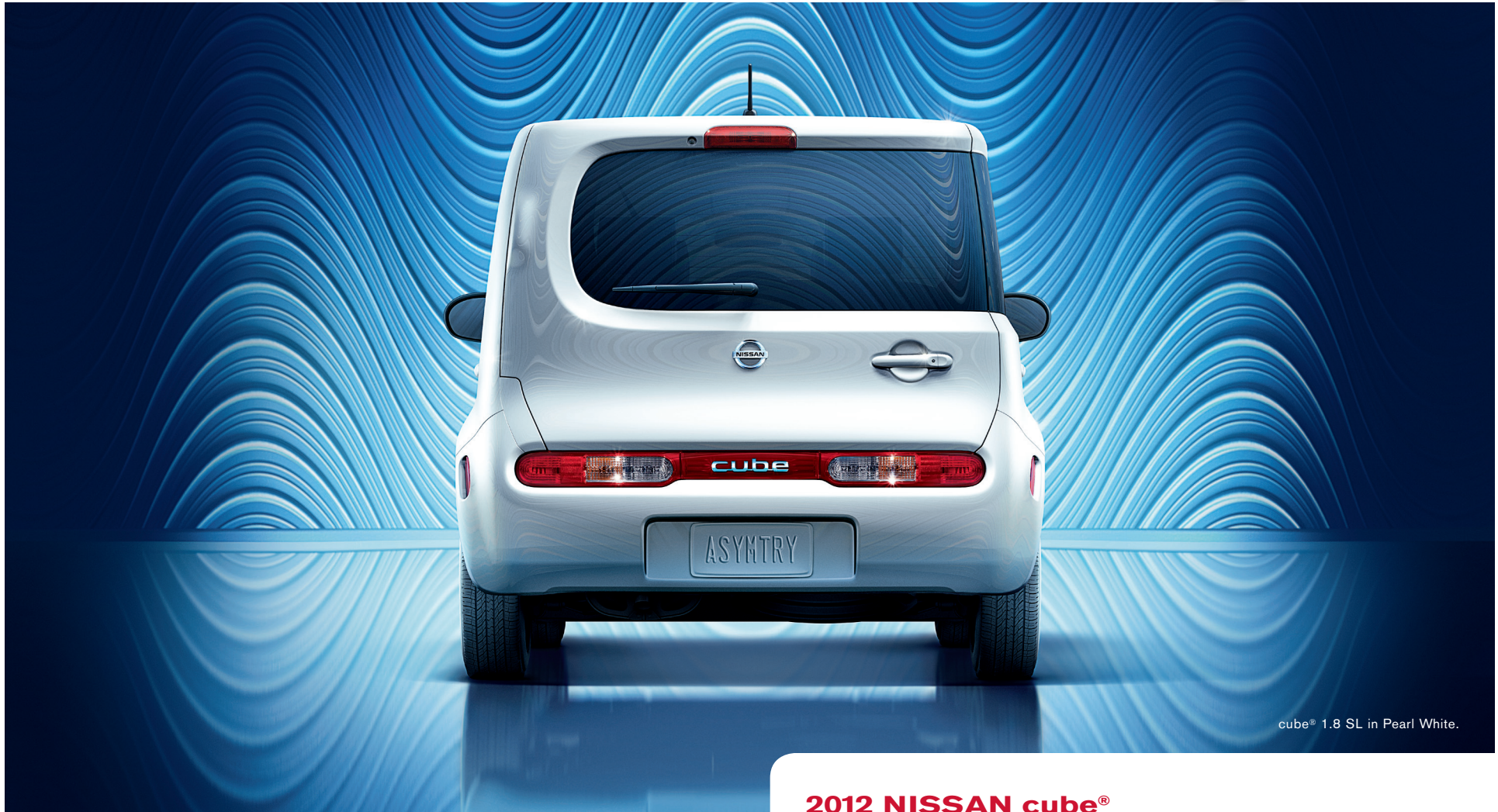
cube® 1.8 SL in Pearl White.