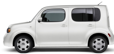
1.8 S: ADD IN EXTRA AMENITIES.