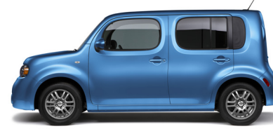
1.8 S: WITH OPTIONAL INDIGO LIMITED EDITION. 1