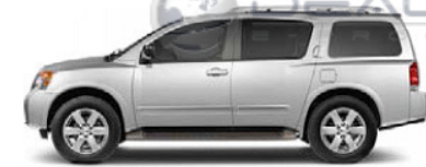
PLATINUM: THE COMPLETE EXPERIENCE