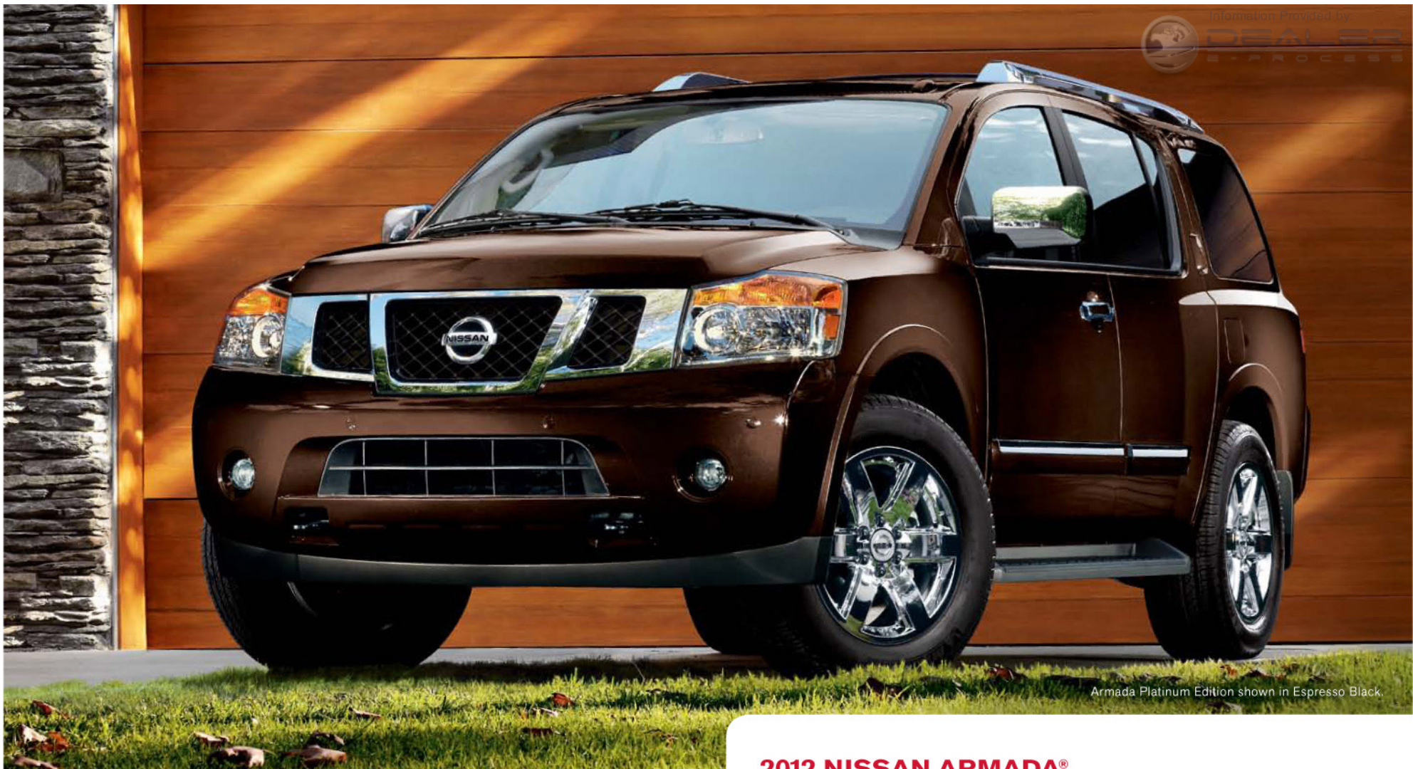
Armada Platinum Edition shown in Espresso Black.