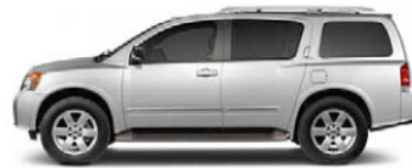
SL: BRING ON THE WORLD