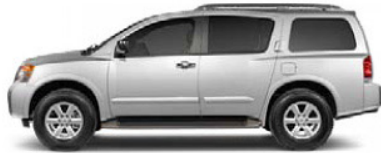
SV: LET THE ADVENTURE BEGIN