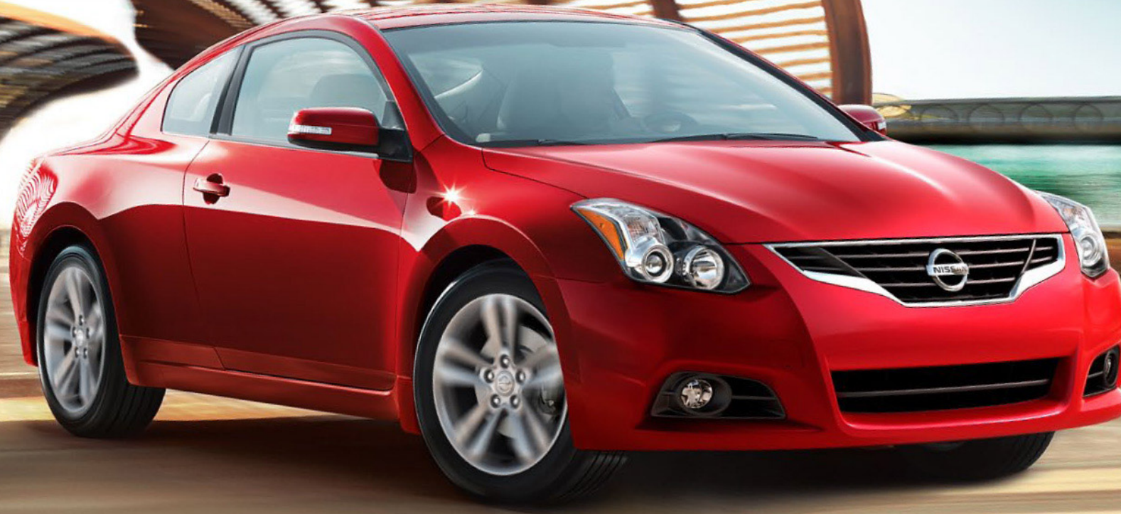
Nissan Altima Coupe 2.5 S shown in Red Alert.