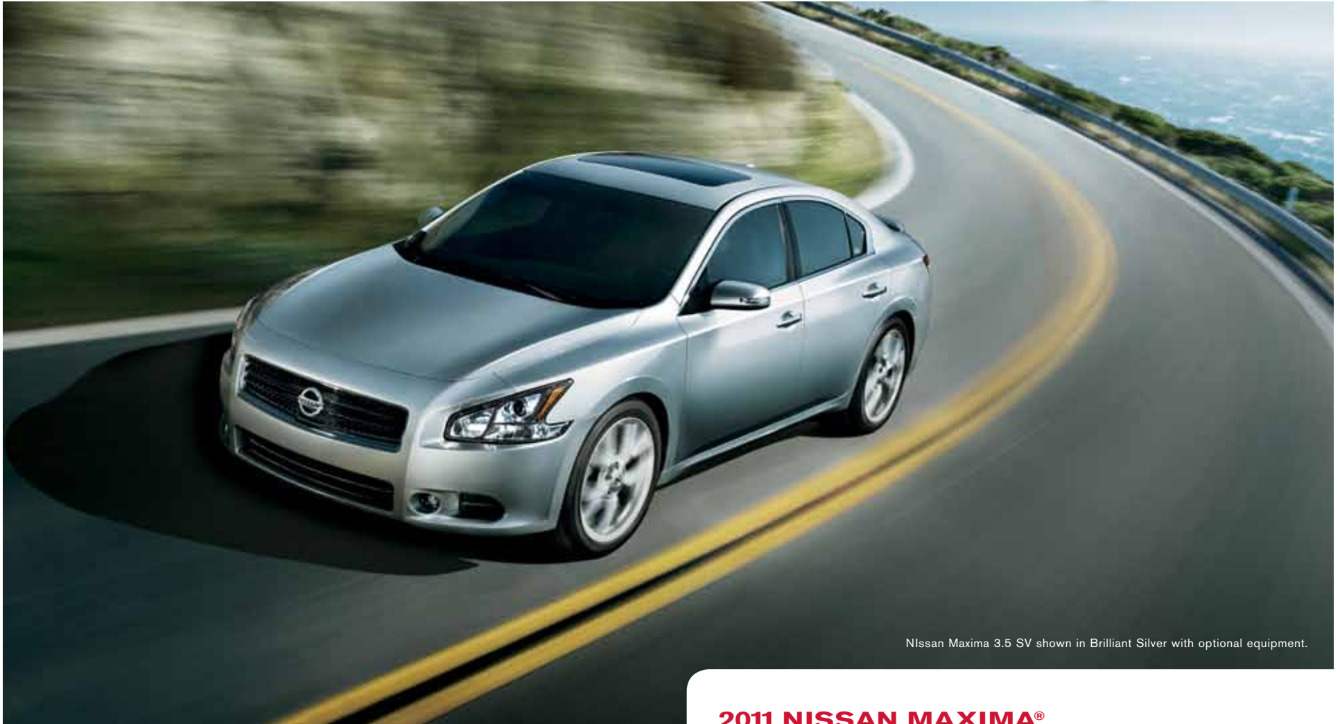
Nissan Maxima 3.5 SV shown in Brilliant Silver with optional equipment.