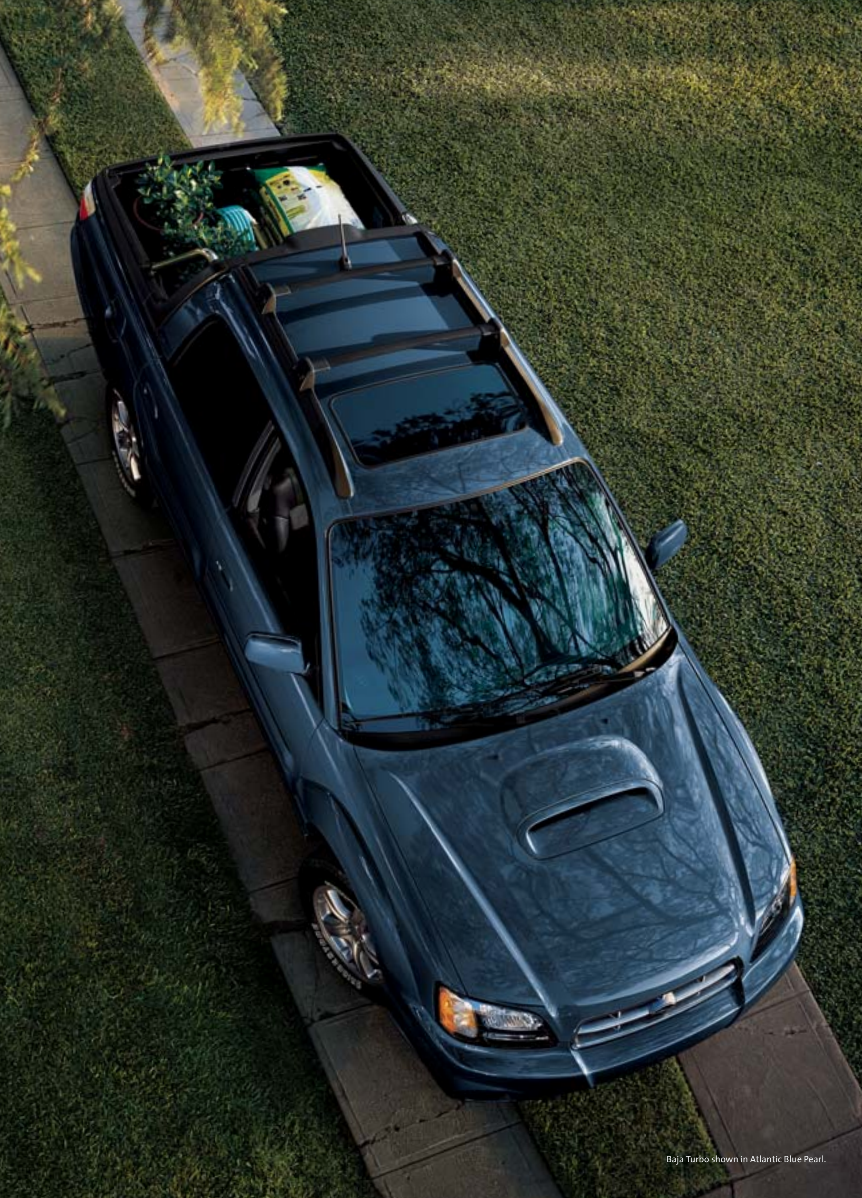
Baja Turbo shown in Atlantic Blue Pearl.