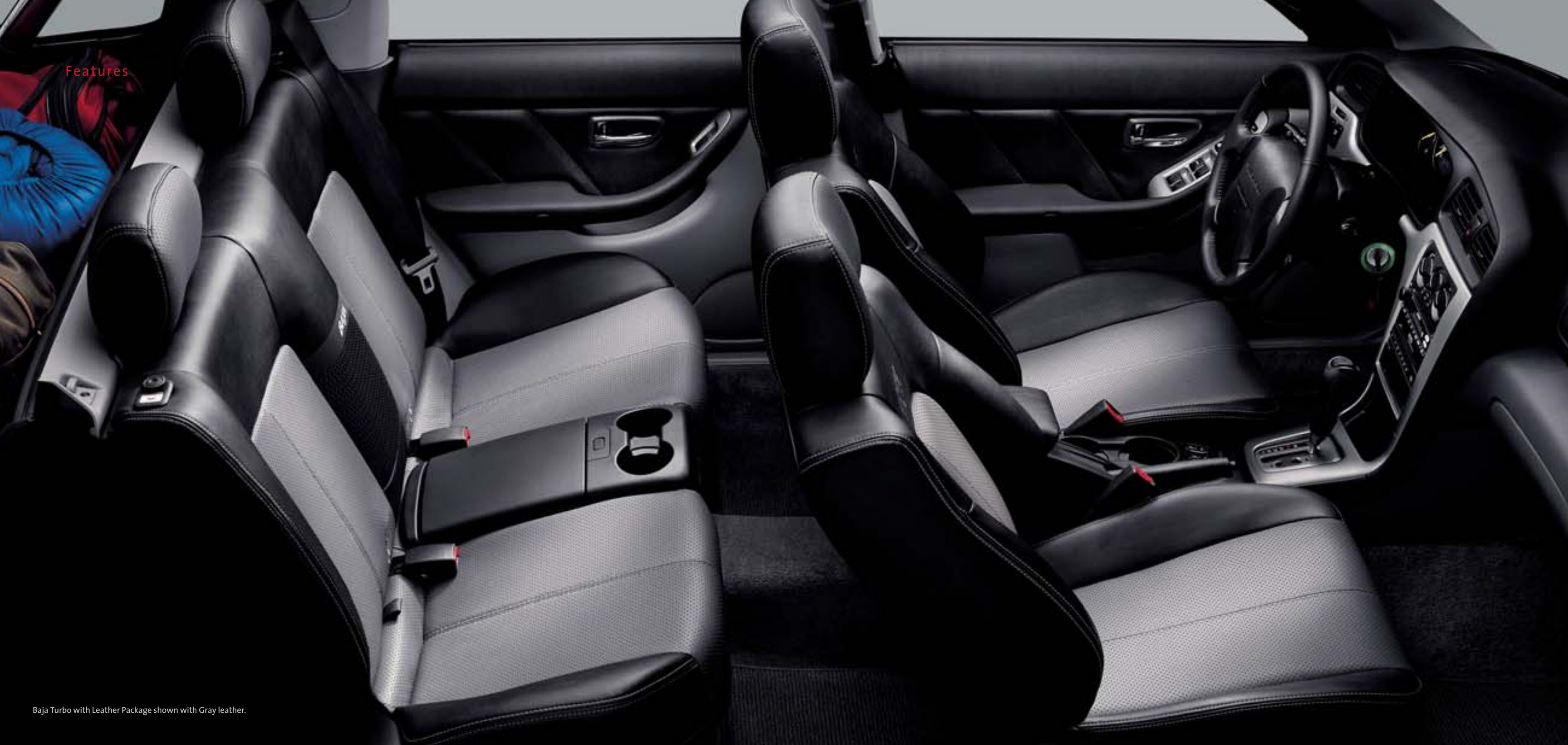
Baja Turbo with Leather Package shown with Gray leather.

Most open-bed vehicles make you sacrifice comfort for versatility. Not so with the Baja. The refined cabin, upholstered in durable cloth, features such amenities as power windows and mirrors, ambient temperature gauge, keyless entry and in-dash CD player. Rear passengers will enjoy the full-size seats, cupholders, a storage bin and individual head restraints. In the Baja, civility doesn't take a back seat to capability.