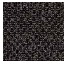
Dark Gray Flat Woven Cloth