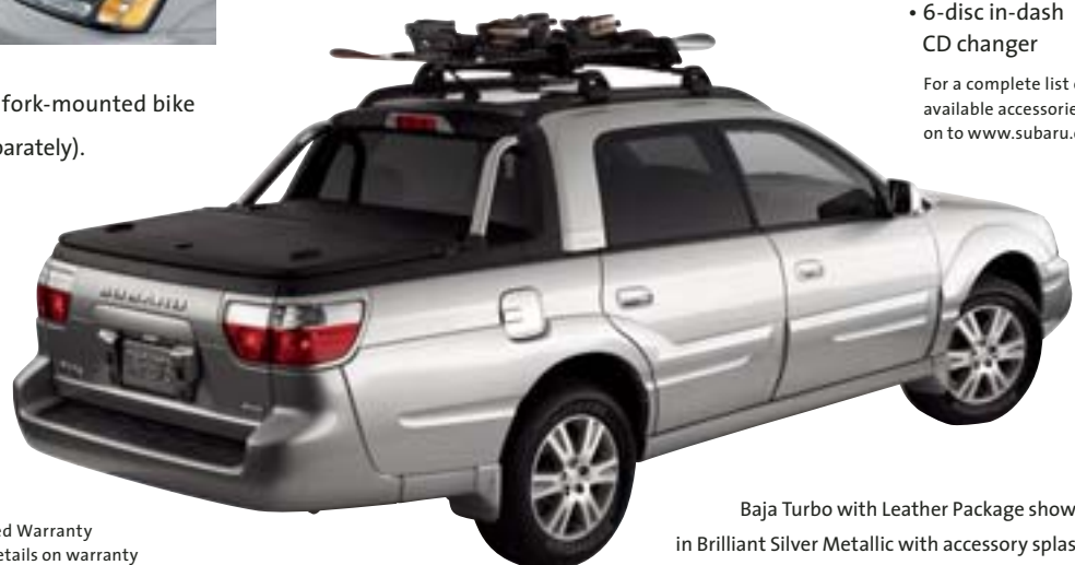
Baja Turbo with Leather Package shown in Brilliant Silver Metallic with accessory splash guards and roof-mounted ski/snowboard attachment.

For a complete list of available accessories, log on to www.subaru.com