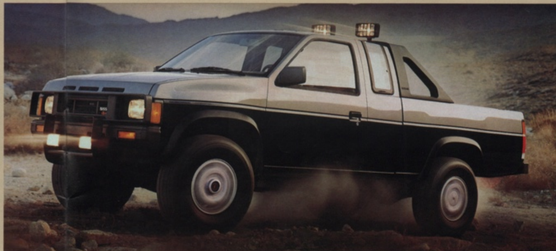
NISSAN SE KING CAB 4x4 ▲