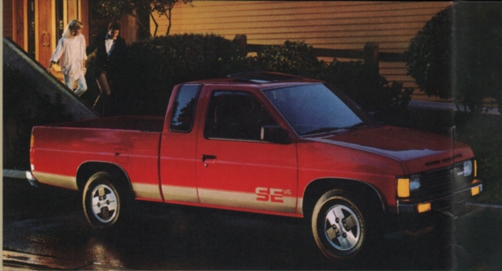
▲ NISSAN SE KING CAB