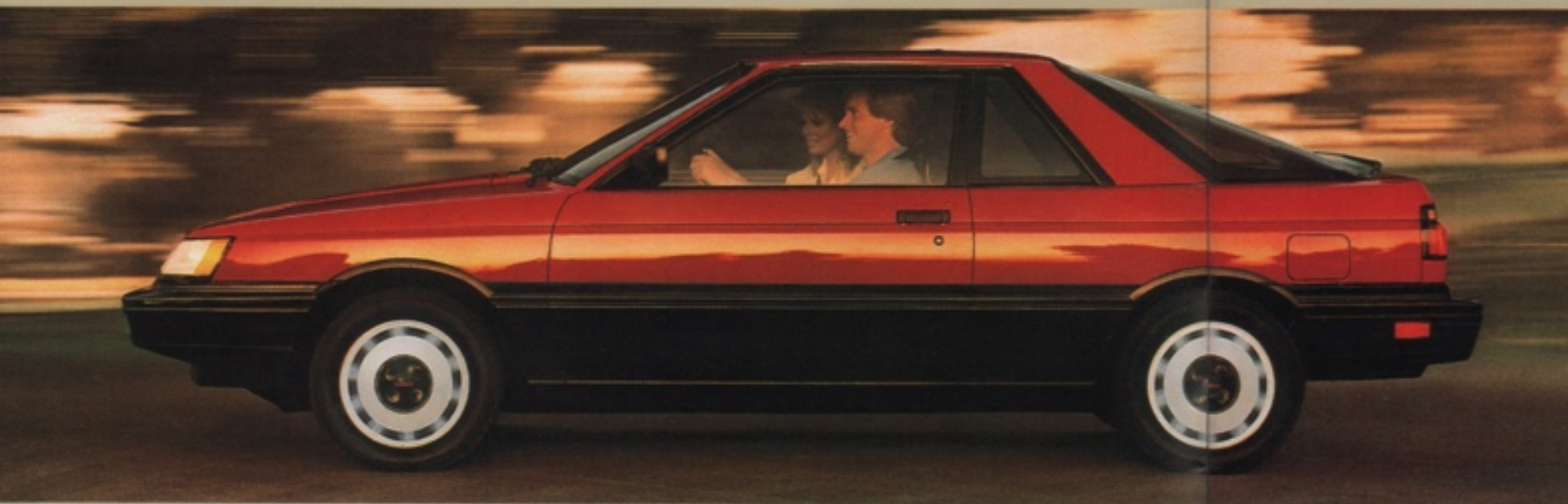
◀ NISSAN SENTRA SE SPORT COUPE