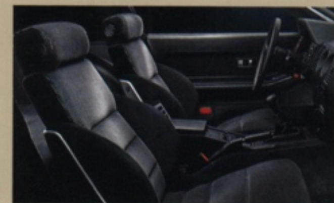
NISSAN 300 ZX INTERIOR ▶