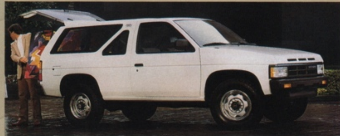
◀ NISSAN PATHFINDER XE