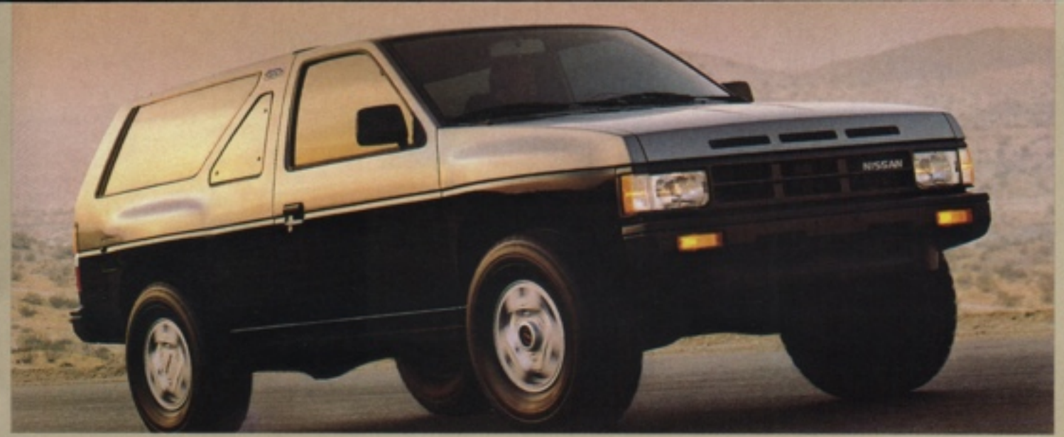
NISSAN ▲ PATHFINDER SE SHOWN WITH SPORT/POWER PACKAGE

Some items shown are optional. See the 1987 Nissan Van brochure for more complete information.