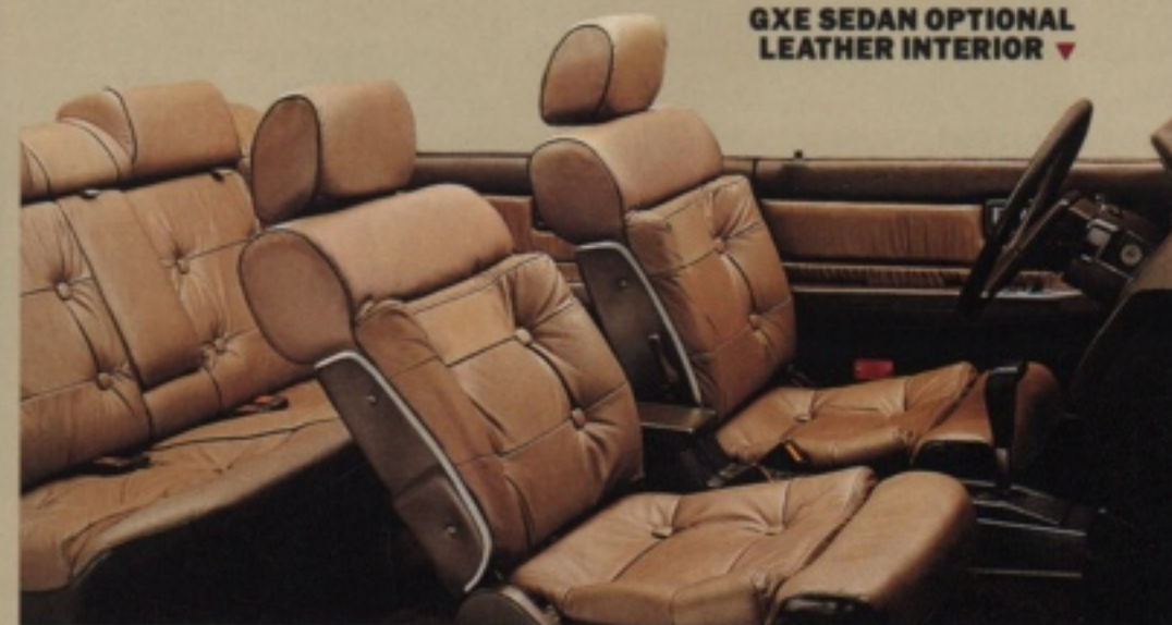
GXE SEDAN OPTIONAL LEATHER INTERIOR ▼