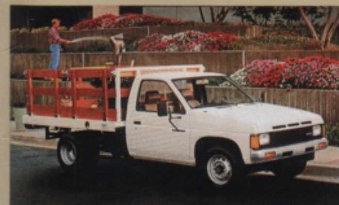
◀ NISSAN CAB & CHASSIS SHOWN WITH WOOD STAKE BED*