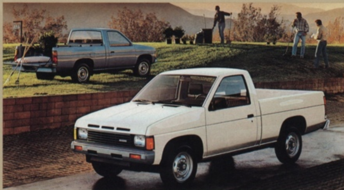
(TOP) NISSAN E REGULAR BED, (BOTTOM) NISSAN STANDARD REGULAR BED ▶