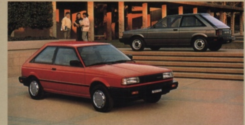
NISSAN SENTRA XE AND SE 3-DOOR HATCHBACK ▼