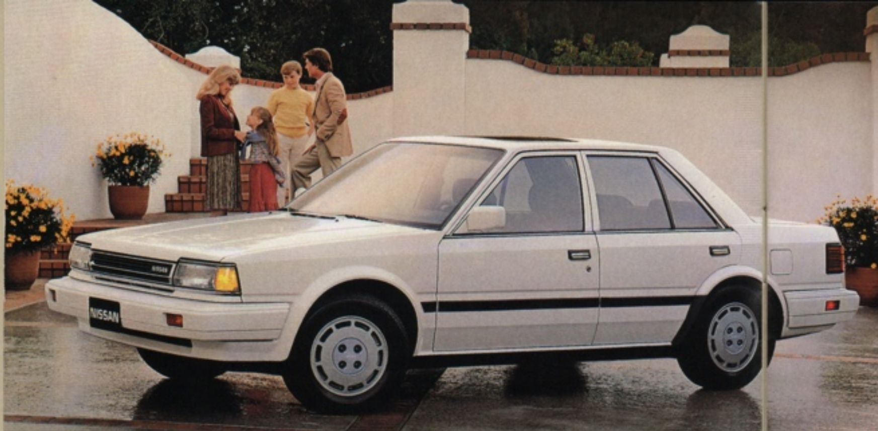
◀ NISSAN STANZA GXE 4-DOOR SEDAN