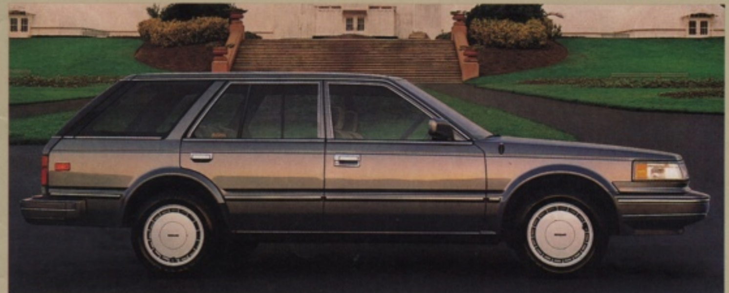
NISSAN MAXIMA GXE WAGON ▼