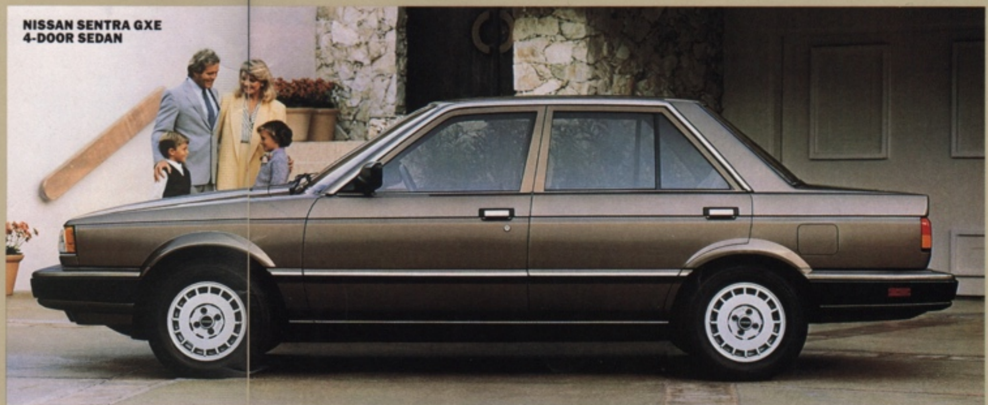
NISSAN SENTRA GXE 4-DOOR SEDAN