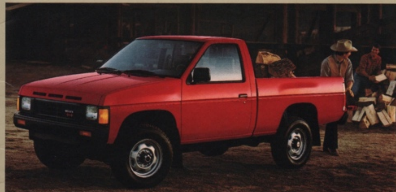
◀ NISSAN E REGULAR BED 4x4