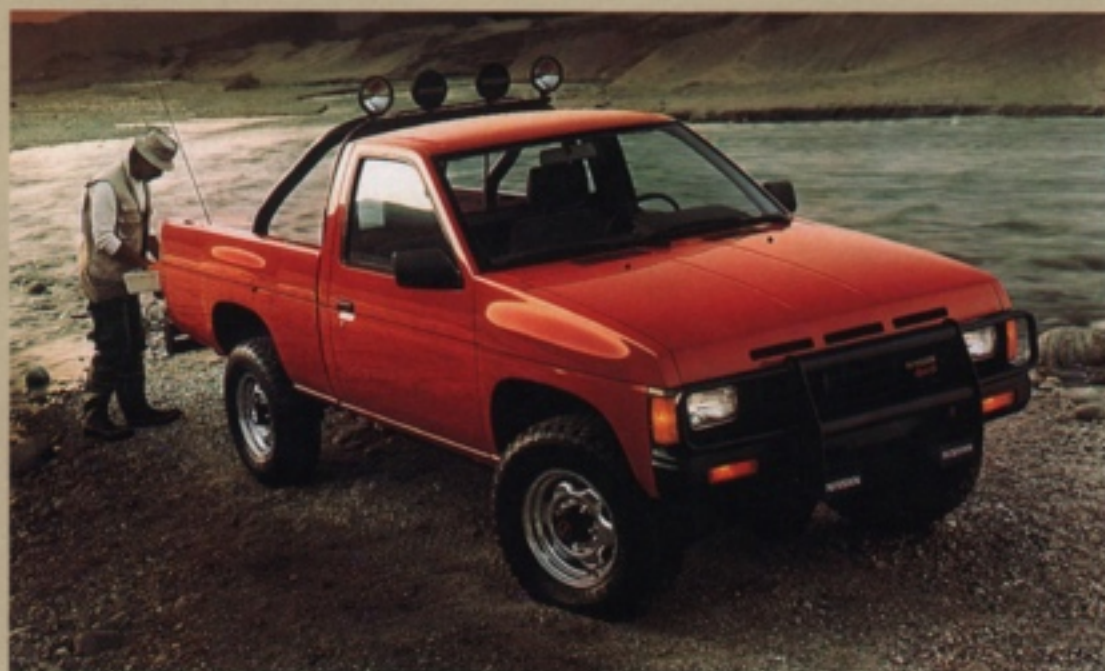
NISSAN SE REGULAR BED 4x4 ▶