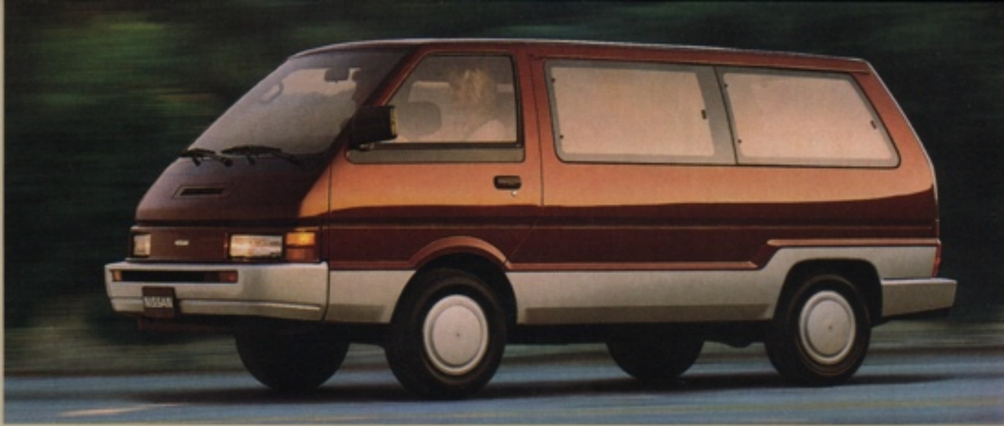
▲ NISSAN VAN WITH GXE OPTION PACKAGE AND OPTIONAL TWO-TONE PAINT