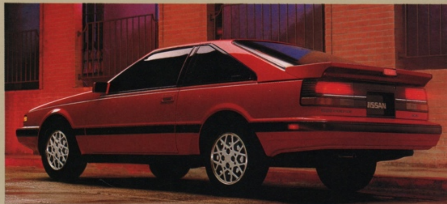
◀ NISSAN 200SX XE HATCHBACK