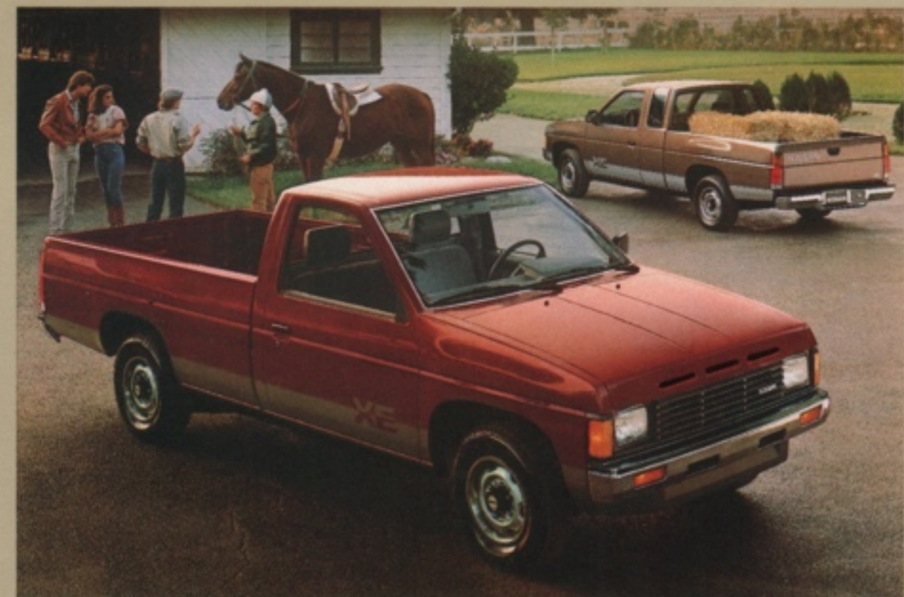
▲ (TOP) NISSAN XE KING CAB, (BOTTOM) NISSAN XE LONG BED