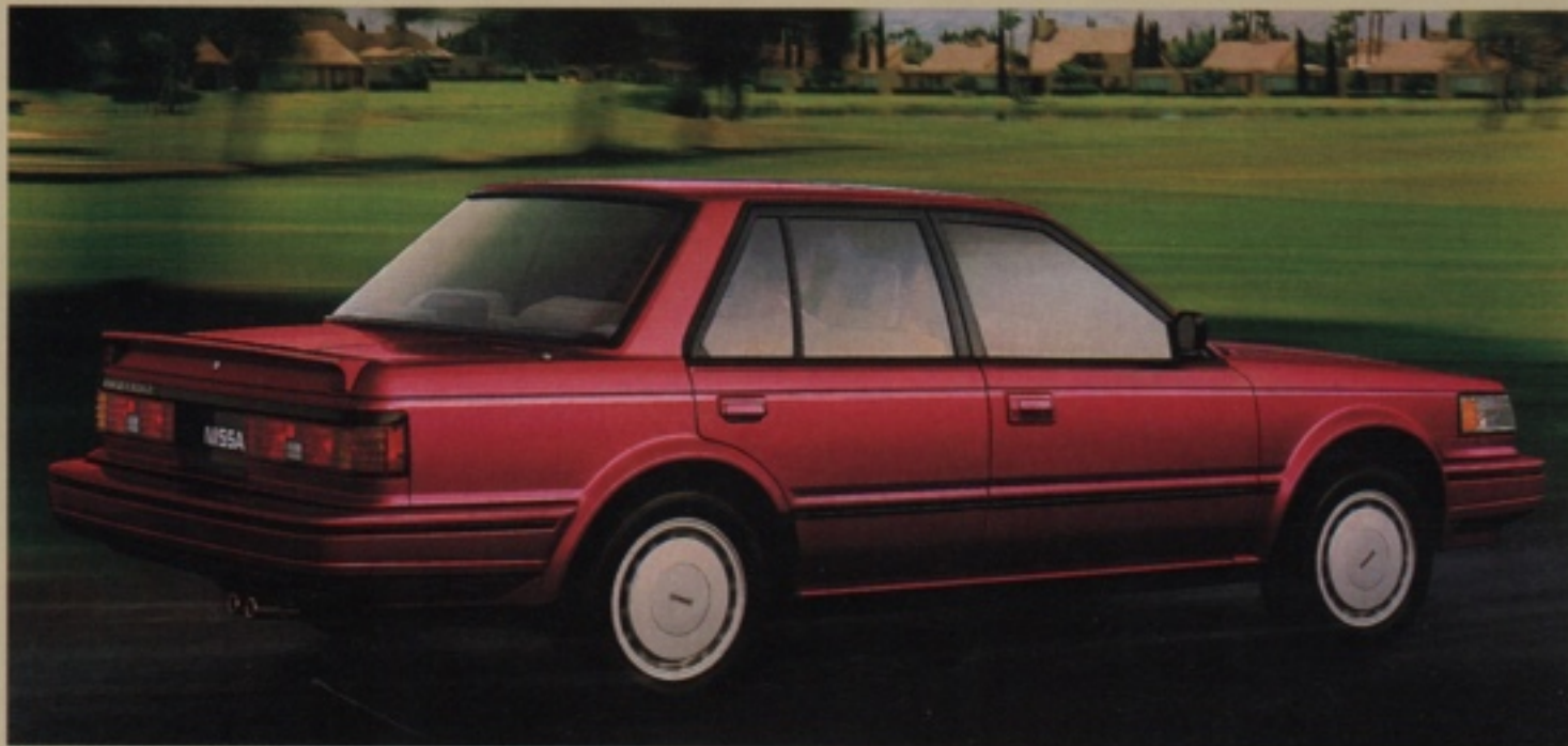
◀ NISSAN MAXIMA SE SEDAN