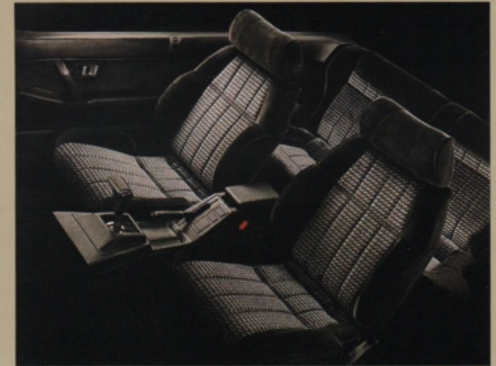
▲ NISSAN 200SX SE INTERIOR