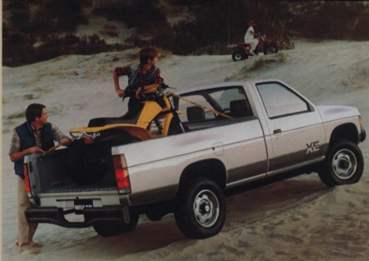
▲ NISSAN XE LONG BED 4x4