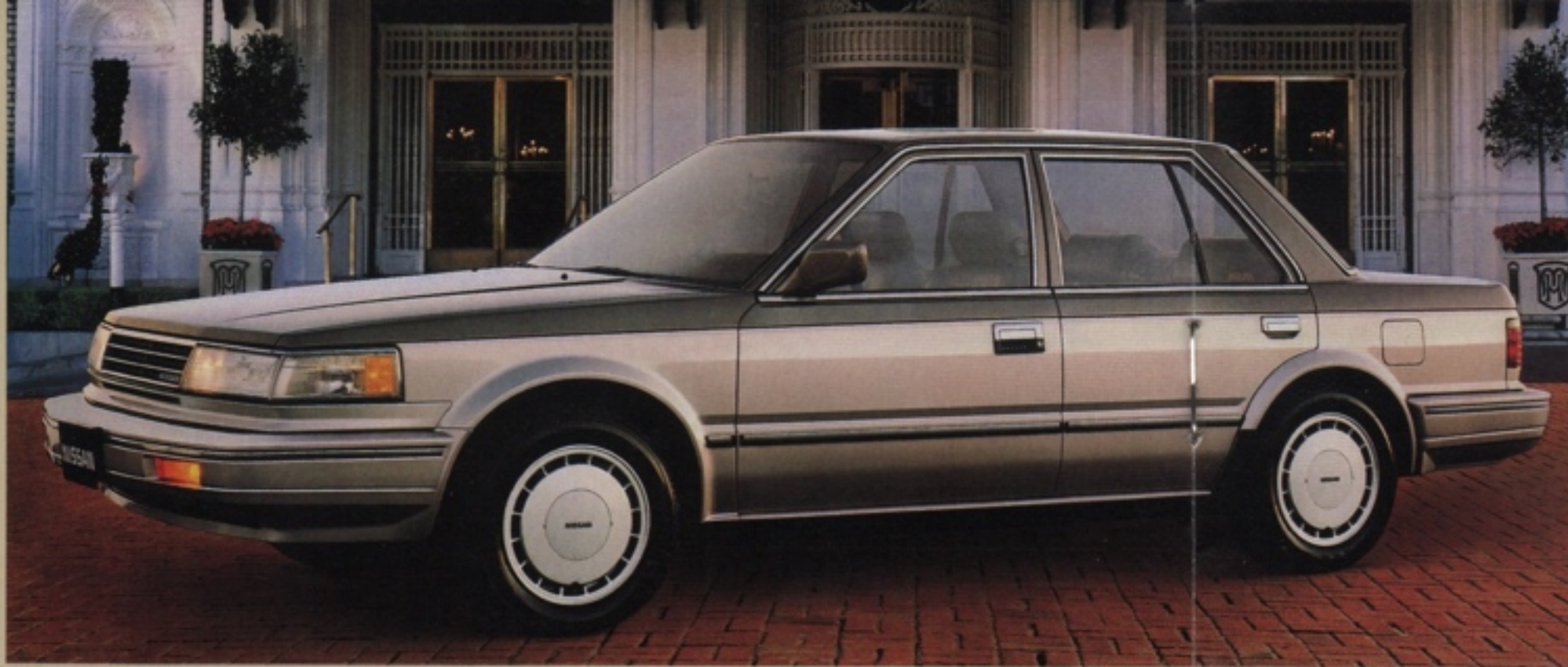
◀ NISSAN MAXIMA GXE SEDAN