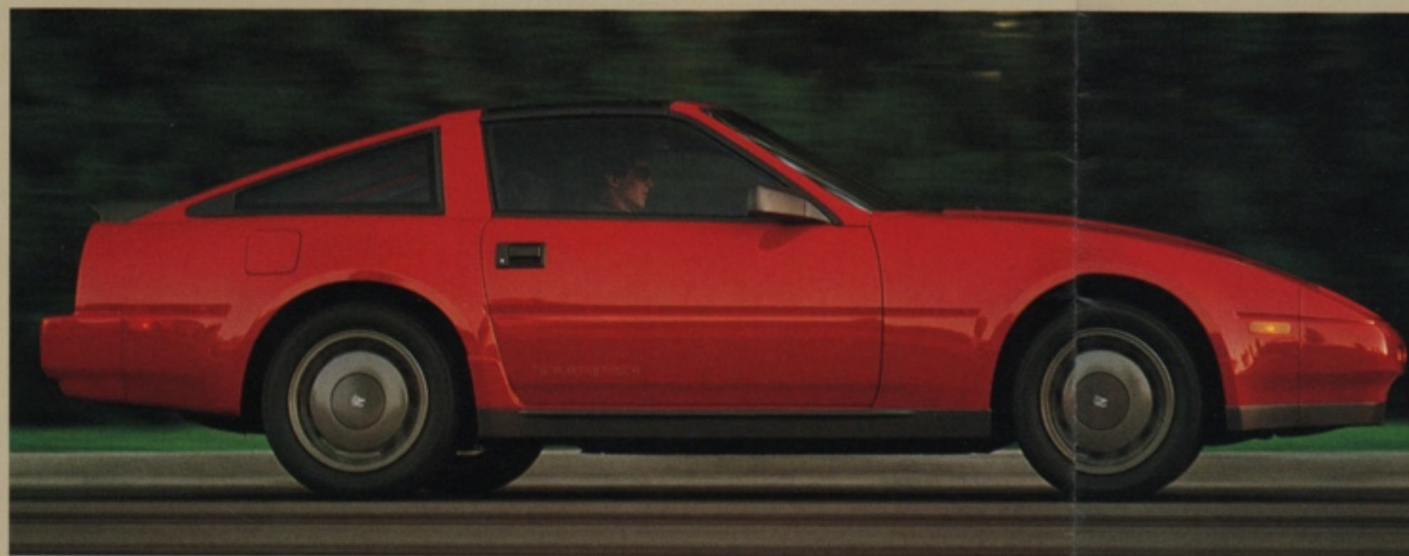
▲ NISSAN 300 ZX 2-SEATER ▲