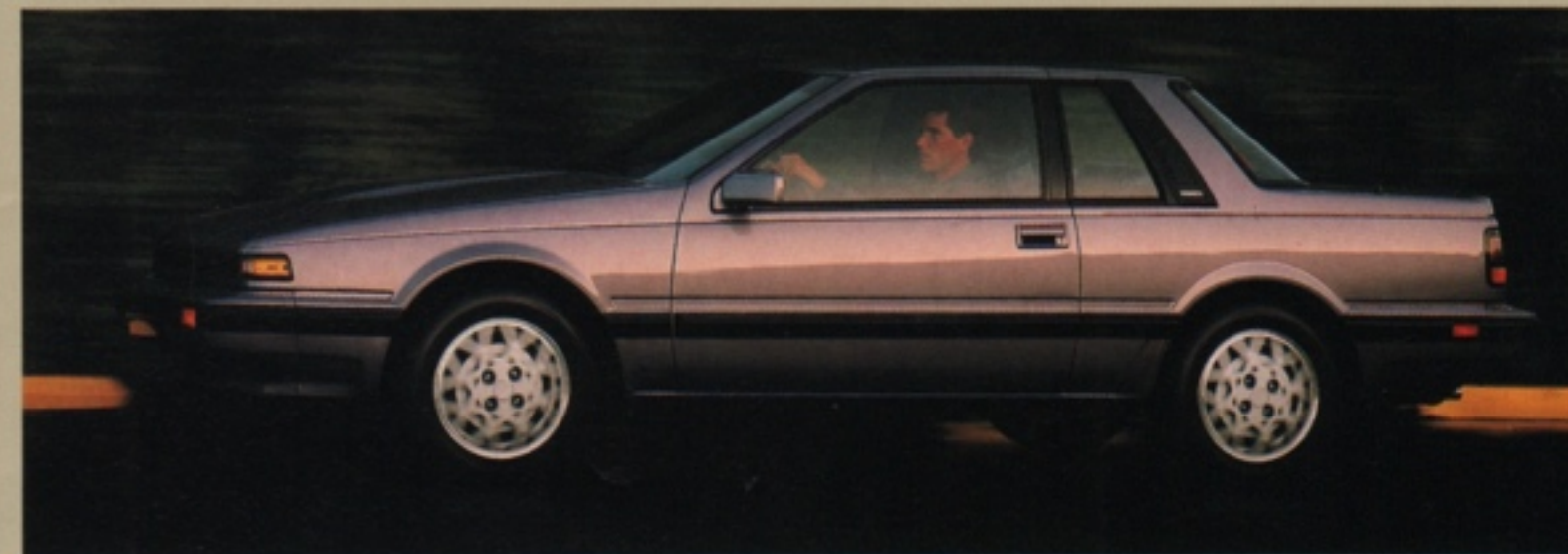
NISSAN 200SX XE NOTCHBACK ▼