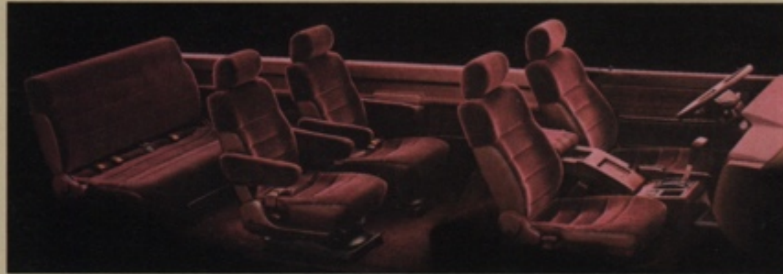
NISSAN VAN INTERIOR SHOWN WITH GXE OPTION PACKAGE ▶