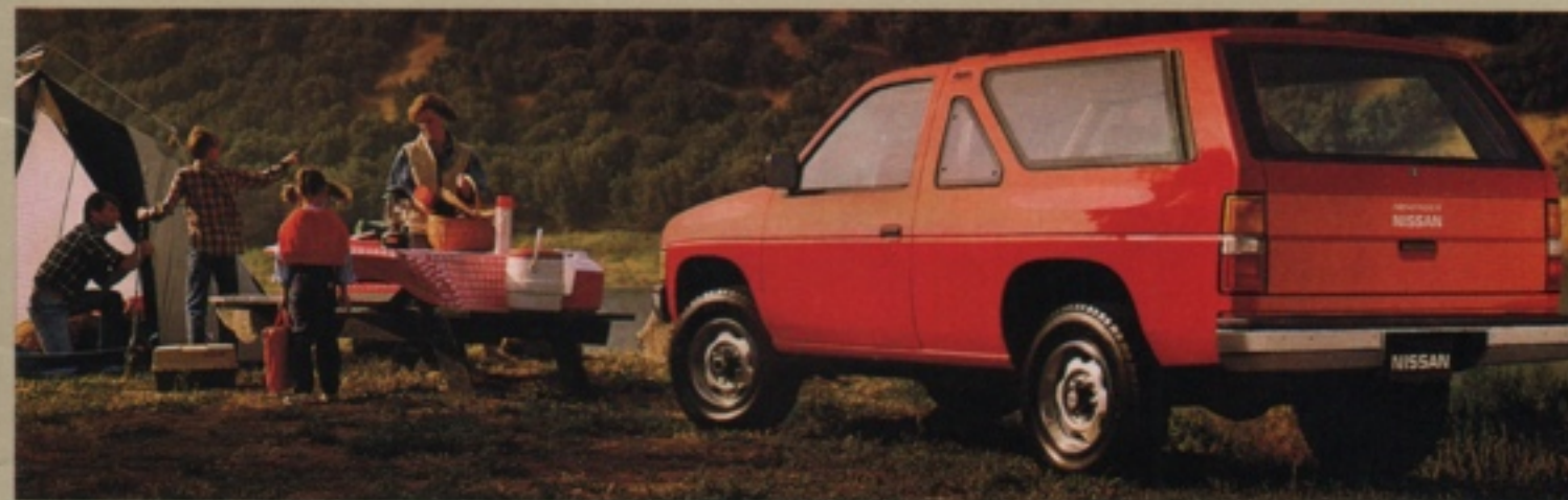
NISSAN PATHFINDER E ▼