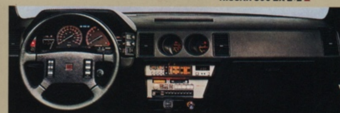
▲ NISSAN 300 ZX ANALOG INSTRUMENT PANEL WITH OPTIONAL ELECTRONIC EQUIPMENT PACKAGE