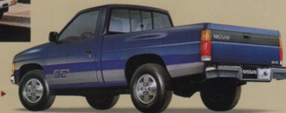
NISSAN SE REGULAR BED ▶