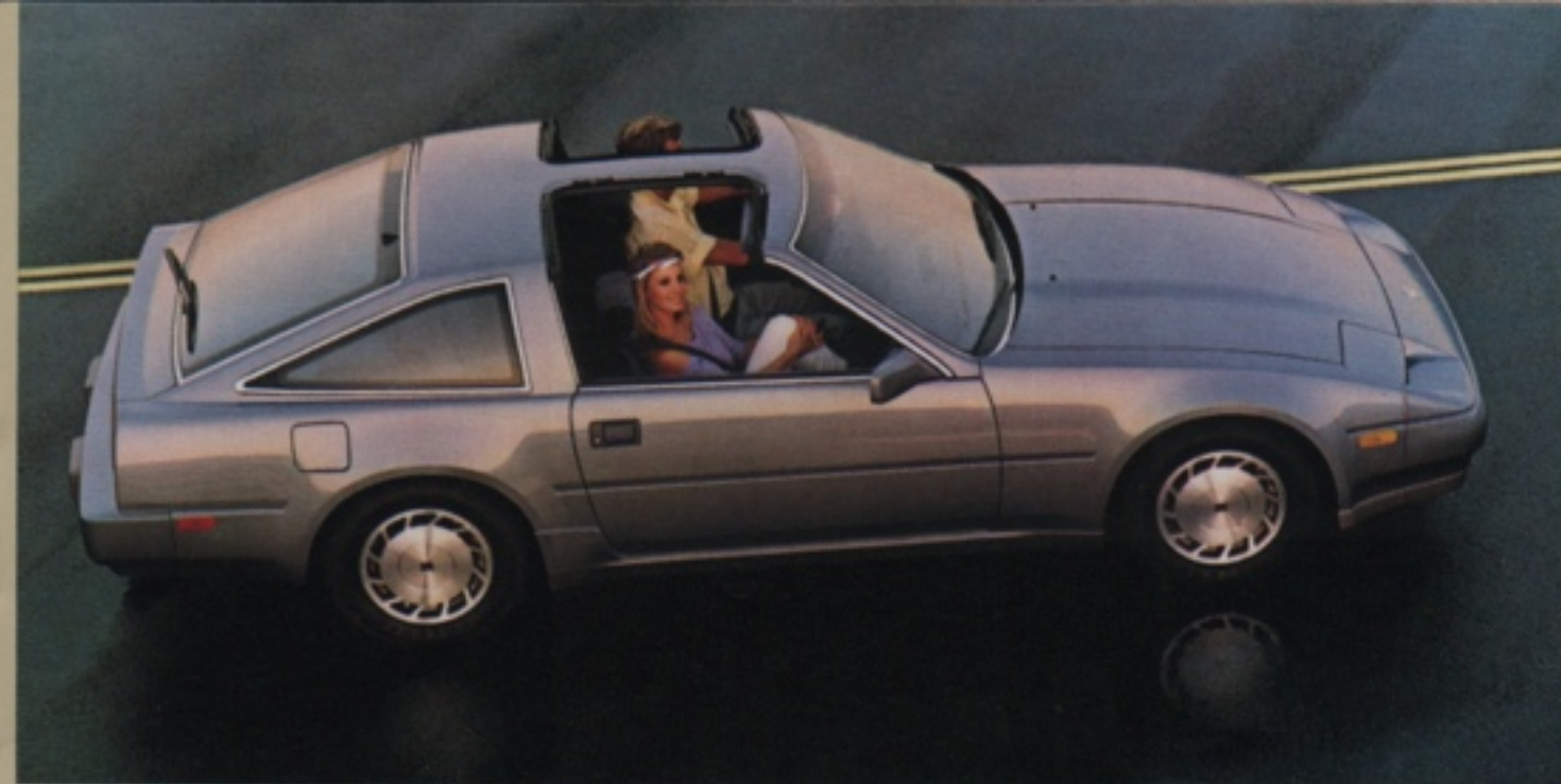
▲ NISSAN 300 ZX 2+2 ▲