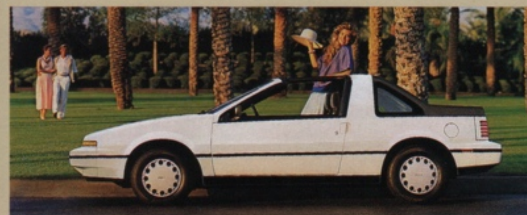
▲ NISSAN PULSAR NX XE