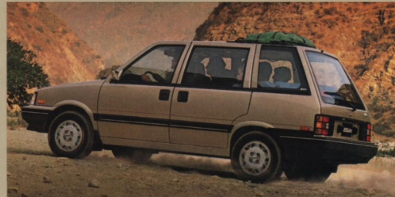
NISSAN STANZA 4-WHEEL-DRIVE WAGON ▼