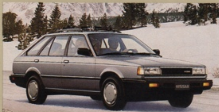
◀ NISSAN SENTRA XE 4-WHEEL-DRIVE WAGON