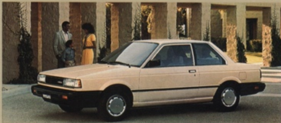
NISSAN SENTRA XE 2-DOOR SEDAN ▼