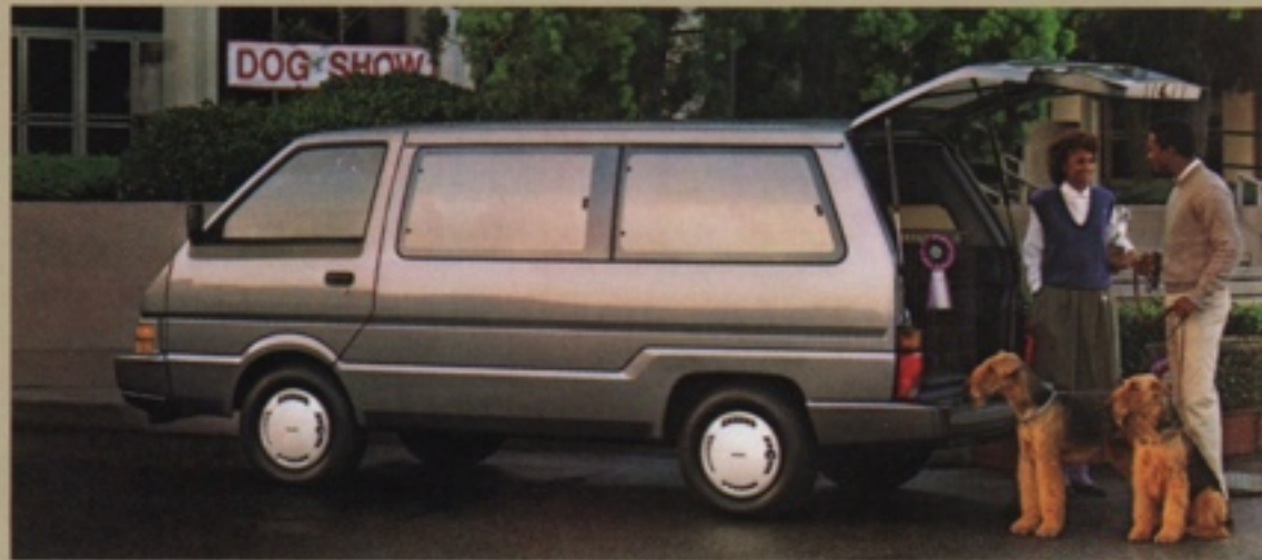
NISSAN VAN ▶