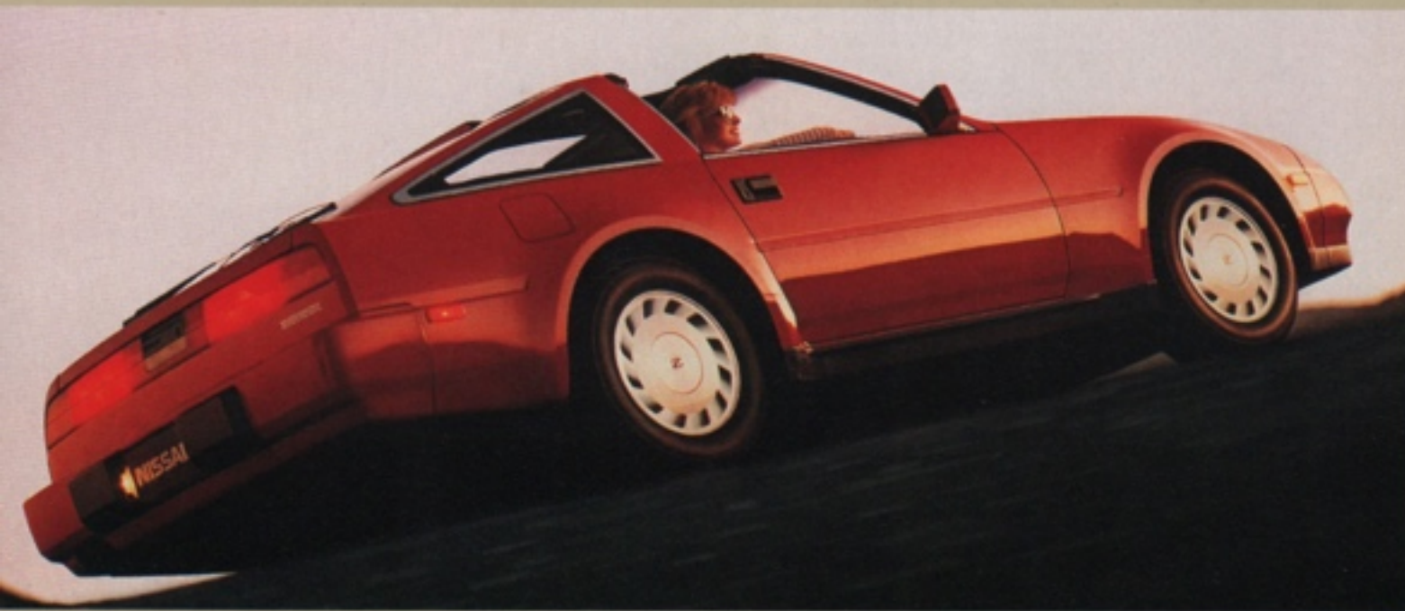
▼ NISSAN 300 ZX TURBO