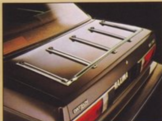
Strap that excess luggage to an attractive and sturdy chrome tubular steel deck rack.