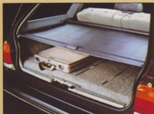
Valuables stay out of sight beneath Maxima Wagon's handsome retractable storage cover.