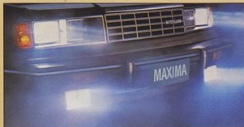
When rain, snow or fog cut the visibility down, a pair of halogen fog lights can brighten those dim nights for more secure driving.