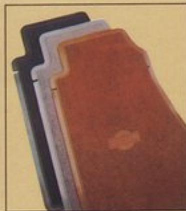
Color coordinated floor mats protect your Saxony carpets.