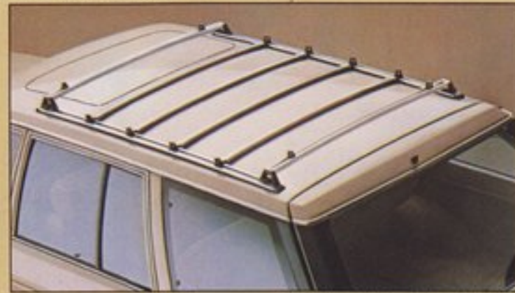
This tough, good-looking 4-seasons roof rack has sliding, adjustable stays. Special ski and bike attachments are available for added versatility.