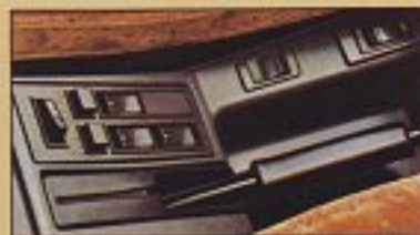
Central console puts window controls, parking brake, other functions at hand's reach.