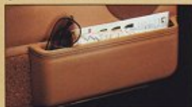
Convenient side pockets help keep maps and other often-needed items within easy reach.