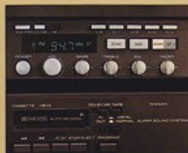
Digital readout, AM/FM stereo and cassette player are all part of a big 8-speaker sound system.