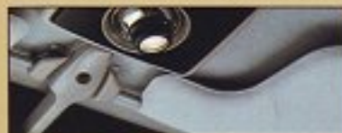
Ceiling-mounted map light swivels to cast a beam of light where it's needed. (Models without sun roof)