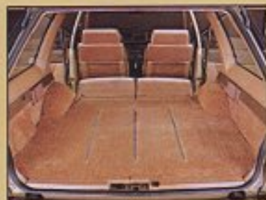
Maxima Wagon's cargo area is long, wide and flat to facilitate loading and unloading.