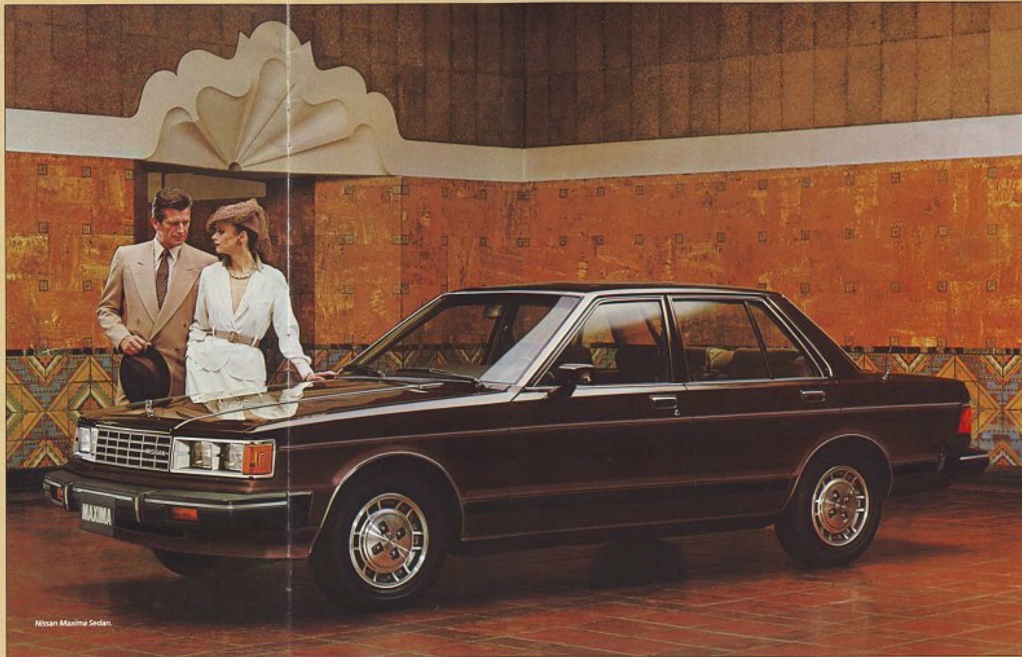
Nissan Maxima Sedan.