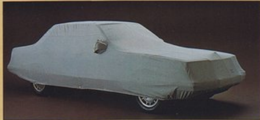
Keep your Maxima Sedan's finish sparkling with a custom-fitted car cover. It breathes to let the air in but keeps dust and grime out.