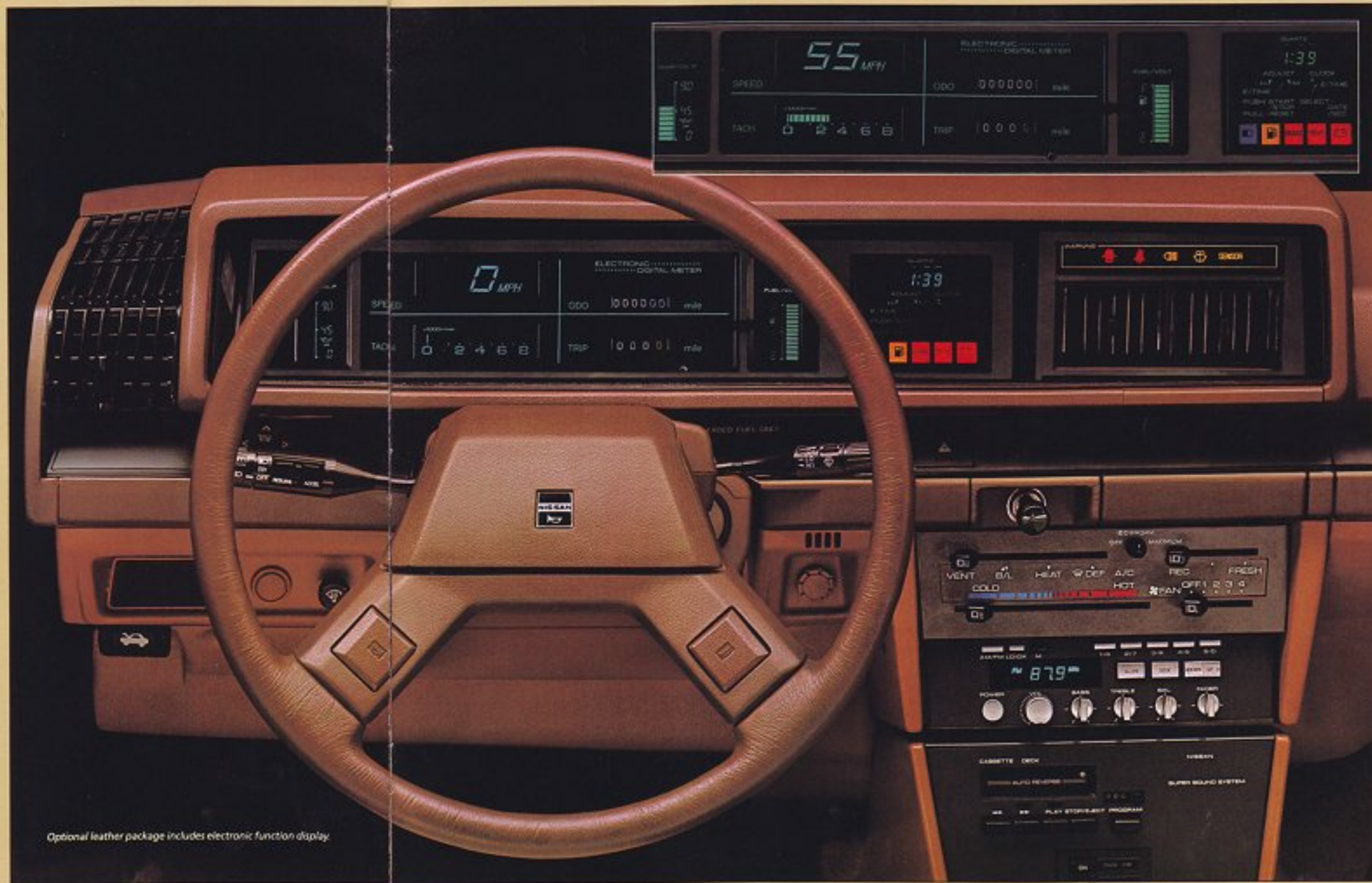
Optional leather package includes electronic function display.