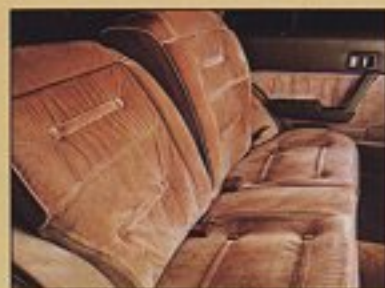
Rear seat passengers will appreciate the luxurious comfort of reclining seat backs.

And all this luxury and convenience is available at a price that will surprise you. The Nissan Maxima Wagon—a major value.