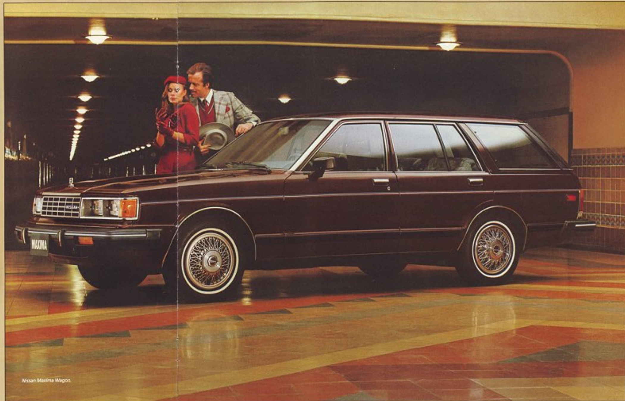
Nissan Maxima Wagon