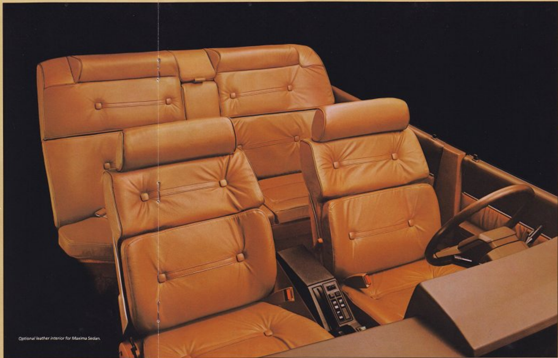
Optional leather interior for Maxima Sedan.