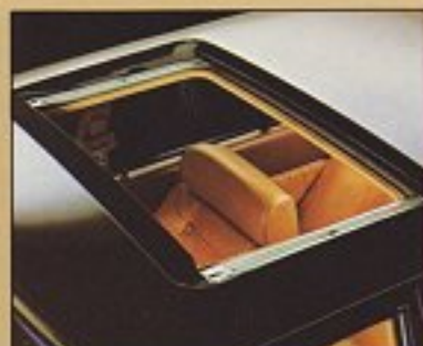
Electric sun roof glides out of sight to let the outside in on those great days.