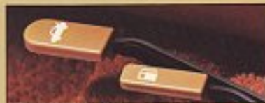
Remote latches beside the driver's seat open both the rear hatch and the fuel filler door.