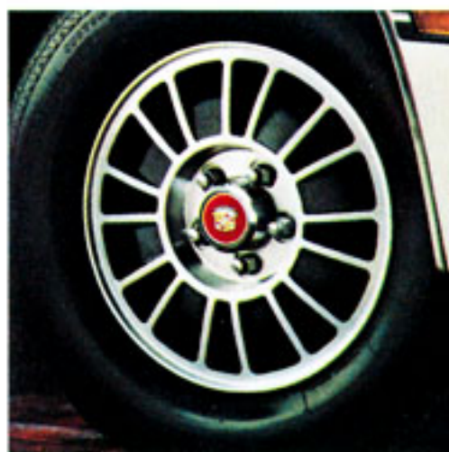
NEW ALUMINUM ALLOY WHEELS