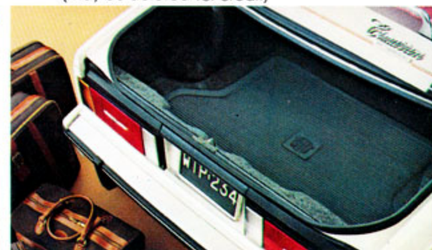
CIMARRON'S SPACIOUS TRUNK