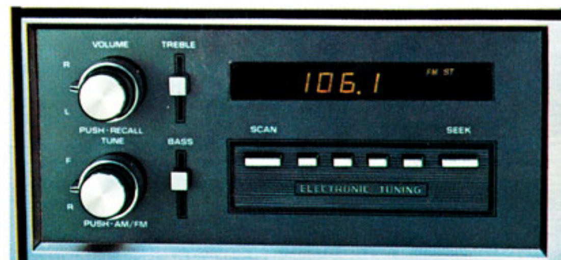
NEW ELECTRONICALLY TUNED AM/FM STEREO RADIO (may be deleted for credit)

Take a good look at Cimarron '83. At the luxurious interior, with its body-contoured, leather-faced front bucket seats with lumbar and lateral support. The leather-wrapped steering wheel. The full instrumentation...including tach. Plus air conditioning and the new Electronically Tuned AM/FM Stereo Radio (may be deleted for credit). All standard. Here is quality and comfort befitting a Cadillac. With room enough for five adults... plus their luggage. The same amount of front seat legroom found in many full-size cars. Plus those special touches...like the hand-buffed exterior finish. Cadillac quality. Cimarron '83.