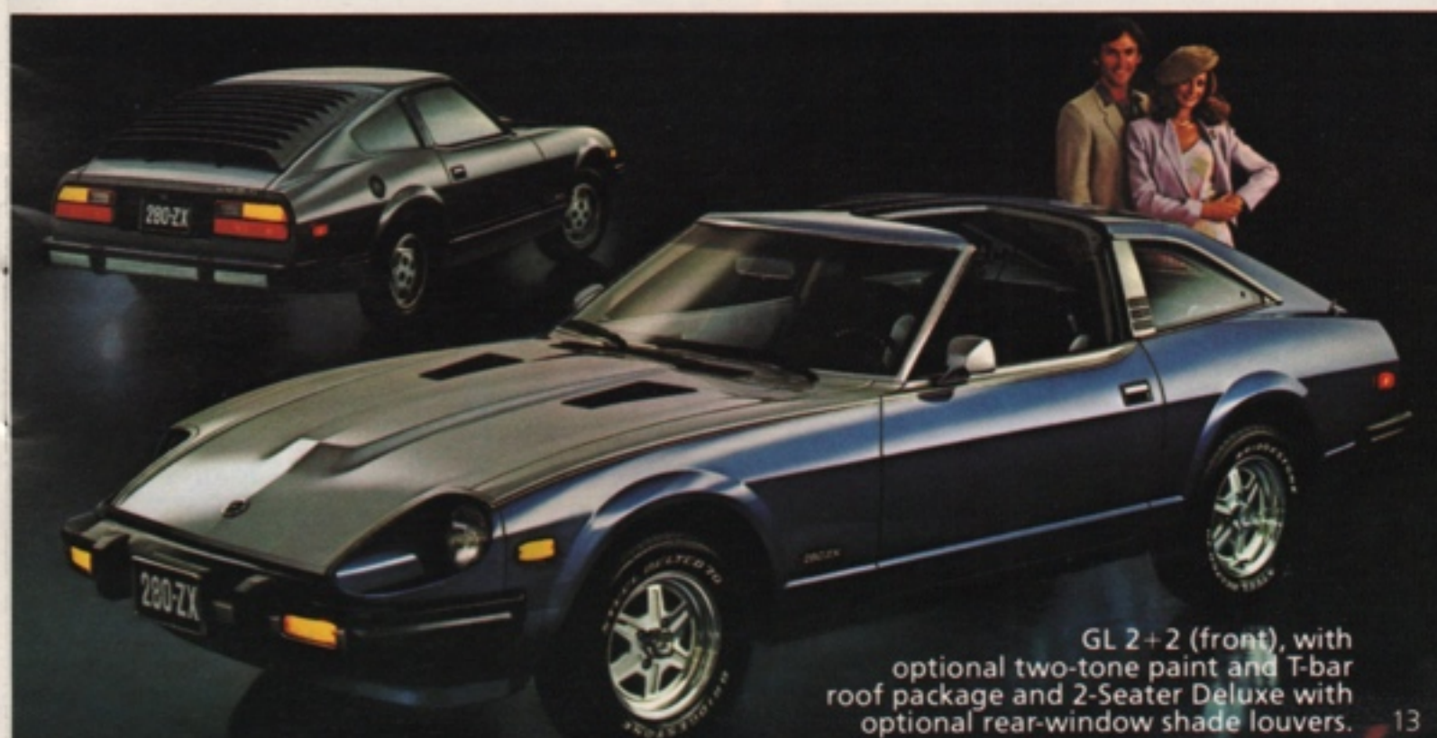
GL 2+2 (front), with optional two-tone paint and T-bar roof package and 2-Seater Deluxe with optional rear-window shade louvers.