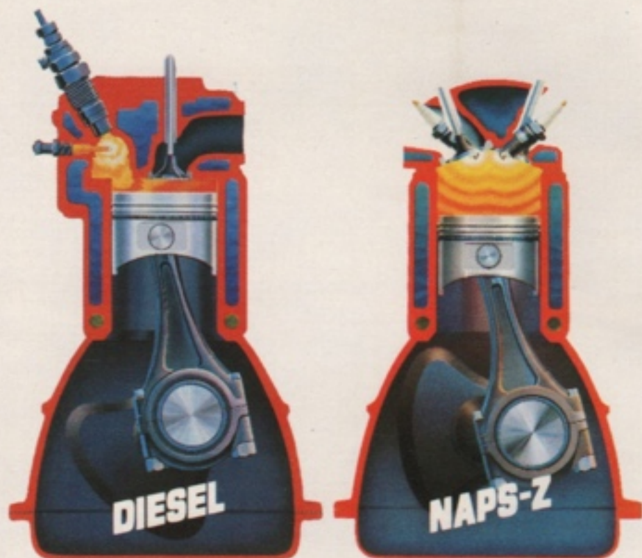
New Nissan Diesel: economy and power.