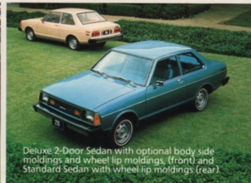
Deluxe 2-Door Sedan with optional body side moldings and wheel lip moldings, (front) and Standard Sedan with wheel lip moldings (rear).