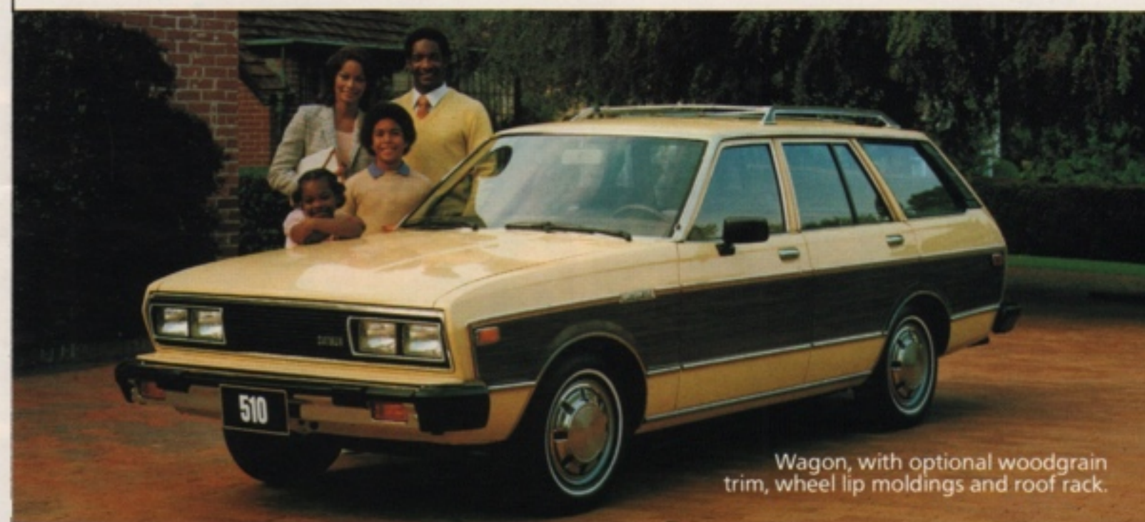
Wagon, with optional woodgrain trim, wheel lip moldings and roof rack.

**Vehicles with optional equipment or California emissions equipment will be slightly heavier.