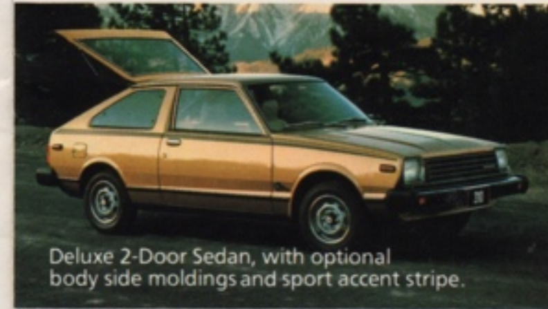
Deluxe 2-Door Sedan, with optional body side moldings and sport accent stripe.

**Vehicles with optional equipment or California emissions equipment will be slightly heavier.