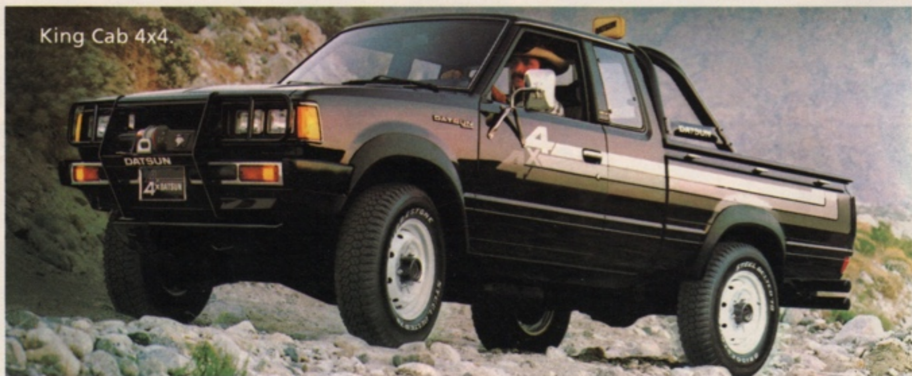
King Cab 4x4.