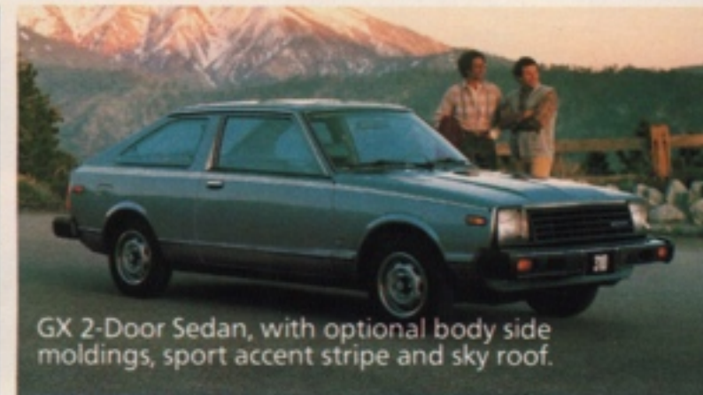
GX 2-Door Sedan, with optional body side moldings, sport accent stripe and sky roof.