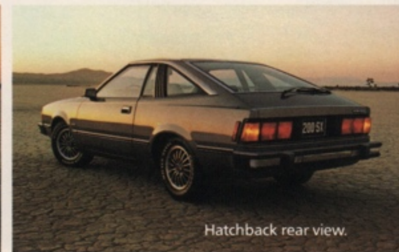
Hatchback rear view.