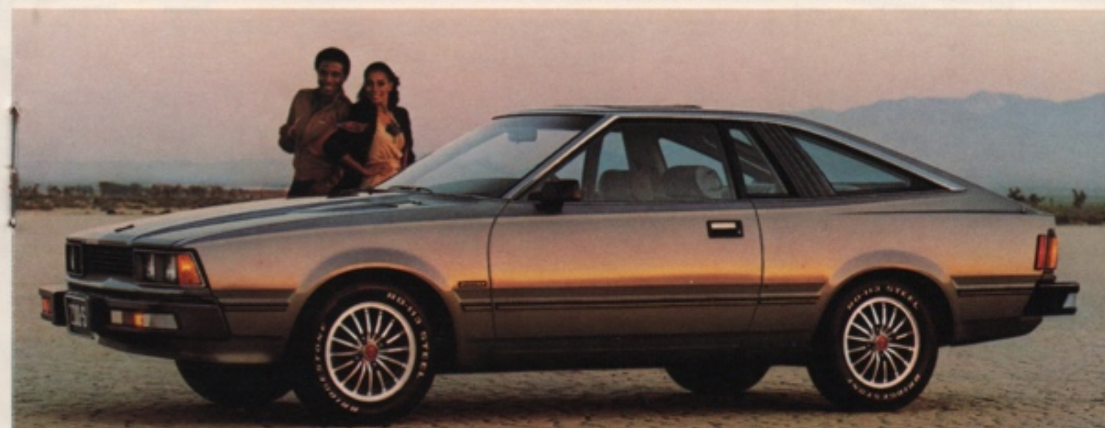
Sport Luxury Hatchback, with optional mag-style alloy wheels, sky roof and body side moldings.