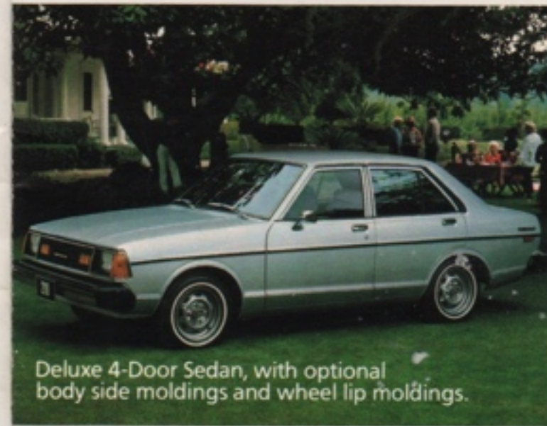
Deluxe 4-Door Sedan, with optional body side moldings and wheel lip moldings.

†Vehicles with optional equipment or California emissions equipment will be slightly heavier. ††Standard model: 1905.