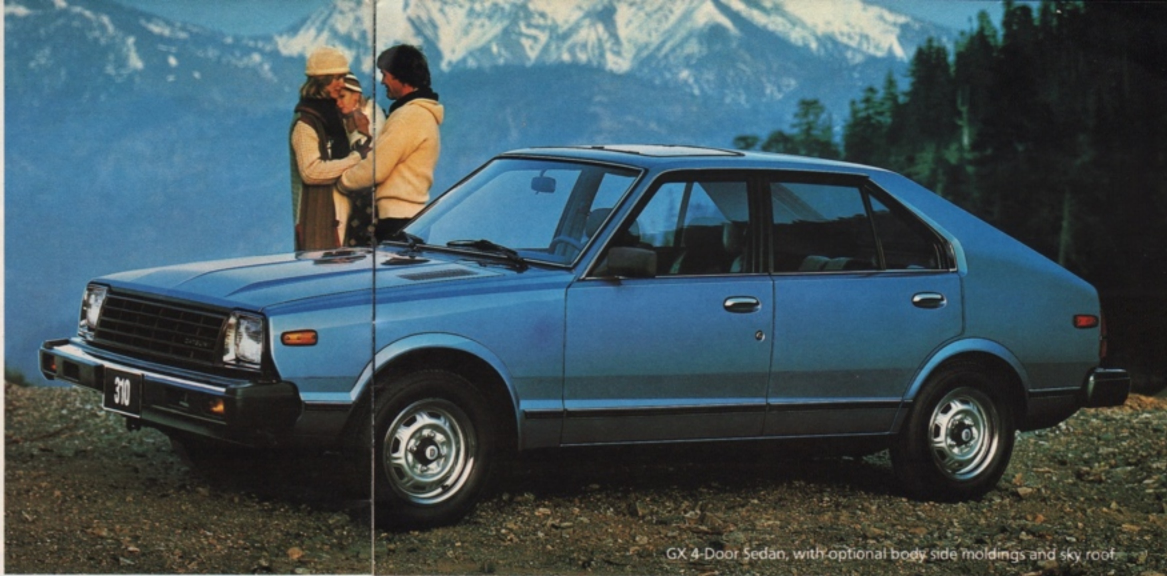
GX 4-Door Sedan, with optional body side moldings and sky roof