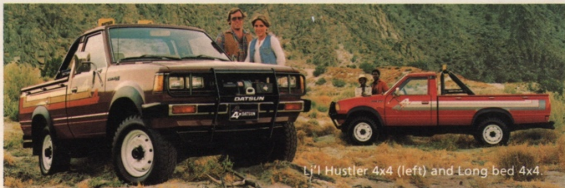
Lj'l Hustler 4x4 (left) and Long bed 4x4.

Above trucks shown with optional grille and brush guards, winch, tripod mirrors, light bar, halogen off-road lights, graphic stripes, tubular rear bumper, fender flares and body side moldings.