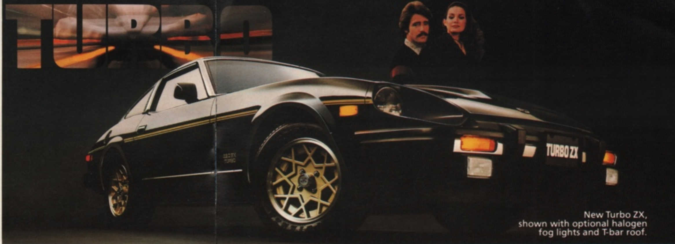
New Turbo ZX, shown with optional halogen fog lights and T-bar roof.