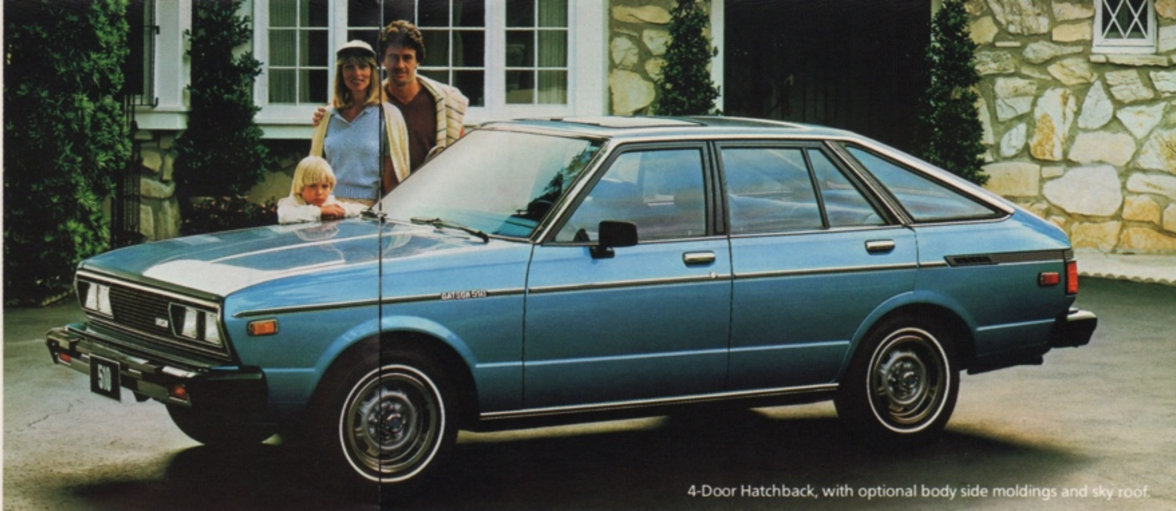
4-Door Hatchback, with optional body side moldings and sky roof.