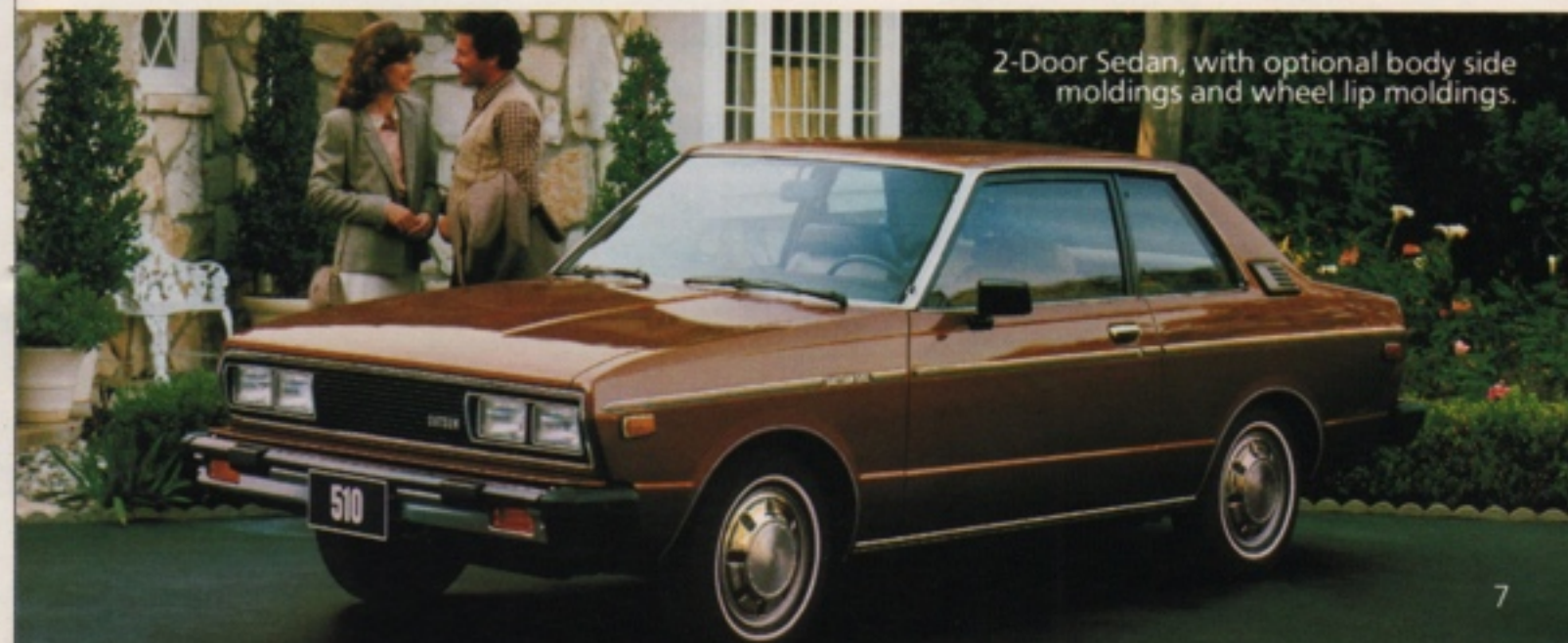
2-Door Sedan, with optional body side moldings and wheel lip moldings.