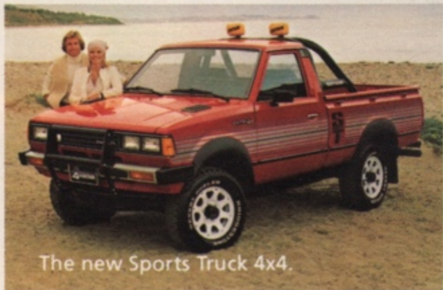
The new Sports Truck 4x4.