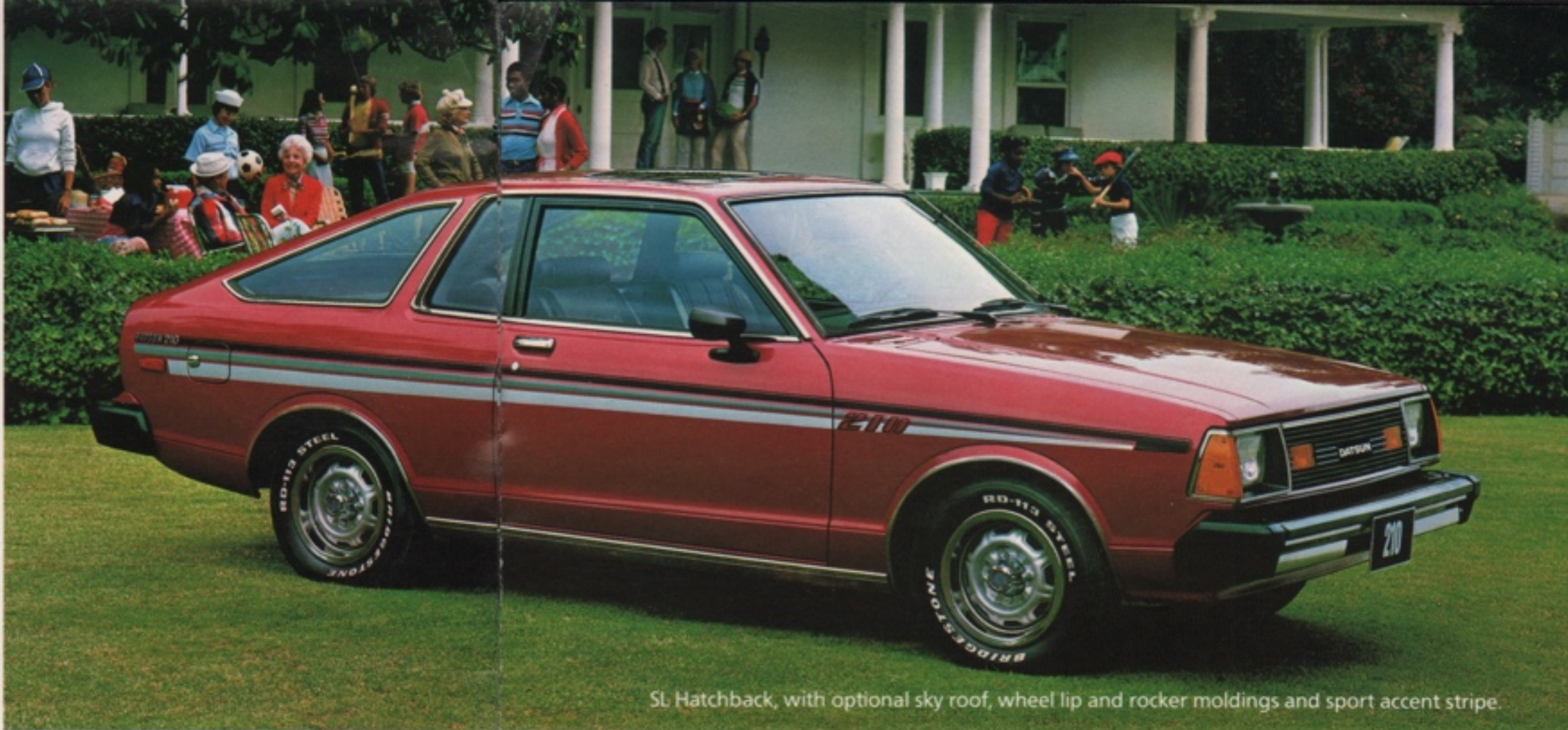
SL Hatchback, with optional sky roof, wheel lip and rocker moldings and sport accent stripe.