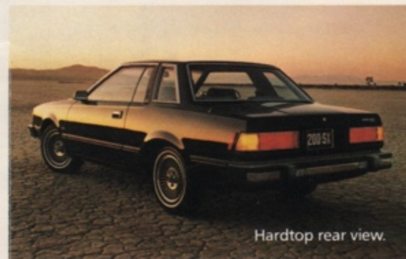
Hardtop rear view.

**Vehicles with optional equipment or California emissions equipment will be slightly heavier.