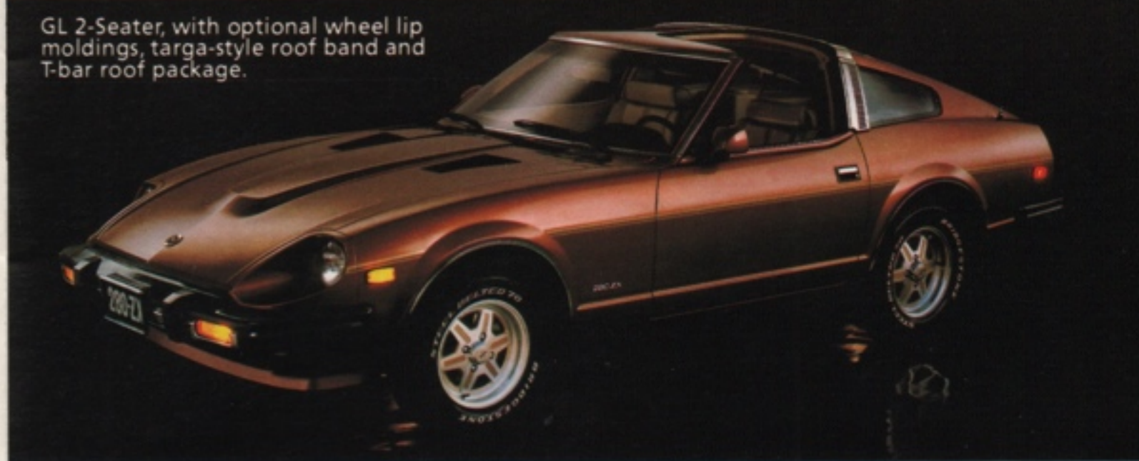
GL 2-Seater, with optional wheel lip moldings, targa-style roof band and T-bar roof package.

**Vehicles with optional equipment or California emissions equipment will be slightly heavier.