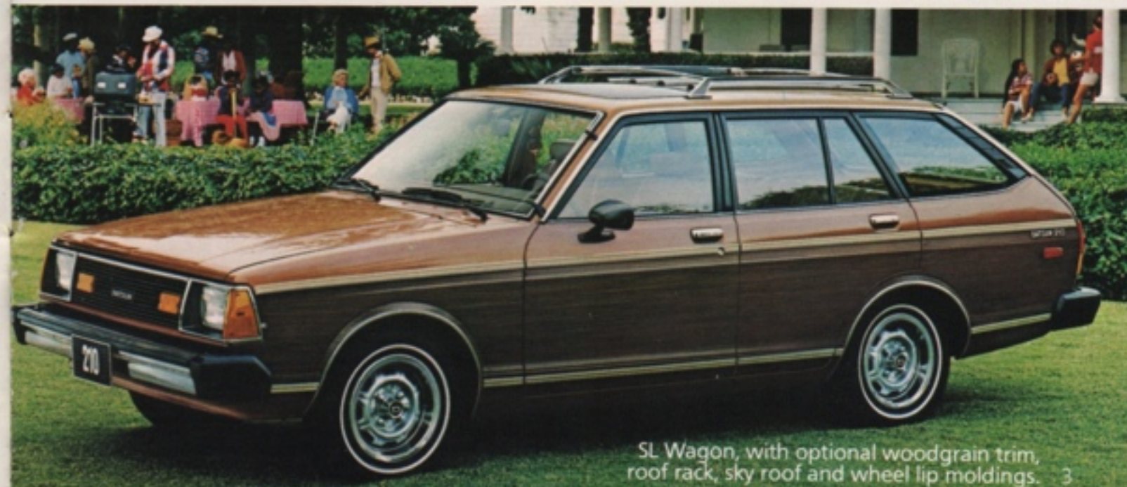
SL Wagon, with optional woodgrain trim, roof rack, sky roof and wheel lip moldings.