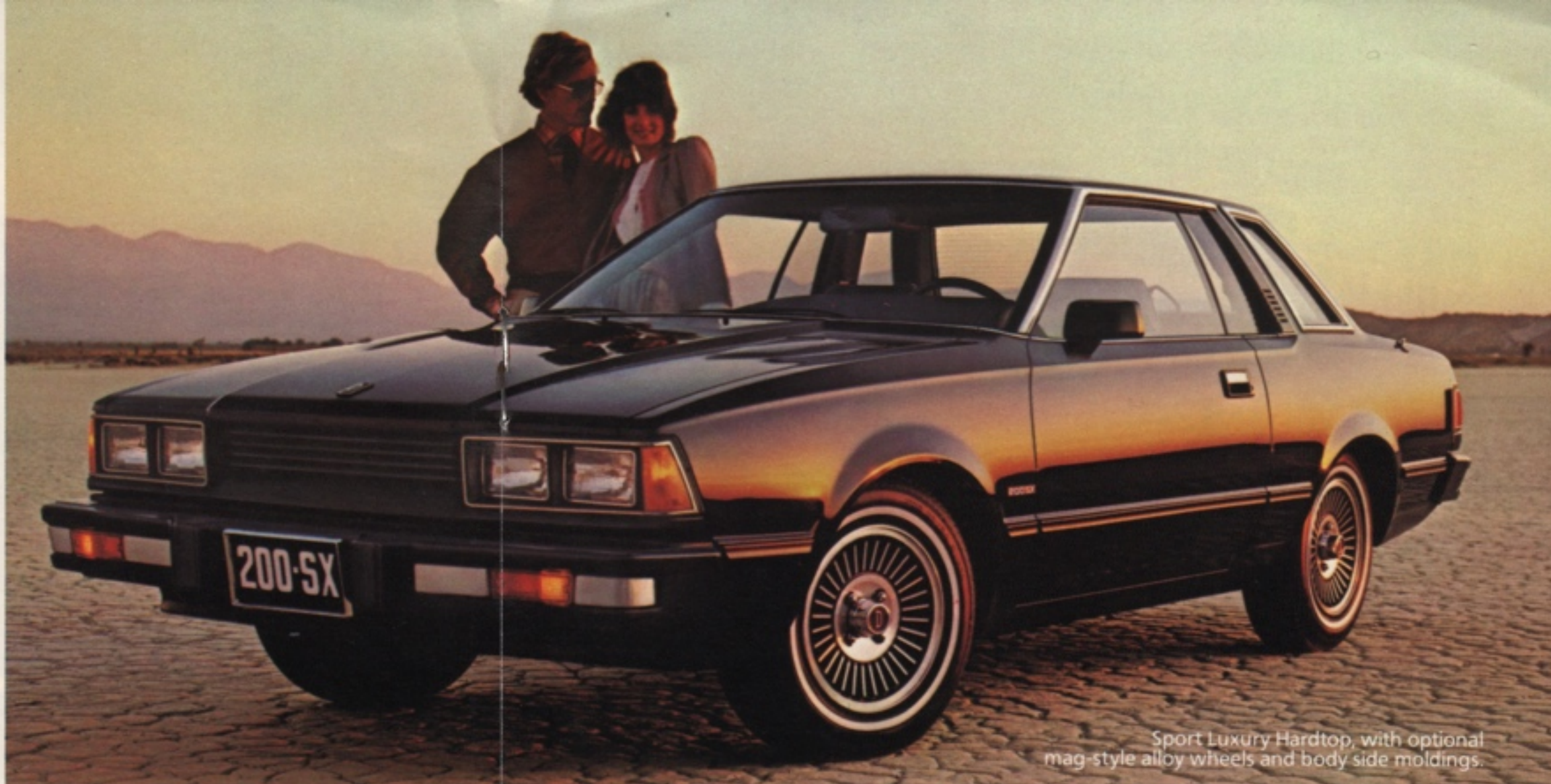
Sport Luxury Hardtop, with optional mag-style alloy wheels and body side moldings.