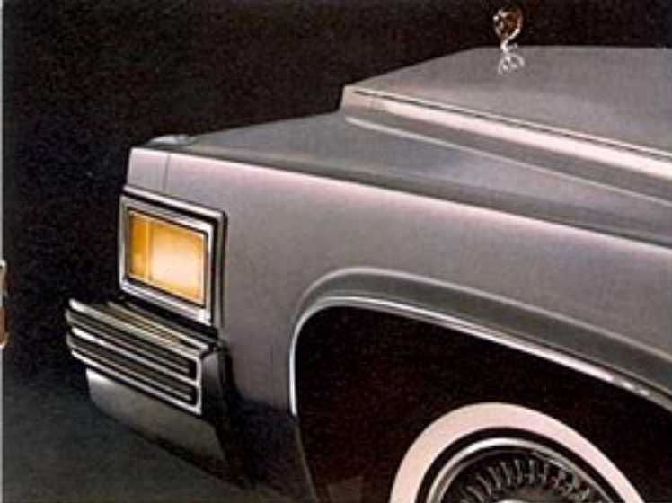
Cornering lights and lamp monitors.