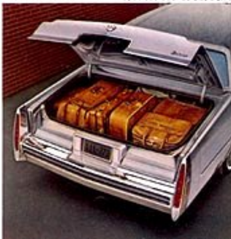
Spacious Cadillac-size trunk

Also standard are: Quartz Digital Clock • Push-To-Reset Trip Odometer • Inside Hood Release • Automatic Parking Brake Release • Color-Keyed Litter Container • Remote Control Left-Side Mirror (Also Remote Control Right-Side Mirror on Limousines) • Washer Fluid Low-Level Indicator Light • Center Armrests • Sunshade Vanity Mirror • Automatic Transmission.