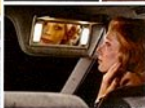
Lighted Vanity Mirror.