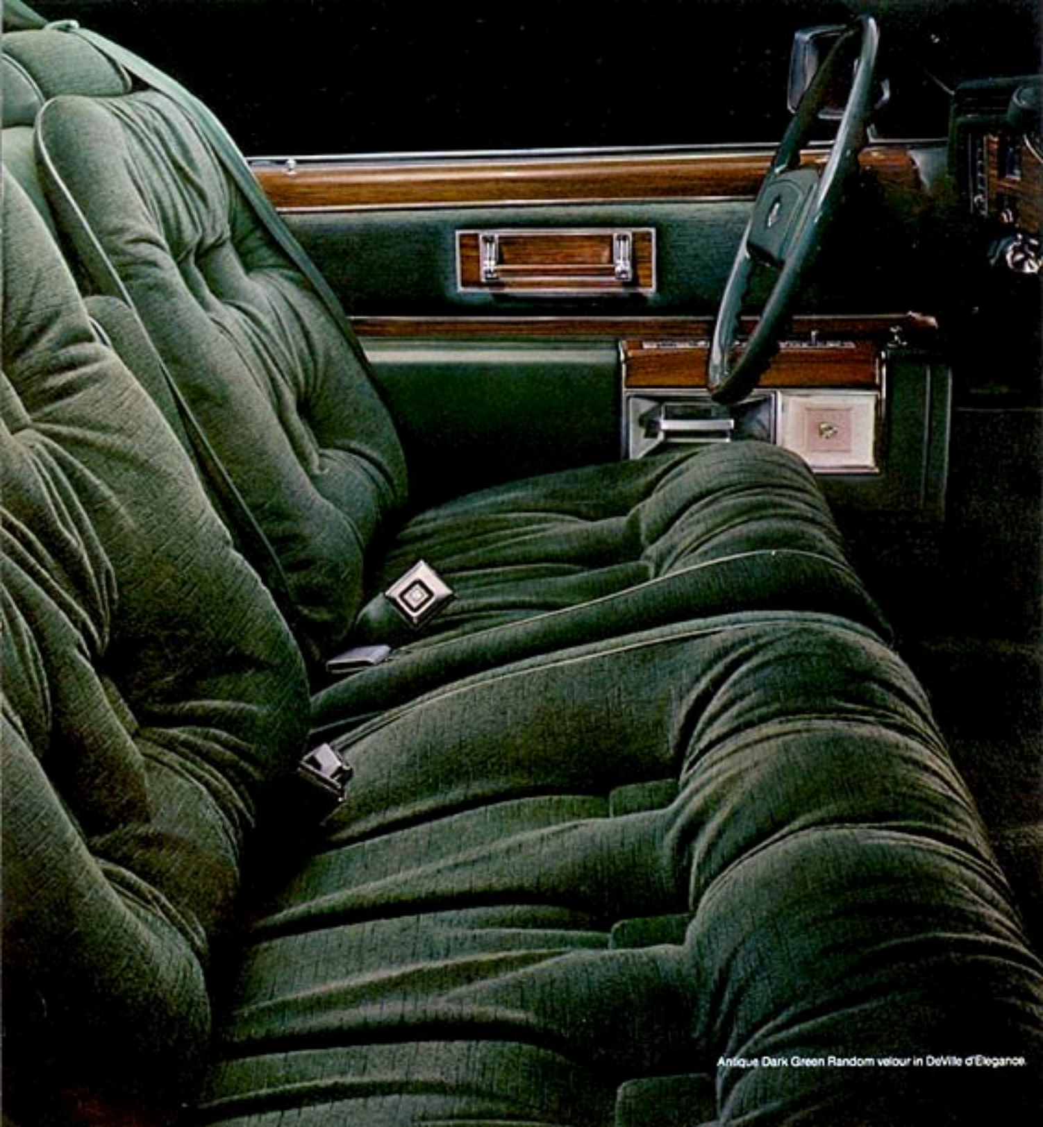
Anique Dark Green Random velour in DeVille d'Elegance.