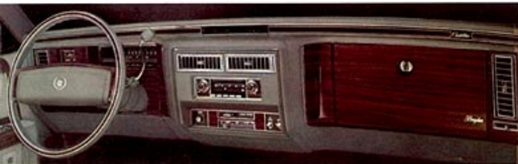
Functionally coordinated instrument panel.

Many things contribute to Total Cadillac Value. Among these is the number of luxury features that are standard on Fleetwood Brougham, Coupe deVille, Sedan deVille and Cadillac Limousines.