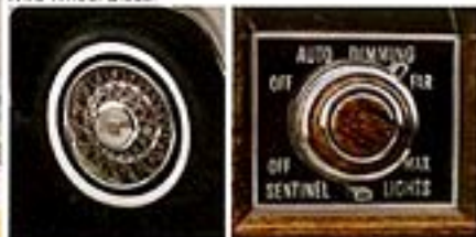
Wire Wheel Discs