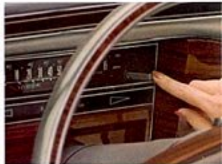
Push-to-reset trip odometer.

Functionally Coordinated Instrument Panel —Driver-only controls on the left . . . information band across the top . . . and the center area for shared controls.