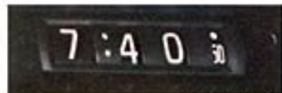
Quartz Digital Clock.