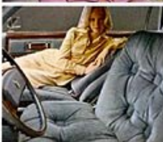
Power Recliner Seat