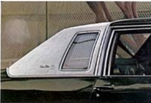
Cabriolet Roof in White Elk Grain for Coupe DeVille

Cabriolet. Here is a dramatic roof design available for Coupe DeVille. A handsome chrome accent strip sets off the distinctive Elk Grain vinyl top. Cabriolet beauty is further enhanced by decorative Cadillac crests and a handsome French seam around the rear window. Select from 16 coordinated colors.