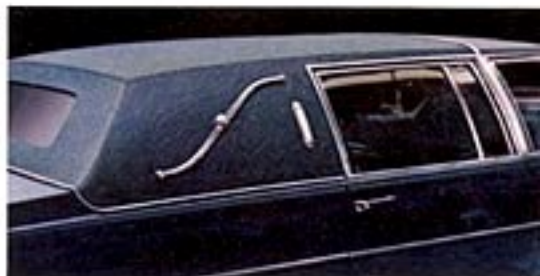
Limousine with Landau Cabriolet Roof

Limousine Landau. Exquisite Landau Bar treatments are available by special order for either the Fleetwood Limousine or Fleetwood Formal Limousine. Further choices include a Full Landau Roof or Landau Cabriolet. Both feature handsome Elk Grain vinyl.