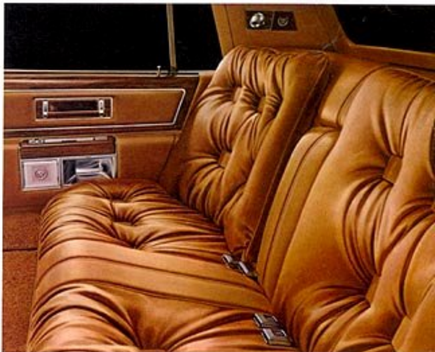
Brougham d'Elegance interior with Available Medium Saddle Leather

Brougham d'Elegance. This expression of elegance includes contoured pillow-style seats trimmed in sumptuous Florentine velour. Offered in Antique Light Gray, Antique Light Blue, Antique Dark Green, Antique Light Beige and Antique Dark Mulberry. Doors are trimmed in Florentine velour . . . as are door pull straps and front seatback assist straps. Also available for '78 is the luxury of Medium Saddle Leather for seating areas. Standard features include 50/50 Dual Comfort front seating . . . deep, plush pile carpeting for the floor and the lower portions of the doors. Deluxe vinyl front and rear floor mats are covered in the same carpet. Three above-door passenger assistance grips and "Brougham d'Elegance" glove box door script distinguish the interior even more. Outside touches include "d'Elegance" insignia . . . distinctive accent stripes . . . turbine-vented wheel discs or a choice of standard wheel discs.