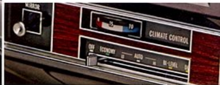
Automatic Climate Control.

Disc Brakes —Four-wheel disc brakes are standard with Fleetwood Brougham. Self-adjusting front-wheel disc and rear-wheel drum brakes with DeVilles and Limousines. Steel-Belted, Wide-Whitewall Radial Tires —Built to GM specifications. Oversized H-Series tires are standard on Brougham and Limousines.