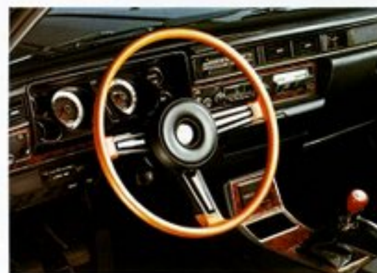
Optional wooden steering wheel

Exhilarating to behold! Now sit behind the wheel and look along the raking hood of the luxurious 260C Hardtop by Datsun. Distinctive square-cut windows and a sleek low profile tell you this car's got something very vital underneath that long inviting hood—a high-reliability 6-cylinder 2.6 litre engine: No less. Interior styling is every bit as zesty as that outside. Feel the restful comfort of those sporty front bucket seats, fully reclining, and upholstered in generous jersey-weave cloth.