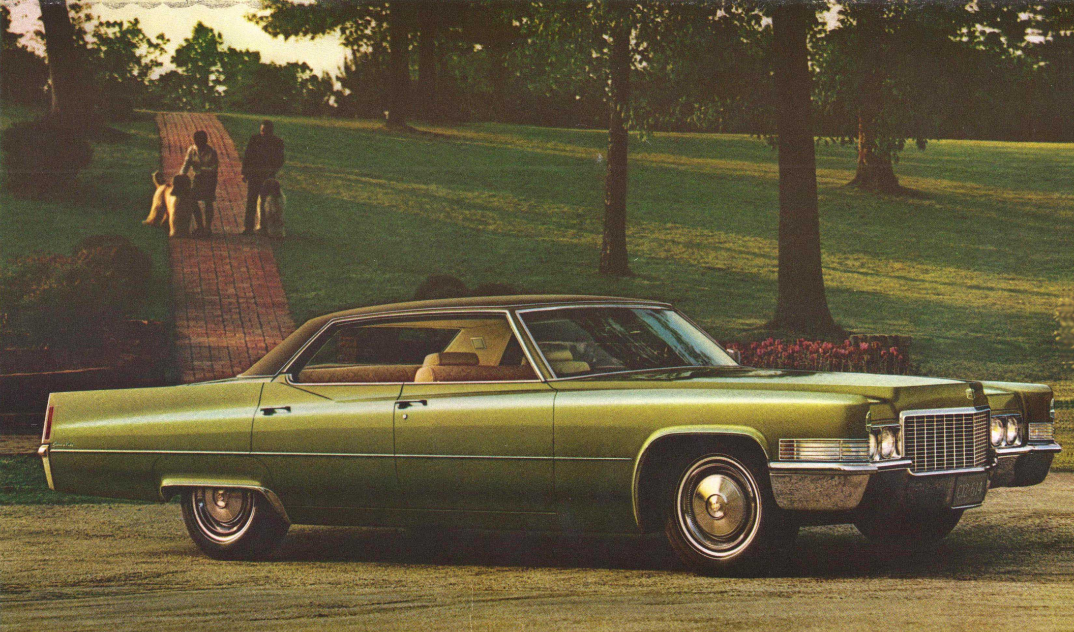
Hardtop Sedan deVille in Bayberry with Dark Bayberry vinyl roof.