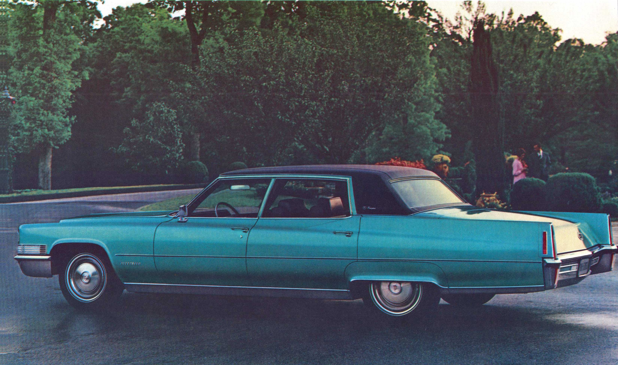
Fleetwood Brougham in Lucerne Aqua Firemist with Black padded vinyl roof.