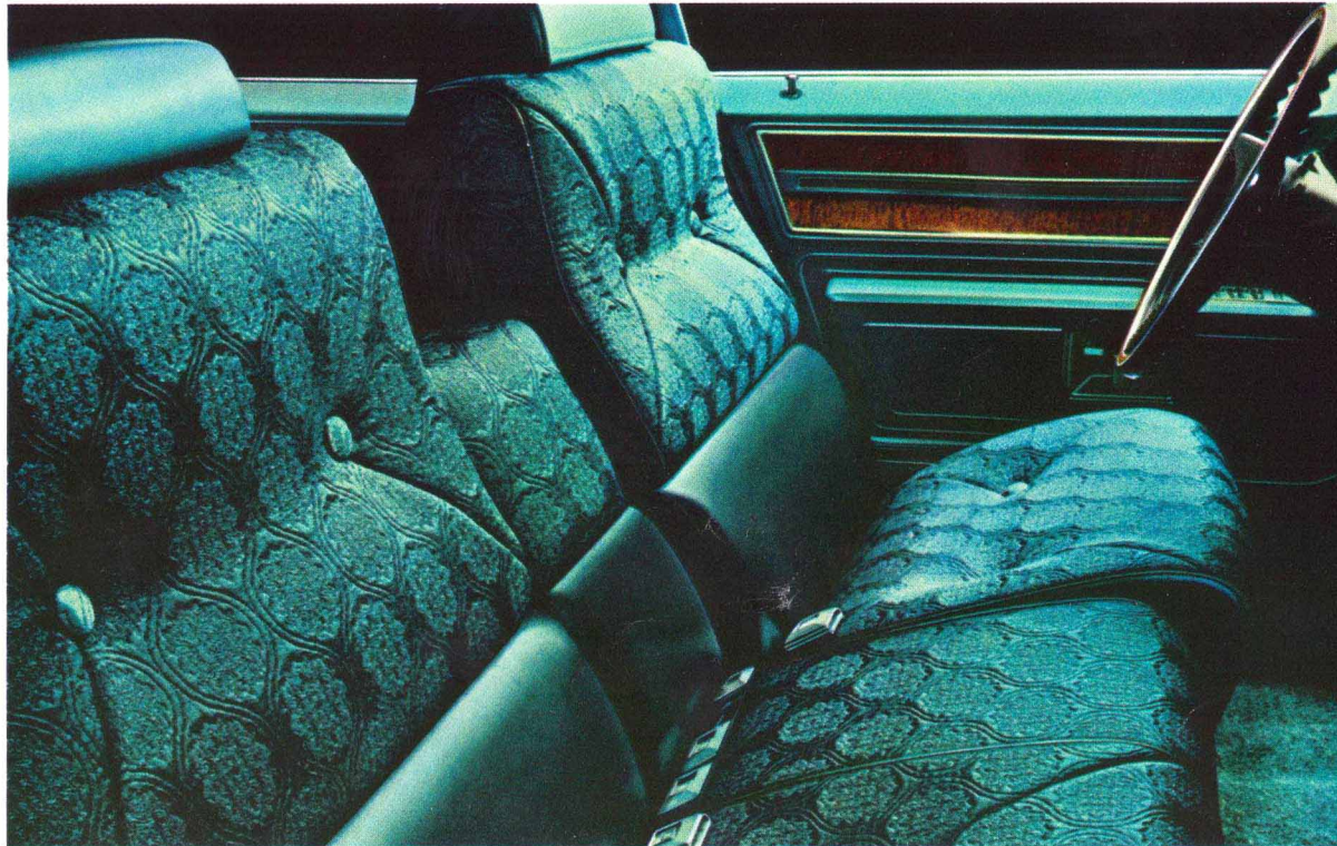
The Brougham interior is shown in Medium Turquoise Dumbarton cloth-and-leather.

THE SPIRIT OF THE SEVENTIES. Cadillac proudly introduces eleven magnificent choices of motoring pleasure for the spirited seventies. Five of them are shown in this brochure. Each brilliant new 1970 Cadillac heralds the beginning of a motoring life-style anticipated for a great new era. The clean, contemporary styling clearly looks to the future and distinguishes Cadillac from all other fine cars. The richly appointed interiors are a new measure of taste and elegance. Power is smooth and quiet with a plentiful reserve for all the advanced accessories and convenience you expect in a Cadillac. But nothing expresses the spirit of the seventies more vividly than the new and exciting 1970 Eldorado. Its exclusive new V-8, with a displacement of 8.2 litres (500 cubic inches), offers a responsiveness that leaves the sixties far behind, yet speaks quietly about its remarkable performance. Each new Cadillac model clearly shows that Cadillac engineers, stylists and craftsmen have once again met the challenge of leadership and created the Standard of the World with the distinction and vitality that fully satisfy the demands for excellence in a new era. Your Cadillac dealer would be most happy for you to discover why there is no more magnificent way to experience motoring's spirit of the seventies than to view the world from behind the wheel of a brilliant and luxurious new 1970 Cadillac.