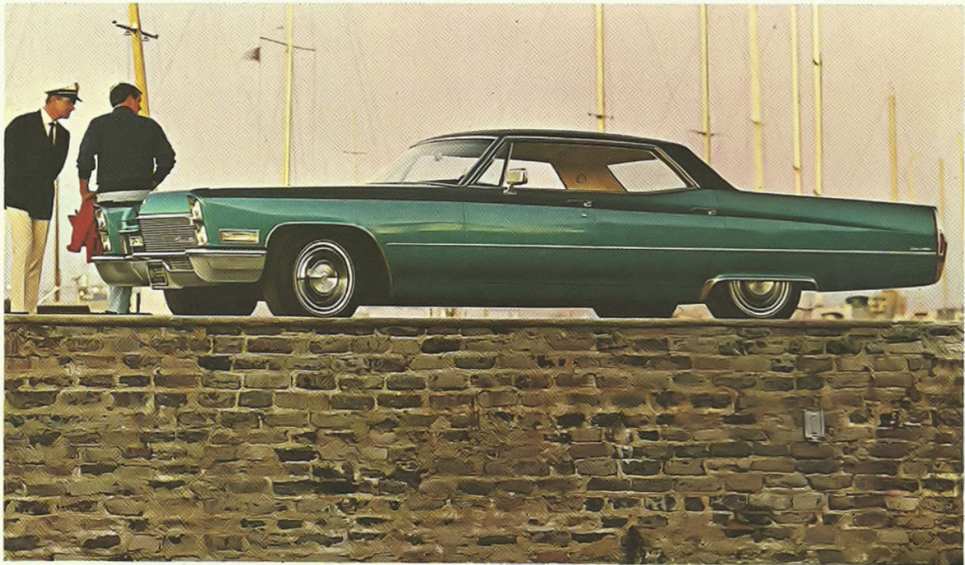
1968 Sedan deVille

1968 This is the year Cadillac introduced the largest V-8 engine ever put into a production passenger car. The new Cadillac 472 V-8 is standard in all models. It is the smoothest, quietest Cadillac engine ever developed, and it introduces a whole new standard of performance to the field of luxury motoring. In addition, Cadillac has more built-in comfort, and there are more standard luxury features than ever before.