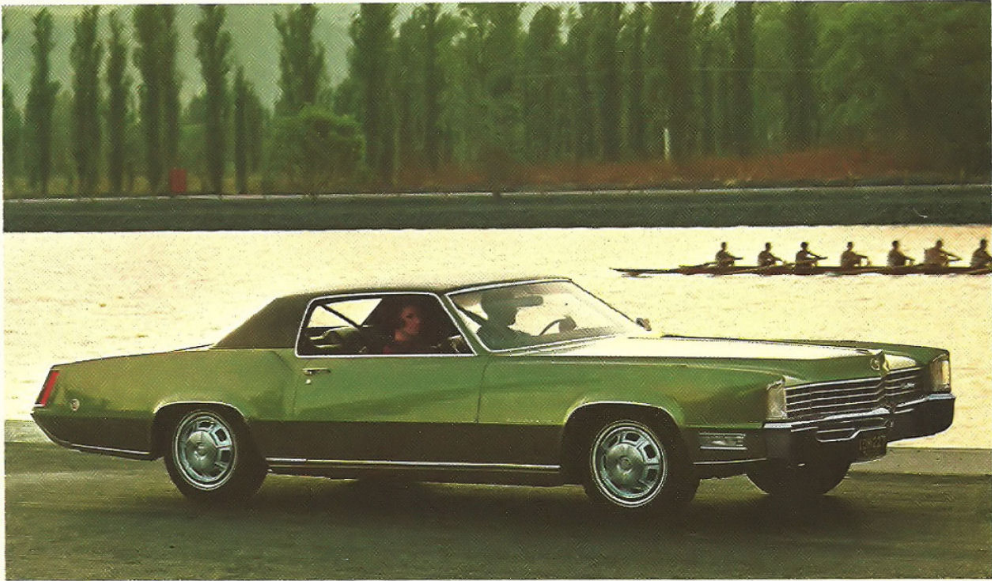
1968 Fleetwood Eldorado

1968 There is no better way to add new drama and excitement to your motoring than by selecting the Fleetwood Eldorado, world's finest personal car. Its distinctive appearance, advanced engineering and sparkling performance have already made it the most desired of all luxury cars. And in every respect, Eldorado interiors offer the comfort and luxurious appointments that are so much a part of the Cadillac tradition.