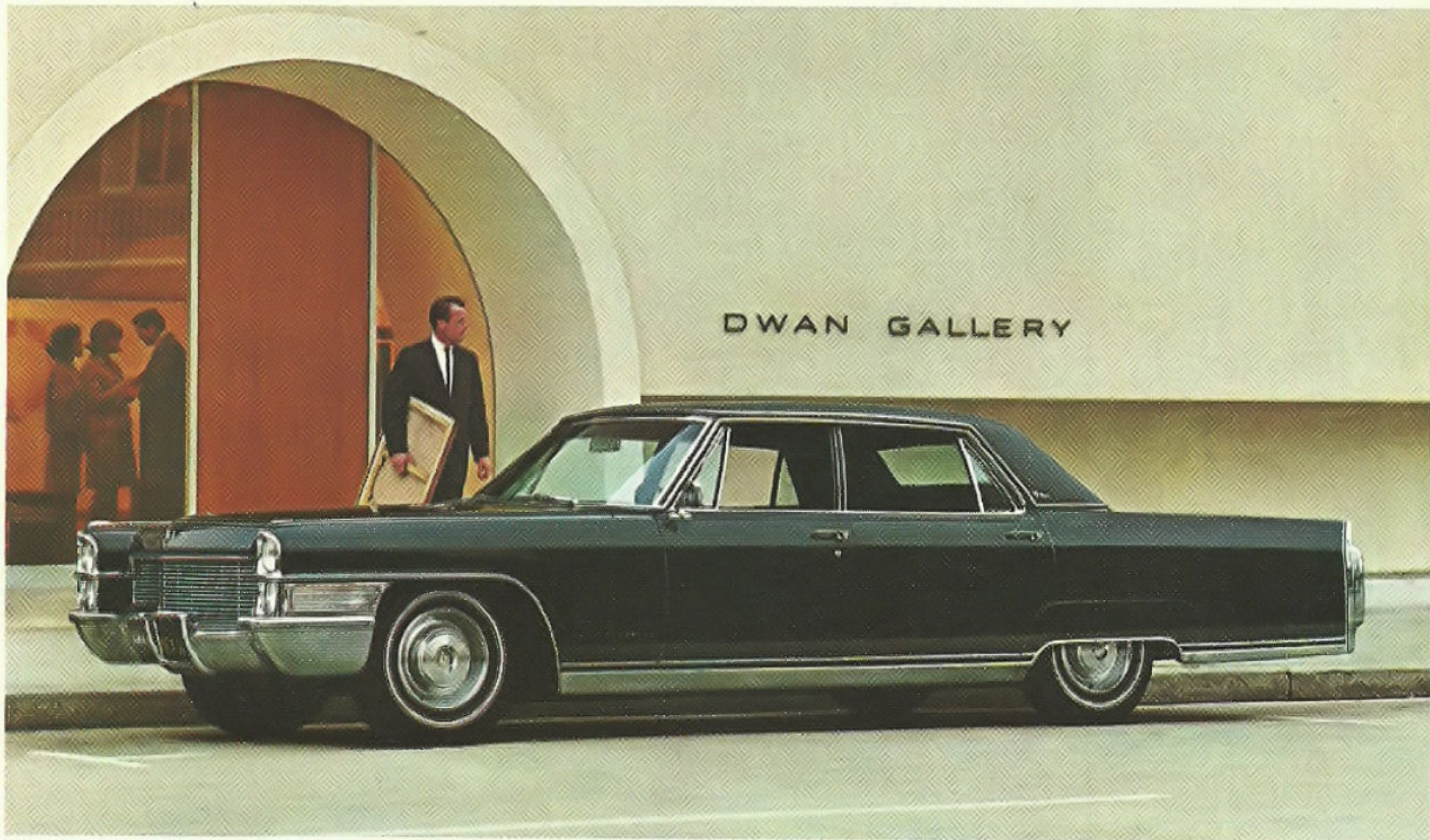
1965 Fleetwood Brougham

1965 A longer, lower silhouette characterized the new styling of the 1965 Cadillacs. Automatic Level Control was introduced, and a new frame design and front and rear suspension made this one of the smoothest, steadiest Cadillacs built up to that time. The superb craftsmanship and advanced engineering of every Cadillac help to assure your complete motoring satisfaction for years to come.