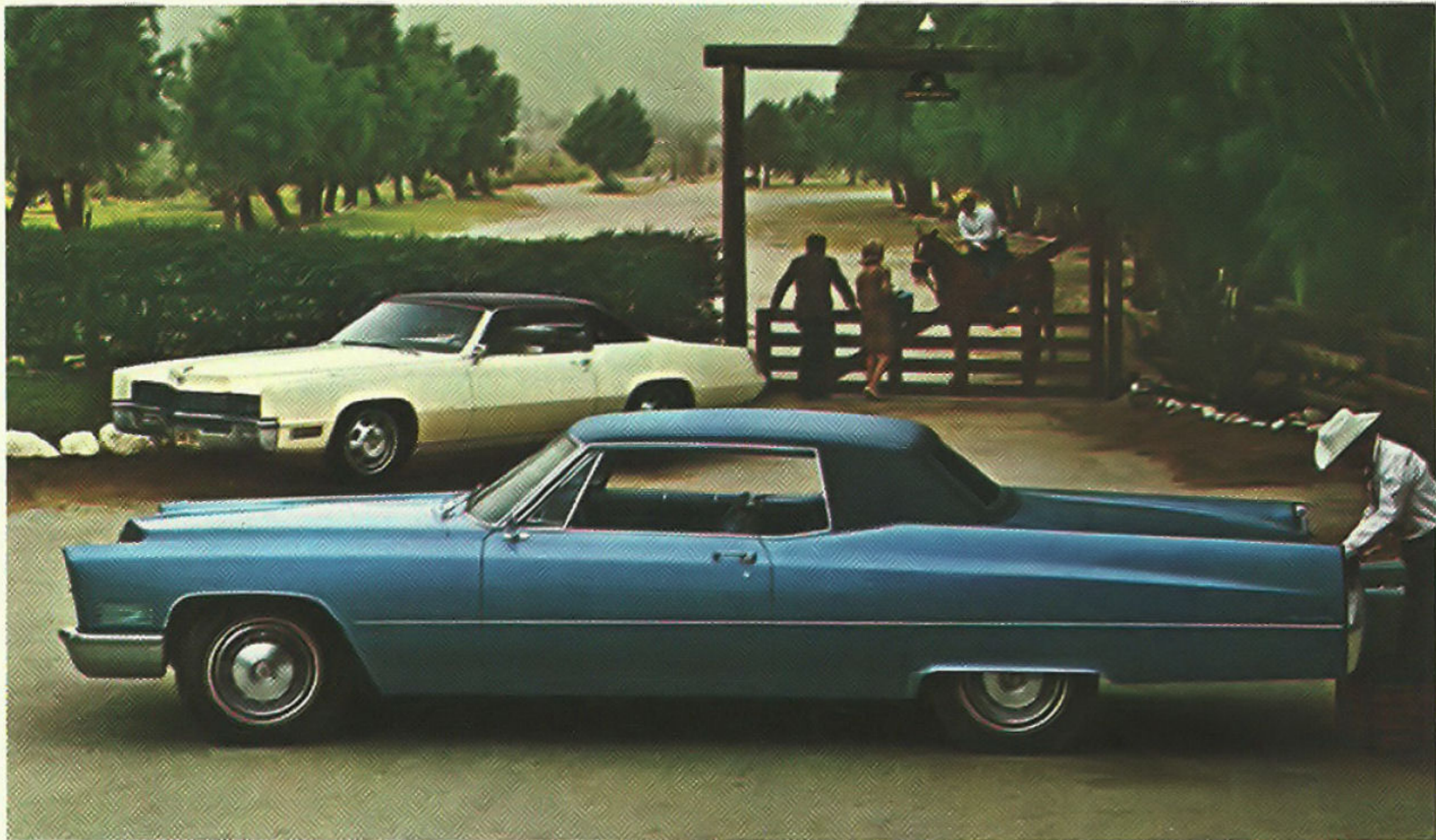
Foreground: 1967 Coupe deVille; background: 1967 Fleetwood Eldorado

1967 A major styling change in the traditional Cadillac models, many new safety features and the introduction of the Fleetwood Eldorado marked this as one of the most significant years in Cadillac history. The DeVille series, most popular of all Cadillacs, was even more luxuriously appointed than ever before. You will enjoy, with any Cadillac, an unequalled pride of ownership. For a Cadillac is a Cadillac, regardless of its year of manufacture.