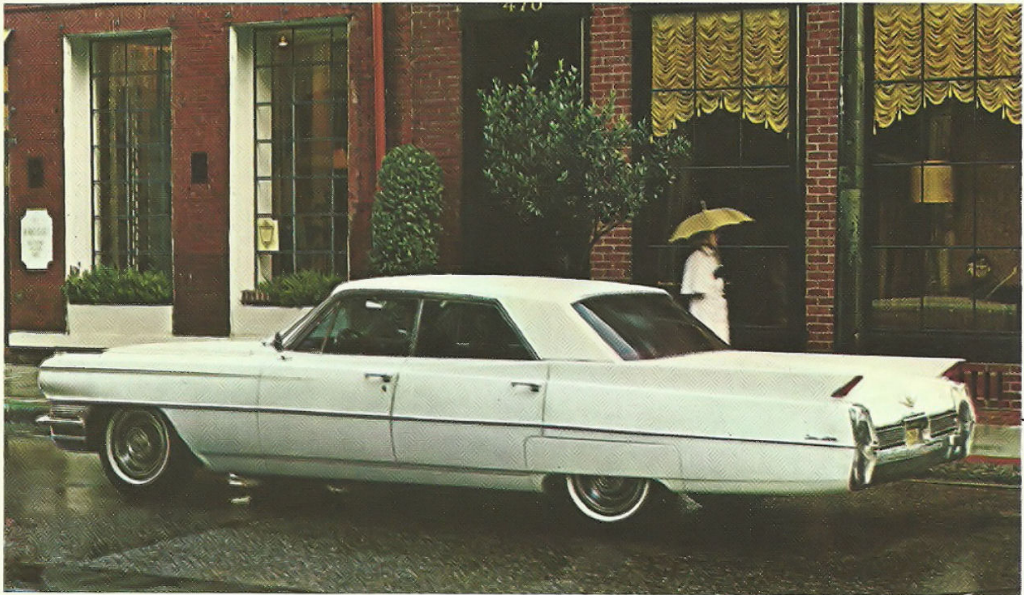
1964 Sedan deVille

1964 Two major Cadillac features were introduced this year—the Turbo Hydra-Matic transmission, which is now standard on all Cadillacs, and the automatic control of both heating and air conditioning with a single setting of the thermostat dial.