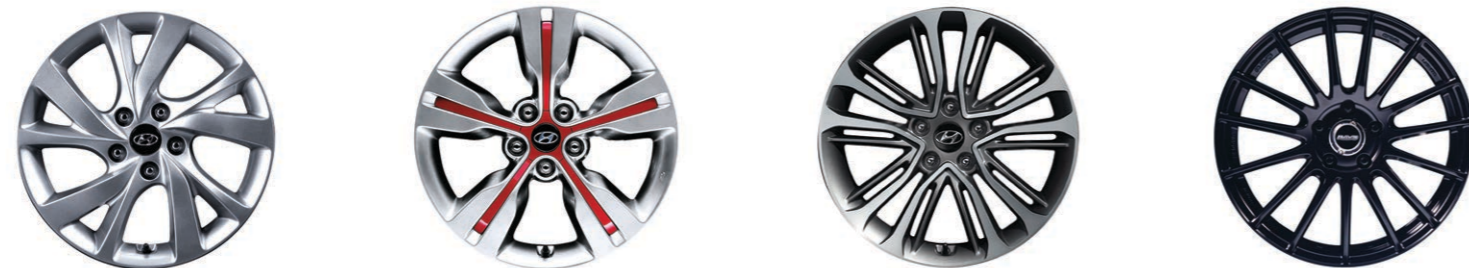
17" Alloy Wheel Base 18" Alloy Wheel Non-Turbo Style and Tech Package 18" Alloy Wheel Turbo 18" RAYS® Alloy Wheel Rally Edition