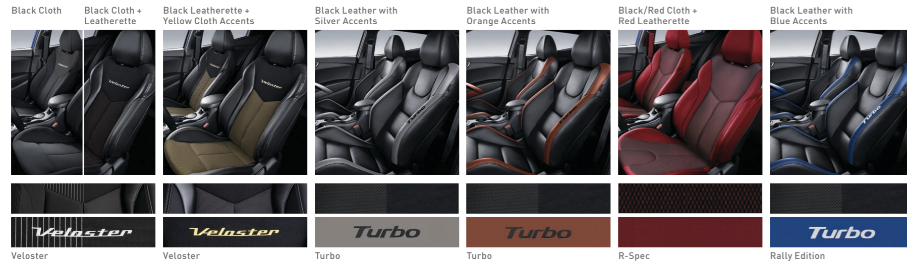
Veloster Veloster 26.2 Yellow/Triathlon Gray/ Ultra Black only Turbo Turbo Ultra Black/Vitamin C only R-Spec Rally Edition