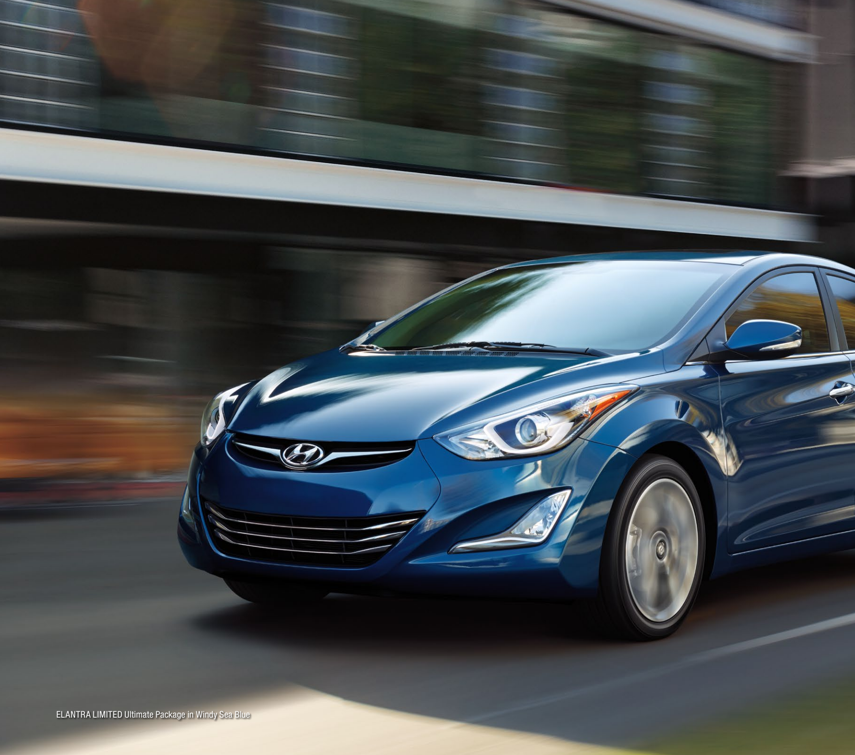
ELANTRA LIMITED Ultimate Package in Windy Sea Blue