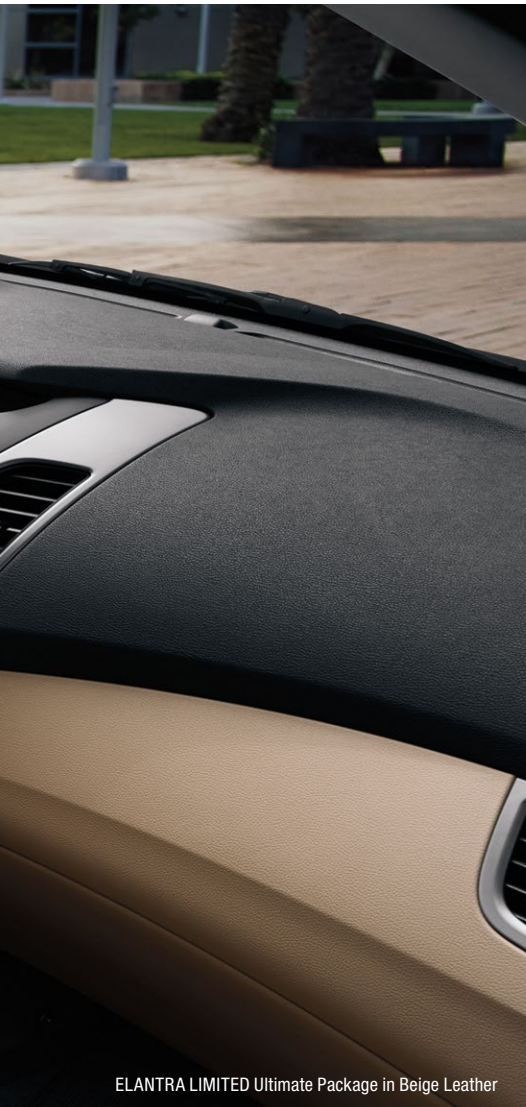
ELANTRA LIMITED Ultimate Package in Beige Leather