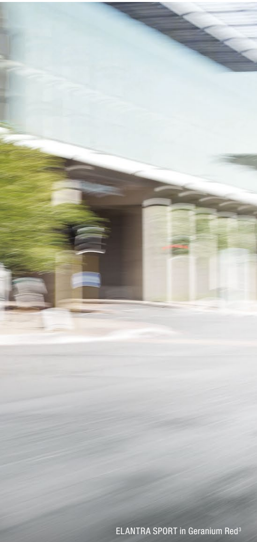
ELANTRA SPORT in Geranium Red 3