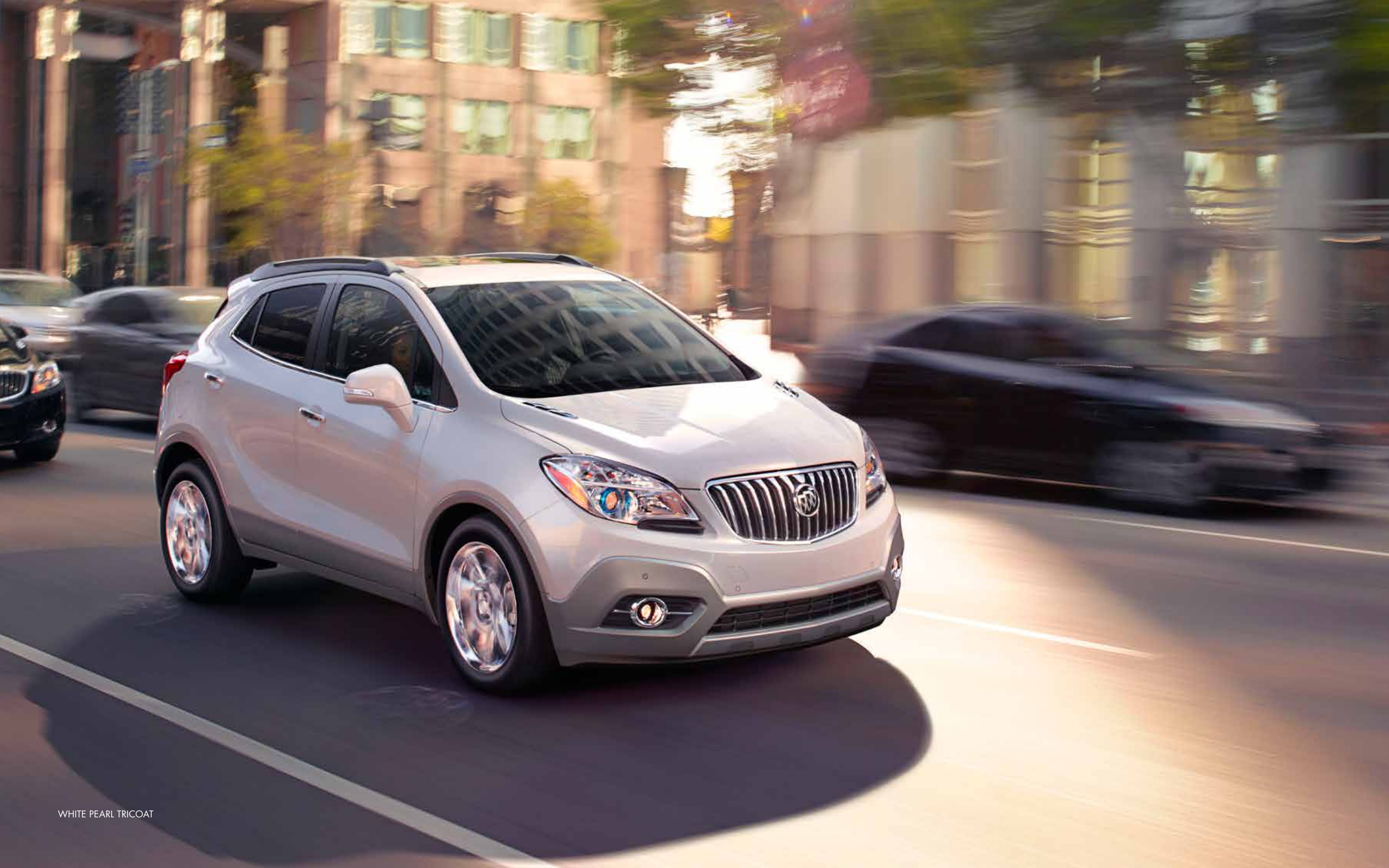
WHITE PEARL TRICOAT