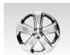
RNI 18" CAST ALUMINUM, PAINTED (STANDARD)