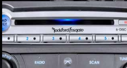
650-watt Rockford Fosgate ® Audio System

The Eclipse isn't just a blast to drive. With six standard airbags 2 , a rear-view camera system and hands-free Bluetooth ® it has the safety features you demand and the extra touches you absolutely can't live without.