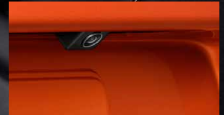
Rear-view Backup Camera