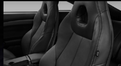
Heated Leather Seats