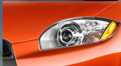
HID Projector-type Headlamps