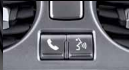
Bluetooth ® Hands-Free System