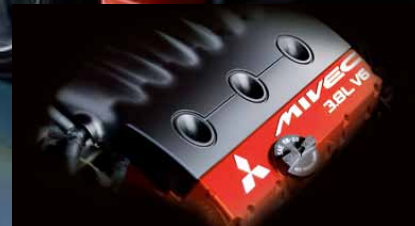
Fuel-efficient MIVEC Engine