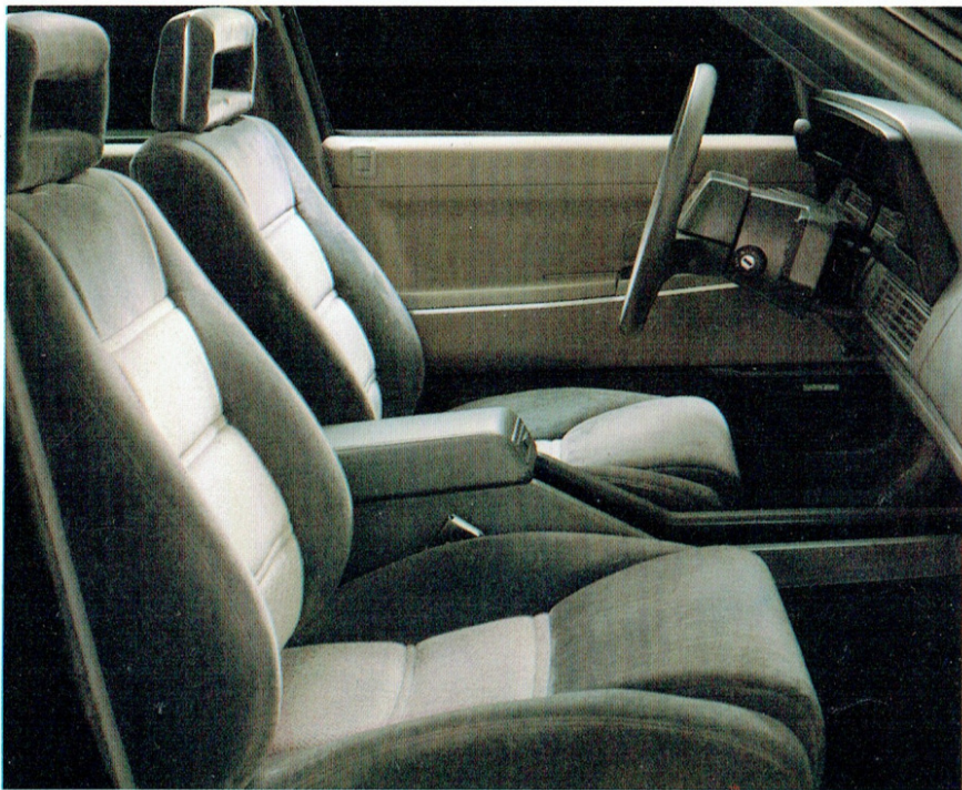
Premier's spacious interior (shown in ES trim) offers best-in-class legroom for front and rear passengers.

Premier. Aply named because it's the first in a new line of sophisticated automobiles: Eagle from Chrysler. Emerging over the next few years will be an entire series of cars carrying the Eagle brand. Cars that are