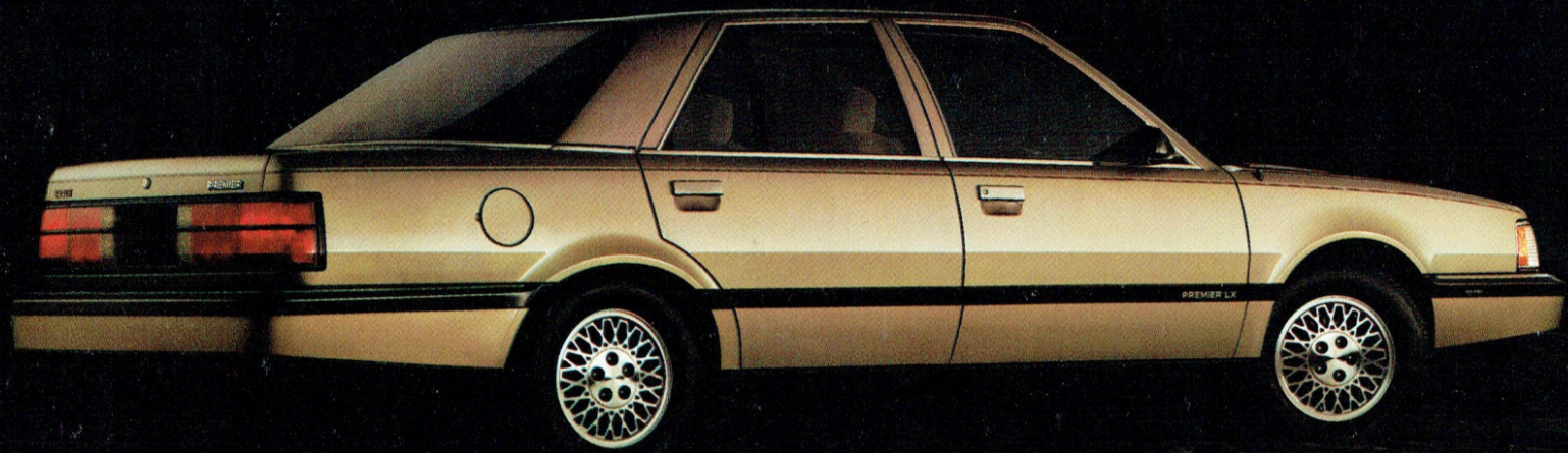
Eagle Premier LX