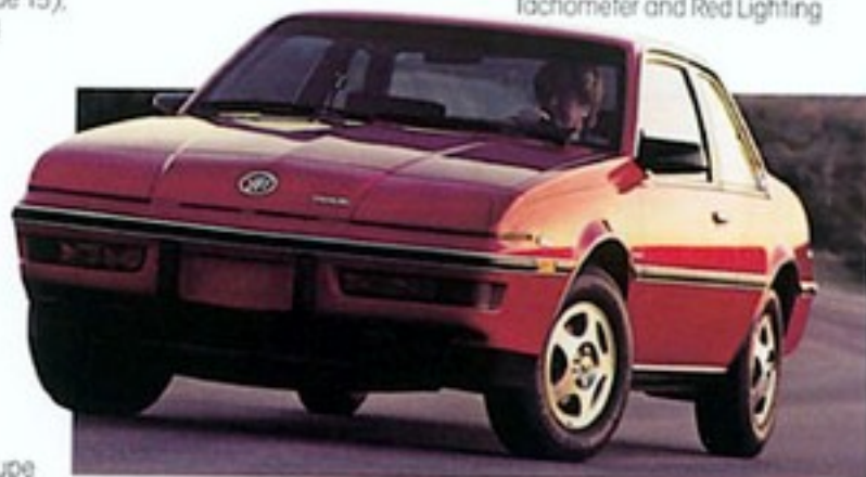
Skyhawk Limited Coupe