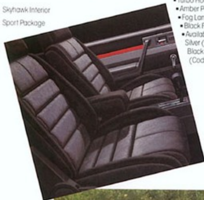
Skyhawk Interior Sport Package