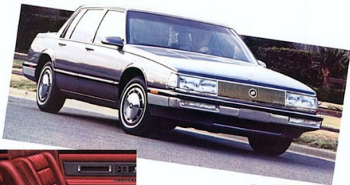
Electra Limited Sedan