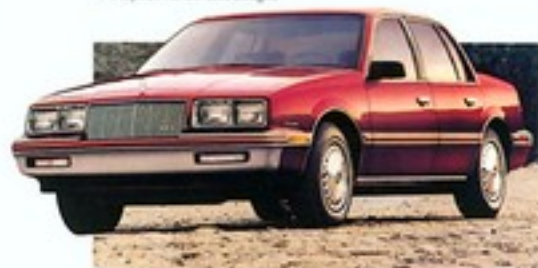
Skylark Custom Sedan