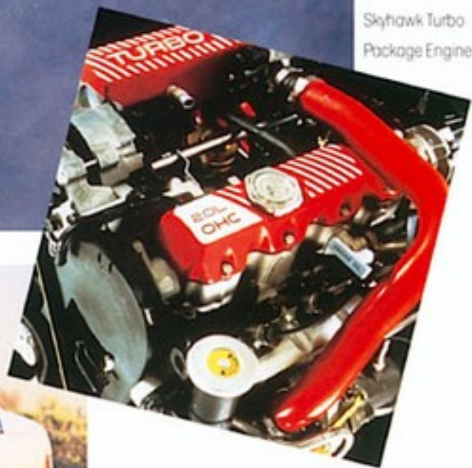
Skyhawk Turbo Package Engine