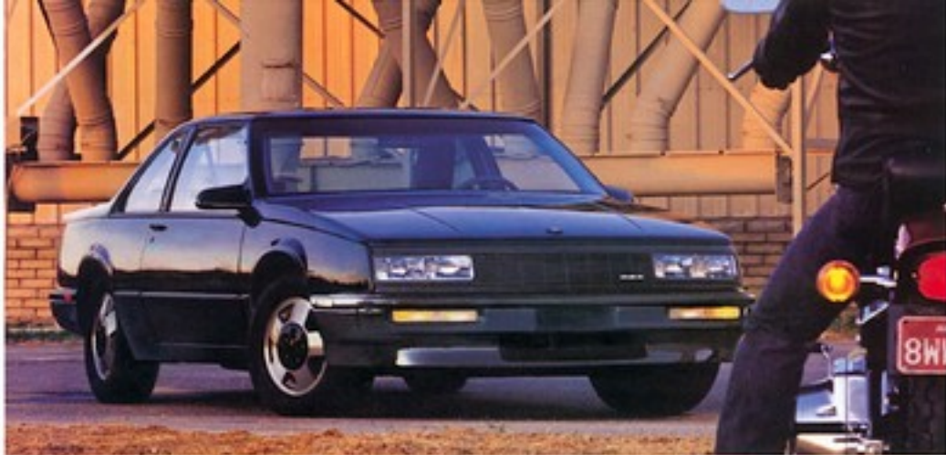
LeSabre T Type