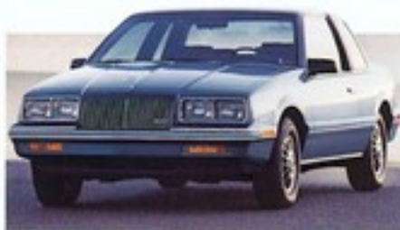
Somerset Limited Coupe