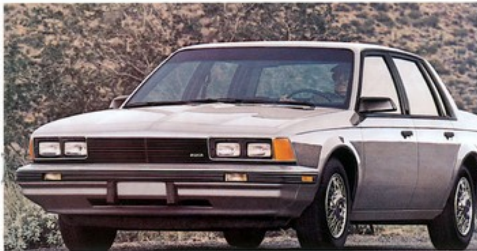
Century Limited with Exterior Sport Package