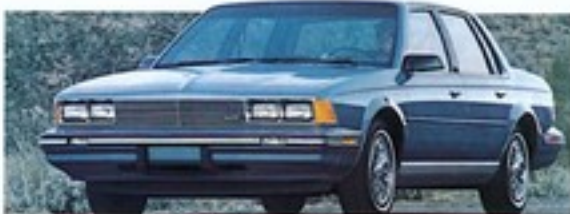
Century Limited Sedan