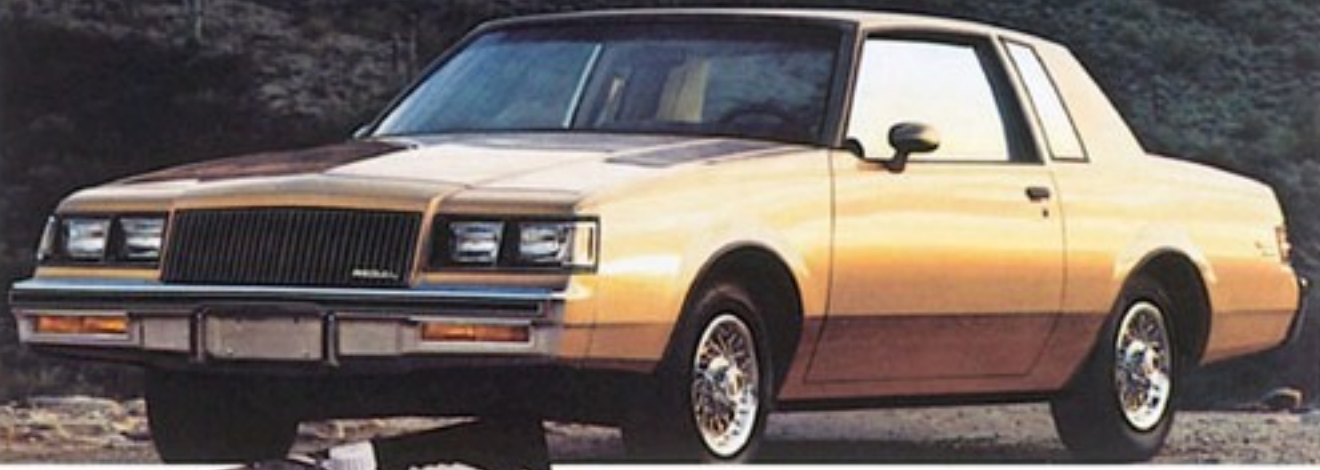
Regal Limited with Exterior Sport Package