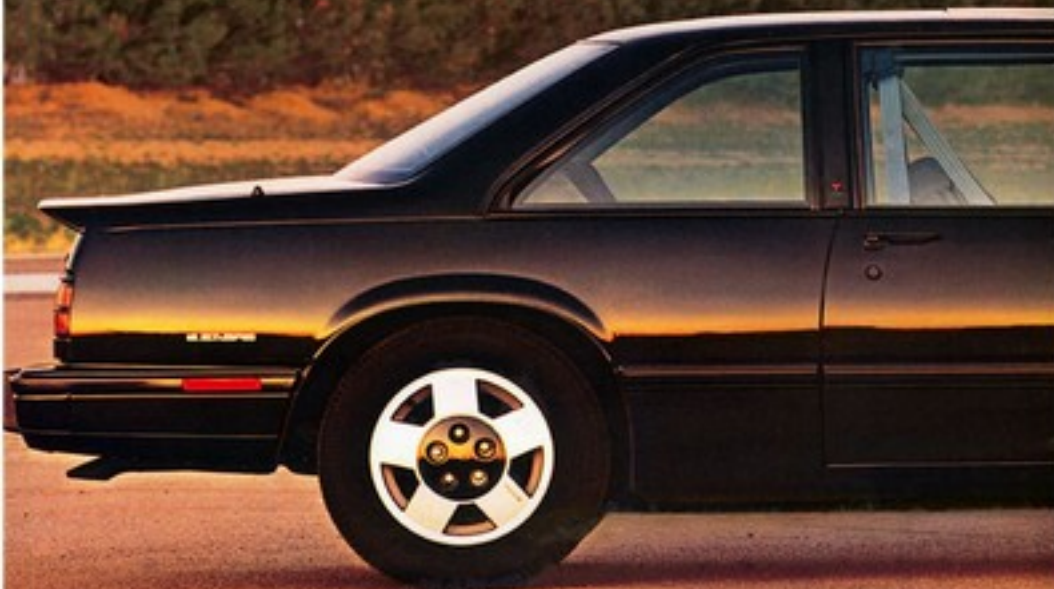
LeSabre T Type