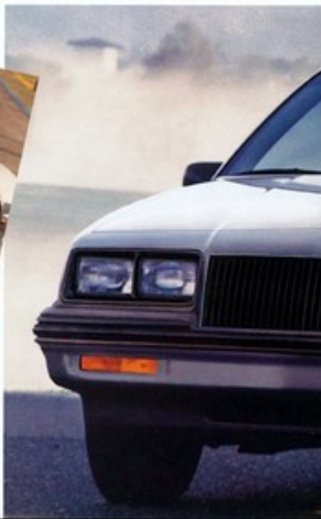
Somerset Limited with T Package and Exterior Sport Package