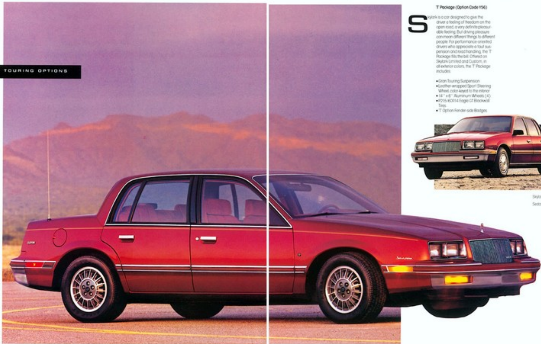
Skylark with T Package