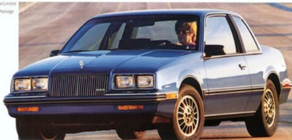
Somerset Limited with T Package