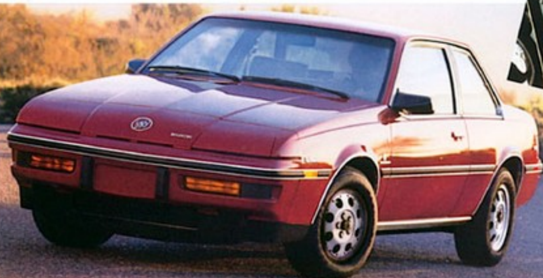
Skyhawk Limited with T Package