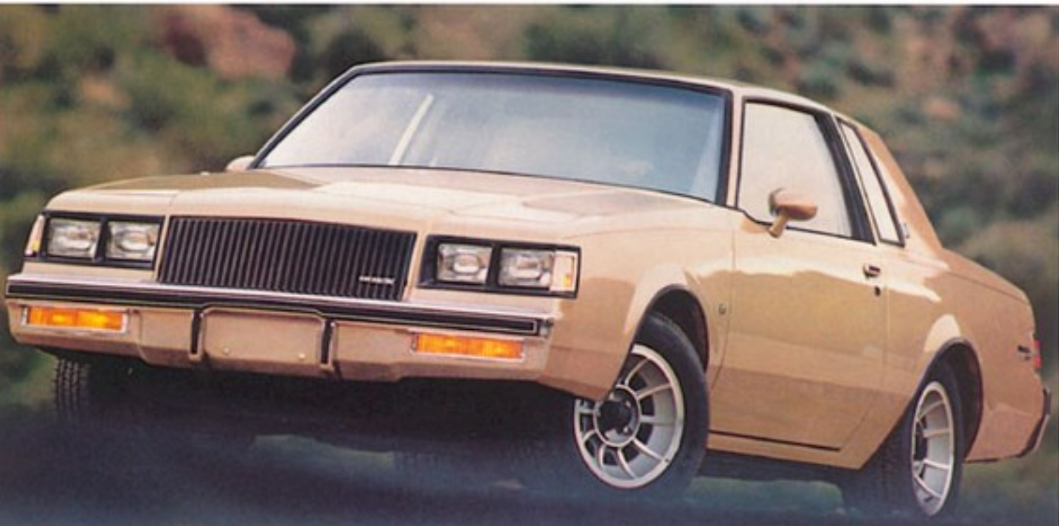
Regal Limited with T Package and Exterior Sport Package