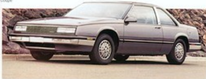
LeSabre Limited Coupe