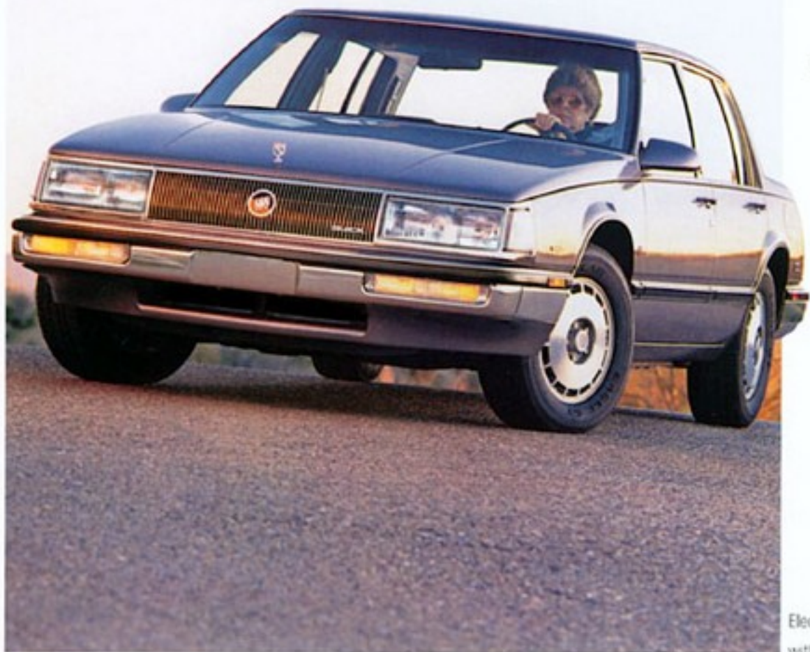
Electra Limited with T Package