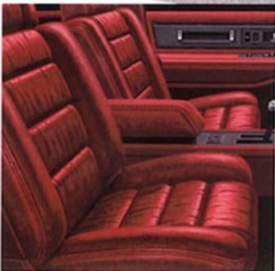
T Type Interior