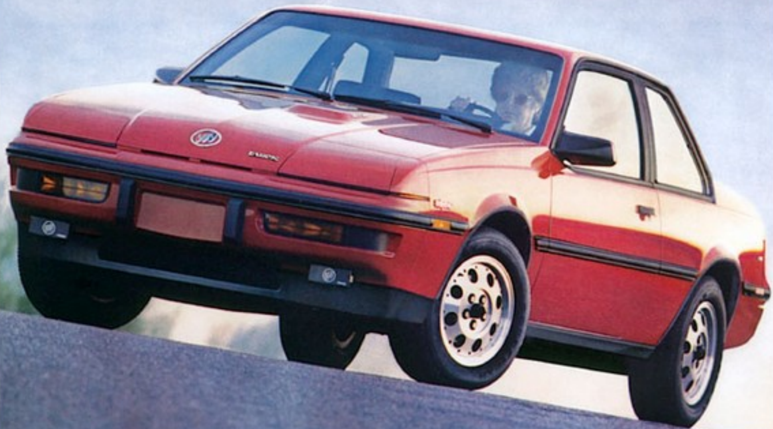
Skyhawk Limited with Turbo Package