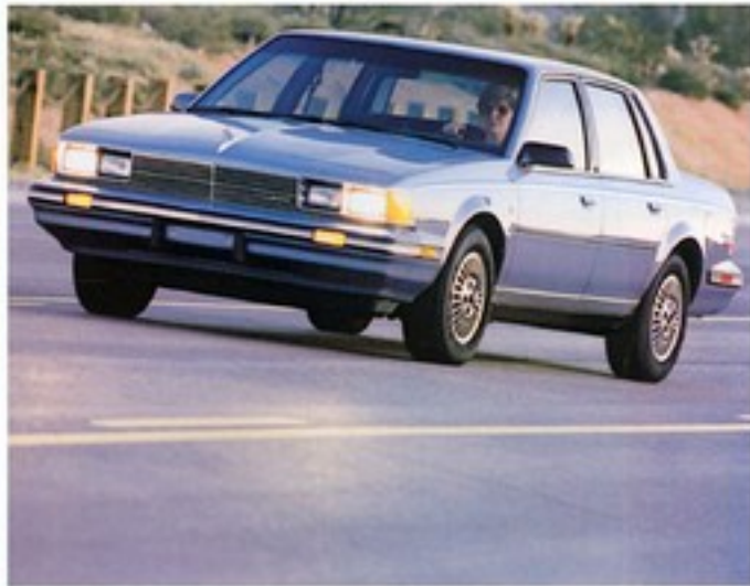
Century Limited with T Package