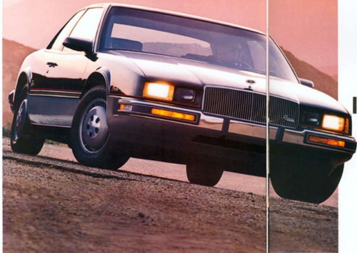
Riviera T Type