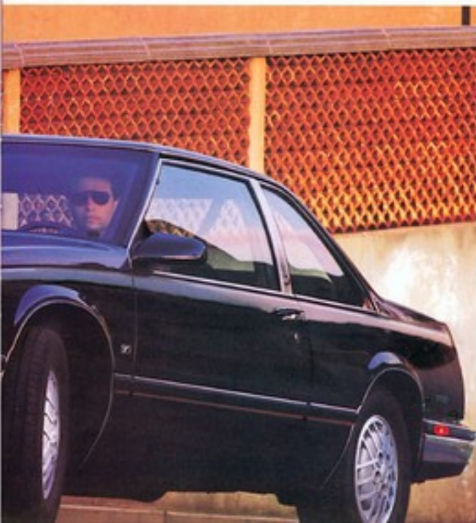
LeSabre Limited with T Package