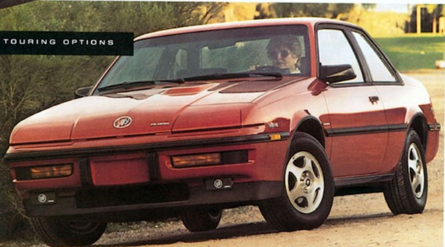
Skyhawk Limited with Exterior Sport Package