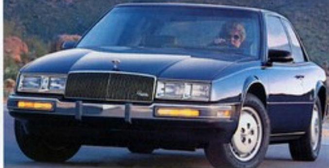
T Package (Option Code 156)

Performance, car ride and handling are what you have in mind, and the Riviera T Type does not quite fit your individual bill, you might consider the T Package. It gives you the performance characteristics you are looking for and offers you other color and trim options as well. Included in the T Package available for Riviera are the following features: