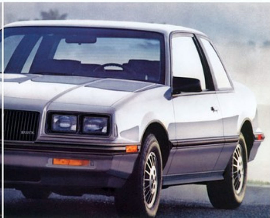
Somerset Limited with Exterior Sport Package