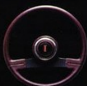
Available sport steering wheel further enhances the Toronado driving experience.