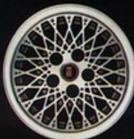
Available aluminum sport wheel.