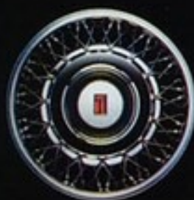
Available wire wheel discs.