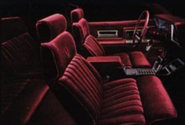
Available contoured reclining bucket seats and console with floor shifter.