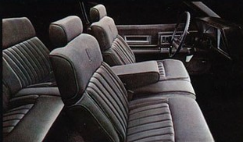
Standard divided 55/45 front seats with center armrest and seat back recliners.†

When you experience it, you will understand, and you will applaud it. Experience it soon. It is a drive that should not be missed.