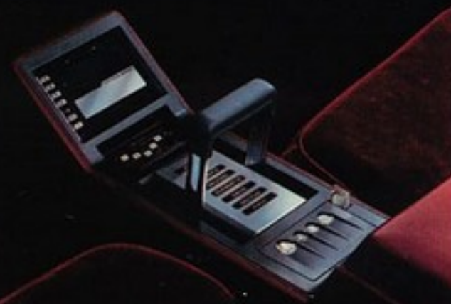
Available sport console with shifter and rotating holder for coins, cup and audio cassettes.