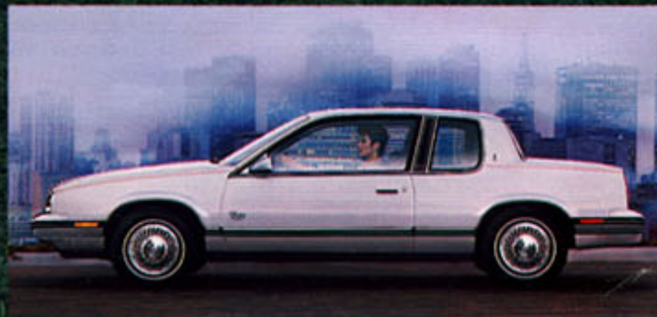
CALAIS SUPREME COUPE

It's this simple. Calais is built smart. It's designed and assembled using some of the most advanced high-tech automotive facilities ever. It's styled for sleek, good looks. Aerodynamics. And practical, five-passenger comfort. And it's equipped for performance, with the "Tech IV" 2.5-liter electronically fuel-injected engine, 5-speed manual transmission or optional 3-speed automatic, front-wheel drive, rack-and-pinion steering and MacPherson strut suspension. There's even an available 3.0-liter V6 with response-adding multiport fuel injection. Plus, Calais now comes in an all-new 4-door sedan. Calais is smart, alright. But get behind the wheel and you forget all about "smart" and "affordable." All you remember is the fun!