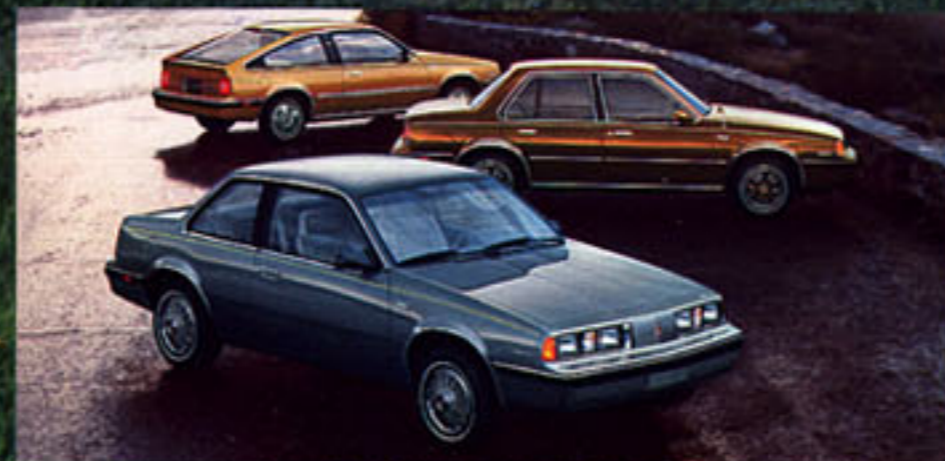
FIRENZA COUPE, SEDAN AND FIRENZA S HATCHBACK COUPE