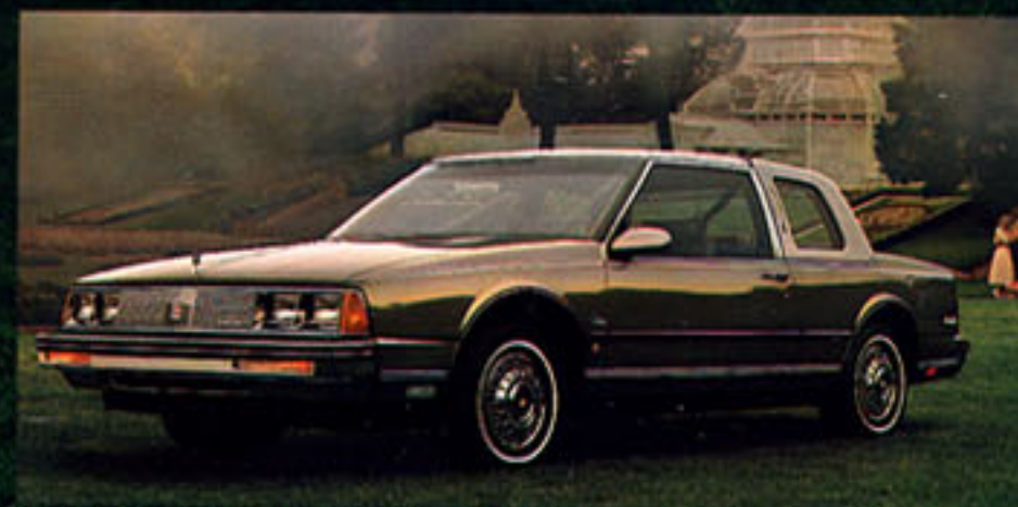
NINETY-EIGHT REGENCY BROUGHAM COUPE