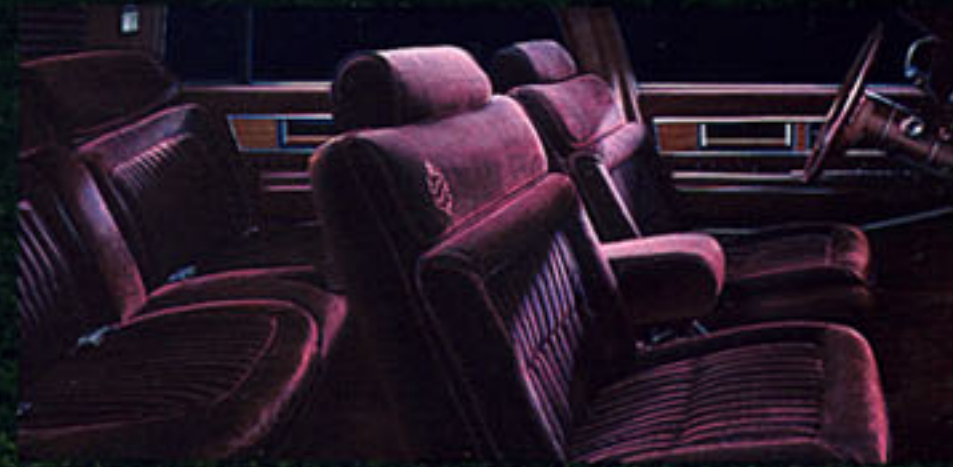
NINETY-EIGHT REGENCY BROUGHAM INTERIOR

Ninety-Eight owners share something in common. They share a highly developed sense of appreciation for elegance and luxury in the cars they drive. They want it all. Impressive lines. Opulent interiors. Impeccable detailing. All! They want technology. And Ninety-Eight offers the most exciting electronics available. (Even a voice information reminder system.) Ride! Precise road management! Performance! Sequential port fuel-injected V6! Standard equipment! Everything from Four-Season air conditioning to a host of power features. All told, whether Ninety-Eight Regency or Regency Brougham, sedan or coupe, this is the perfect marriage of logic and luxury—the "thinking person's" luxury car.