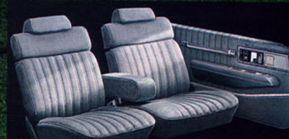
DELTA 88 ROYALE INTERIOR