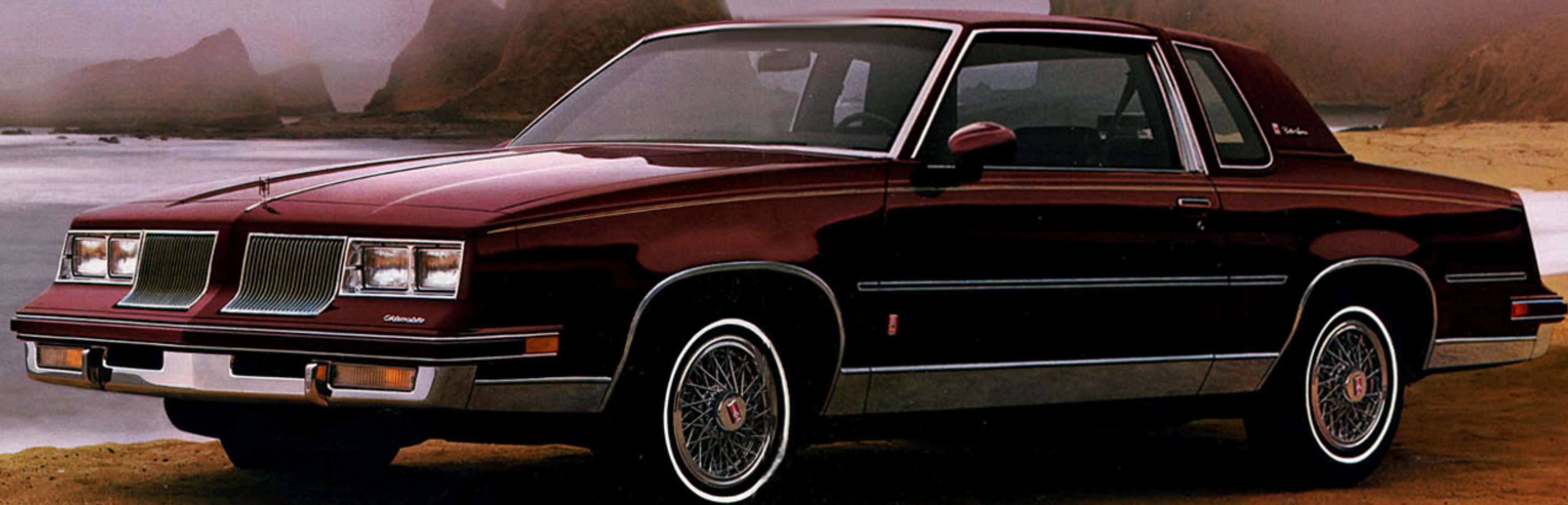
CUTLASS SUPREME BROUGHAM COUPE

Your travel outlook never looked as good as it does when you arrive in a Cutlass Supreme. Coupe or sedan, each Cutlass Supreme is a pleasure to drive. Inside, the quiet and comfortable environment is enhanced by rich, velour, first-class seating for six. For road performance, why not opt for the powerful 5.0-liter 4-barrel V8 in Cutlass Supreme Brougham—then step on the pedal and take control. The ride is quiet and smooth. The result of power-steering, power brakes, automatic transmission and so much more—all standard. Then choose from the long list of available features, such as Tilt-Wheel steering, Cruise Control and special Delco-GM sound systems. Cutlass Supreme. It's always great to go first class.