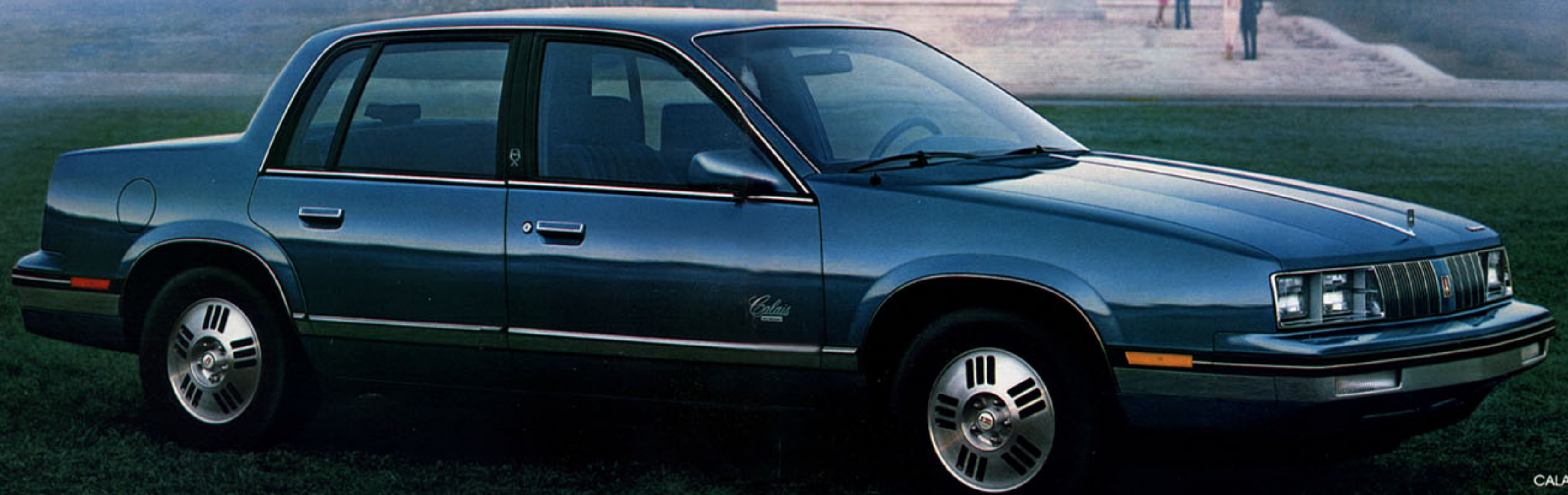
CALAIS SUPREME SEDAN

It's this simple. Calais is built smart. It's designed and assembled using some of the most advanced high-tech automotive facilities ever. It's styled for sleek, good looks. Aerodynamics. And practical, five-passenger comfort. And it's equipped for performance, with the "Tech IV" 2.5-liter electronically fuel-injected engine, 5-speed manual transmission or optional 3-speed automatic, front-wheel drive, rack-and-pinion steering and MacPherson strut suspension. There's even an available 3.0-liter V6 with response-adding multiport fuel injection. Plus, Calais now comes in an all-new 4-door sedan. Calais is smart, alright. But get behind the wheel and you forget all about "smart" and "affordable." All you remember is the fun!