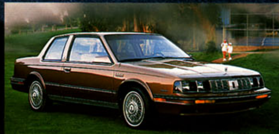
CUTLASS CIERA BROUGHAM COUPE