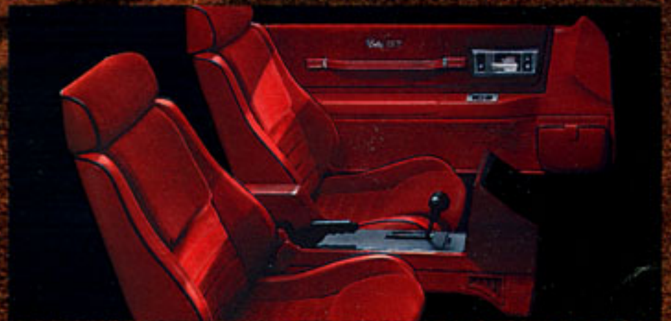
CALAIS GT INTERIOR

Country bends. Fast lanes. City streets. You name it, Calais GT is ready. READY. With the road-gripping handling of 14" Eagle GTs and Oldsmobile's firm Level III suspension system. READY. With a driver's cockpit of velour front bucket seats, Rallye instrument cluster and leather steering wheel. READY. To turn heads with the hot good looks of low-ride fascia and aero-rocker moldings, bold composite headlamps and an illusive front grille. READY. With the road machine response of an electronic fuel-injected 2.5-liter engine and 5-speed. Or opt for the power-producing 3.0-liter multiport fuel-injected V6/automatic transmission combination. Calais GT. Built tough. Tight. Ready for performance. Now... are you ready for all that?