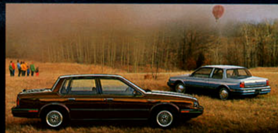
CUTLASS CIERA SEDAN AND COUPE