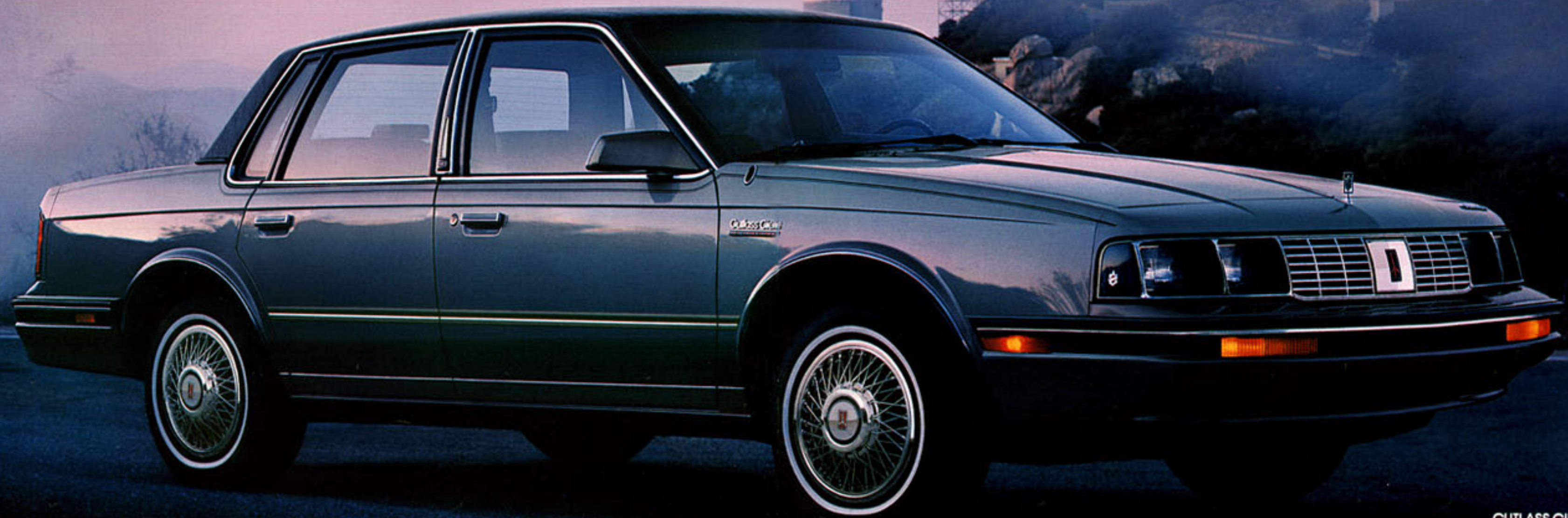
CUTLASS CIERA BROUGHAM SEDAN

When specialists design a car so thoroughly correct... it can only be a winner. For example, Cutlass Ciera and Cutlass Ciera Brougham—they're not only a technological marvel, they're marvelous to look at and fun to drive. Created with state-of-the-art computers. Manufactured by smart minds using advanced robotics for precise fit and finish. And the quality shows, especially in the ride. MacPherson strut suspension and rack-and-pinion steering, coupled with steel-belted radial tires, iron out the road. And for performance... a 2.5-liter electronically fuel-injected engine is standard, with a 2.8-liter V6 available. Inside and out, this is style, technology and performance at the top of its class.