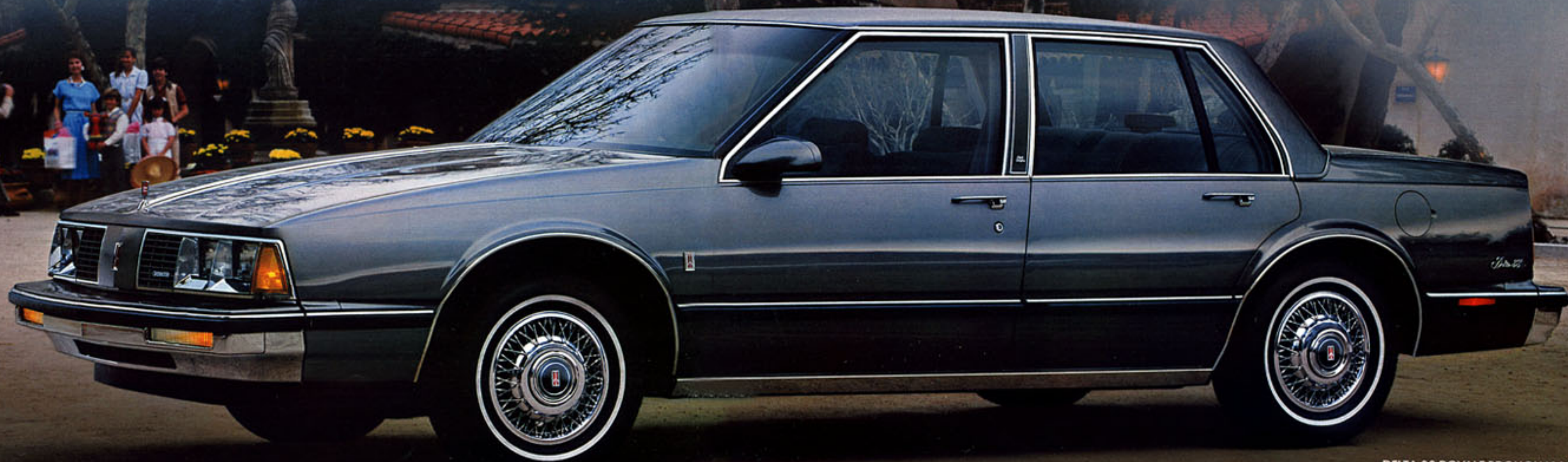
DELTA 88 ROYALE BROUGHAM SEDAN

To improve a car as popular as the Delta 88 Royale Brougham Sedan was a challenge. Take styling. We changed it for 1986. But only after we made sure it was sleeker, more attractive, more aerodynamic. Take interior room. Delta 88 owners insist on plenty of headroom, hiproom and legroom. For six. So we kept roominess in mind. Then, for smooth ride and easy handling, we added front-wheel drive, rack-and-pinion steering and four-wheel independent suspension. We even made electronic load levelers available. And so it went. Improved support in full-foam seats. Improved corrosion resistance features. Improved interior luxury and acoustics. Delta 88 Royale Brougham Sedan—it'll make you smile.