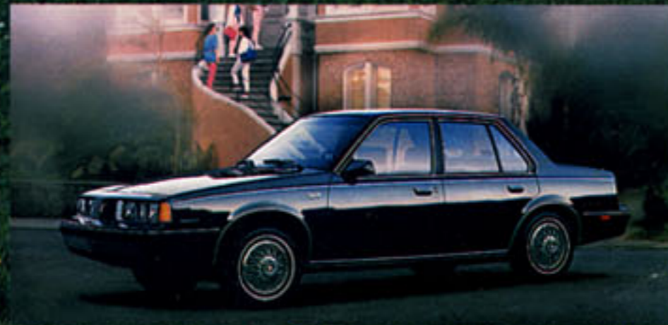
FIRENZA LX SEDAN

Work hard. Drive easy. Few bodies are so well prepared for today's active days—and nights. The exception? The Firenza lineup of Oldsmobiles. Each one with fuel-injected performance plus front-wheel drive and MacPherson front suspension for quick, agile handling that's just plain fun to be with. And the stylish good looks of these Firenzas will rub off—making you look good in the bargain. You'll be indulged by plenty of rewarding Firenza touches and sporty standard equipment. And tempted by a special list of smart, available options. There's even a super-sporty GT hatchback coupe—for extra "hot" good looks. Best of all, as the most affordable of Oldsmobiles, Firenza is one great shape that's easy to get into.