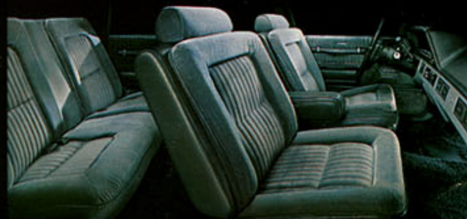
CUTLASS CIERA BROUGHAM INTERIOR

When specialists design a car so thoroughly correct... it can only be a winner. For example, Cutlass Ciera and Cutlass Ciera Brougham—they're not only a technological marvel, they're marvelous to look at and fun to drive. Created with state-of-the-art computers. Manufactured by smart minds using advanced robotics for precise fit and finish. And the quality shows, especially in the ride. MacPherson strut suspension and rack-and-pinion steering, coupled with steel-belted radial tires, iron out the road. And for performance... a 2.5-liter electronically fuel-injected engine is standard, with a 2.8-liter V6 available. Inside and out, this is style, technology and performance at the top of its class.