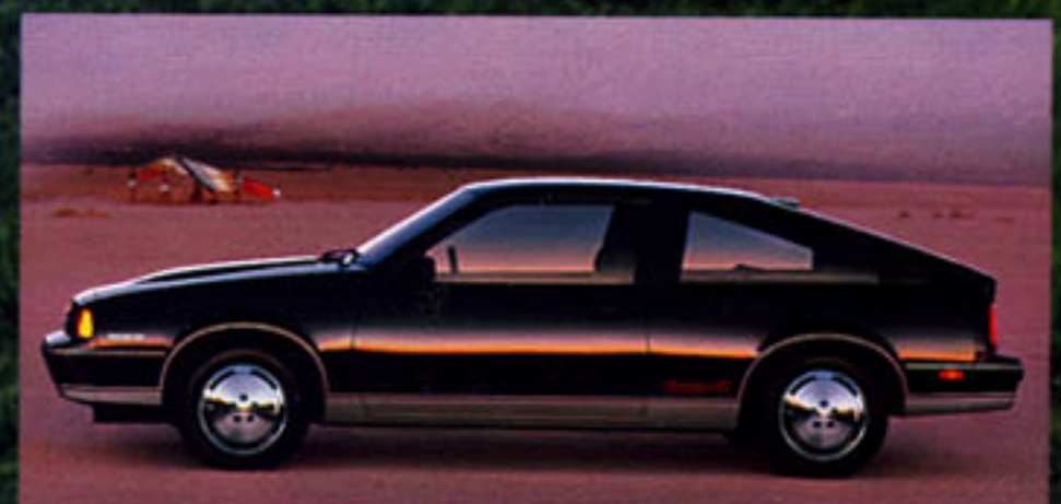
FIRENZA GT HATCHBACK COUPE