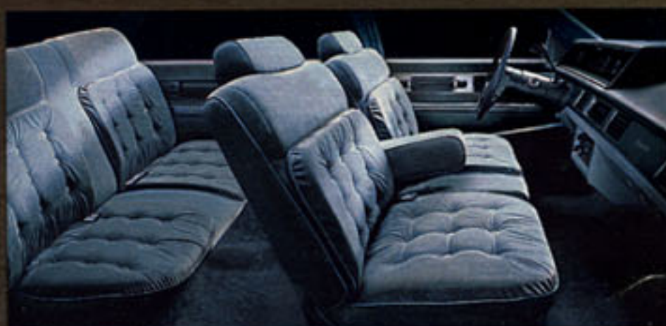
DELTA 88 ROYALE BROUGHAM INTERIOR

To improve a car as popular as the Delta 88 Royale Brougham Sedan was a challenge. Take styling. We changed it for 1986. But only after we made sure it was sleeker, more attractive, more aerodynamic. Take interior room. Delta 88 owners insist on plenty of headroom, hiproom and legroom. For six. So we kept roominess in mind. Then, for smooth ride and easy handling, we added front-wheel drive, rack-and-pinion steering and four-wheel independent suspension. We even made electronic load levelers available. And so it went. Improved support in full-foam seats. Improved corrosion resistance features. Improved interior luxury and acoustics. Delta 88 Royale Brougham Sedan—it'll make you smile.