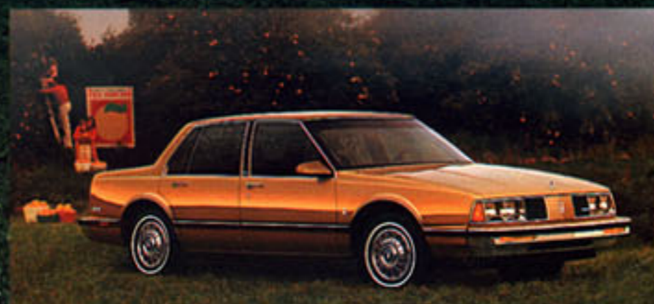
DELTA 88 ROYALE SEDAN

This year, Delta 88 has a whole new game plan for America's families—more exciting, more attractive, more durable. To do it, we put together a whole new team. Front-wheel drive for sure tracking. The quick reflexes of rack-and-pinion steering. Four-wheel independent suspension to block out bumps. And we didn't stop there. We added a smooth-running 3.0-liter V6 with multiport fuel injection and a 4-speed automatic overdrive transmission. For extra kick, there's an available 3.8-liter V6 with sequential port fuel injection. And, of course, elegant interior comfort for six. The unique, distinctively styled Delta 88 Royale and Royale Brougham—sedans and the all-new coupe—just the car for an All-American family like yours.