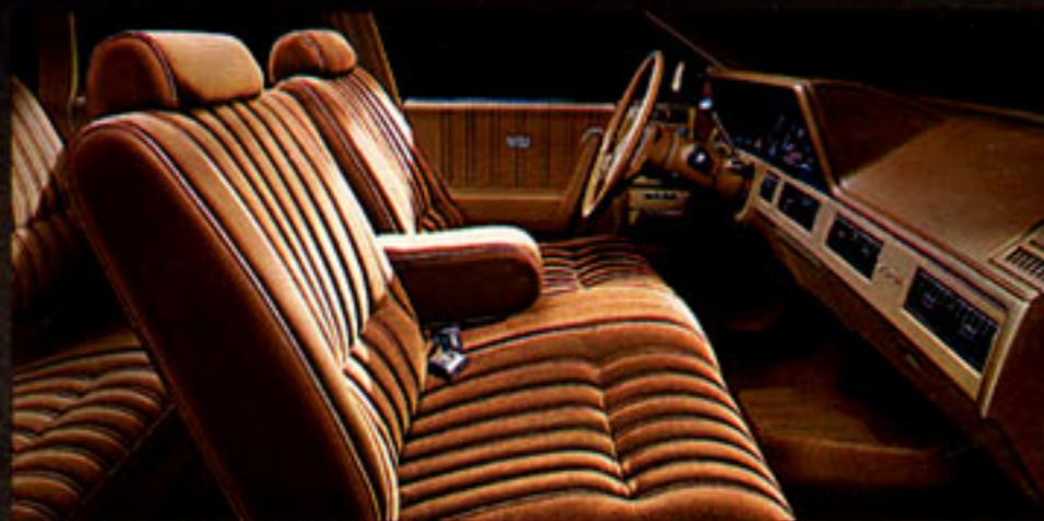
CUTLASS CRUISER INTERIOR

No matter what you do, there's an Olds Cruiser to carry your day beautifully. Custom Cruiser...with 87.2 cubic feet of cargo space. Underfloor storage. An available fold-down third seat so you can carry eight. And a 4-barrel 5.0-liter V8 with 4-speed automatic overdrive transmission. There's also the responsive, front-wheel drive Cutlass Cruiser. 74.4 cubic feet for cargo. Plus a long list of standard and available features. And for affordability...Firenza Cruiser. A one-piece tailgate for easy loading. Front-wheel drive and all-season steel-belted tires for handling. And electronically fuel-injected spirit to move you—work or play. The practical, comfortable Cruisers. Custom, Cutlass or Firenza...first it's an Olds, then it's a wagon.