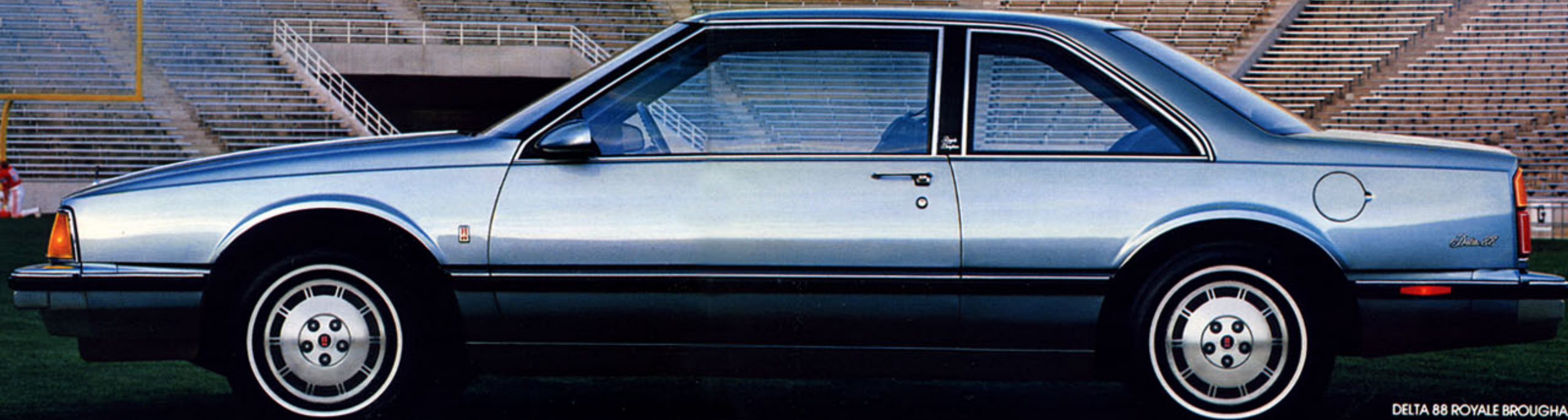
DELTA 88 ROYALE BROUGHAM COUPE

This year, Delta 88 has a whole new game plan for America's families—more exciting, more attractive, more durable. To do it, we put together a whole new team. Front-wheel drive for sure tracking. The quick reflexes of rack-and-pinion steering. Four-wheel independent suspension to block out bumps. And we didn't stop there. We added a smooth-running 3.0-liter V6 with multiport fuel injection and a 4-speed automatic overdrive transmission. For extra kick, there's an available 3.8-liter V6 with sequential port fuel injection. And, of course, elegant interior comfort for six. The unique, distinctively styled Delta 88 Royale and Royale Brougham—sedans and the all-new coupe—just the car for an All-American family like yours.