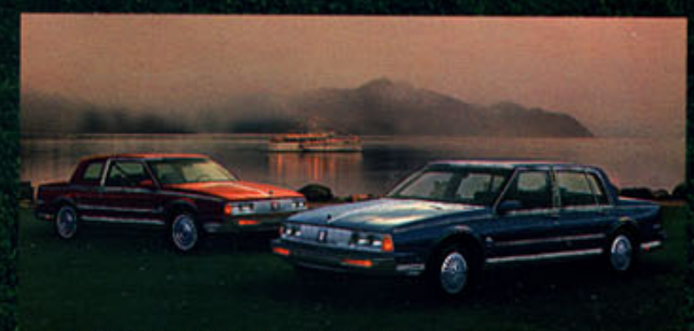
NINETY-EIGHT REGENCY SEDAN AND COUPE