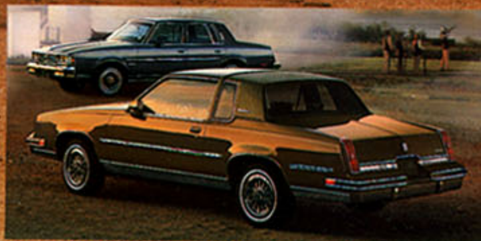
CUTLASS SUPREME COUPE AND SEDAN