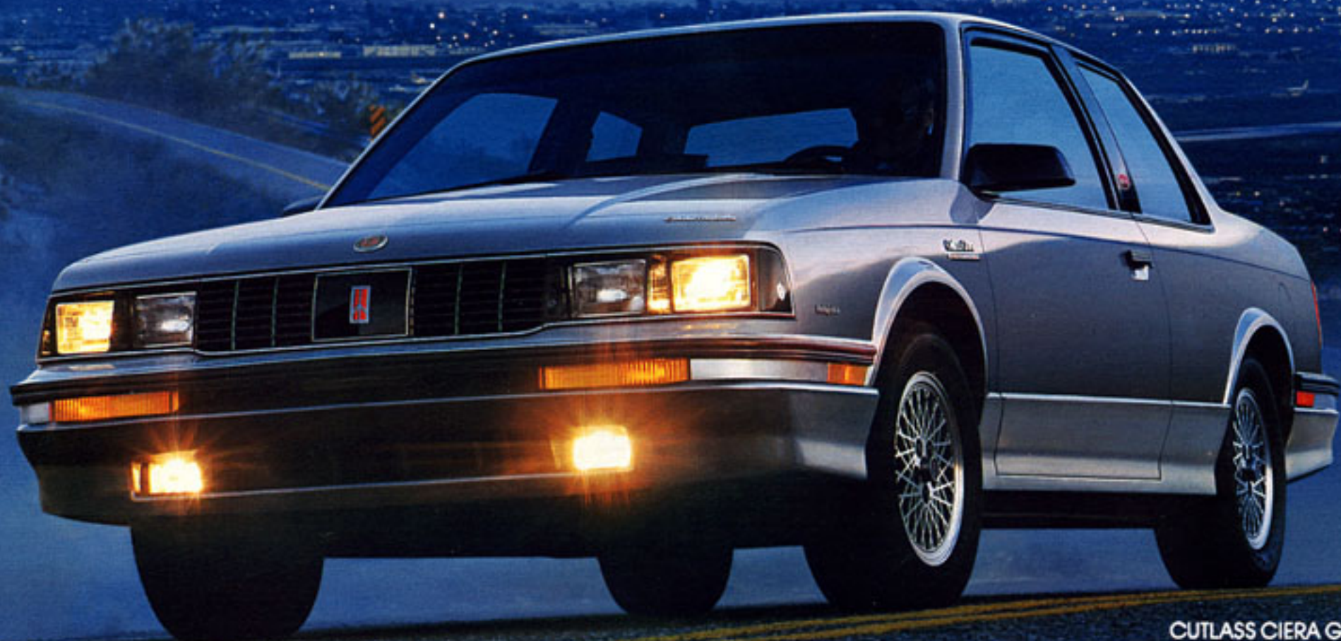
CUTLASS CIERA GT

Cutlass Ciera GT's performance tells you it's a driver's car. Its ground hugging, road-handling capabilities inform you it's a very special Oldsmobile. For starters, GT's high-energy ignition system fires up a 3.8-liter sequential port fuel-injected V6 engine. Next, put its floor-mounted console shifter—linked to a 4-speed automatic overdrive transmission—into gear. Then, take hold of the leather-wrapped steering wheel and get set for Ciera GT excitement...it's sure to quicken your pulse. And there's more! Form-fitting reclining bucket seats, Level III handling suspension, 14" Eagle GT tires and one sporty GT feature after another—inside and out. Ciera GT. It'll raise your standard of driving as it raises your pulse.