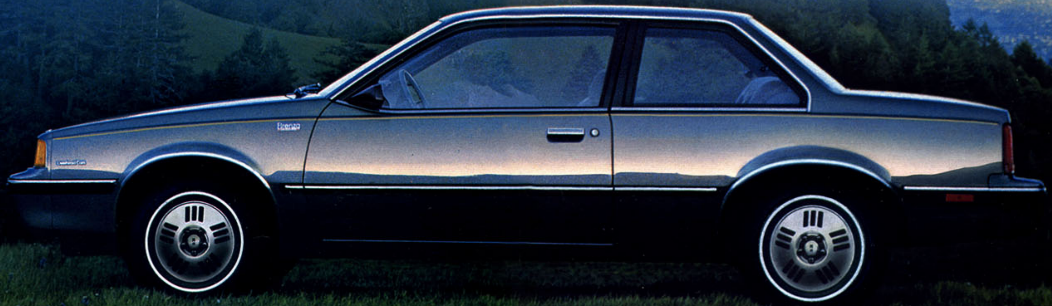
FIRENZA LC COUPE

Work hard. Drive easy. Few bodies are so well prepared for today's active days—and nights. The exception? The Firenza lineup of Oldsmobiles. Each one with fuel-injected performance plus front-wheel drive and MacPherson front suspension for quick, agile handling that's just plain fun to be with. And the stylish good looks of these Firenzas will rub off—making you look good in the bargain. You'll be indulged by plenty of rewarding Firenza touches and sporty standard equipment. And tempted by a special list of smart, available options. There's even a super-sporty GT hatchback coupe—for extra "hot" good looks. Best of all, as the most affordable of Oldsmobiles, Firenza is one great shape that's easy to get into.