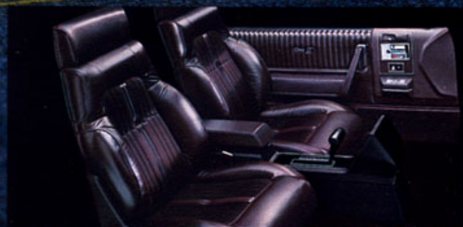
CUTLASS CIERA GT INTERIOR

Cutlass Ciera GT's performance tells you it's a driver's car. Its ground hugging, road-handling capabilities inform you it's a very special Oldsmobile. For starters, GT's high-energy ignition system fires up a 3.8-liter sequential port fuel-injected V6 engine. Next, put its floor-mounted console shifter—linked to a 4-speed automatic overdrive transmission—into gear. Then, take hold of the leather-wrapped steering wheel and get set for Ciera GT excitement...it's sure to quicken your pulse. And there's more! Form-fitting reclining bucket seats, Level III handling suspension, 14" Eagle GT tires and one sporty GT feature after another—inside and out. Ciera GT. It'll raise your standard of driving as it raises your pulse.