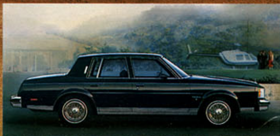
CUTLASS SUPREME BROUGHAM SEDAN

Your travel outlook never looked as good as it does when you arrive in a Cutlass Supreme. Coupe or sedan, each Cutlass Supreme is a pleasure to drive. Inside, the quiet and comfortable environment is enhanced by rich, velour, first-class seating for six. For road performance, why not opt for the powerful 5.0-liter 4-barrel V8 in Cutlass Supreme Brougham—then step on the pedal and take control. The ride is quiet and smooth. The result of power-steering, power brakes, automatic transmission and so much more—all standard. Then choose from the long list of available features, such as Tilt-Wheel steering, Cruise Control and special Delco-GM sound systems. Cutlass Supreme. It's always great to go first class.