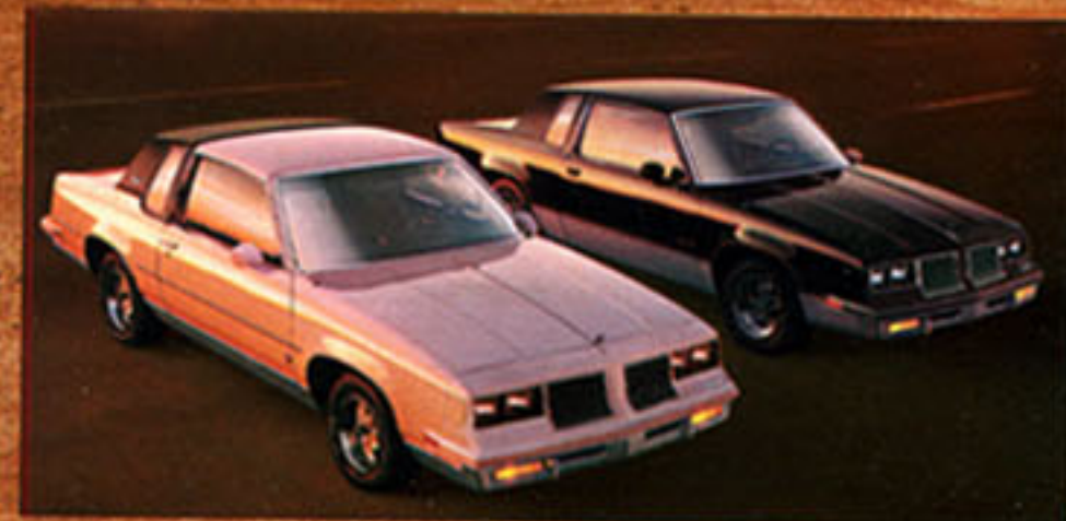
CUTLASS SALON AND CUTLASS 442