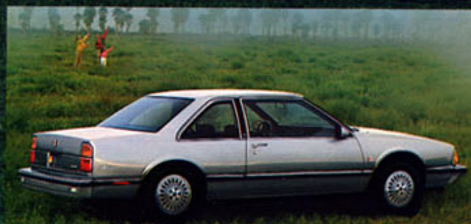
DELTA 88 ROYALE COUPE