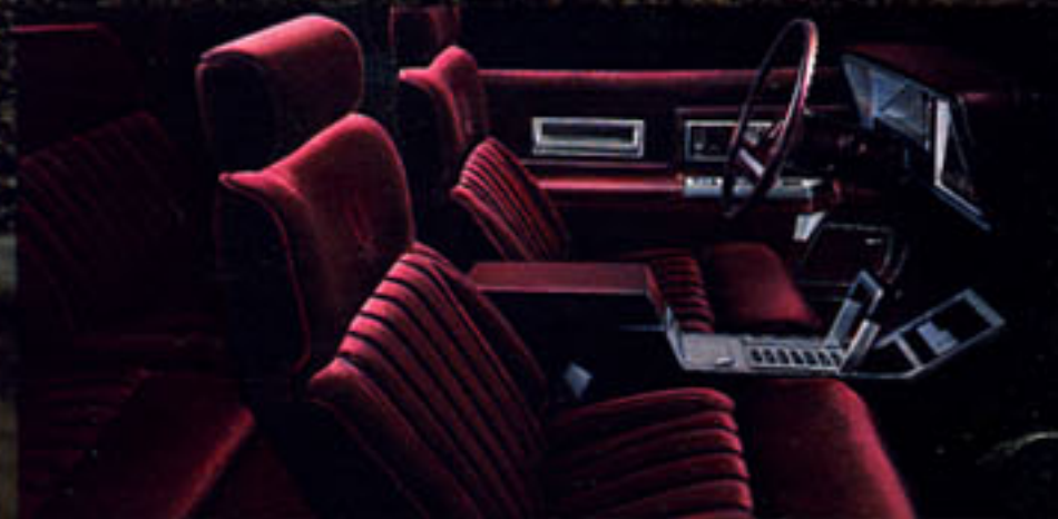
TORONADO BROUGHAM INTERIOR

Once in a generation comes a car so unique, so personal, it stands alone. When Oldsmobile first introduced the Toronado twenty years ago, it was the world's first personal luxury coupe... a category of one. Now, with this striking new shape and innovative technology, Toronado redefines the category and it is again... a category of one. This is the shape of luxury and performance. The result of new, ground-breaking engineering excellence. This is world-class roadability and response... with a standard 3.8-liter sequentially fuel-injected V6, front-wheel drive, four-wheel independent suspension and a drag coefficient of just .36. This is the Toronado personal luxury coupe... once again, a category of one.