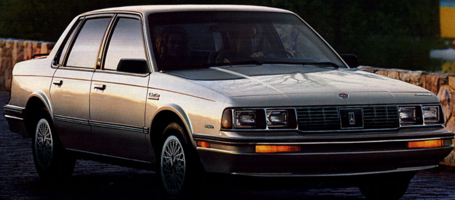
CUTLASS CIERA ES

Here's a car that turns curves into straights, beautifully. Just your kind of driving machine—the Cutlass Ciera ES. Its front-wheel drive and 3.8-liter sequentially fuel-injected V6 will take you smoothly through every beautiful bend. And to add to the special feel of performance, there's plenty of sporty standard equipment: a 4-speed automatic transmission with overdrive, Oldsmobile's Level III firm handling suspension, dual outlet exhaust, Tungsten halogen headlamps, 14" Eagle GTs, aluminum wheels, Rallye instrumentation, leather-wrapped steering wheel, front bucket seats and a floor-mounted console shifter. So take on those curves with a car that knows how to straighten 'em out. Take on Cutlass Ciera ES.