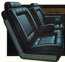
Electra Estate Wagon Blue Doeskin- grain Vinyl 55/45 Notchback Seats