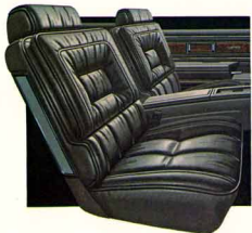
Regal Limited Coupe Regal T Type Gray Sierra-grain Leather with Vinyl 45/45 Seats