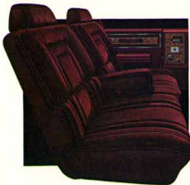
Century Limited Coupe and Sedan Red Cloth 55/45 Notchback Seats