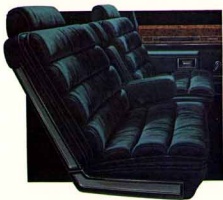
LeSabre Limited Collectors Edition Coupe and Sedan Blue Cloth 50/50 Notchback Seats

Buick Motor Division, General Motors Corporation, reserves the right to make changes at any time, without notice, in prices, colors, materials, equipment, specifications, and models, and also to discontinue models.