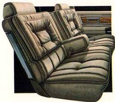
Regal Limited Sand Gray Cloth 55/45 Notchback Seats