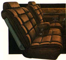
LeSabre Limited Brown Cloth 55/45 Notchback Seats