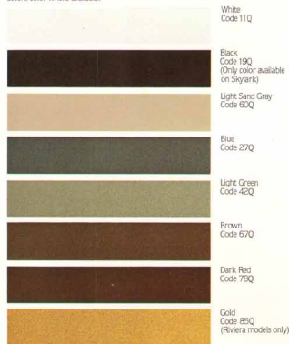
White Code 11Q Black Code 19Q (Only color available on Skylark) Light Sand Gray Code 60Q Blue Code 27Q Light Green Code 42Q Brown Code 67Q Dark Red Code 78Q Gold Code 85Q (Riviera models only)

Protective body-side moldings are standard equipment on the following models: Skyhawk, Regal (except T TYPE), LeSabre and Electra (except Park Avenue). Skylark moldings are black. Electra Estate Wagon body-side moldings are brown. Skyhawk wraparound moldings are black. When Designers' Accent Paint is ordered, it is recommended that the protective body-side molding color match the accent color where available.