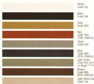
White Code 11A Black Code 19A Gold Code 55A Red Code 75A (73A-Electra) Silver Code 15A Blue Code 25A (27A-Electra) Light Green Code 42A (N.A. on Regal T TYPE) Brown Code 65A (67A-Electra) Light Sand Gray Code 14A

Stripes are available on all models except Electra Estate Wagon, Skyhawk T TYPE, Skylark T TYPE, and Century T TYPE or when Designers' Accent Treatment or woodgrain vinyl applique is ordered. Stripes are standard on Riviera T TYPE. White or red stripes are standard on Riviera Convertible. Black stripe is standard on Skyhawk T TYPE and Century T TYPE.