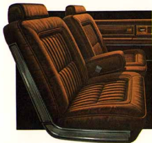
Riviera Coupe Brown Cloth 55/45 Notchback Seats