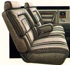
Century Limited Sand Gray Cloth 55/45 Notchback Seats