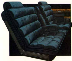
Electra Park Avenue Blue Cloth 50/50 Seats