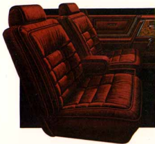
Skylark Limited Red Cloth Notchback Seats