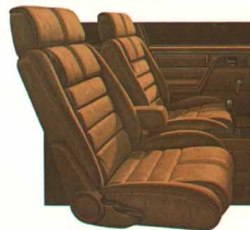
Skyhawk Limited Brown Cloth Bucket Seats