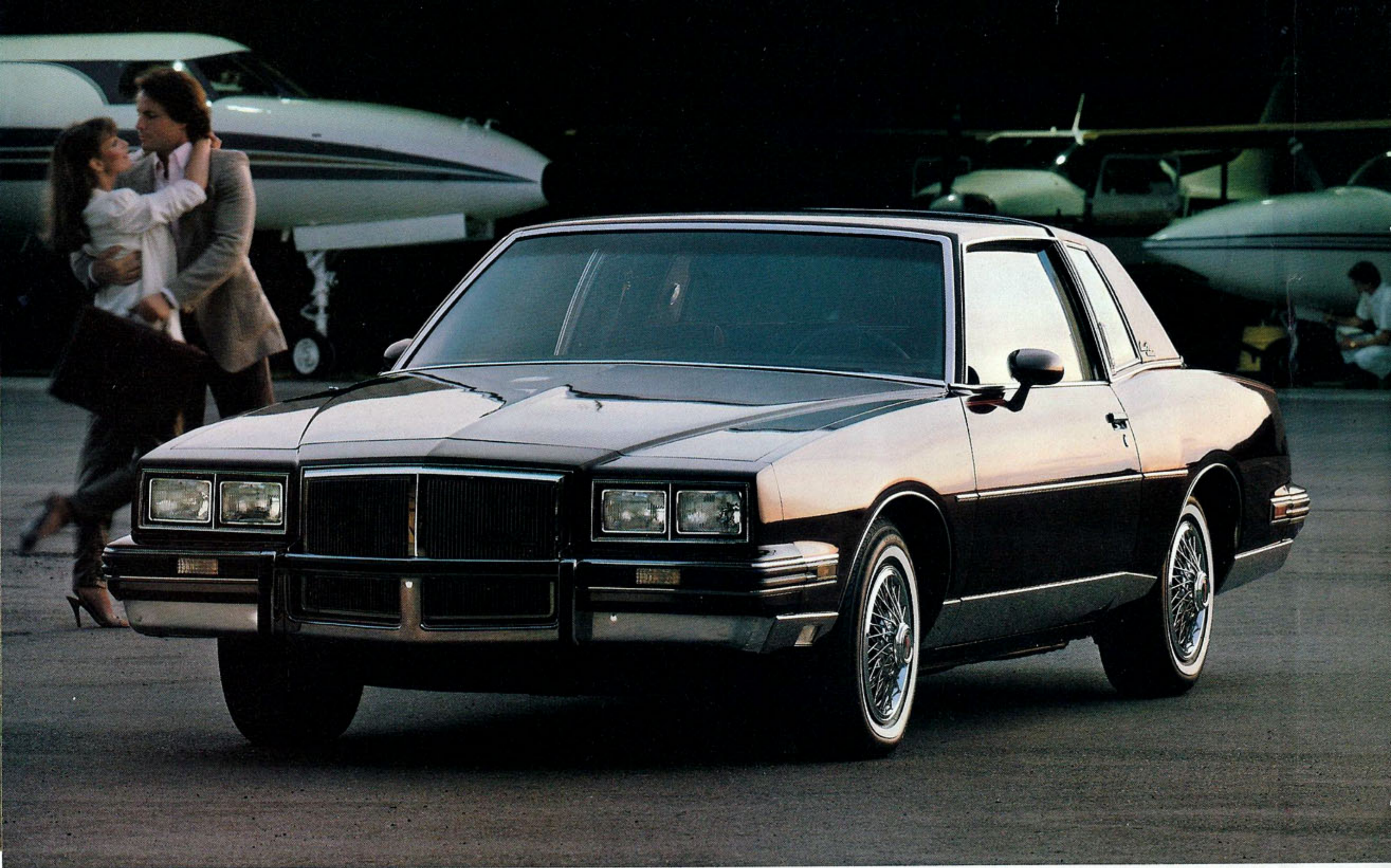
Grand Prix Brougham.

GRAND PRIX BROUGHAM. Some people define luxury with a few well-chosen words. Grand Prix Brougham defines it with special touches that make luxury a way of life.