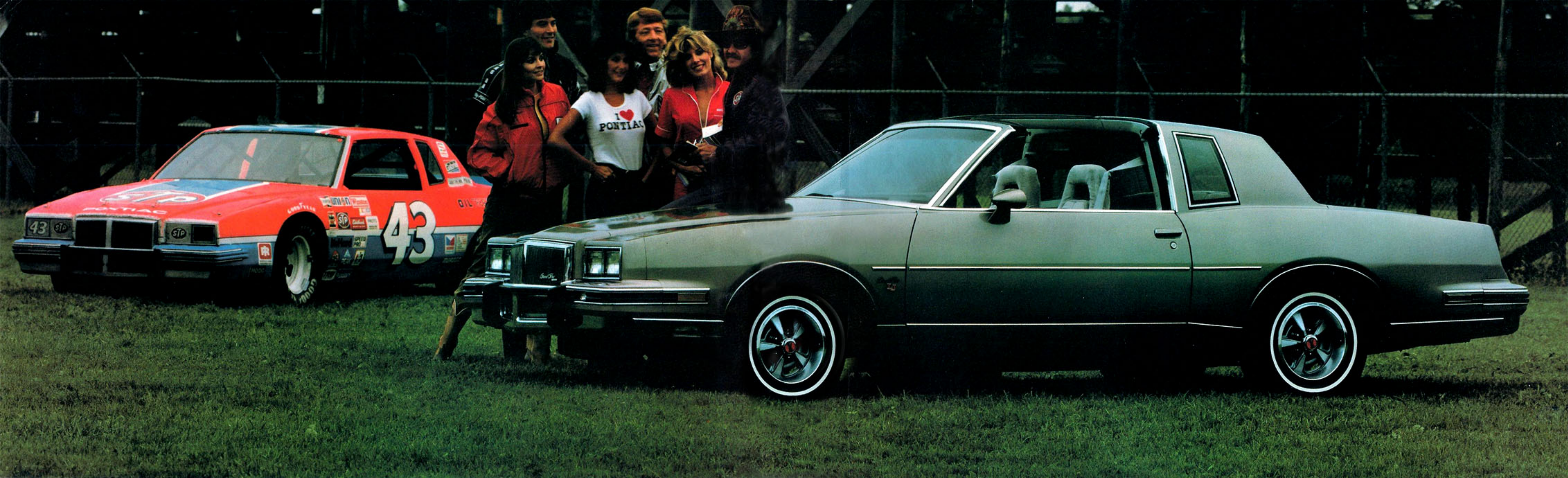
Grand Prix LJ.

Its name is legend. Its standard of excellence expected. Its level of excitement self-evident. Grand Prix is a car that doesn't need flash to fire excitement. And for 1983, the excitement is yours to enjoy in three ways: Grand Prix, Grand Prix LJ and Grand Prix Brougham.