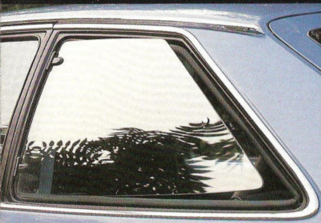
Swing-out rear windows (3-Door only).