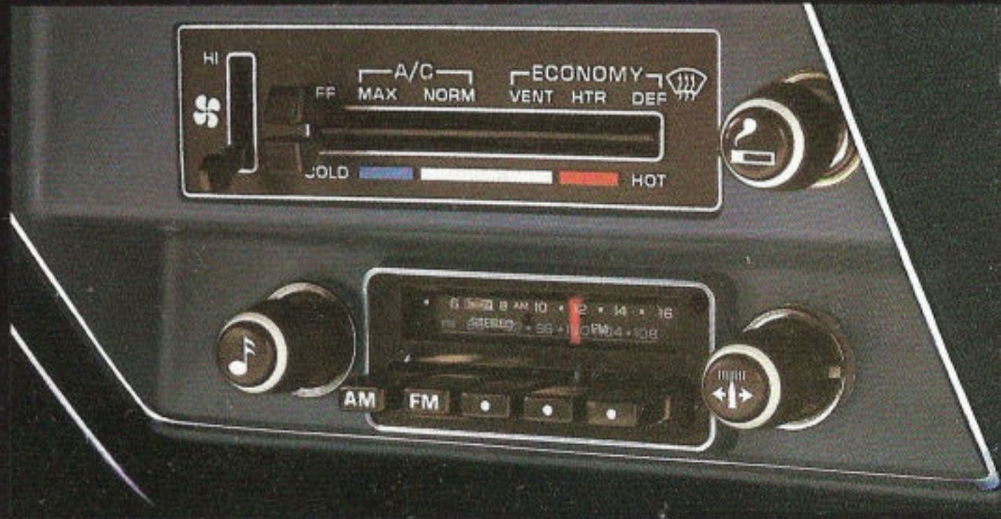
Air conditioning and Delco-GM AM/FM stereo radio.