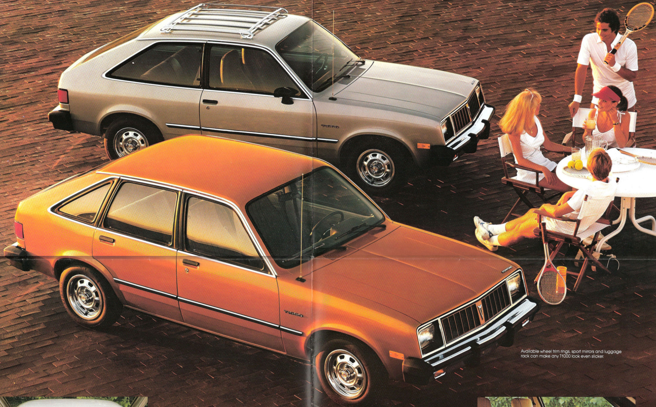
Available wheel trim rings, sport mirrors and luggage rack can make any T1000 look even slicker.