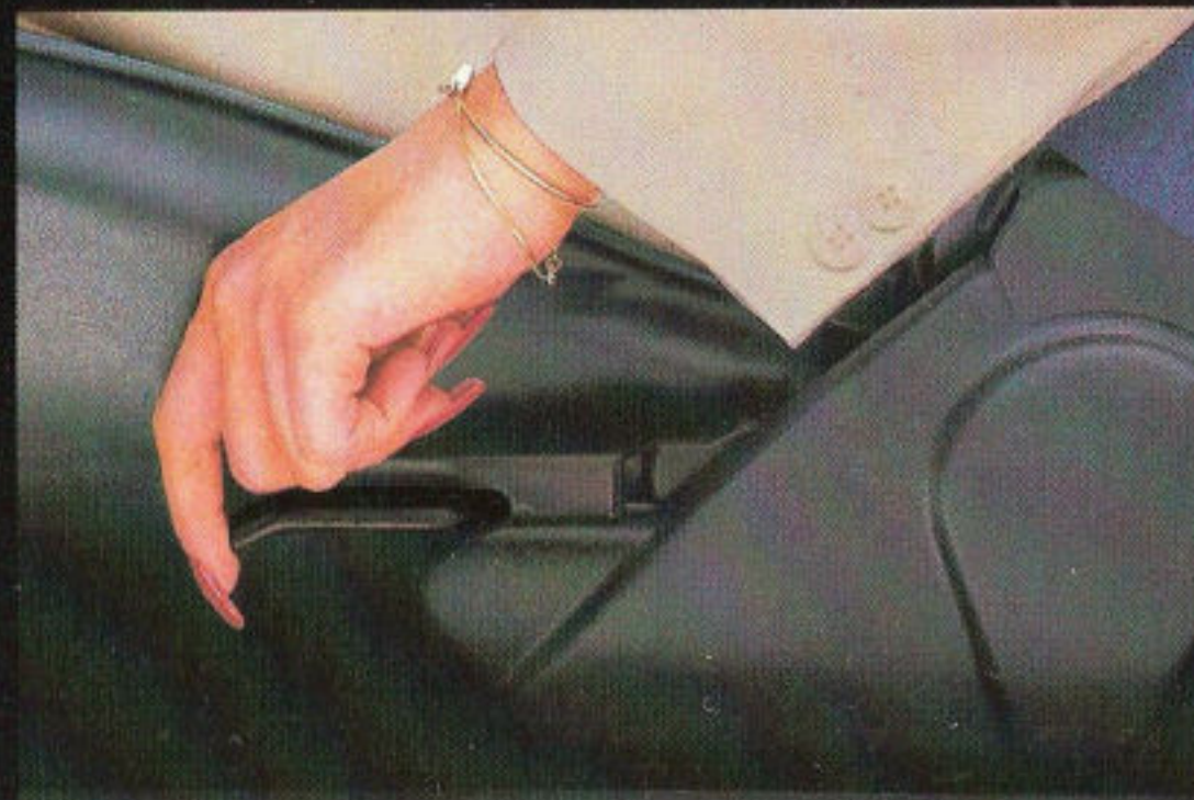
Reclining front bucket seats.