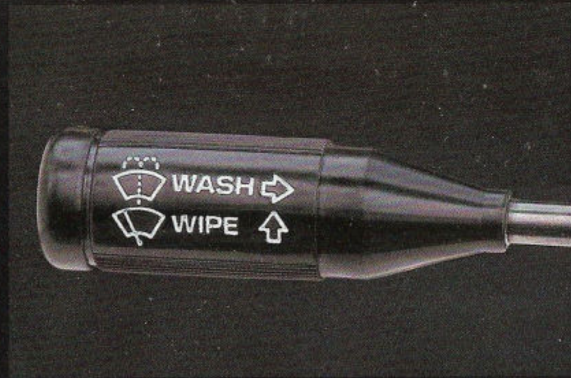
Multi-function control lever.