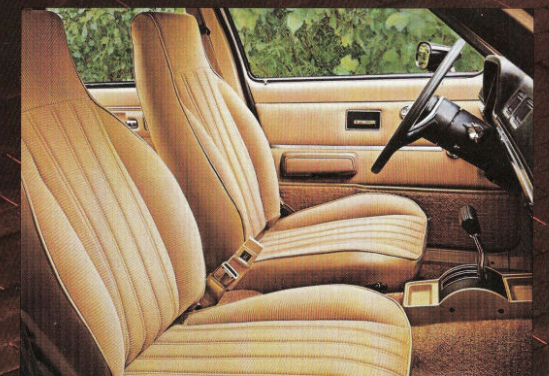
The available cloth interior adds a softer touch to the already comfortable standard reclining front bucket seats.

And if you're looking ahead, you'll be happy to hear about the 30,000-mile intervals between scheduled spark plug changes, under most operating conditions. The extensive anti-corrosion treatments. And the Plastisol film on the lower body to help protect it from stone damage.