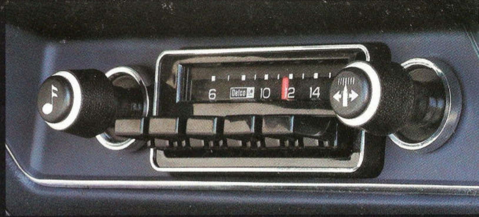
Delco-GM AM radio (may be deleted for credit).