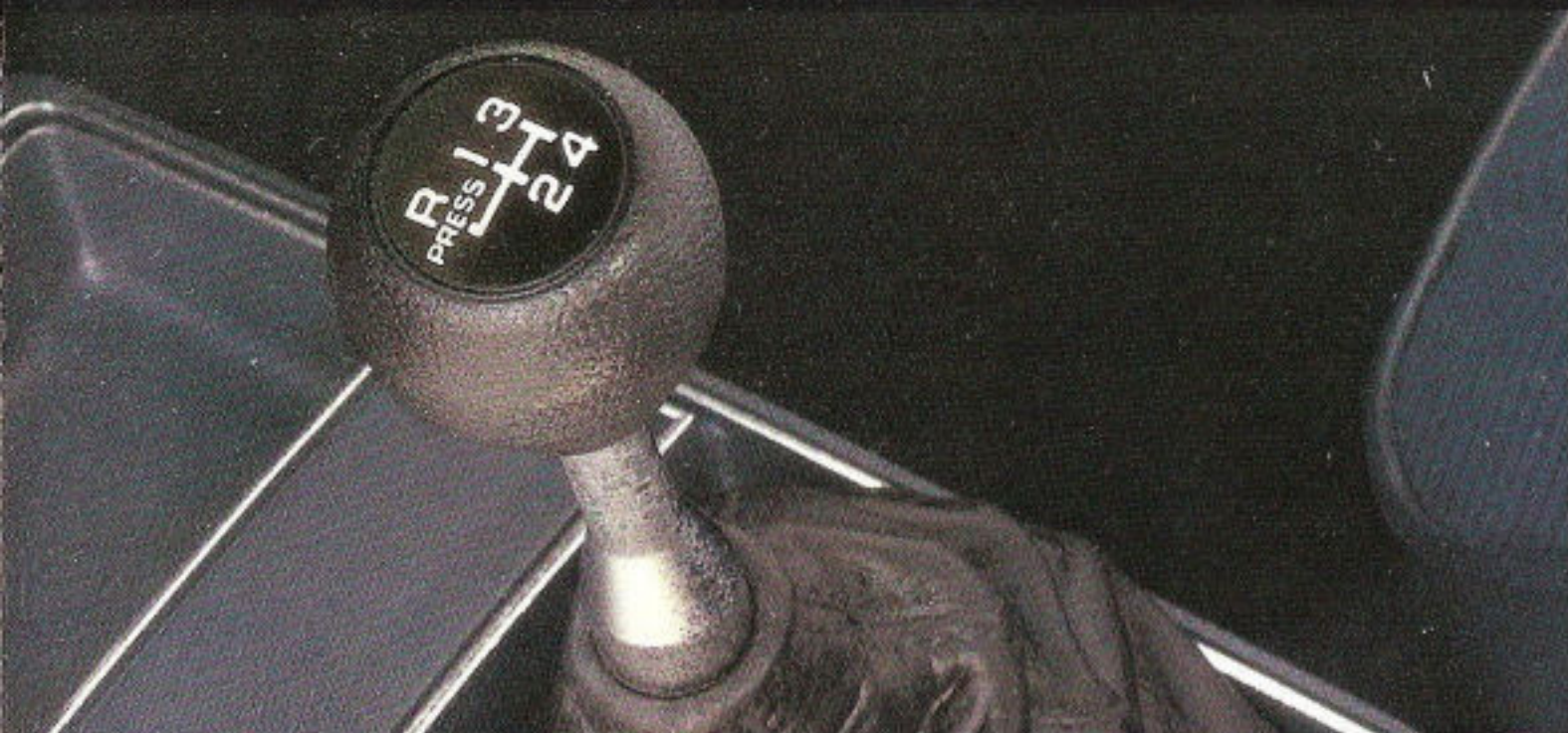
4-speed sport shifter and front console.