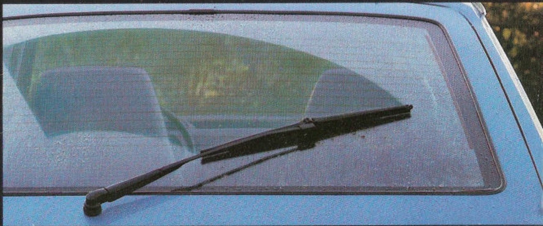
Rear window fluidic washer/wiper and rear window defogger.