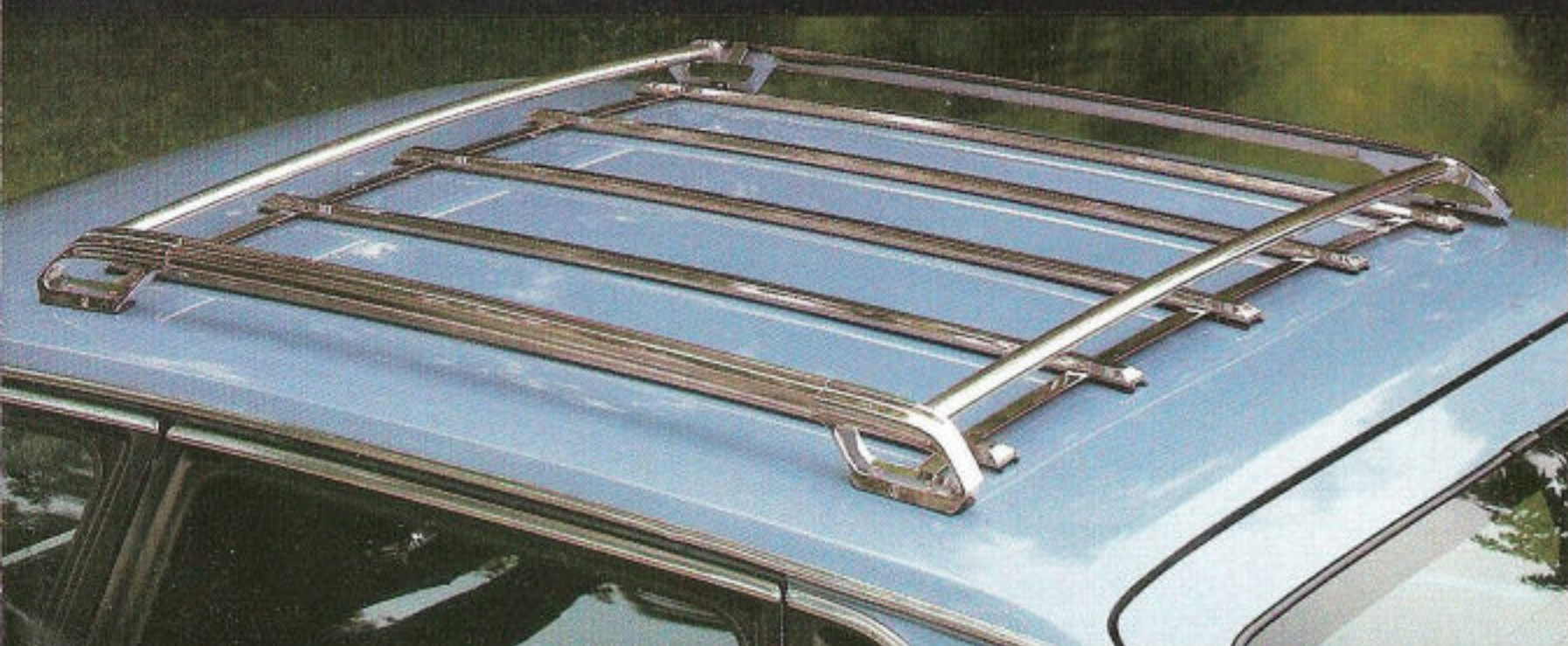
Rooftop luggage carrier.