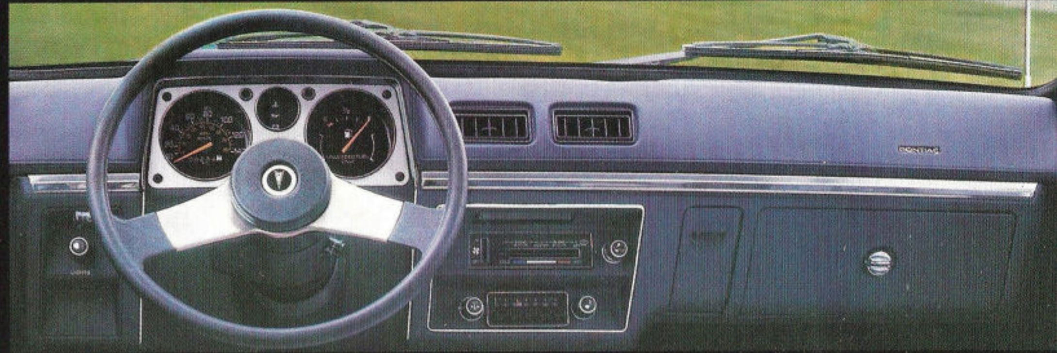
Sporty instrument panel and steering wheel.