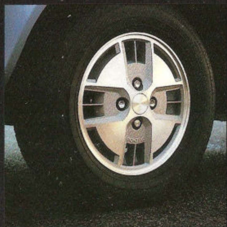
Cast aluminum wheels.