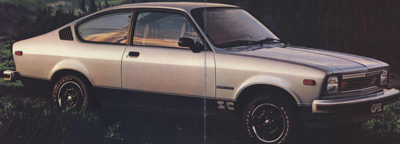
Opel Sport Coupe

All standard. At a standard price. Now that's unusual.