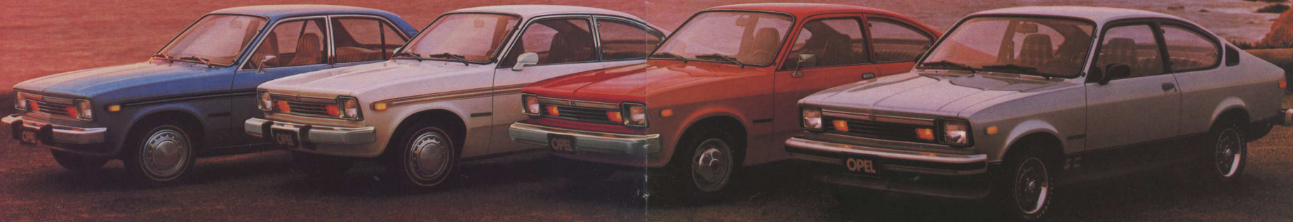
Opel Deluxe Sedan

If you're looking for a great Japanese car, we're determined to help you keep it in the family, with a great American name... Buick.