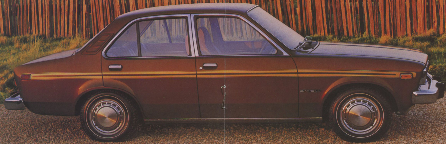
Opel Deluxe Sedan

Plus the convenience of... slam, slam, slam, slam. Four ways of getting in and out. So, if you're looking for a super and sensible sedan: keep it in the family. Buick Opel has the family car for you.