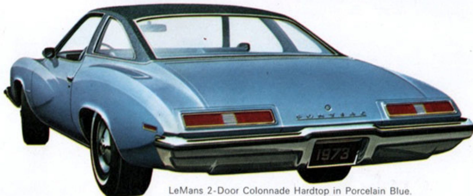
LeMans 2-Door Colonnade Hardtop in Porcelain Blue.

blackwall tires, power steering, firm shocks, 15 x 7" wheels and large front and rear stabilizer bars. Firm Ride Package includes firm shocks and high rate springs. Decor Group includes wheel opening moldings, custom pedal trim plates, Deluxe wheel covers, Custom Cushion steering wheel, and bright molding on hood rear edge and windowsills. Sunroof Option (2-door only) manually operated or power operated.