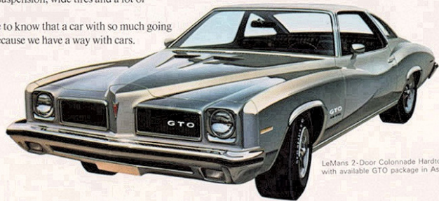
LeMans 2-Door Colonnade Hardtop with available GTO package in Ascot Silver.