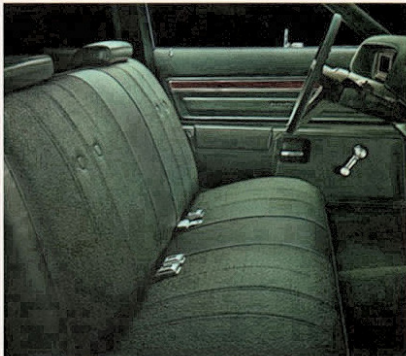
Cloth and Morrokide interior. Shown in green—also available in blue and beige.

1973 LeMans. It's nice to know that a car with so much going for it is so affordable. Because we have a way with cars.