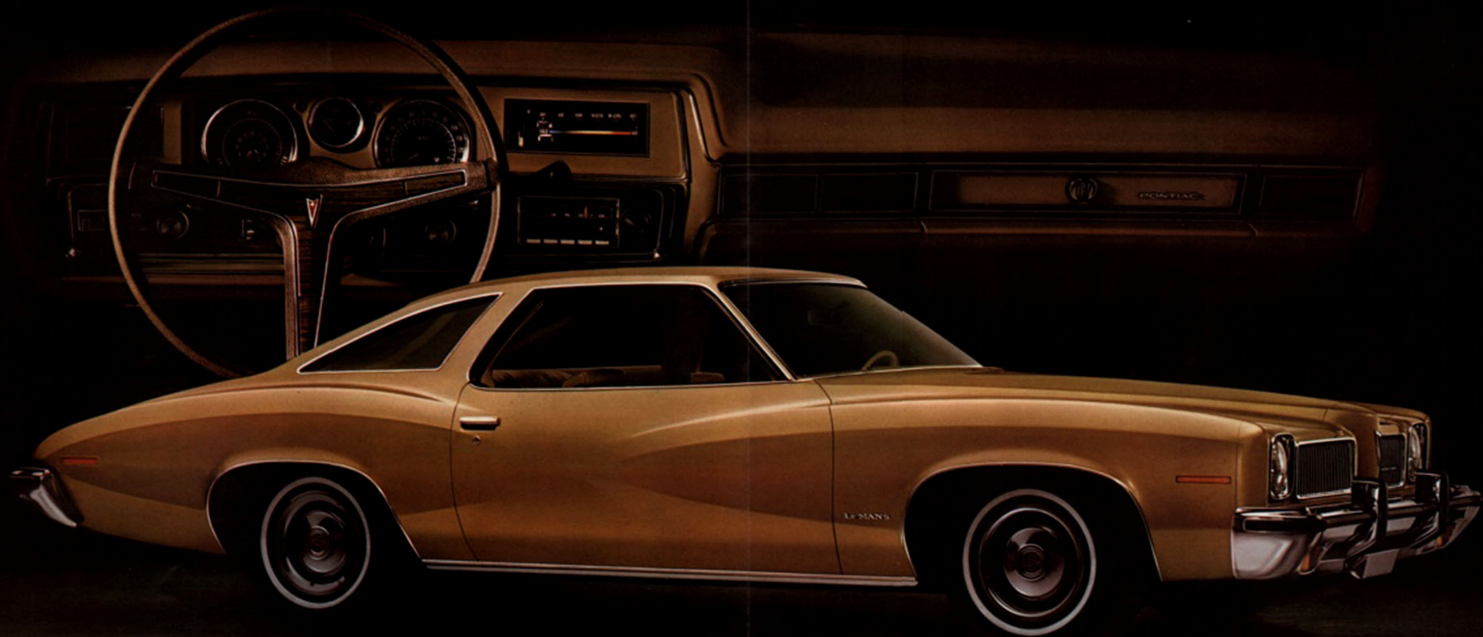
LeMans 2-Door Coupe Hardtop in Valencia Gold