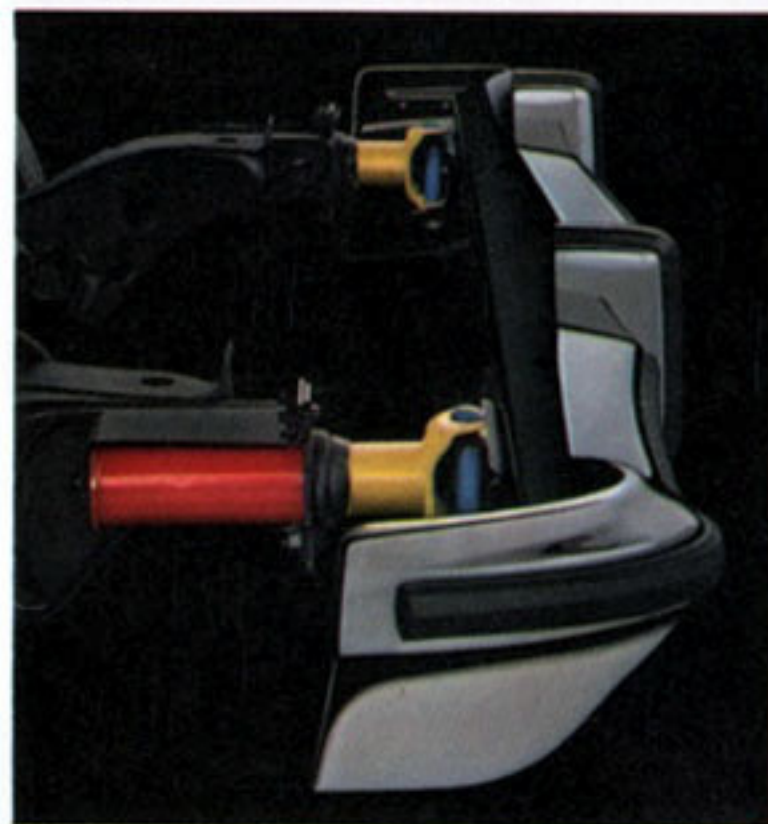
New improved front bumper system.

New improved front and rear bumpers. Fixed rear quarter windows. Windshield radio antenna. Concealed wipers. Frameless door glass. Standard hubcaps.