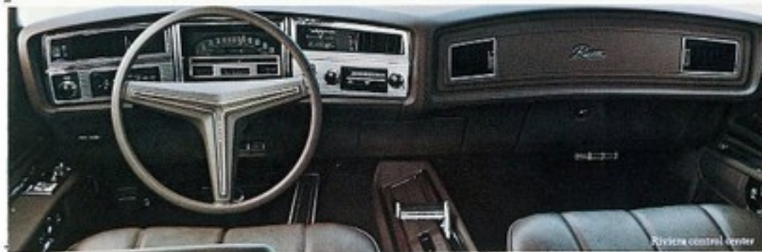
Riviera control center