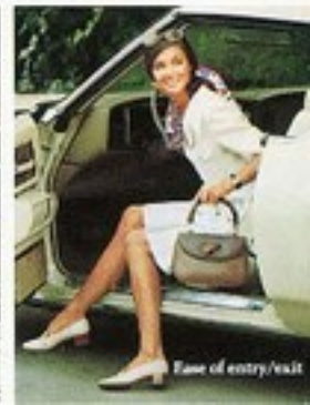
Ease of entry/exit