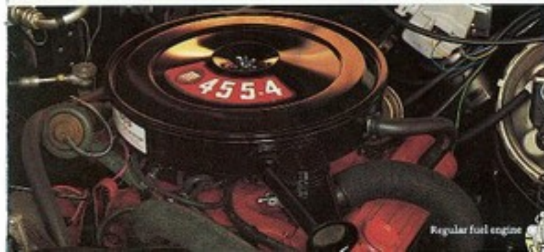
Regular fuel engine