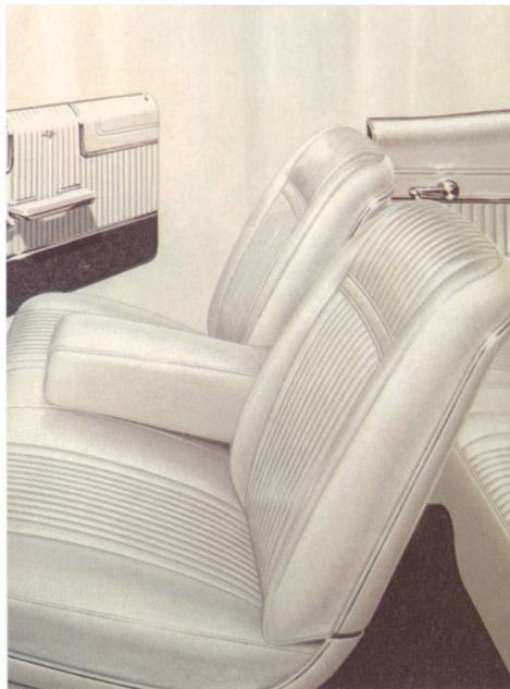
You may also elect this new profile back Strato bench seat with free standing center armrest in lieu of the bucket seat and console style. Available in black or parchment Morrokide, or bronze or black Palais pattern cloth with Morrokide.