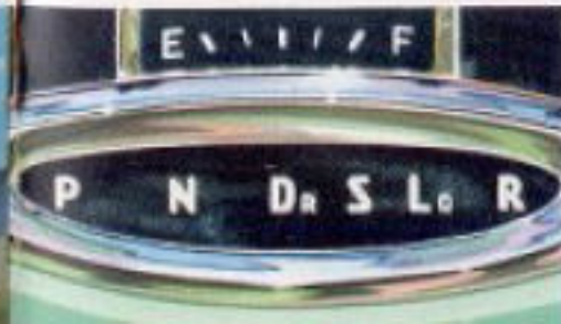
NEW PARKING LOCK FOR SAFETY!

The "P" position on the new quadrant locks your rear wheels firmly for safer parking. For extra hill-parking safety, the engine will start in "P" as well as "N"!