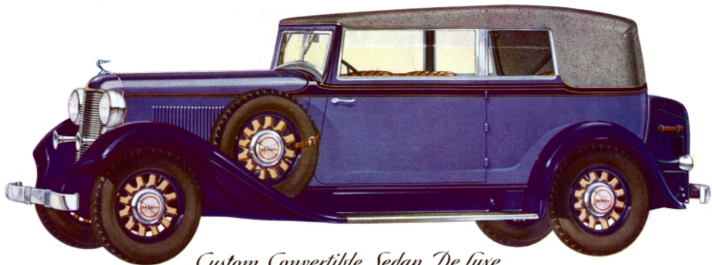
Custom Convertible Sedan De Luxe