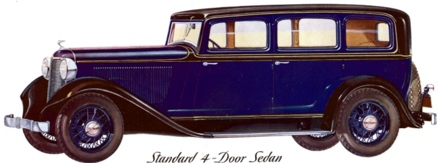
Standard 4-Door Sedan