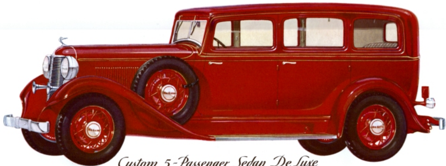
Custom 5-Passenger Sedan De Luxe

The new De Soto Six is styled to meet the individual requirements of exacting people. Custom and Standard Sedans, richly appointed, satisfying in every detail. Standard Coupe built to the definite requirements of business use . . . comfort for the long trip . . . practical utility in the generous spacing and easy access of rear deck. Rumble-seat Coupe and Custom Roadster in a new conception of smartness. Custom Convertible Coupe and Custom Convertible Sedan for people who wish to enjoy the sparkle of sunshine and invigorating outdoors in driving. A new conception of comfort and luxury in the highly practical family car—the Brougham. A car for every purpose and individual need . . . beauty that is breath-taking—and the thrill of thrift.