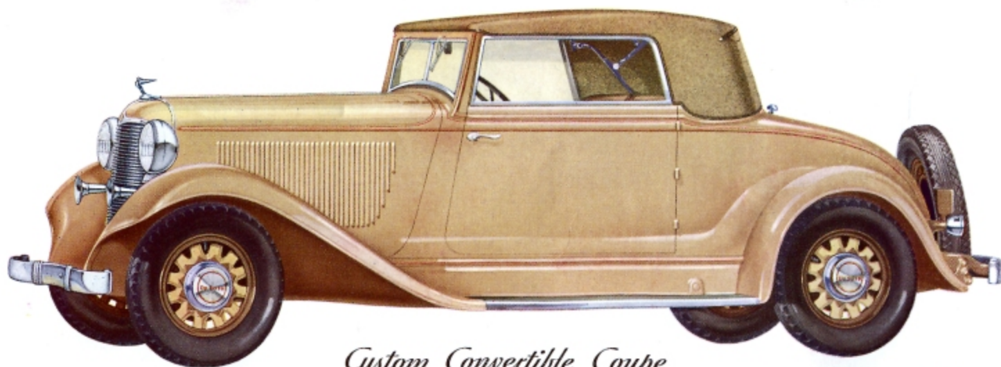
Custom Convertible Coupe