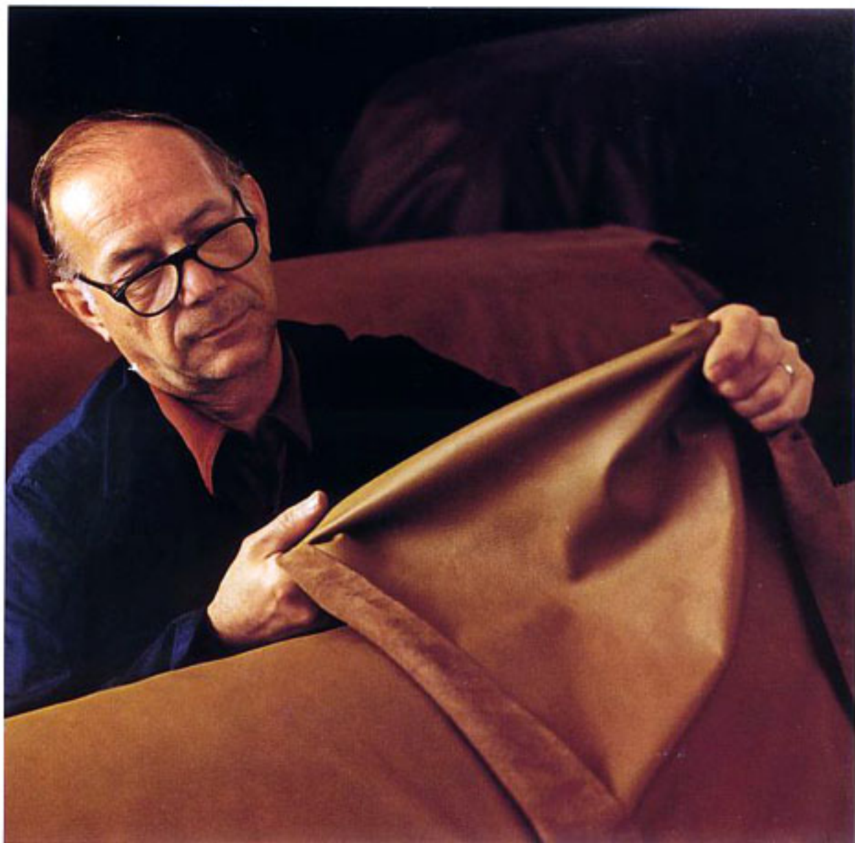
EACH HIDE IS UNIQUE. THE METICULOUS HANDS AND EXPERIENCED EYES OF THE SELECTORS PICK ONLY THE BEST LEATHERS.