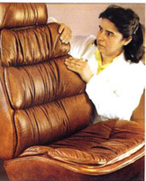
...IL MAKES THE DIFFERENCE IN LEATHER FINISHING.