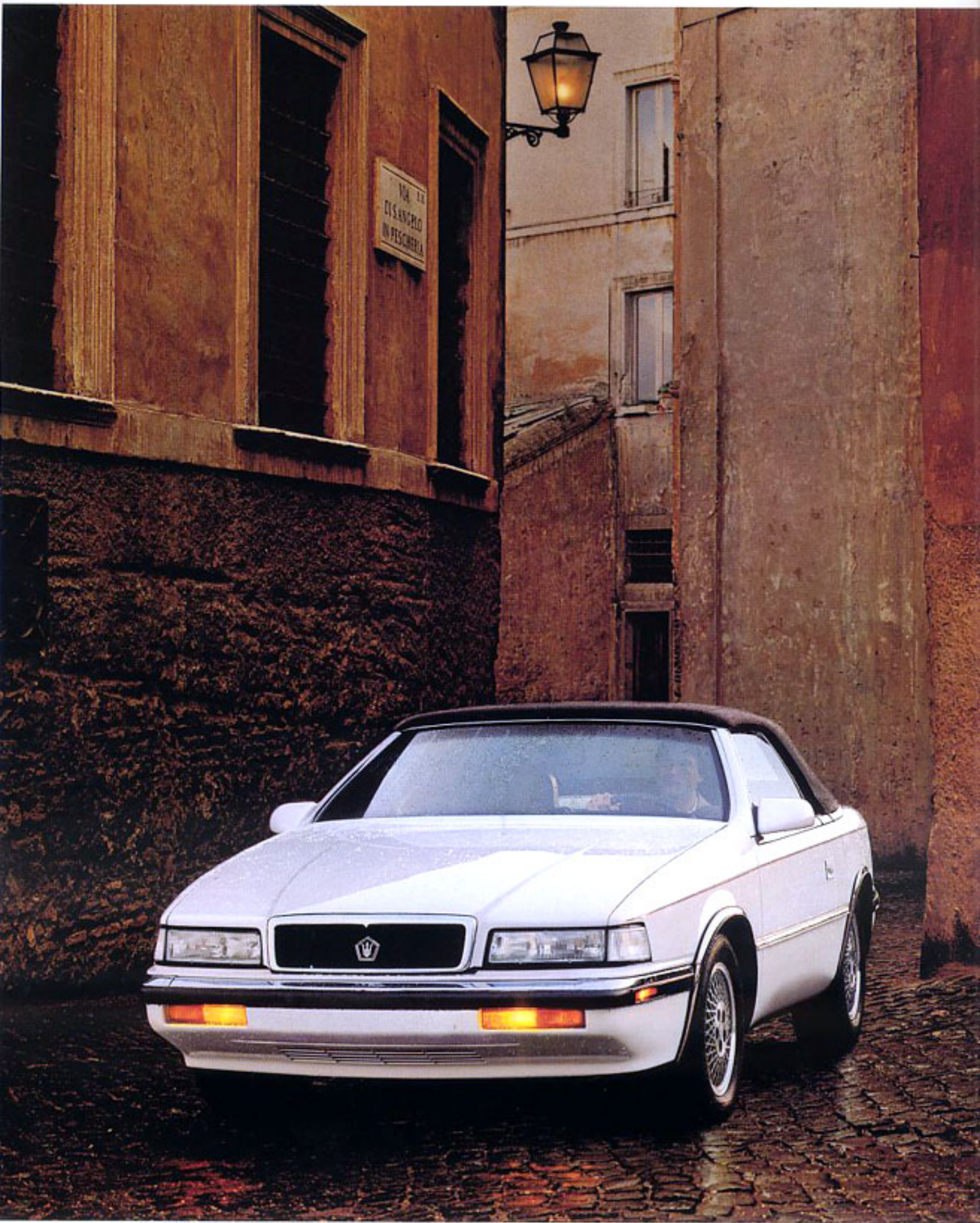
SHOWN IN ARCTIC WHITE CLEAR COAT.