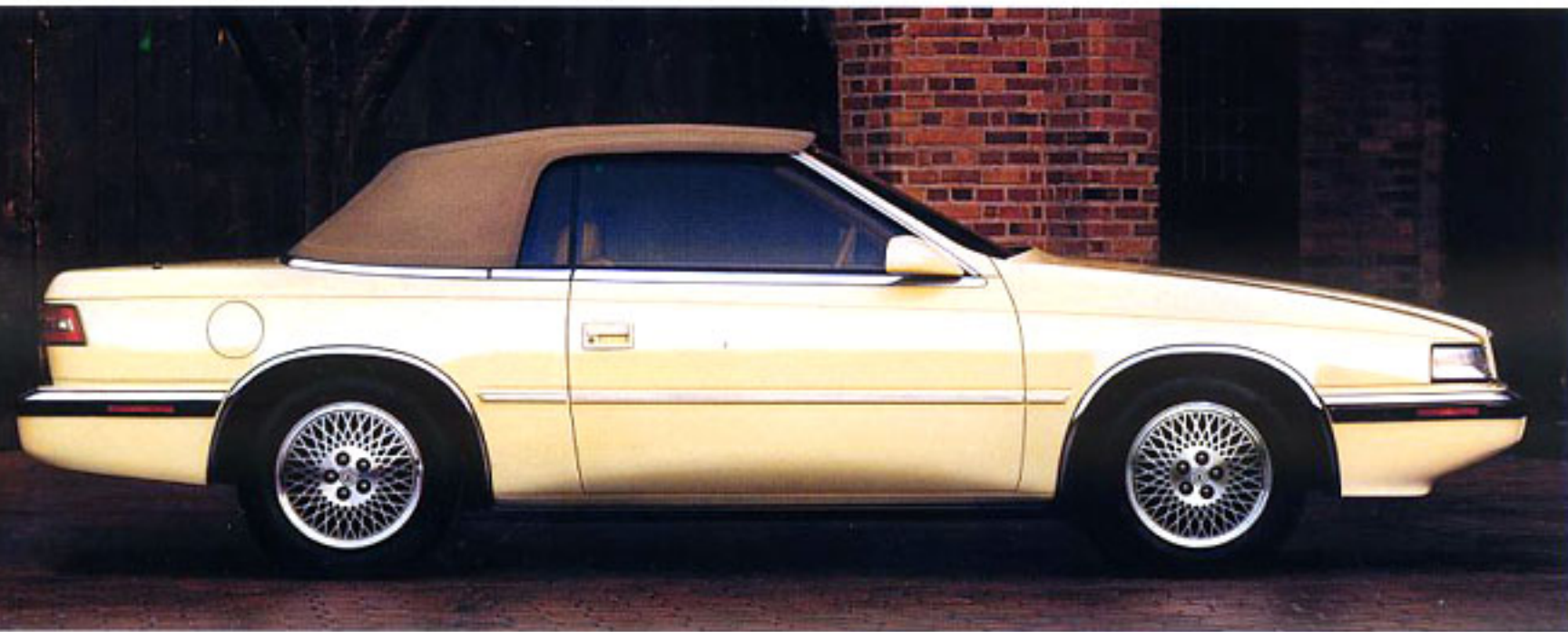
SHOWN IN LIGHT YELLOW CLEAR COAT WITH FOLDING CONVERTIBLE TOP RAISED.