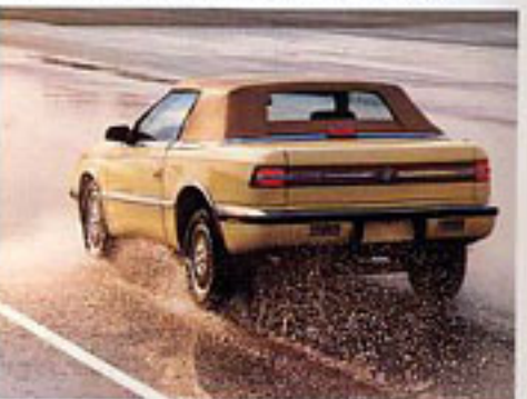
SEVERE CONDITIONS TEST ANTILOCK BRAKES.