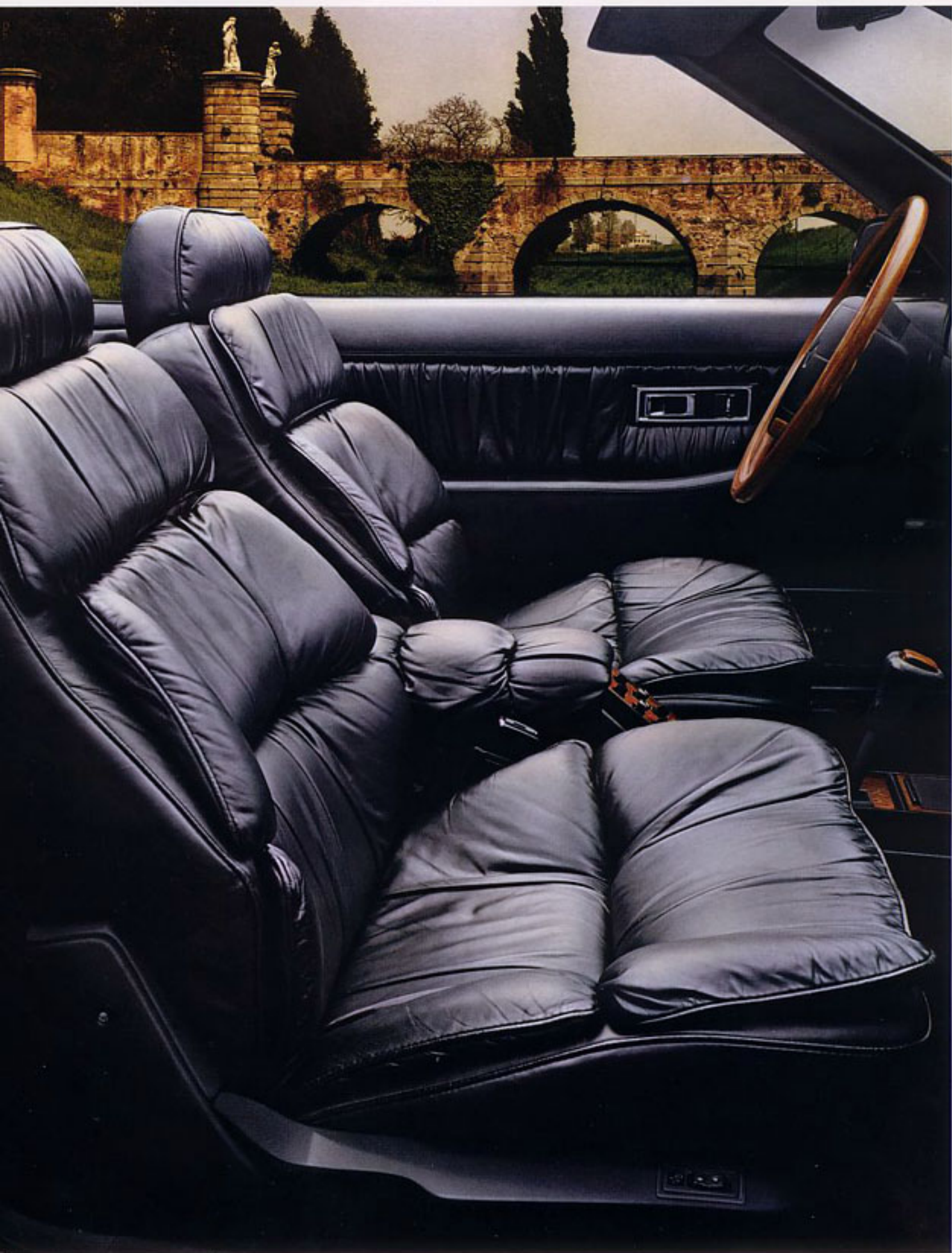
THE LEATHER-FACED SEATS, SHOWN IN BLACK.