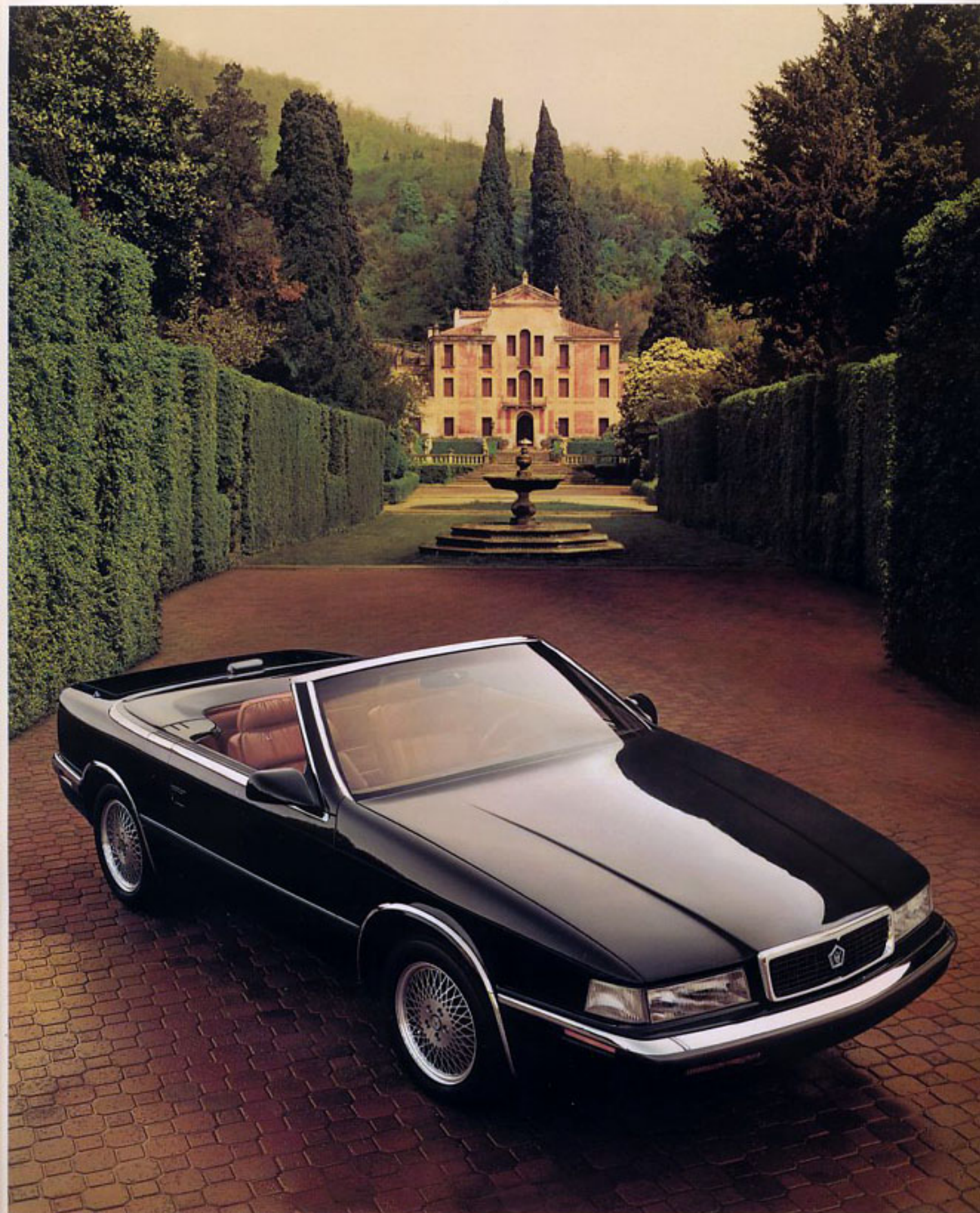
SHOWN IN JET BLACK CLEAR COAT WITH GINGER INTERIOR.