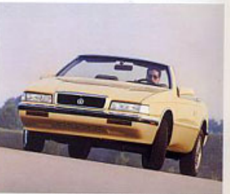
HANDLING IS ASSESSED IN CORNERING TESTS.