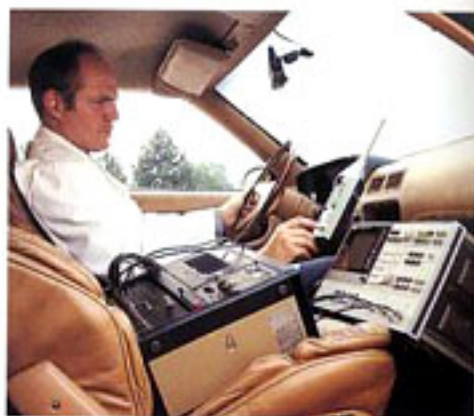
PRECISE INSTRUMENTS MEASURE VIBRATION.