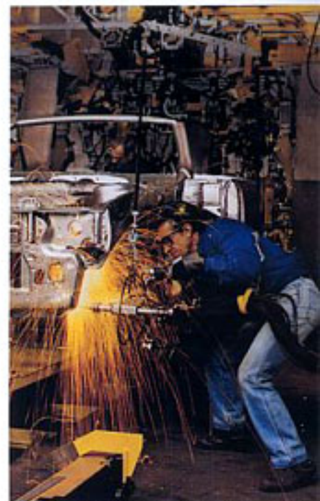
MULTIPLE WELDS IMPART STRENGTH TO BODY.