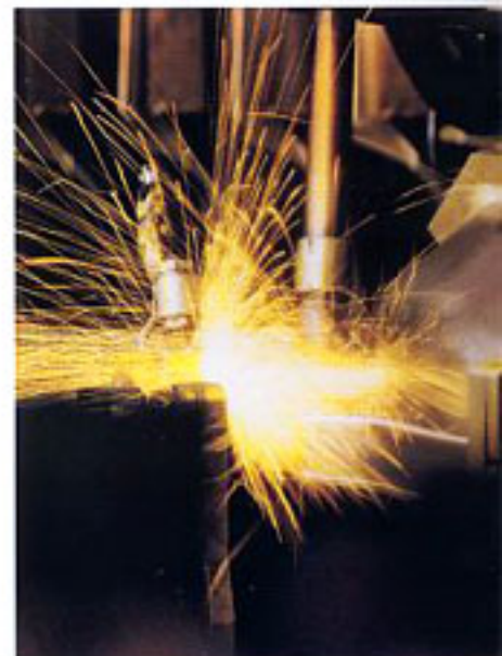
PARTS ARE LOCK-FITTED FOR PRECISE WELDS.