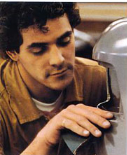
BEST IMPERFECTIONS ARE FOUND AND SMOOTHED.