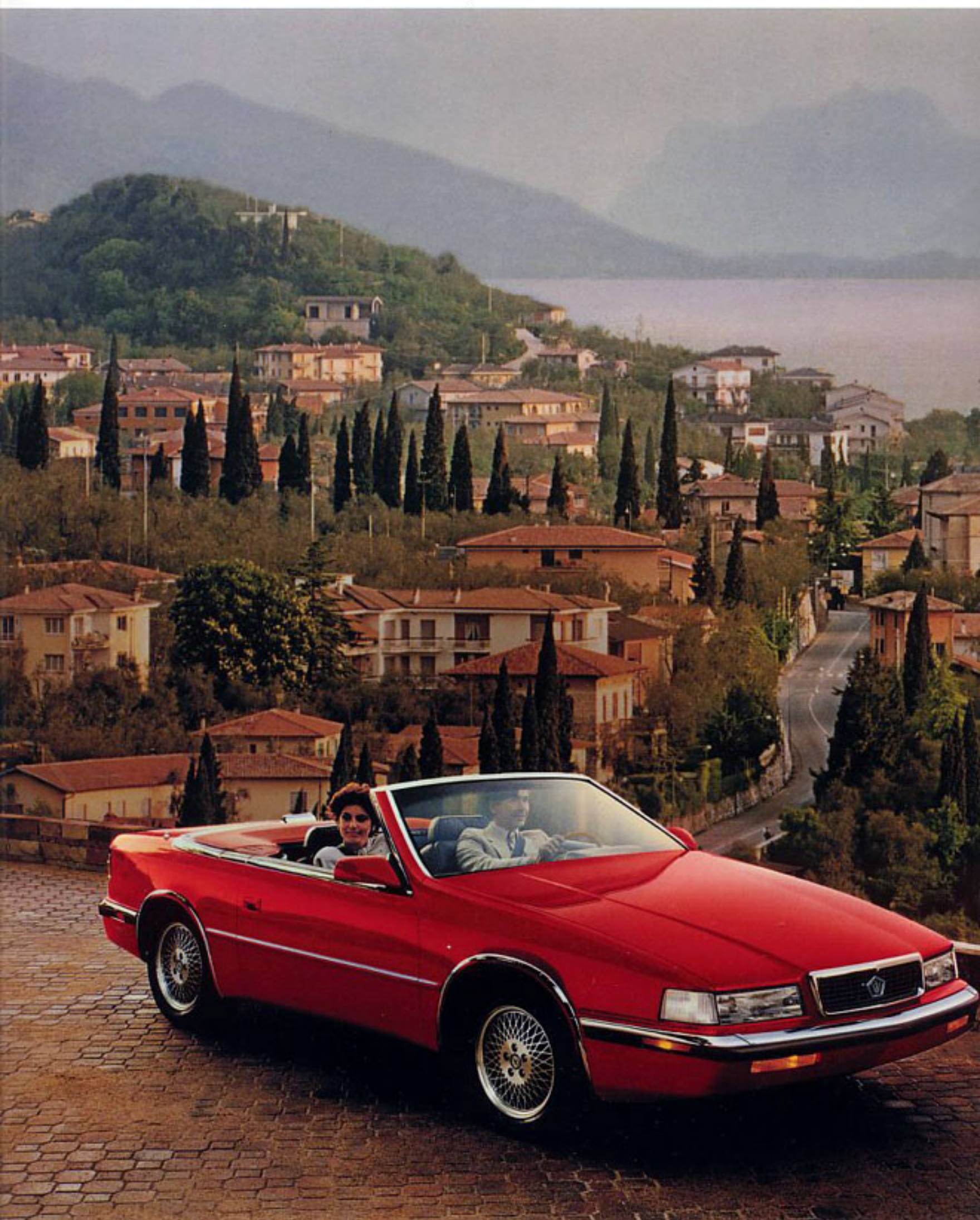
OWN IN EXOTIC RED CLEAR COAT WITH BLACK INTERIOR.