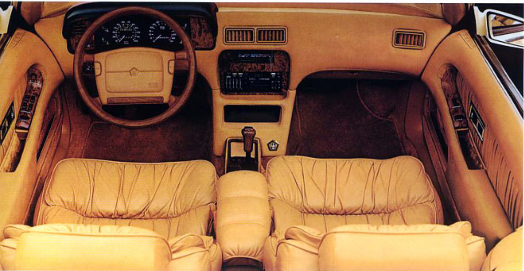
...WAY POWER-ADJUSTABLE LOW-BACK LEATHER-FACED BULKHEAD SEATS (SHOWN IN GINGER) FEATURE FOUR-WAY ADJUSTABLE HEAD RESTRAINTS.