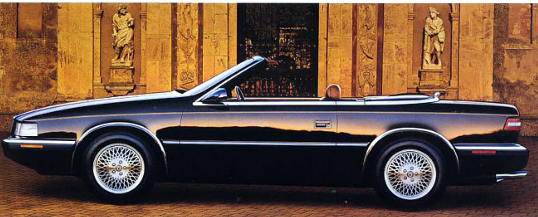
SHOWN IN JET BLACK CLEAR COAT WITH SOFT TOP CONCEALED BENEATH TONNEAU COVER.