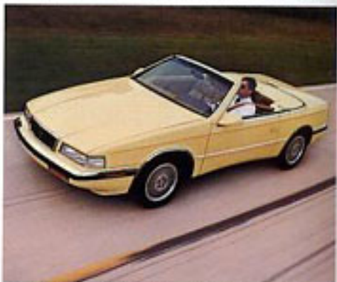
HIGH-SPEED ENGINE ENDURANCE TESTING.