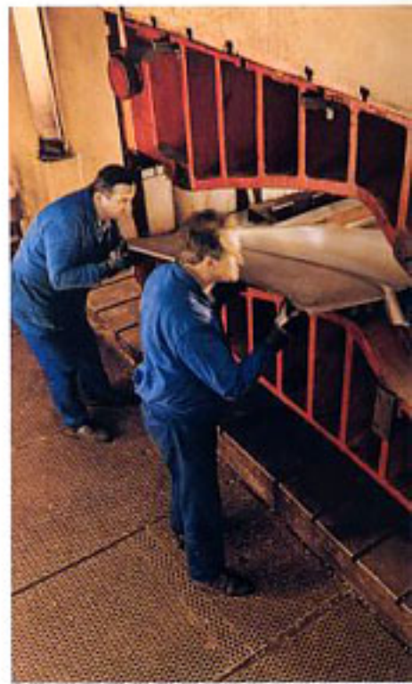
PRECISE STAMPINGS FROM HANDCRAFTED DIES.

Such demanding craftsmanship produces barely three cars an hour. But those who shape the limited edition sport coupes that Maserati is building for Chrysler are prideful people who have always built their automobiles as if each were one of a kind.