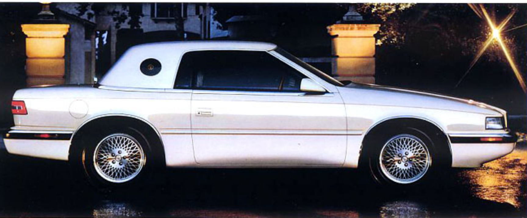
SHOWN IN ARCTIC WHITE CLEAR COAT WITH REMOVABLE HARDTOP ROOF.