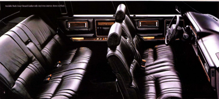
Available Mark Cross UltraSoft leather with vinyl trim interior, shown in Black