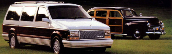
Town & Country (shown in Bright White Clear Coat. (Background: 1941 Town & Country station wagon.)