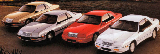
The 1990 LeBaron GT Coupe, shown in Flash Red Clear Coat