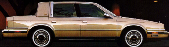
New Yorker Landau, shown in Light Champagne Metallic Clear Coat.