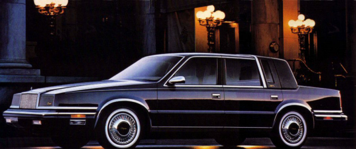
New Yorker Fifth Avenue, shown in Midnight Blue Metallic Clear Coat.