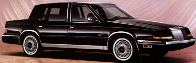
Imperial shown in Black Clear Coat