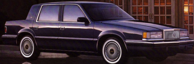
New Yorker Salon, shown in Medium Blue Gray Metallic Clear Coat.

From technology comes comfort. In the 1990 New Yorker Landau, the comfort is luxurious: a big car ride provided by such technological amenities as load-leveling suspension and the smoothness of a 3.3-liter multipoint EFI V-6 engine coupled with a computer-controlled Ultradrive transaxle. Landau safety features include a driver side air bag and out-board rear-seat shoulder belts. In Landau, comfort and engineering do not preclude style. The style of Chrysler New Yorkers endures. And Landau captures it. A padded vinyl roof gives this New Yorker its name and is a reminder of classic auto design. Yet its subtly tapered silhouette marks Landau as distinctly contemporary...the latest expression of Chrysler quality. ®