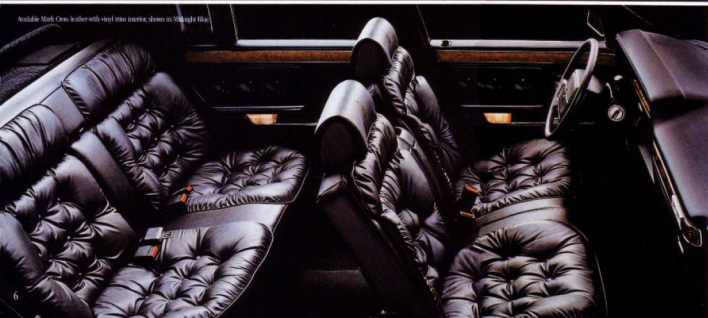
Available Mark Cross leather with steel trim interior, shown in Midnight Blue.