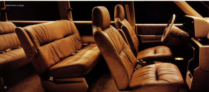
Interior shown in Gauge.