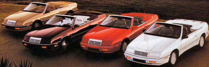
The 1990 LeBaron GT Convertible, shown in Flash Red Clear Coat