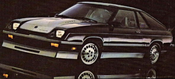
'85 Dodge Shelby Turbo