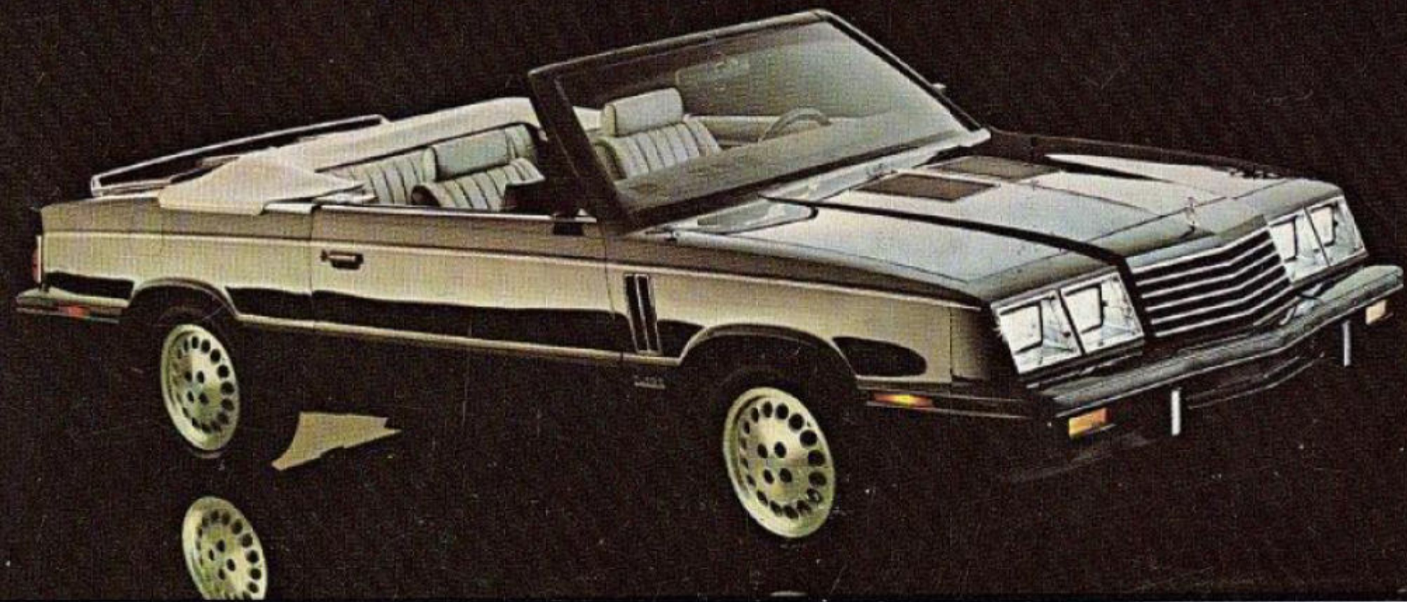
'85 Dodge 600 ES Turbo