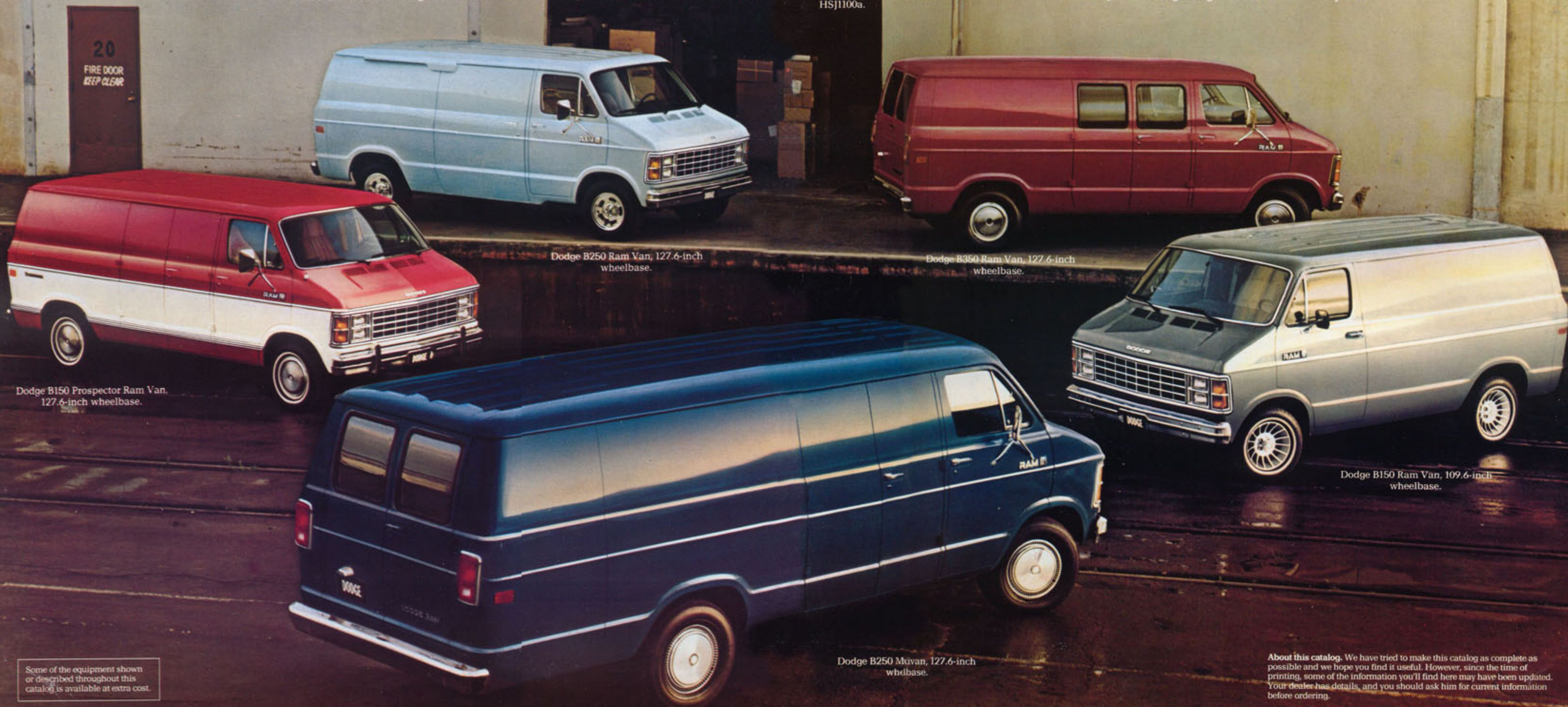
Dodge B150 Prospector Ram Van, 127.6-inch wheelbase.

you want more options at even greater savings, ask for Prospector II and get all the above items plus Exterior Appearance Package, and electronically tuned AM radio, with integral digital clock. Ask your Dodge dealer for details about the dramatic savings that can be yours when you buy Ram Van Prospector.