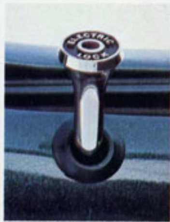
Electric door locks