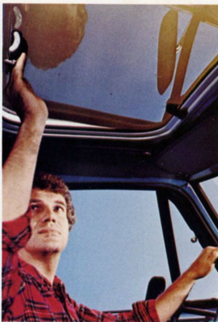
Sky Lite sun roof