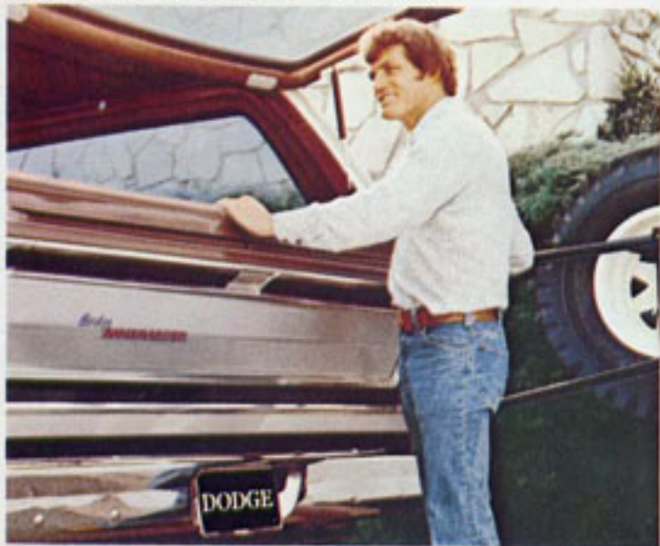
Outside spare tire carrier