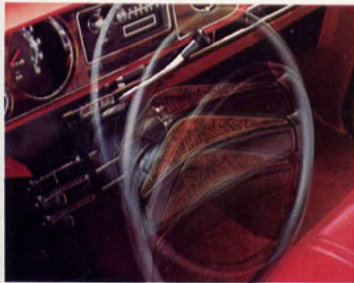
Tilt steering column