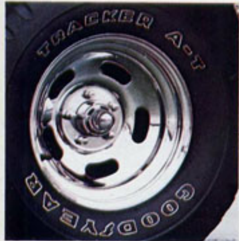
Five-slot chrome disc wheel