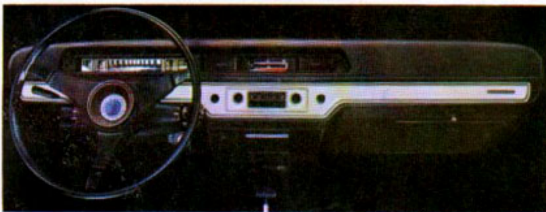
Cricket's instrument panel is convenient to use.