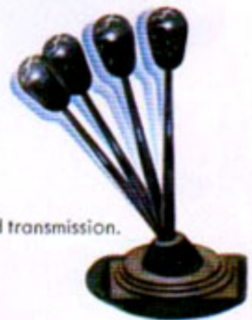
Cricket's standard 4-speed transmission.