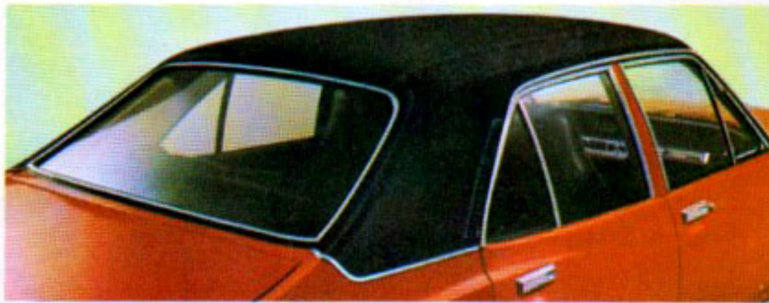
Optional vinyl roof is new for '72.*

Options. So complete, there are only seven ways to get personal with a Cricket. Automatic Transmission (three-speed) • Air Conditioning • Radio • White Sidewall Tires • Black Vinyl Roof* • Twin Carb Engine w/Manual Choke • Decor Package (dual horns, glove box light and lock, cigar lighter, voltmeter, oil pressure gauge, rear armrests, storage pockets in the front doors, day/night mirror, deluxe trim carpet, bright upper door frame moldings, bright sill moldings, front and rear bumper guards, console, deluxe seats and door trim panels, instrument panel light rheostat, high-styled instrument panel pad and trim plate, no-draft vent windows, wheel covers—set of four).