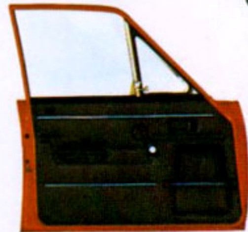
Optional door trim with storage pocket.