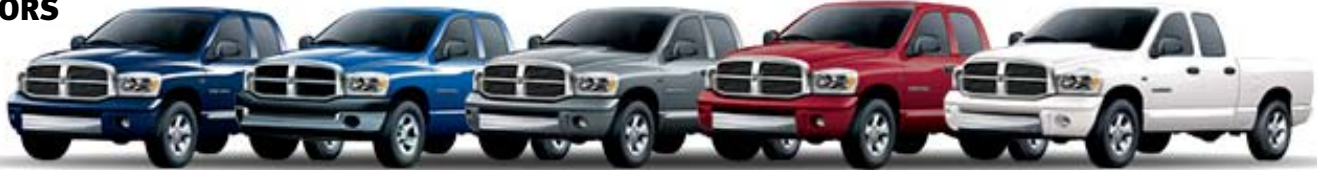
Patriot Blue Pearl