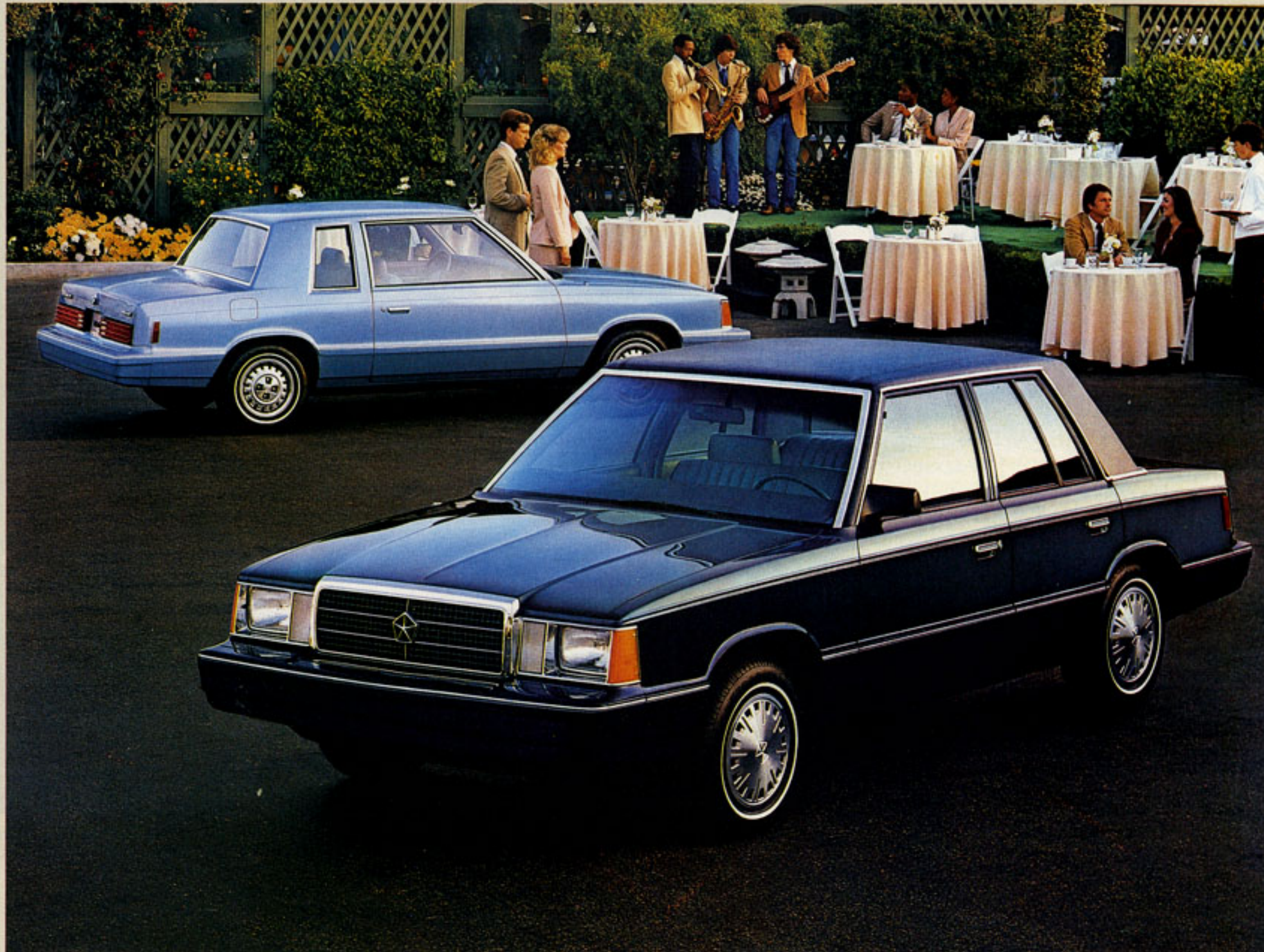
TOP: Reliant Custom wagon shown in Charcoal Pearl Coat, with optional luxury wheel covers and optional whitewall tires. ABOVE: In background, Reliant two-door sedan shown in Glacier Blue Crystal Coat, with optional Rallye road wheels and optional whitewall tires. In foreground, Reliant four-door sedan shown in Nightwatch Blue, with standard deluxe wheel covers.