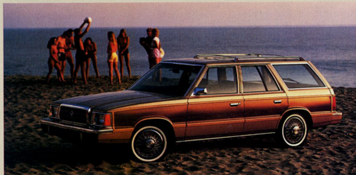
TOP: Reliant SE four-door sedan in Beige Crystal Coat, with optional 13-inch luxury wheel covers and optional whitewall tires. MIDDLE: Reliant SE four-door interior features a cloth- and- vinyl bench seat with folding center armrest, shown in Beige with Brown trim. ABOVE: Reliant SE wagon shown in Beige Crystal Coat with woodgrain applique, and equipped with optional wire wheel covers, wide whitewall tires and optional luggage rack.