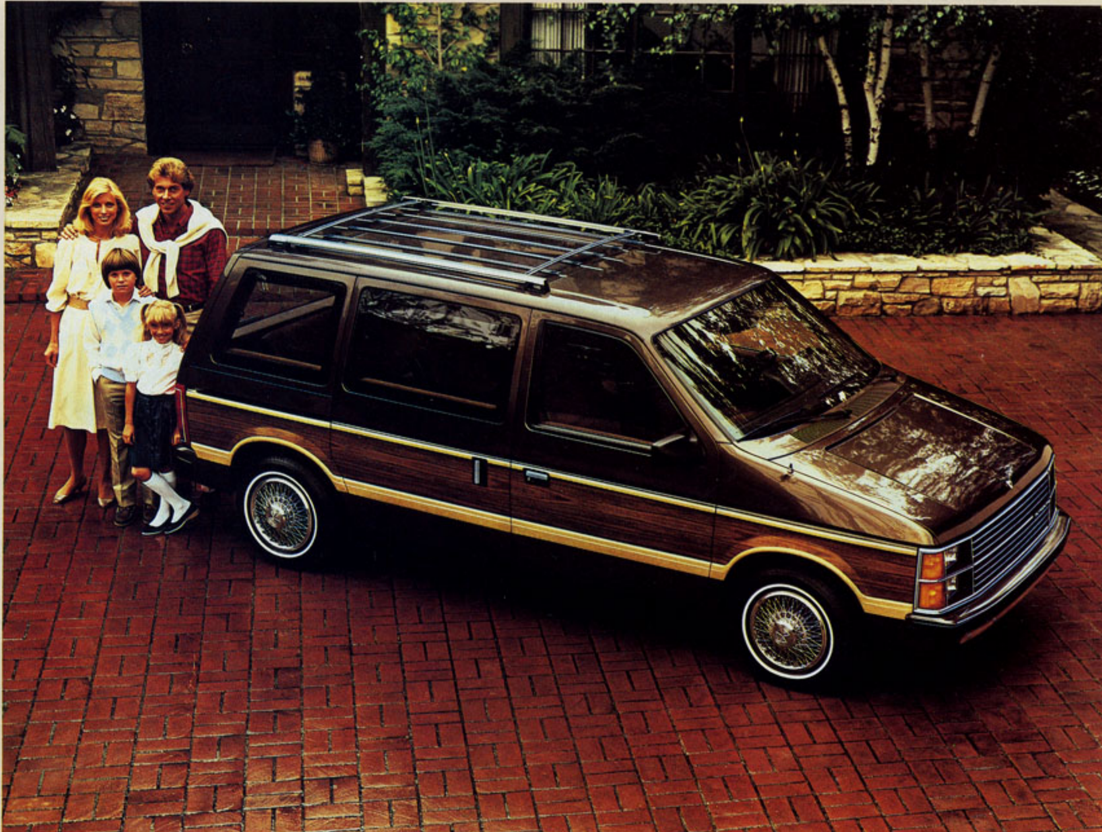
Voyager LE in Mink Brown Pearl Coat with optional wire wheel covers.

Some of the equipment shown or described in this catalog is available at extra cost.