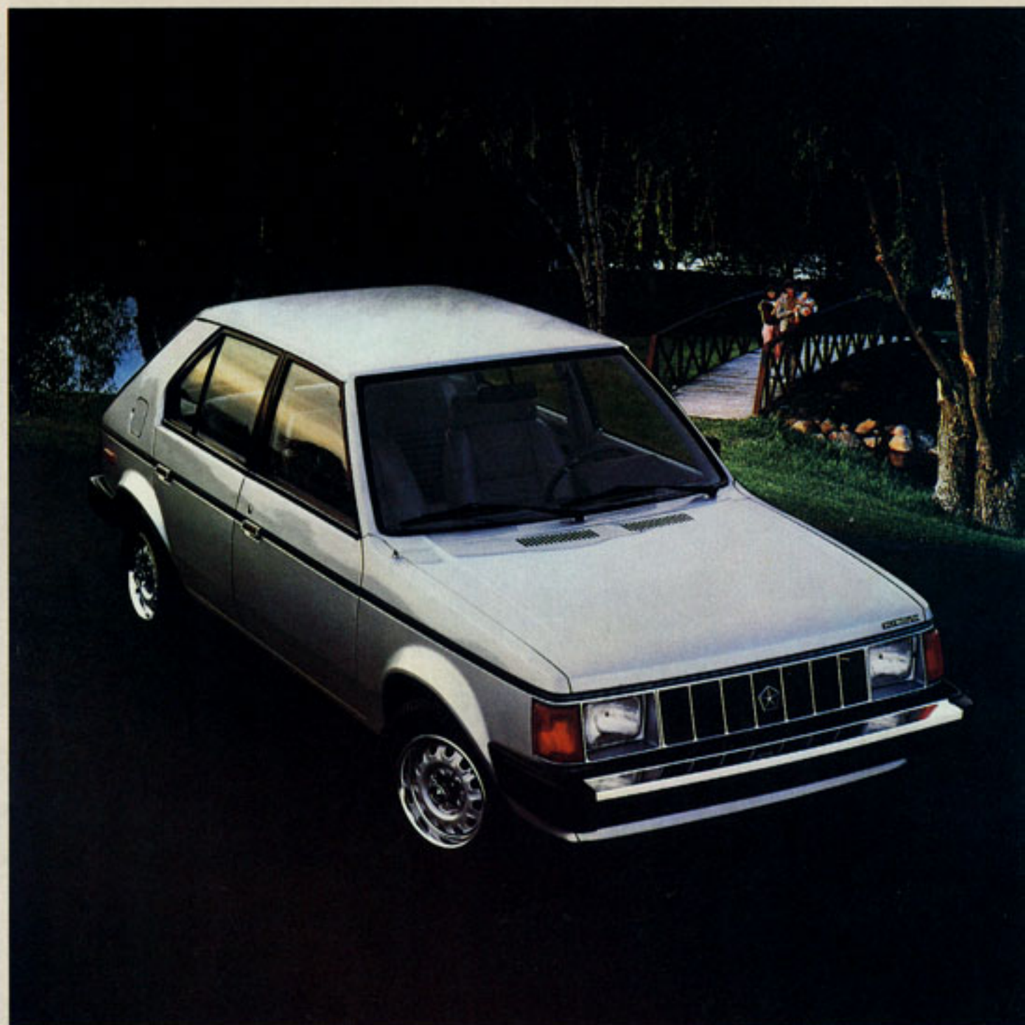
TOP: Horizon SE shown in Garnet Red, with optional Rallye road wheels. ABOVE: Plymouth Horizon shown in White, with standard road wheels.