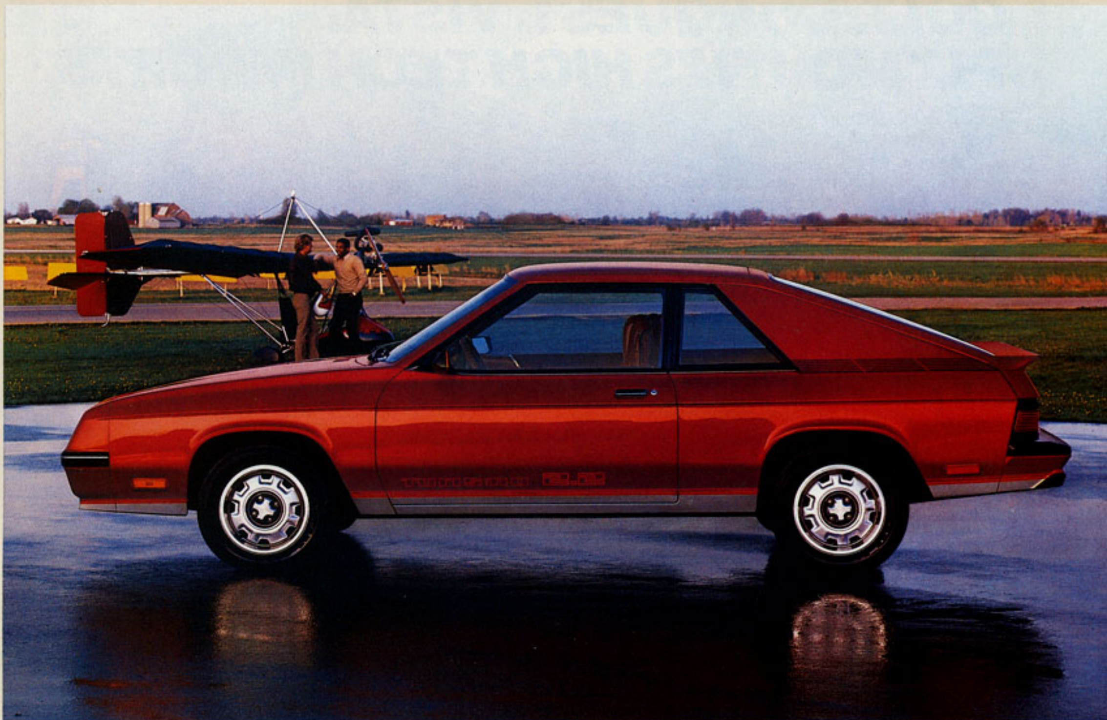
TOP: Plymouth Turismo shown in Spice Brown Metallic, with standard deluxe wheel covers. ABOVE: Turismo 2.2 shown in Garnet Red/Silver Two-Tone, with standard 14-inch Rallye road wheels.