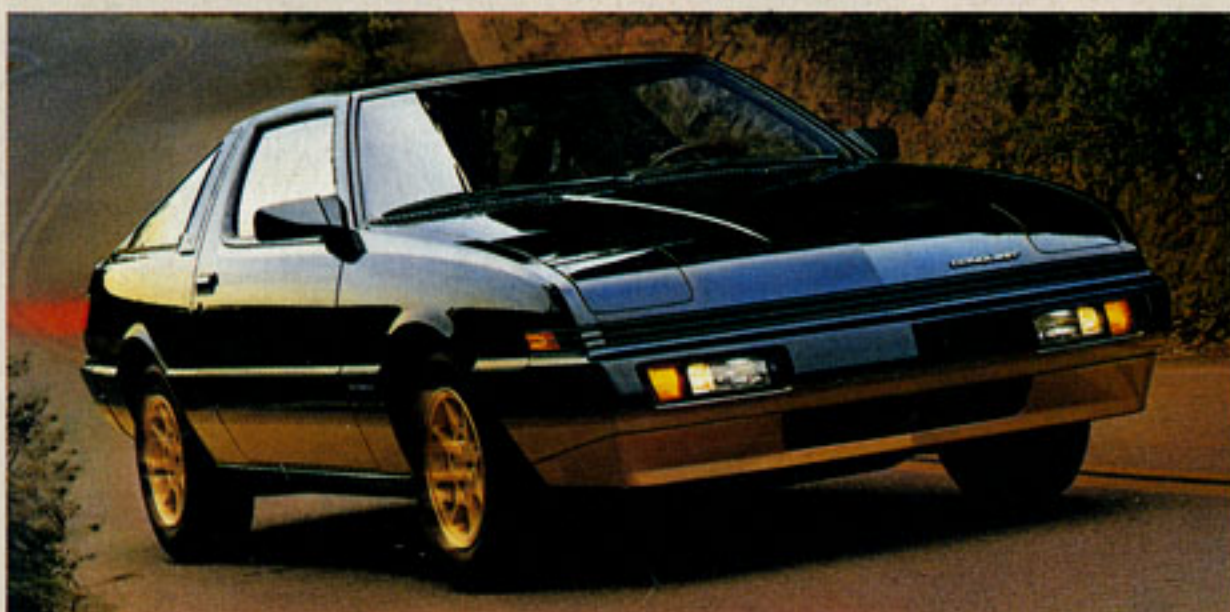
TOP: Plymouth Gran Fury shown in Glacier Blue Crystal Coat, with standard 15-inch deluxe wheel covers. CENTER PAGE: At Left, Colt DL five-door shown in Medium Blue with Blue interior; Center, Colt GTS-Turbo shown in White with Red interior; Right, Colt Vista station wagon shown in Silver/Charcoal with Gray interior. ABOVE: Conquest Technica shown in Black and Gold, with optional color-keyed 15-inch spoke-type aluminum wheels.

All product illustrations and specifications are based on authorized information. Although descriptions are believed correct at publication approval, accuracy cannot be guaranteed. Chrysler Corporation reserves the right to make changes from time to time, without notice or obligation, in prices, specifications, colors and materials, and to change or discontinue models. See your dealer for the latest information.