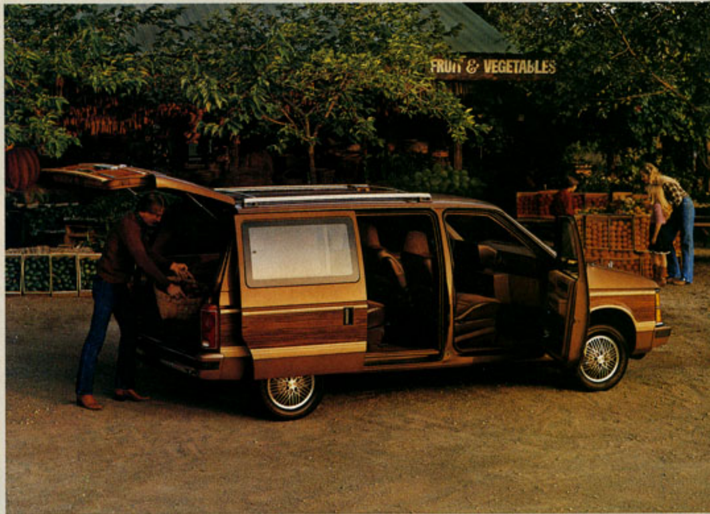
Voyager LE in Saddle Brown Crystal Coat with optional styled road wheels.

There's a quality difference you can see, hear and feel in the 1984 Plymouth Voyager. Designed through extensive use of advanced CAD/CAM (computer aided design/computer assisted manufacturing) technology, Voyager is the product of Chrysler Corporation's $365,000,000 assembly