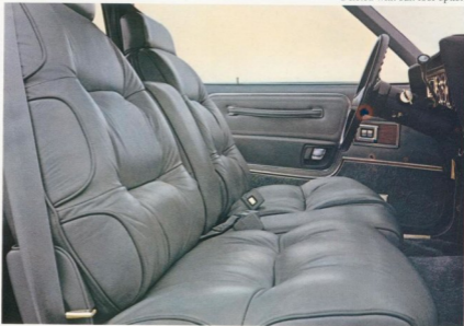
Optional leather-and-vinyl 60/40 seats have a fold-down armrest and passenger recliner. These seats are available on all Medallion models and the Town & Country.