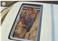
Power-operated tinted-glass sun roof.