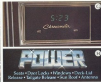
Seats • Door Locks • Windows • Deck-Lid Release • Tailgate Release • Sun Roof • Antenna