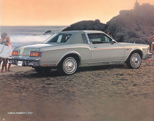
LeBaron Medallion 2-Door