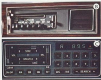
Air conditioning/ Electronic Search Tune AM/FM stereo radio.