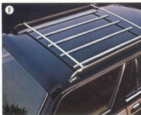
Station wagon air deflector and roof rack.