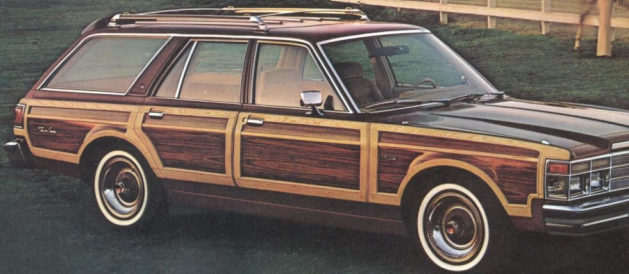
LeBaron Town & Country Wagon