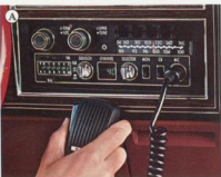
40-channel CB radio.