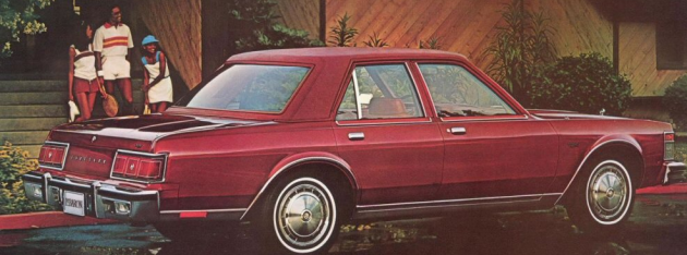
LeBaron Salon 4-Door Sedan