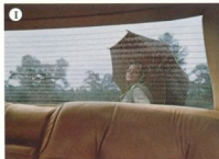
Electric rear window defroster.