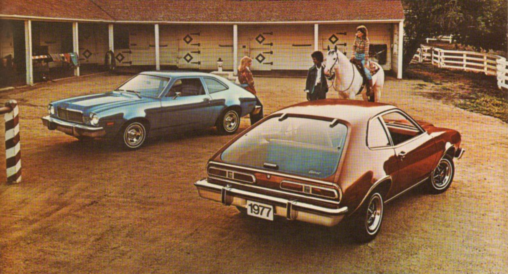
Above, Bobcat 2-door Sedan.