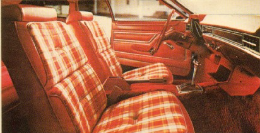
Above, "SC" interior with Optional Deluxe Interior Trim in cloth and vinyl. Below, Standard high-back bucket seats ("SC" model shown).

Mercury Bobcat. Thrifty. Frisky. Good fun.