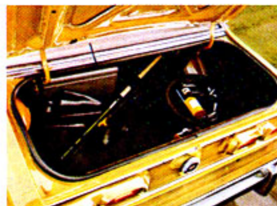
Space Saver Spare Tire