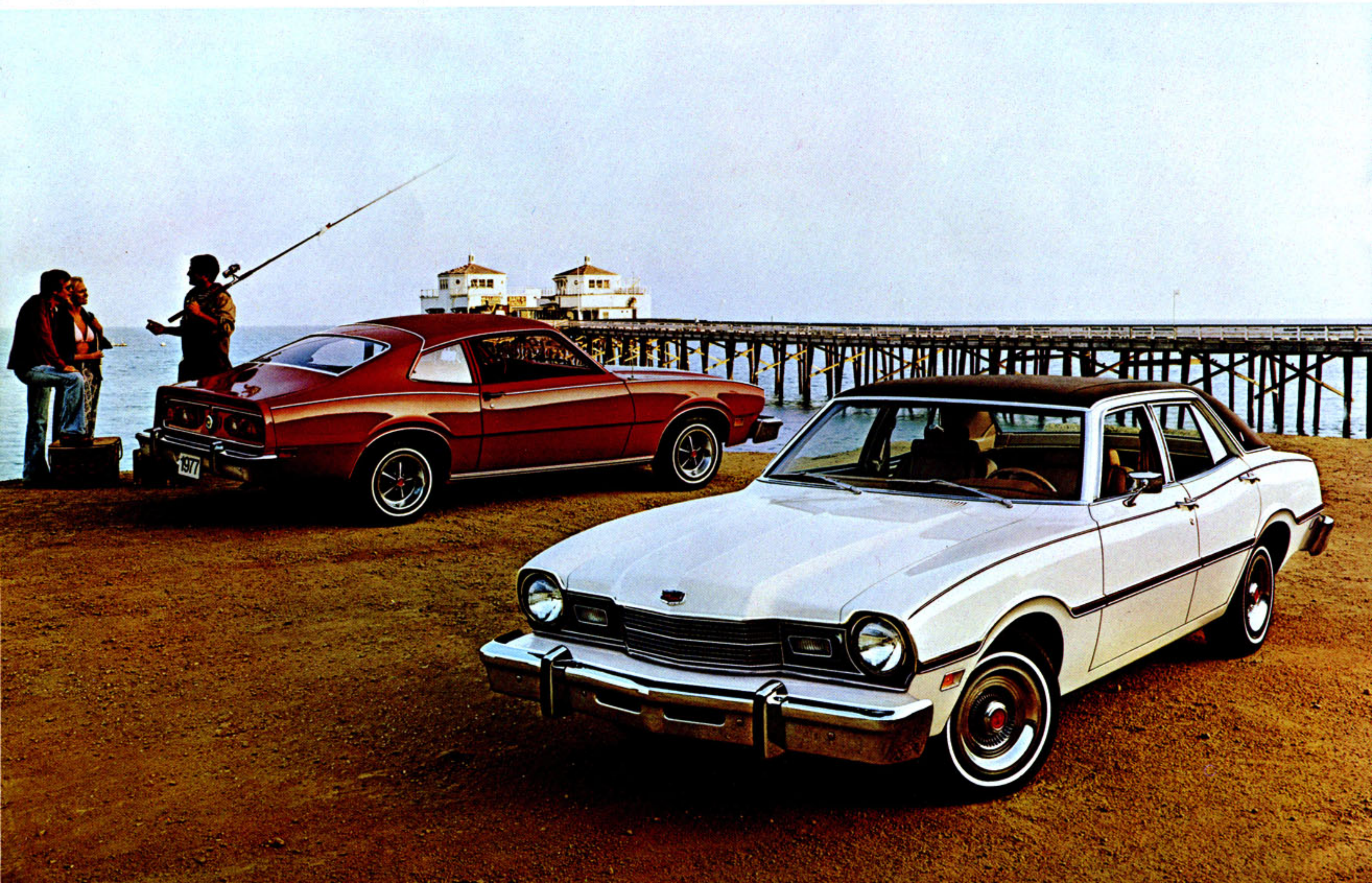
Comet 2-door and Comet 4-door with Custom Option