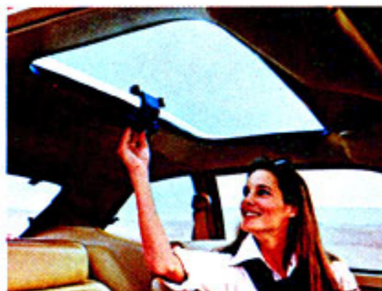
Optional Flip-Up/Removable Moonroof