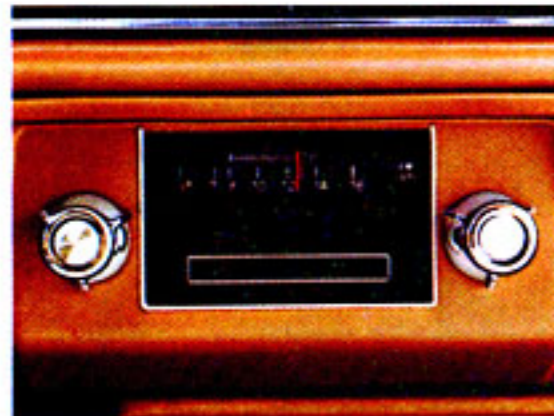
AM Radio with Stereo Tape