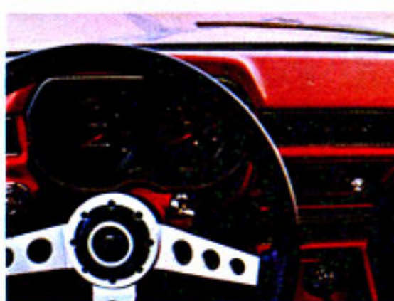
Instrument Cluster with Gauges