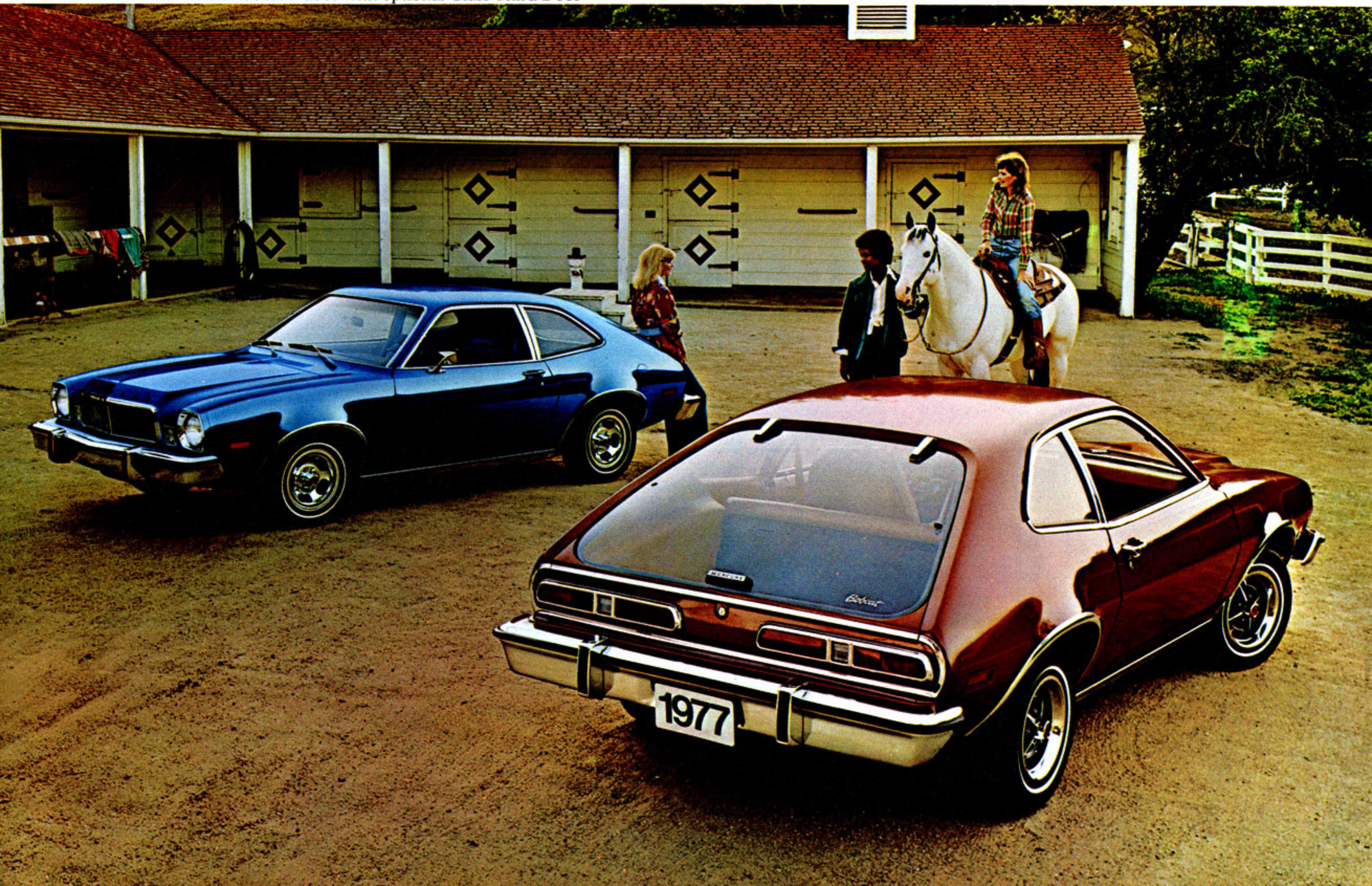
Bobcat 3-door and the Bobcat 3-door with optional Glass Third Door