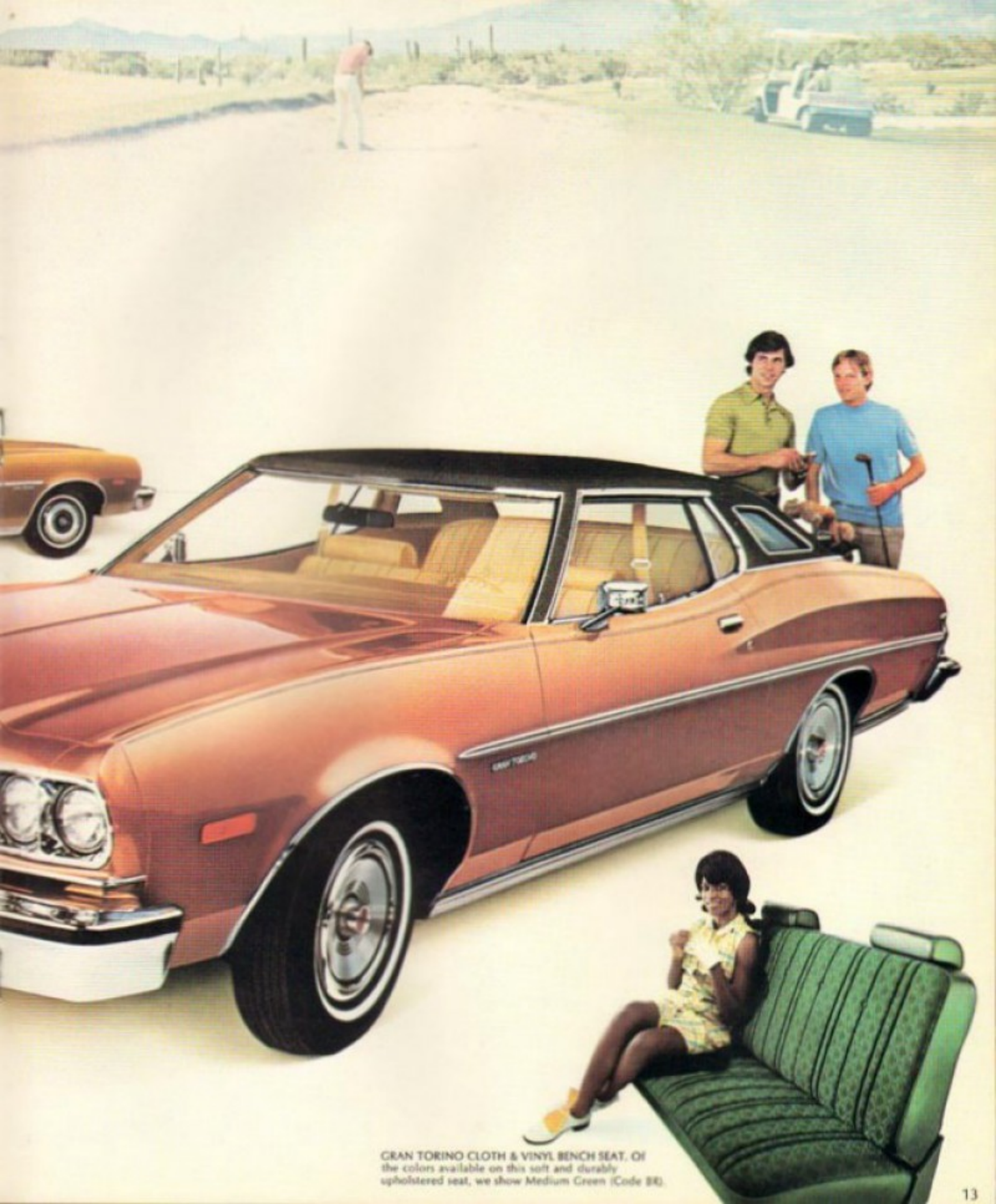
GRAN TORINO CLOTH & VINYL BENCH SEAT. Of the colors available on this soft and durably upholstered seat, we show Medium Green (Code 3R).