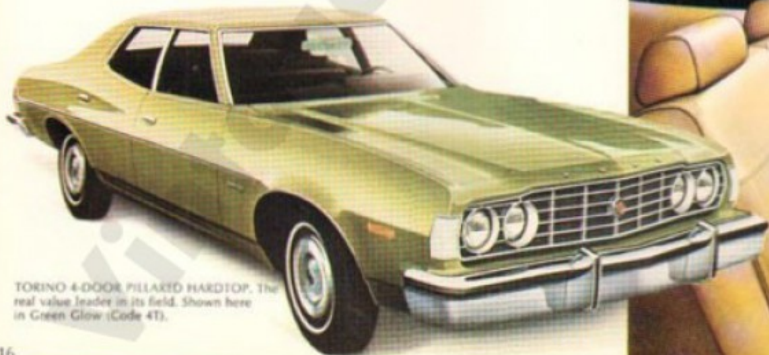
TORINO 4-DOOR PILLARED HARDTOP. The real value leader in its field. Shown here in Green Glow (Code 4T).

TORINO ALL-VINYL INTERIOR. Comes in Light Tan (Code AU) shown, plus two other choices: Black (AA), Medium Blue (AB).