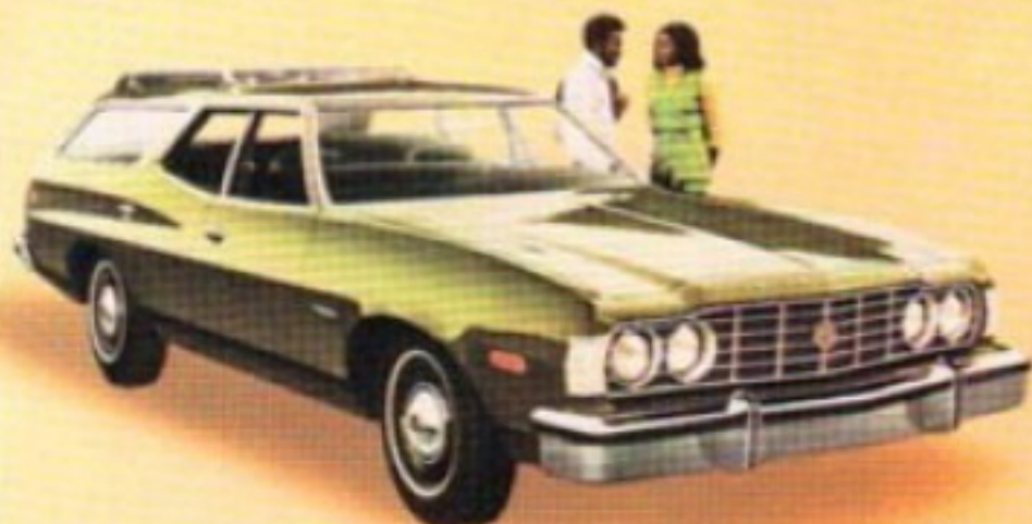
TORINO WAGON. Low initial cost but no skimping on functional features. Roof rack available. Shown in Dark Olive Gold Metallic (Code 6M).

GRAN TORINO SQUIRE, with Squire Brougham option includes deluxe wheel covers, hood ornament, front split bench seats trimmed in super-soft vinyl, cut-pile carpeting, electric clock and carpeted load floor. Color shown is Saddle Bronze Metallic (Code 5T).