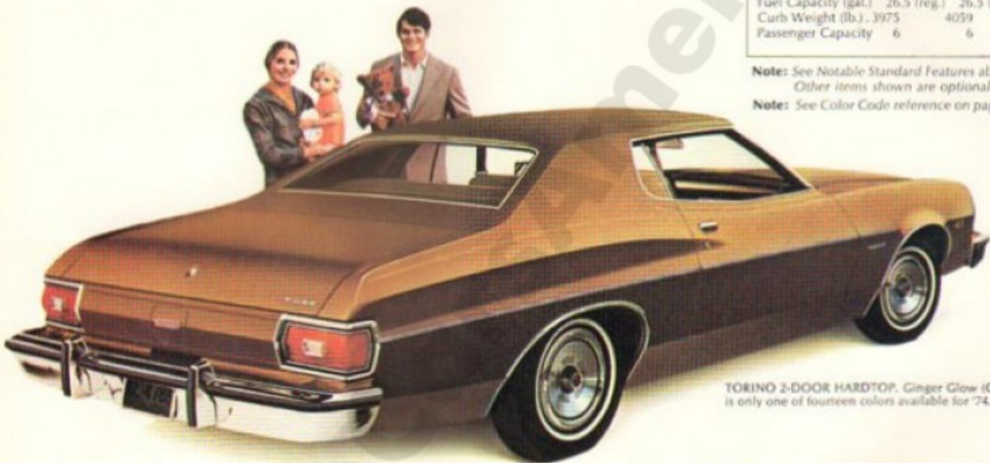
TORINO 2-DOOR HARDTOP. Ginger Glow (Code 31) is only one of fourteen colors available for '74.

Note: See Color Code reference on page 2.