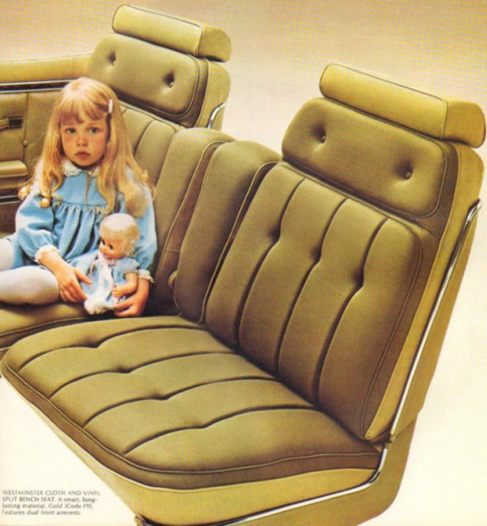
WESTMINSTER CLOTH AND VINYL SPLIT BENCH SEAT. A smart, long- lasting material. Gold (Code FY). Features dual front armrests.