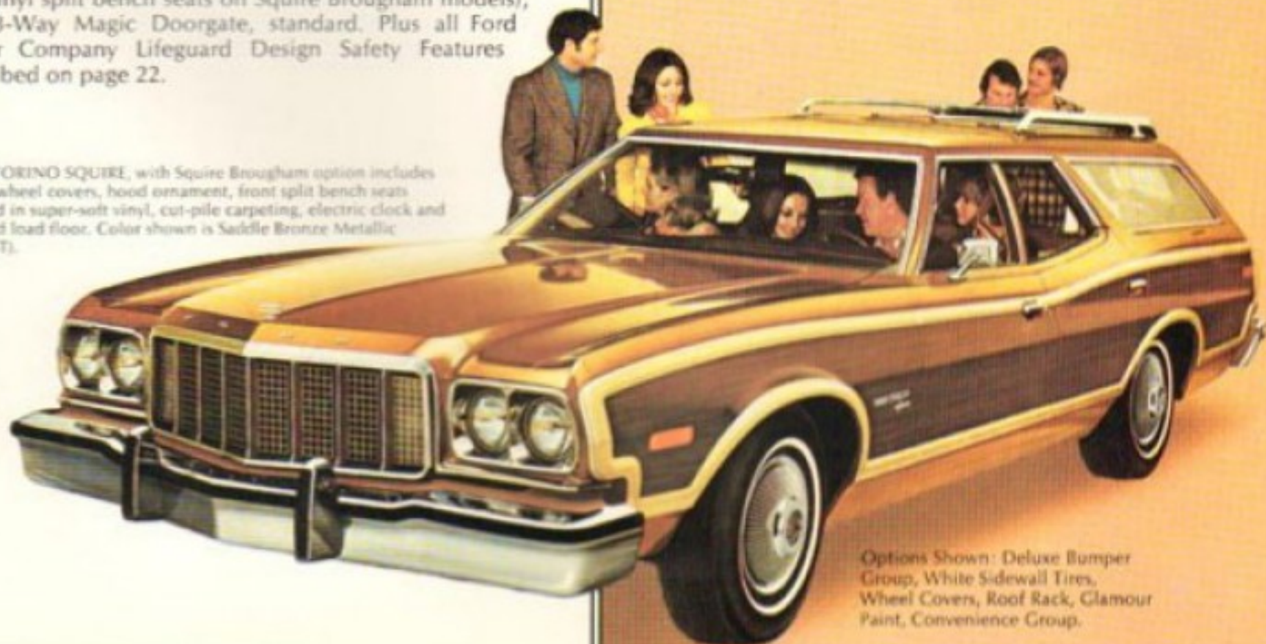
Options Shown: Deluxe Bumper Group, White Sidewall Tires, Wheel Covers, Roof Rack, Glamour Paint, Convenience Group.