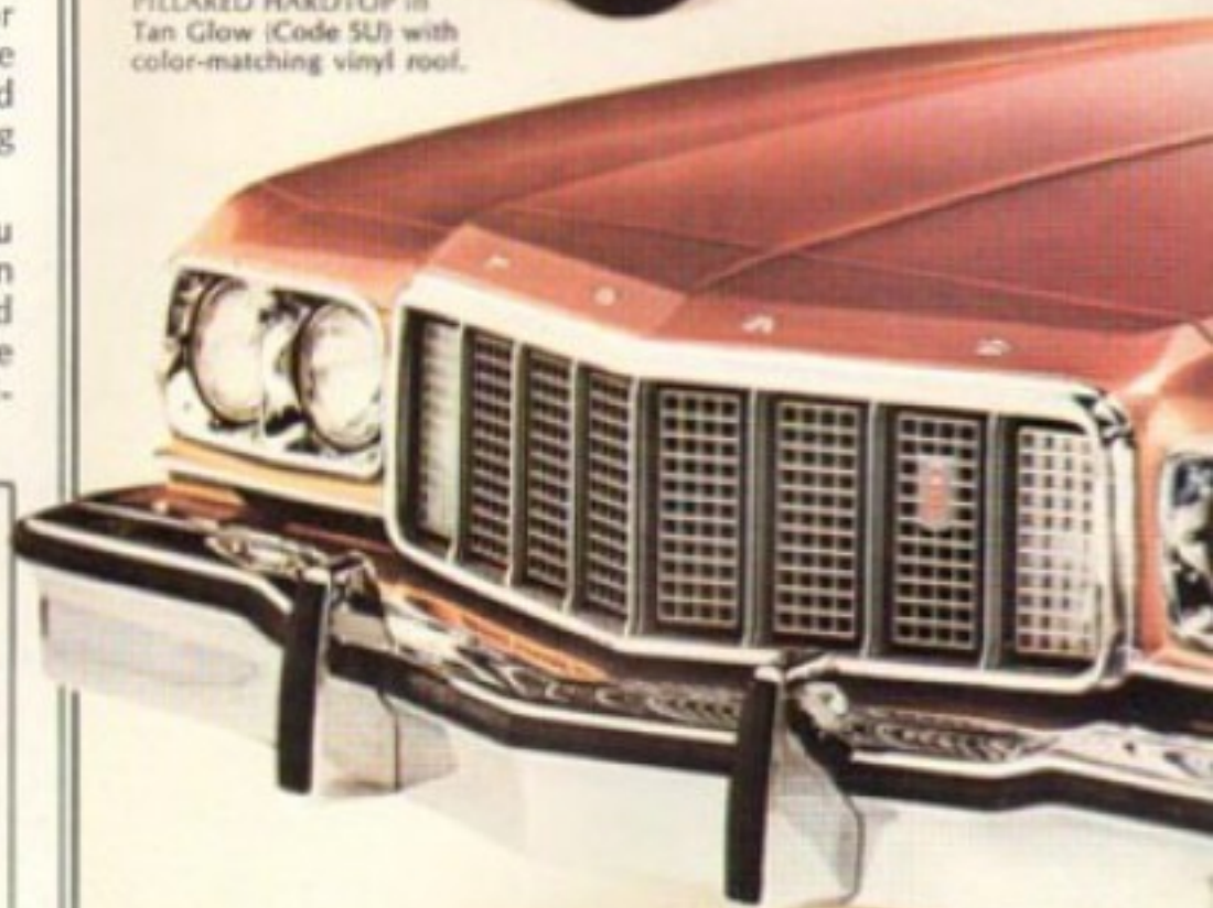
GRAN TORINO 2-DOOR HARDTOP. Front treatment emphasizes strength of Gran Torino's new looks. Shown in Medium Copper Metallic (Code 5M) with tasteful Black vinyl roof and opera windows.