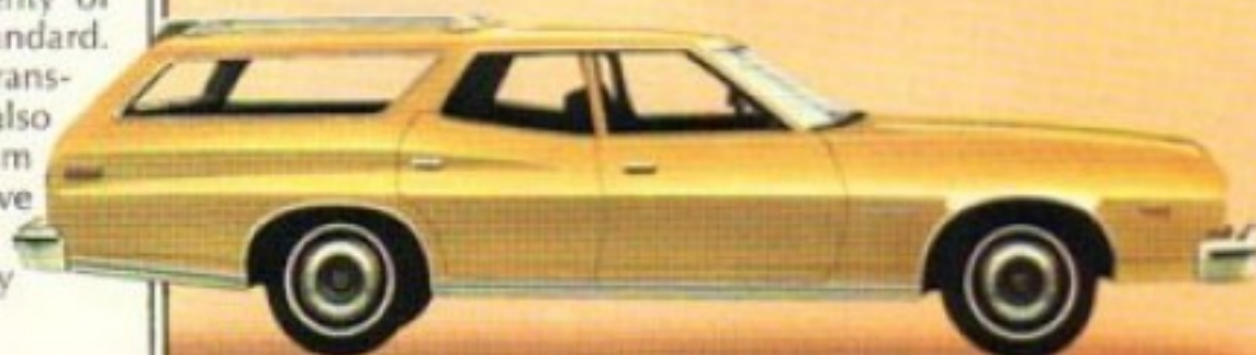
GRAN TORINO WAGON. Solid. Quiet road manners. 85 cubic feet capacity. Smartly finished in Gold Glow (Code 6F), one of sixteen colors.