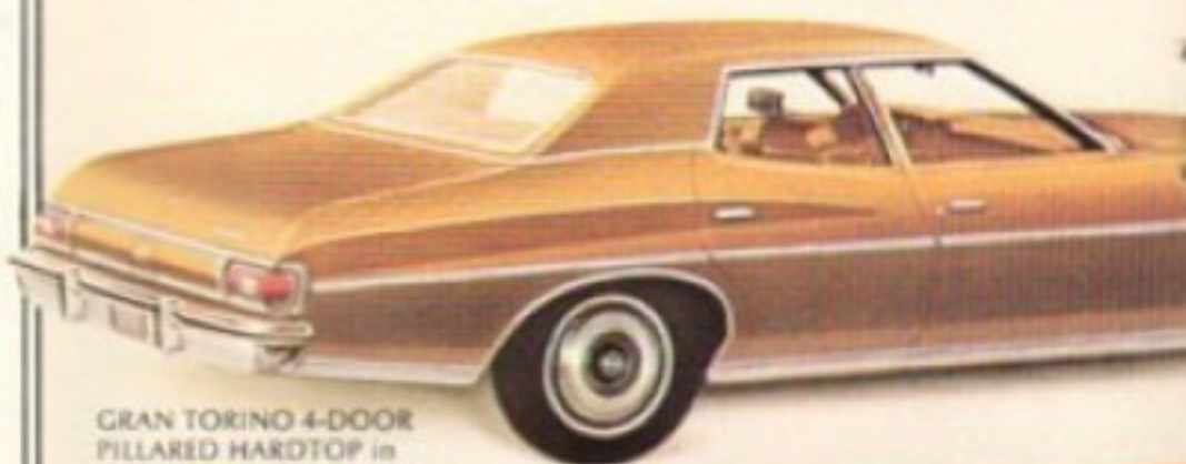
GRAN TORINO 4-DOOR PILLARED HARDTOP in Tan Glow (Code 5U) with color-matching vinyl roof.

Note: See Color Code reference on page 2.