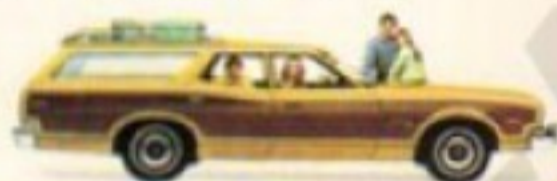
GRAN TORINO SQUIRE STATION WAGON in Medium Ivy Yellow (Code 6N).

Note: See Notable Standard Features: Gran Torino Elite, page 7; Gran Torino Brougham, page 10; Gran Torino, page 12; Gran Torino Sport, page 15; Torino, page 16. Other items illustrated are optional.