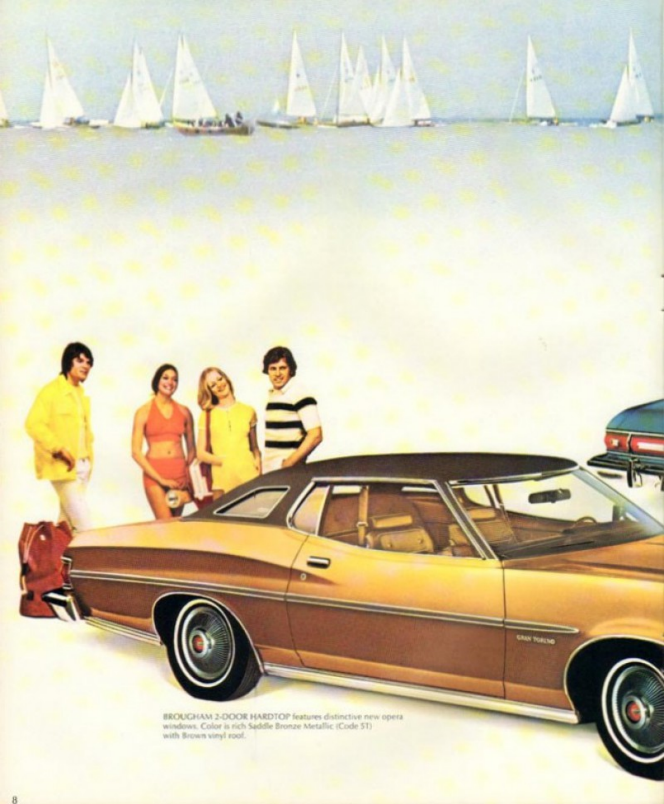
BROUGHAM 2-DOOR HARDTOP features distinctive new opera windows. Color is rich Saddle Bronze Metallic (Code 5T) with Brown vinyl roof.