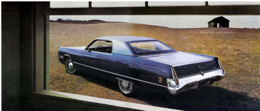
Imperial LeBaron 2-Door Hardtop in Regal Blue Metallic. Extra care in engineering ... it makes a difference.