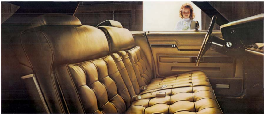
Optional Split-Bench Seat in Cologne Leather for the 4-Door Imperial. Extra care in engineering... it makes a difference.