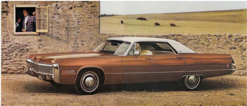
Imperial LeBaron 4-Door Hardtop in Chestnut Metallic. Extra care in engineering... it makes a difference.