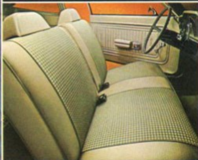
2- and 4-Door Interior

Grabber's standard interior comes with Ruffino Vinyl (shown in Black below) or Manston Cloth seat trims, color-keyed carpeting, a black center instrument panel with bright molding, and the 2-spoke steering wheel.