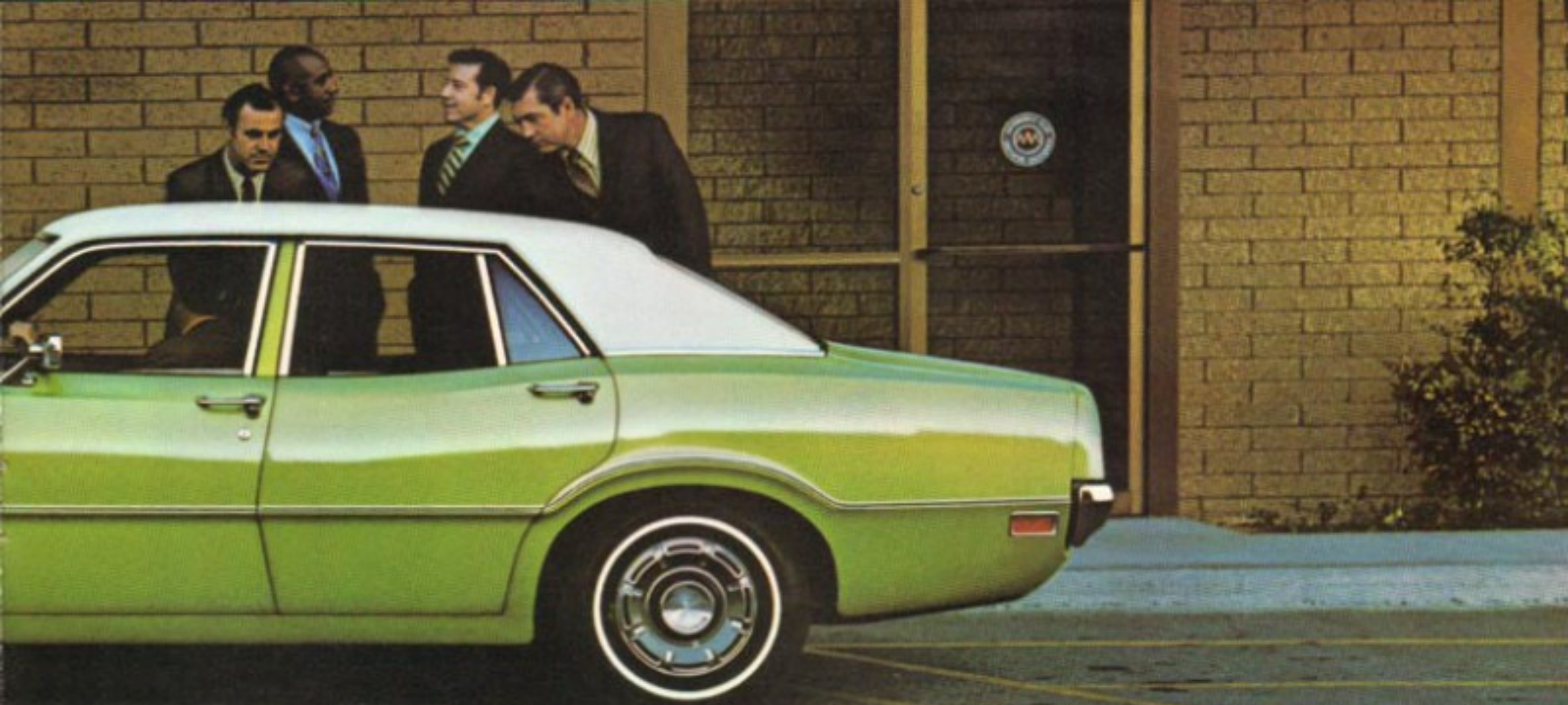
Family economy 4-Door Sedan