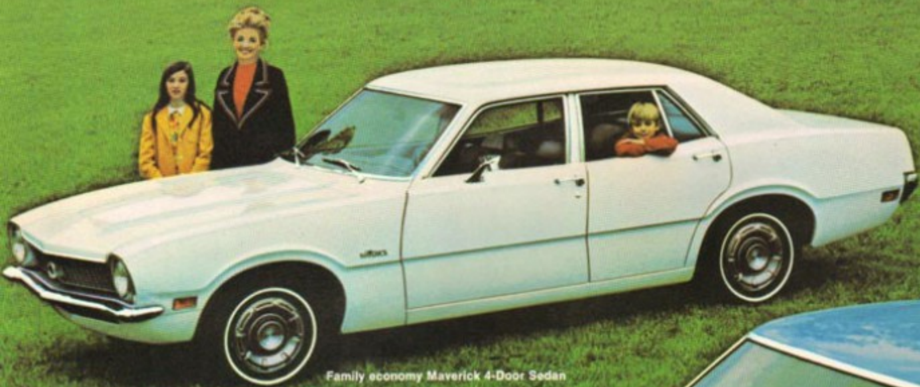
Family economy Maverick 4-Door Sedan