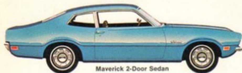
Maverick 2-Door Sedan

Information shown was correct when approved for printing. Ford Division reserves the right to discontinue, or change at any time its product specifications or design without incurring obligations. Some items illustrated or described are optional at extra cost. Many options are offered on all models. Some are required in combination with other options. Always see your Ford Dealer for full details.