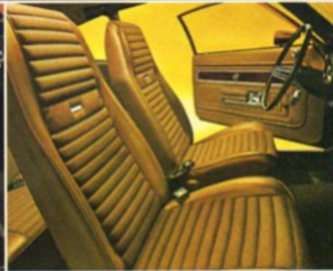
High Back Bucket Seats