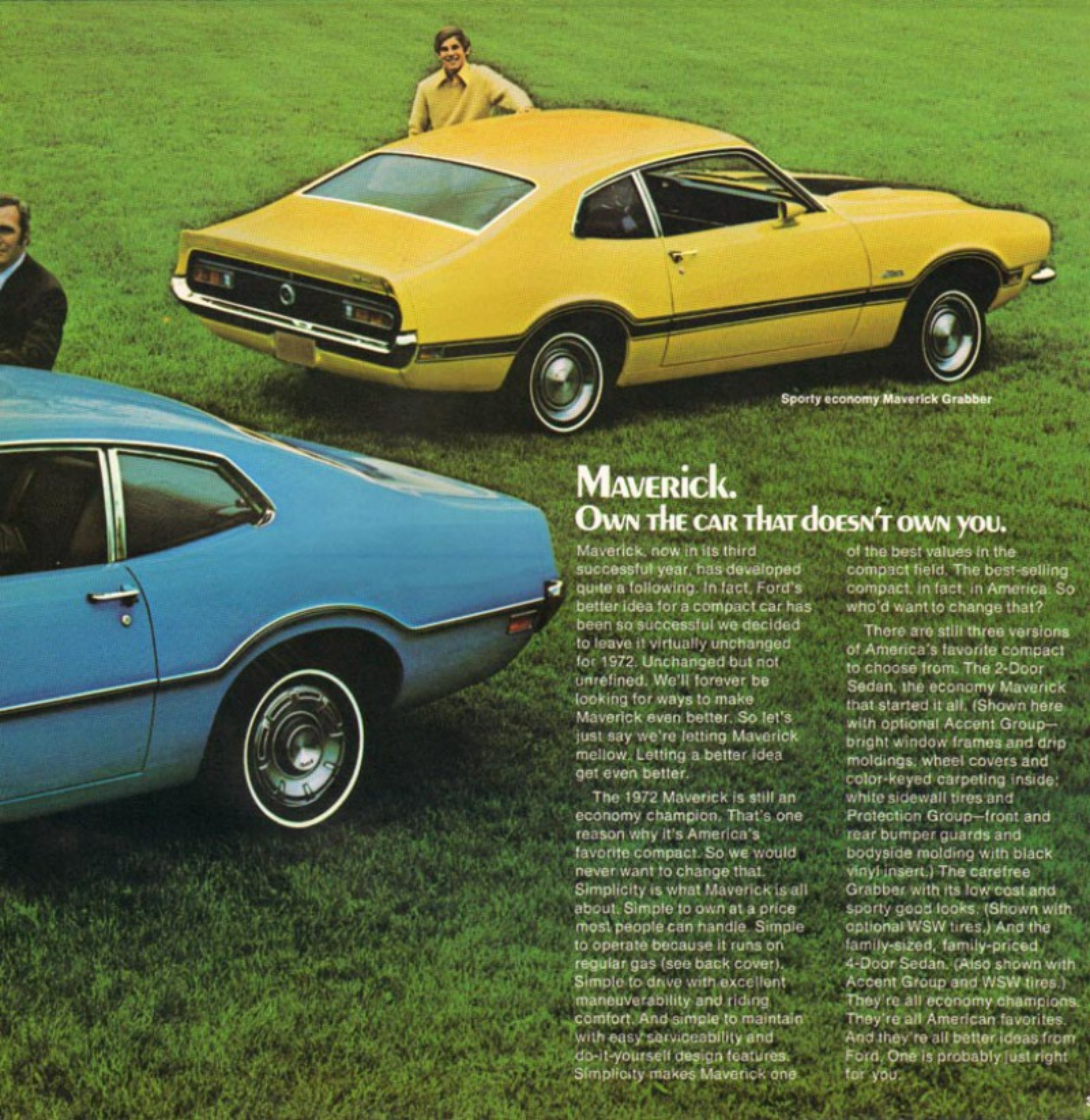
Sporty economy Maverick Grabber