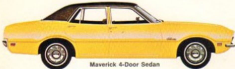
Maverick 4-Door Sedan