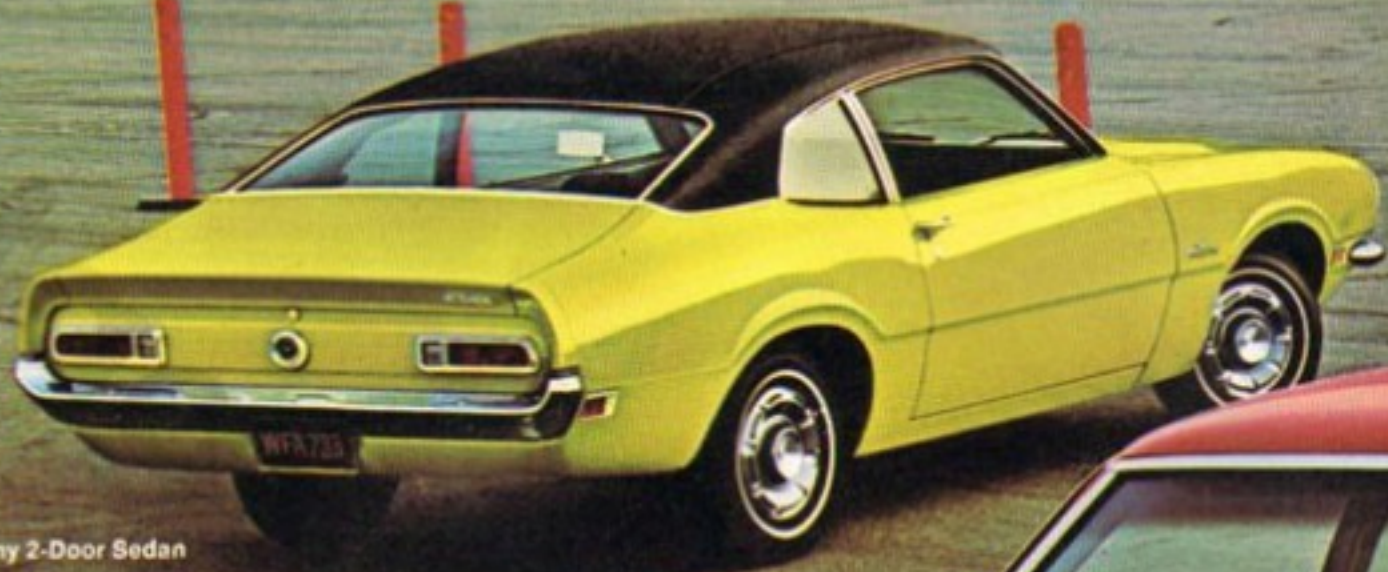
Solid economy 2-Door Sedan