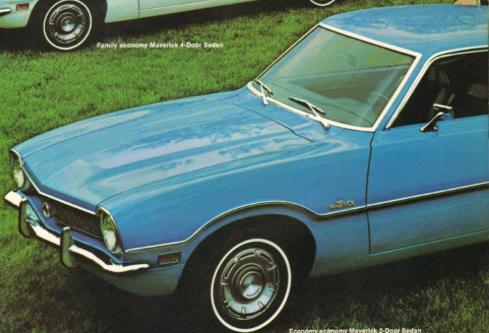
Economy economy Maverick 2-Door Sedan