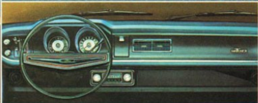
Air Conditioning, Power Steering, AM Radio

Maverick interiors are designed with your individuality in mind. So, go ahead, make your Maverick as personal as you want inside.