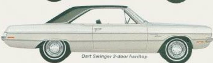
Dart Swinger 2-door hardtop