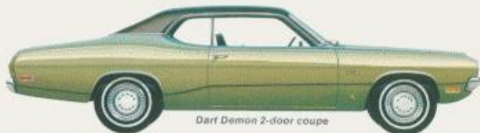
Dart Demon 2-door coupe