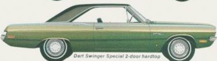
Dart Swinger Special 2-door hardtop