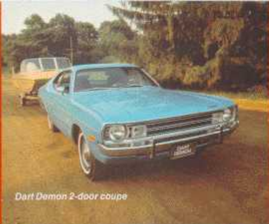
Dart Demon 2-door coupe