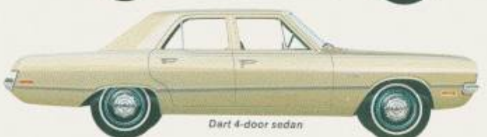
Dart 4-door sedan