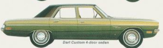
Dart Custom 4-door sedan