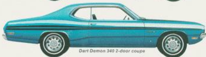
Dart Demon 340 2-door coupe