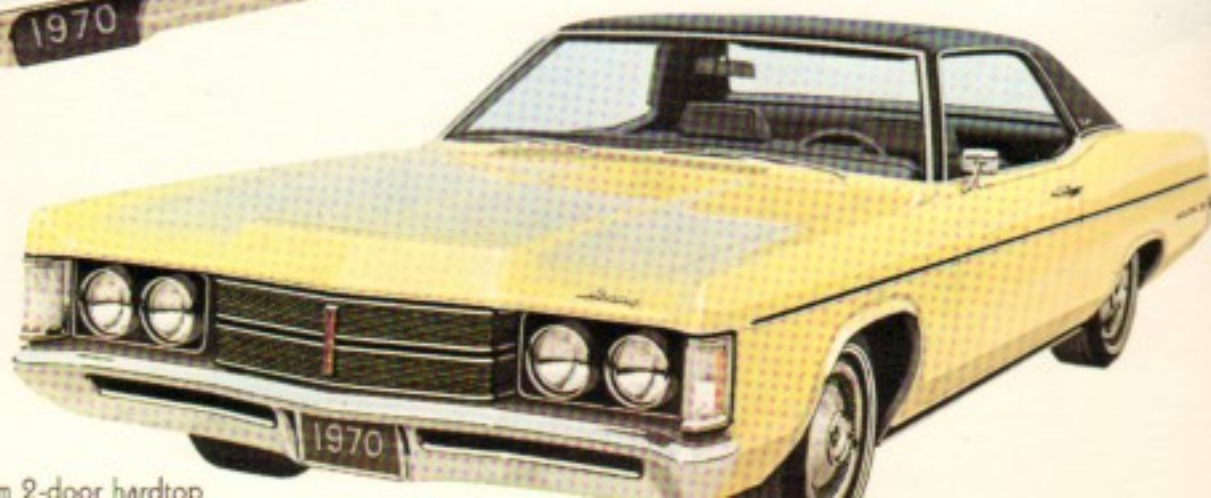
Mercury Monterey Custom 2-door hardtop