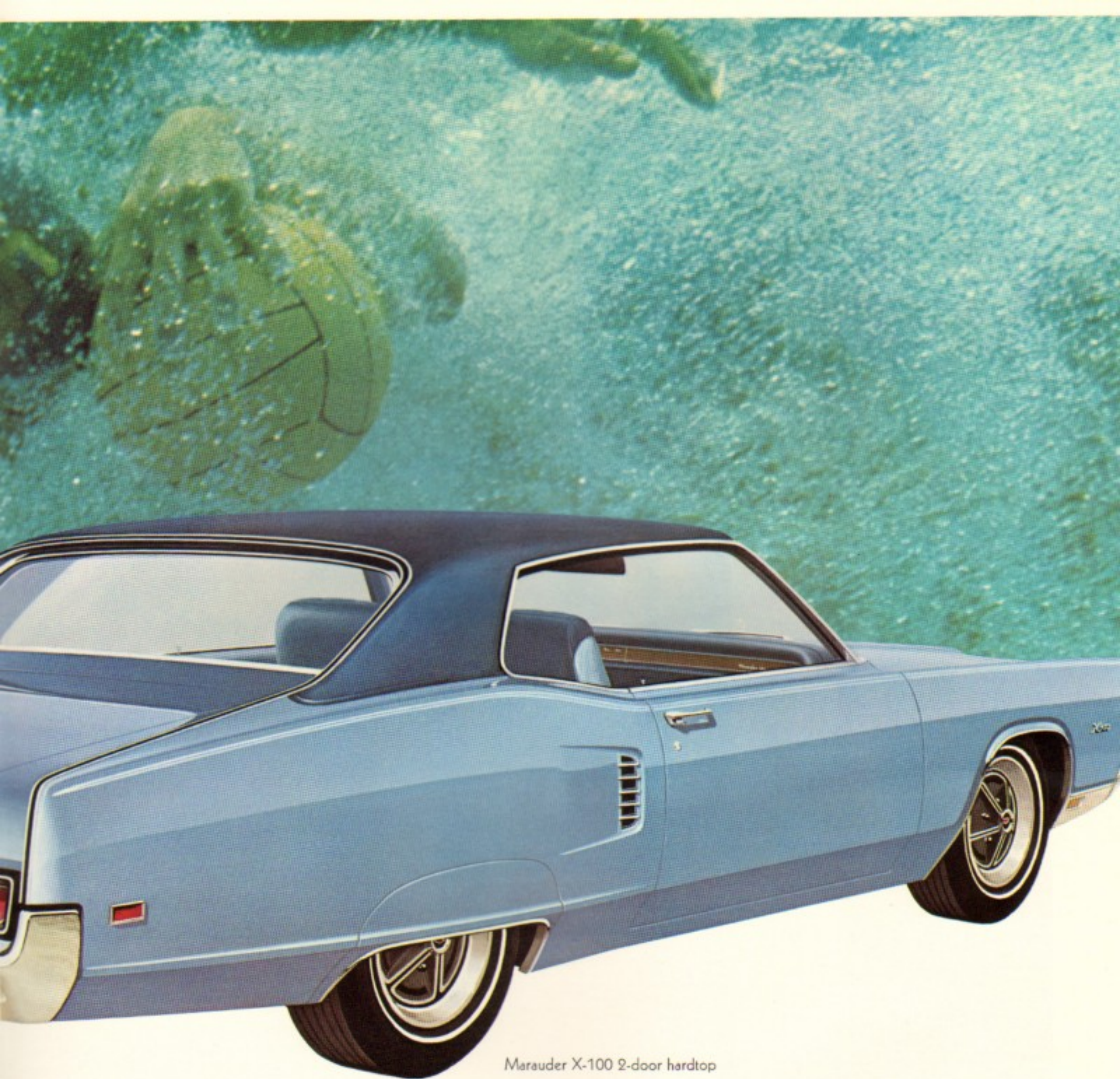
Marauder X-100 2-door hardtop