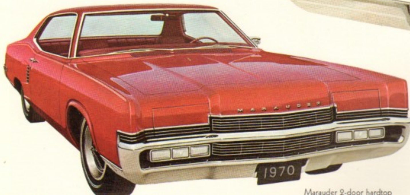
Marauder 2-door hardtop