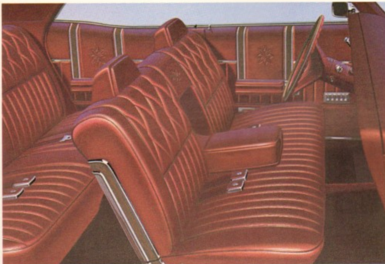
Marquis interior with standard bench seat