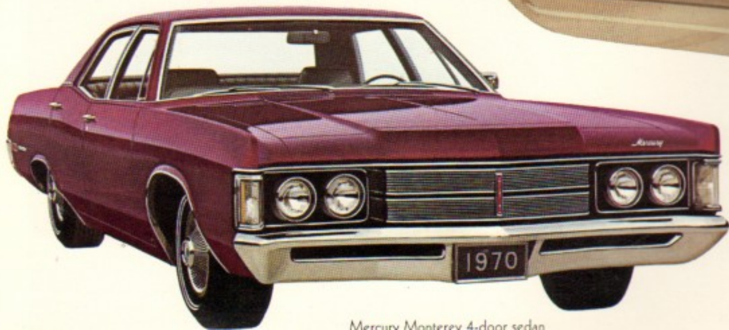
Mercury Monterey 4-door sedan