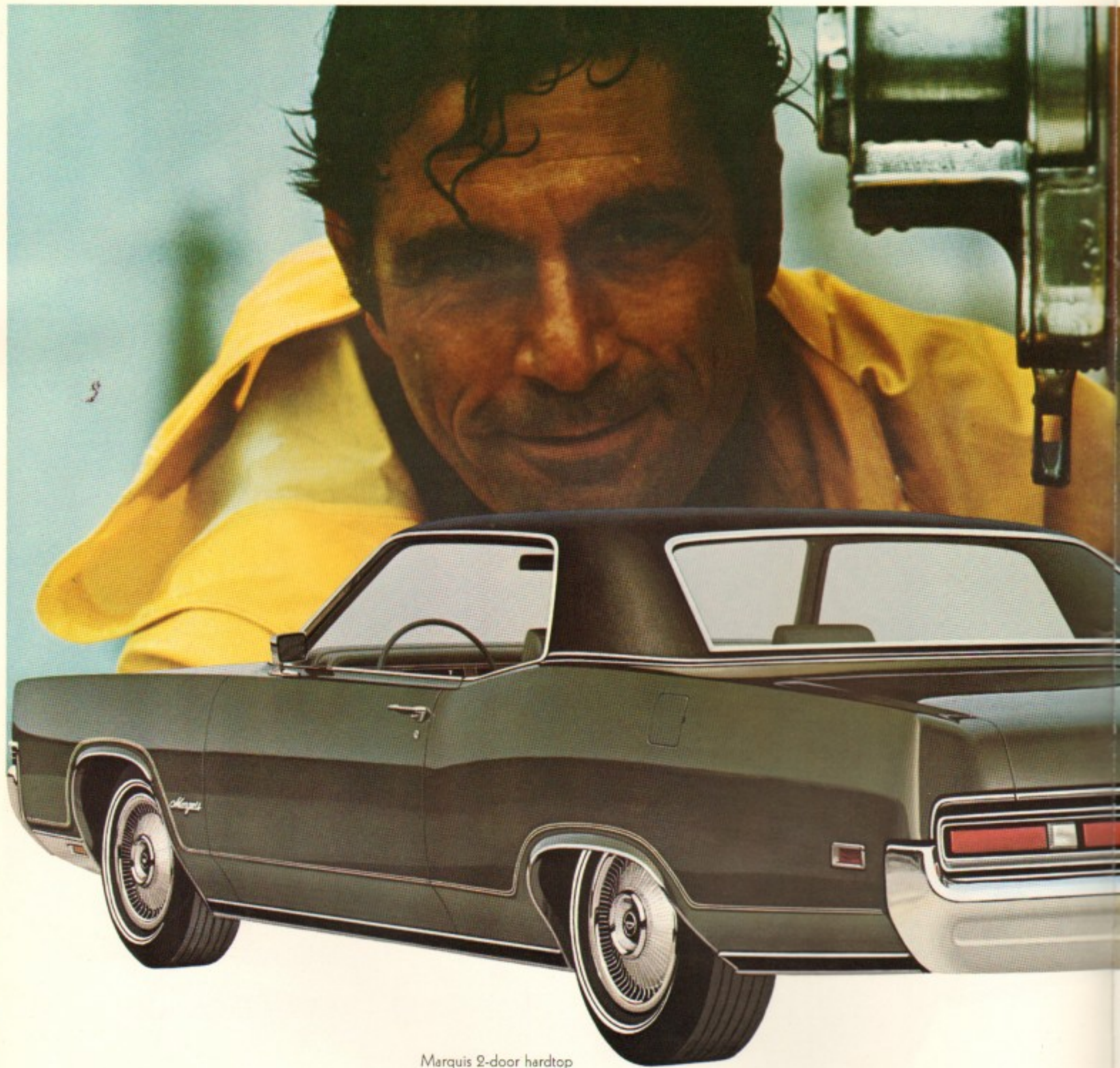
Marquis 2-door hardtop