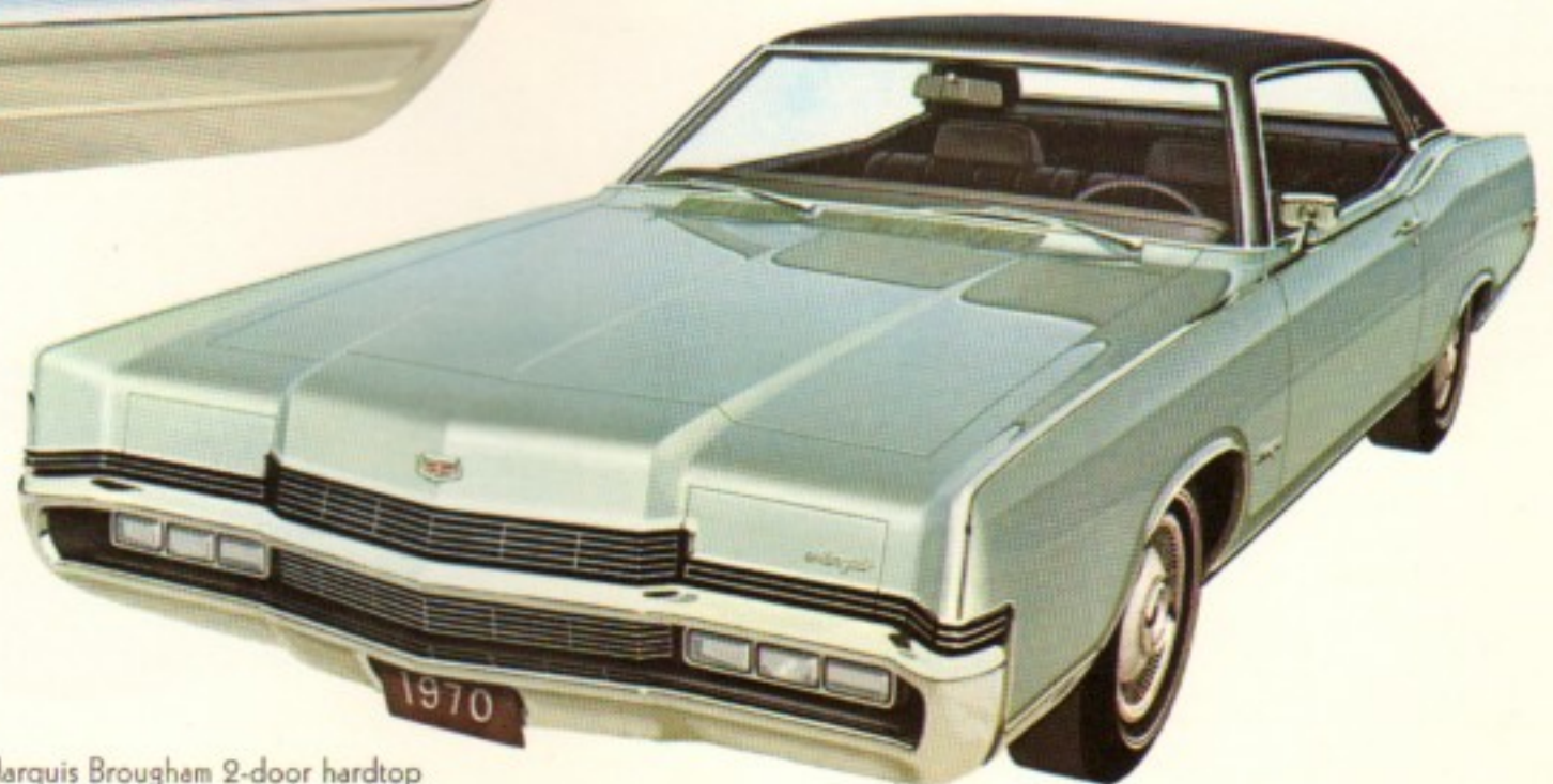
Marquis Brougham 2-door hardtop

The Lincoln Continental heritage of Marquis and Marquis Brougham is particularly apparent out on the road. The ride is in every respect luxurious—smooth, quiet and exceptionally stable. This is the result of wide tread, large front springs, extra insulation, enlarged stabilizer bar and ultra-quiet exhaust system. A big 429 cubic inch, 320 horsepower V-8 engine with 2-barrel carburetor is standard in every Marquis and Brougham sedan, hardtop and convertible. It delivers a comforting surge of power whenever required. Select-Shift automatic transmission is also standard as are a great many other driving conveniences and styling and comfort features. Most of these are listed on page 9. You can add to the extraordinary pleasure of driving Marquis or Brougham by selecting some of the more popular options described on pages 26 and 27.