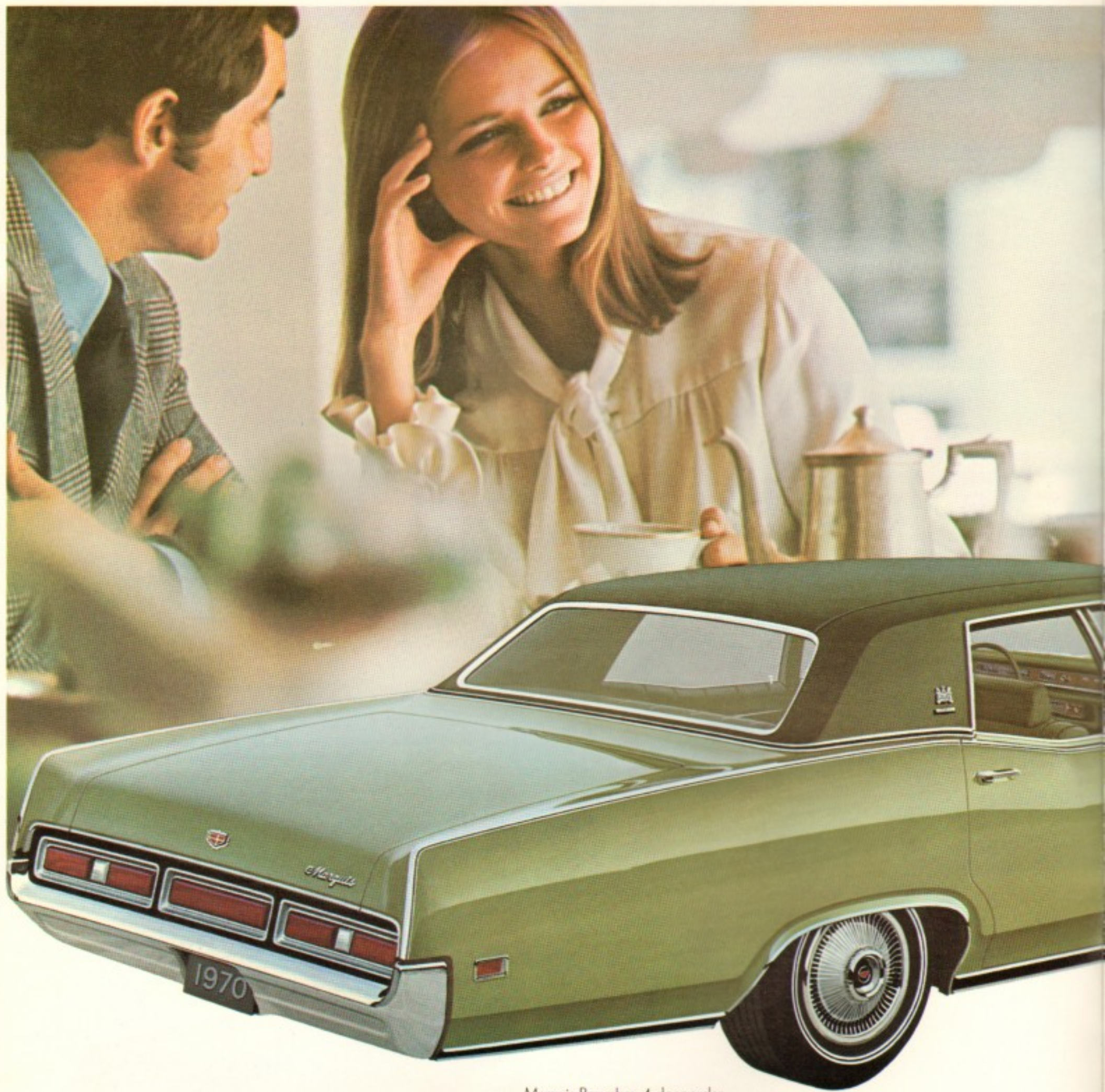
Marquis Brougham 4-door sedan