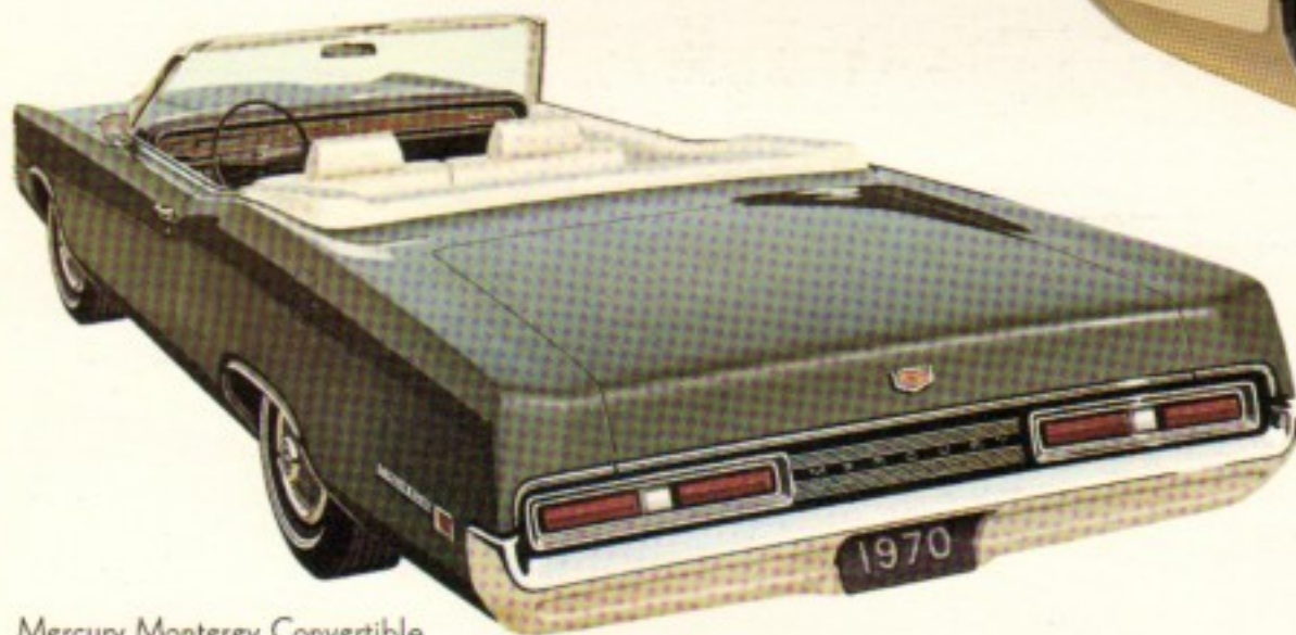
Mercury Monterey Convertible