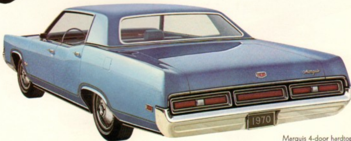
Marquis 4-door hardtop

Marquis and Marquis Brougham are the most luxurious medium-priced cars from Lincoln-Mercury for 1970. They are distinguished in their field by the most dramatic styling since the Continental Mark III. In all, there are nine models—Marquis 4-door sedan, 4-door hardtop, 2-door hardtop and convertible. Marquis Brougham is available in a 4-door sedan, 2-door hardtop and 4-door hardtop. All of these cars are illustrated on the following pages. The Marquis Station Wagon and Marquis Colony Park Station Wagon are described in a separate station wagon catalog available from your Lincoln-Mercury dealer. Marquis Brougham models differ from Marquis in such distinctive standard features as a limousine-like vinyl-covered roof, unique ornamentation and a remarkably luxurious interior, which is shown and described on page 10.