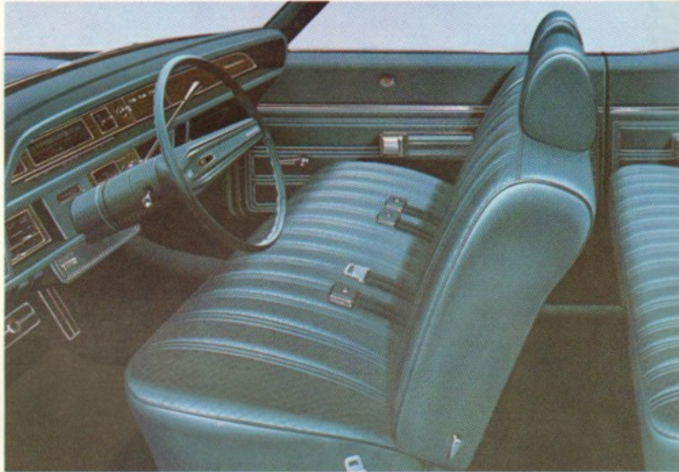
Marauder standard interior with cloth-and-vinyl bench seat