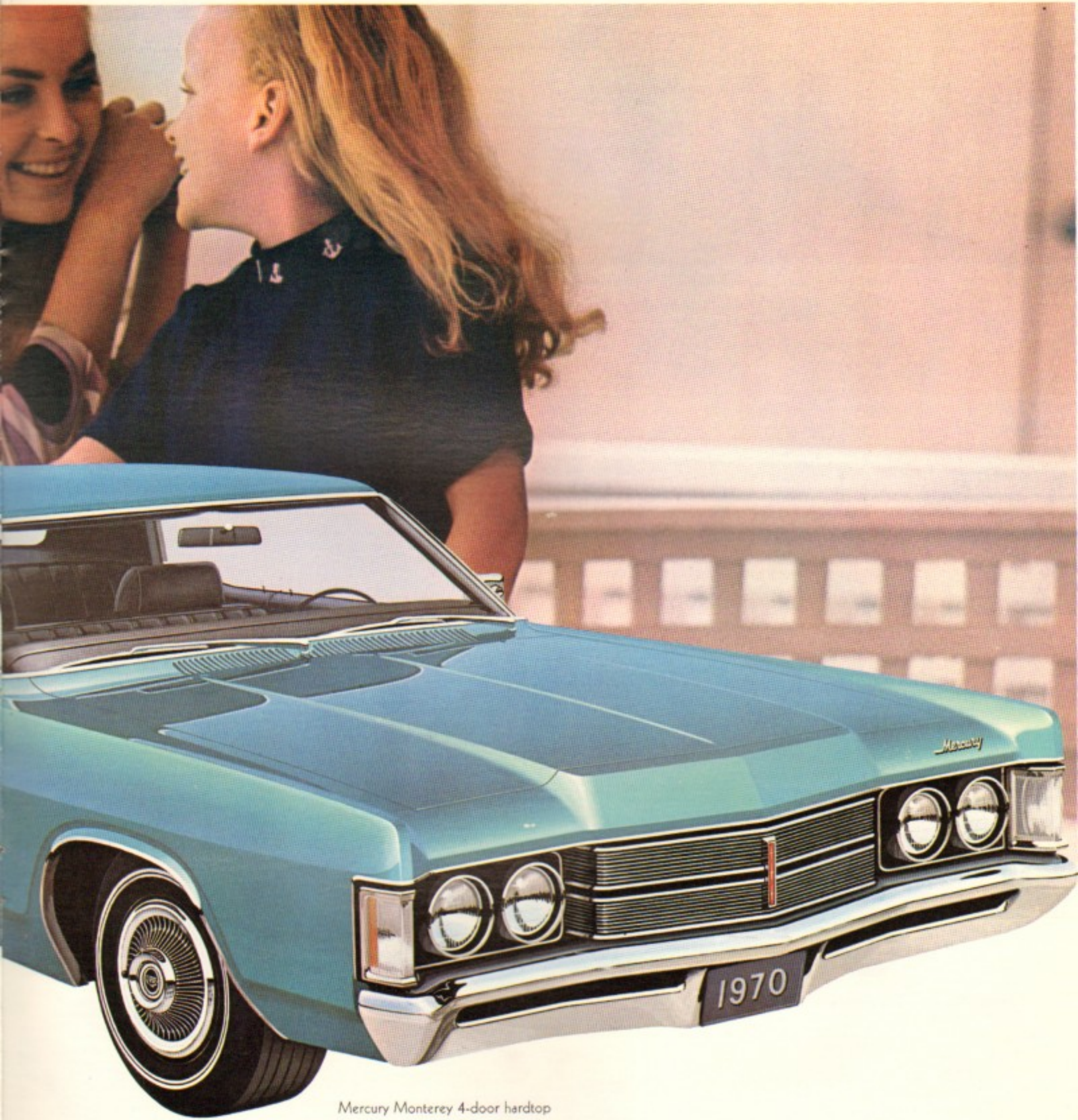
Mercury Monterey 4-door hardtop