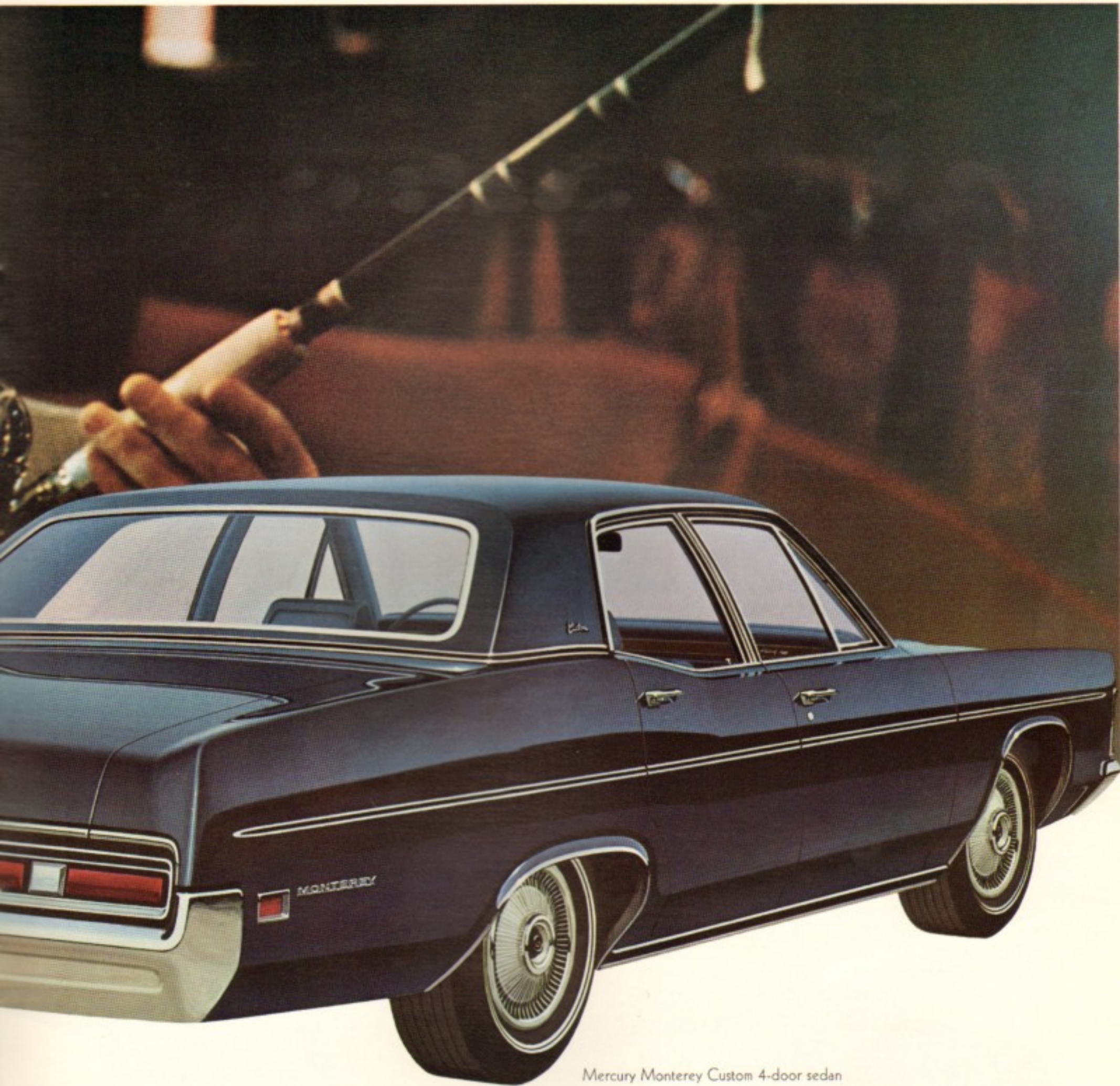
Mercury Monterey Custom 4-door sedan