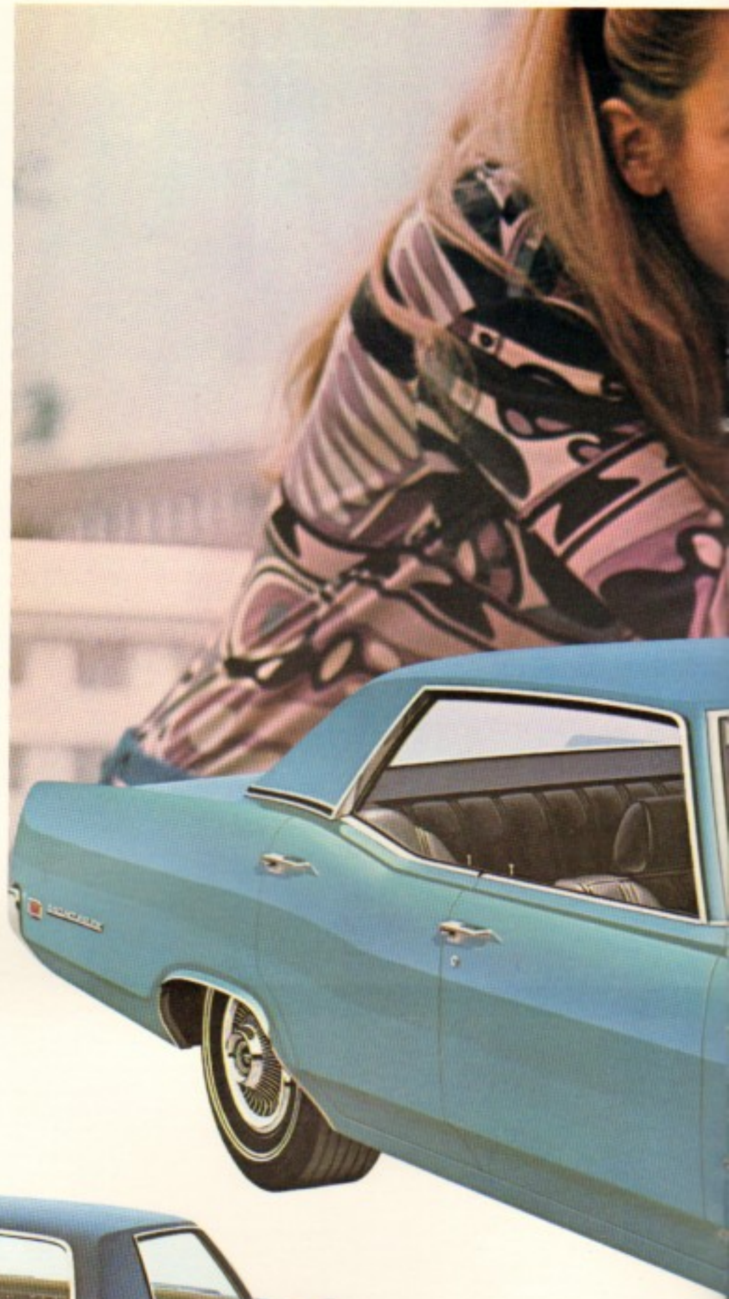
Mercury Monterey Custom 4-door hardtop