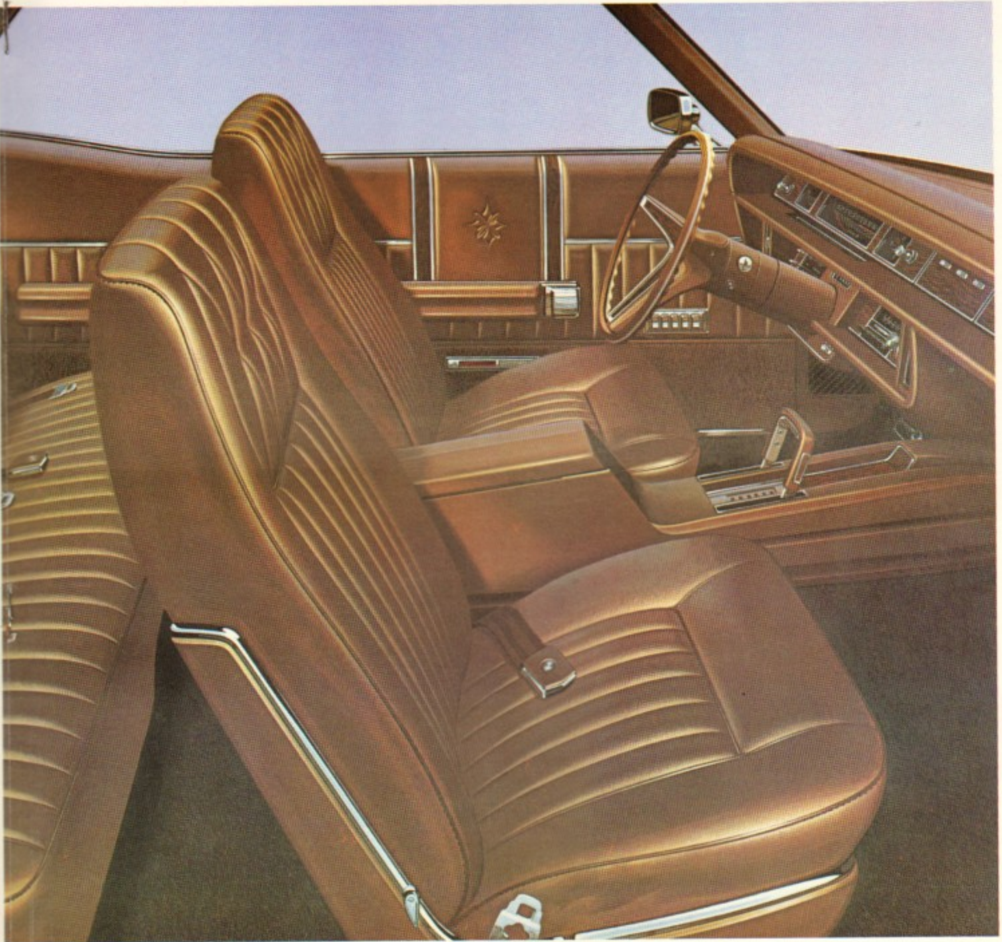
Marauder X-100 standard interior with hi-back bucket seats and center sports console

cloth-and-vinyl bench seat, shown in the upper picture on the left hand page, is available in black, dark red, medium blue, medium green and light gold. New simulated dark teakwood appliques on the instrument panel are featured along with a new steering wheel design and rocker type light switches. An all-vinyl bench seat or Marauder X-100 hi-back bucket seats and center sports console interior may also be ordered at extra cost.