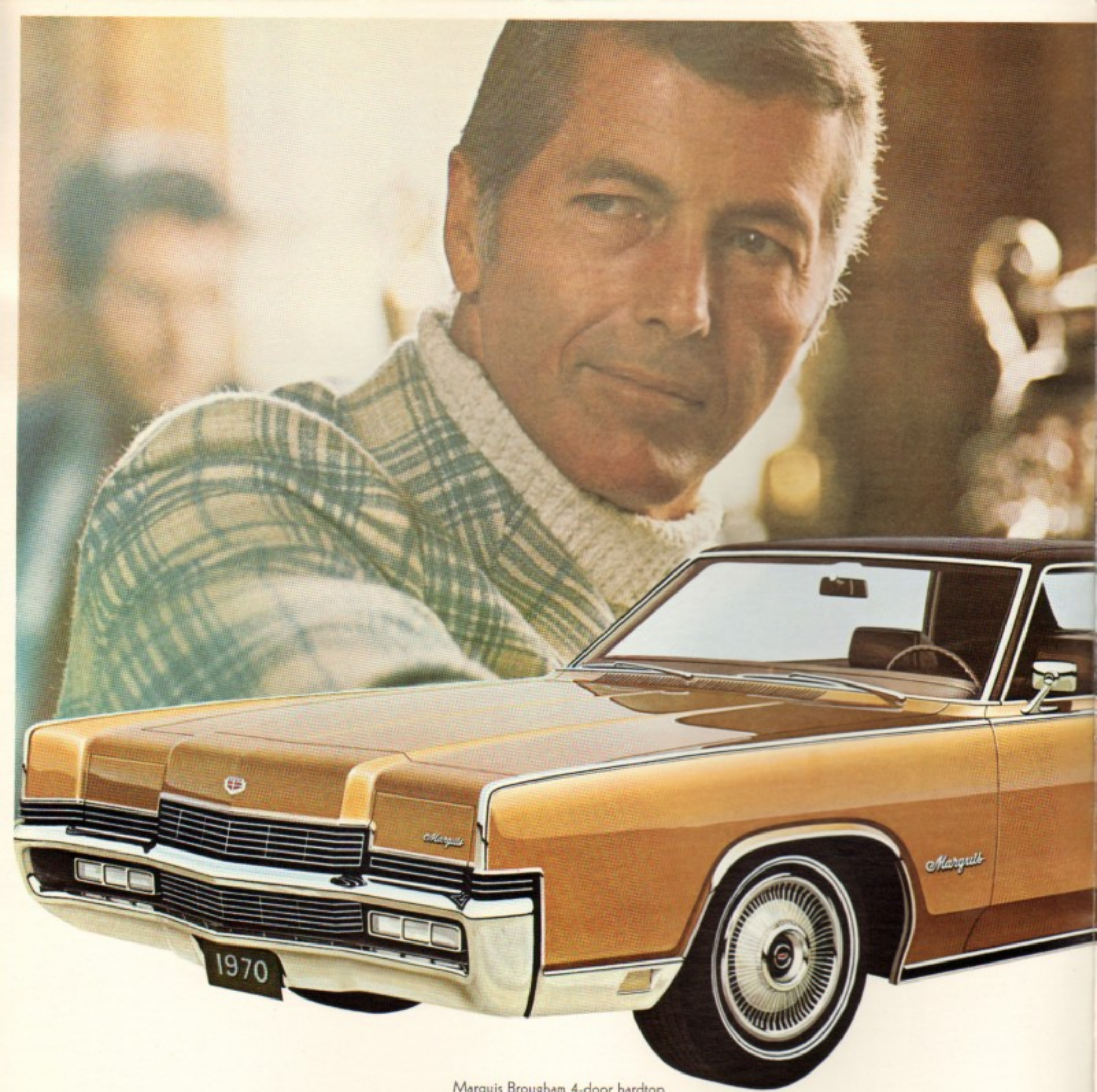
Marquis Brougham 4-door hardtop