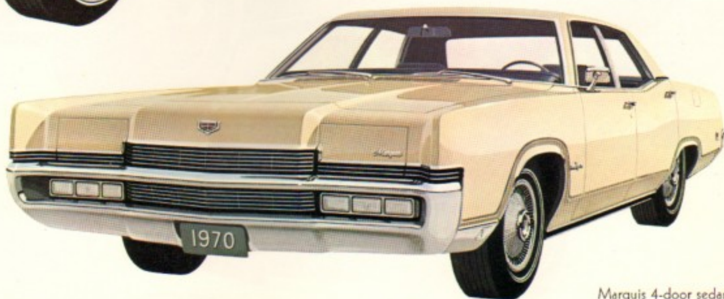
Marquis 4-door sedan

Marquis and Marquis Brougham have been widely acclaimed as the most beautiful medium-priced cars ever built by the makers of Lincoln Continental. A number of improvements make them even more desirable this year. The grille and taillamp areas have been refined for a more impressive appearance. A new anti-theft ignition switch locks the steering mechanism and transmission when the key is removed. Other innovations include a rim blow horn located in the steering wheel rim, new sound insulation for a quieter ride, new exterior paint colors and a new optional, electrically heated rear window defroster for hardtops and sedans. For added safety, side marker lights now flash on and off with the turn signals.