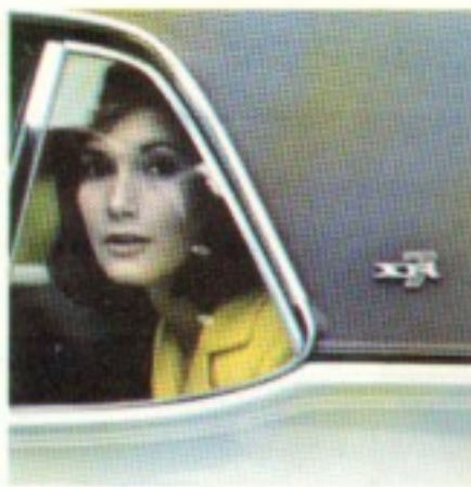
VINYL-COVERED OXFORD ROOF