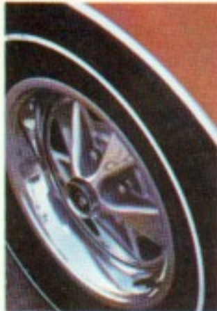
STYLED STEEL WHEELS