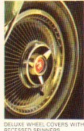
DELUXE WHEEL COVERS WITH RECESSED SPINNERS