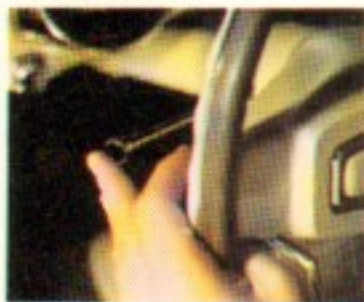
FINGERTIP SPEED CONTROL