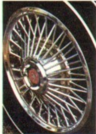
WIRE WHEEL COVERS