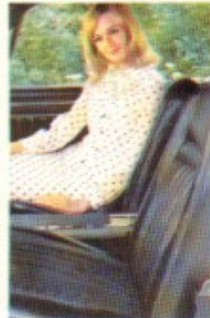
COMFORT-WEAVE VINYL BUCKET SEATS