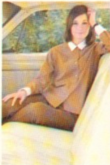
FULL-WIDTH FRONT SEAT—ROOM FOR THREE PASSENGERS