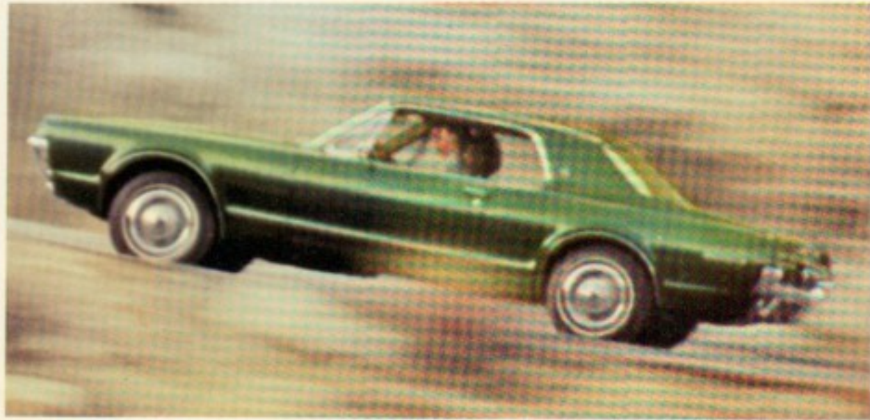
Spirited, sports car performance is very much a part of the Cougar personality with the Cougar 289 V-8 standard.