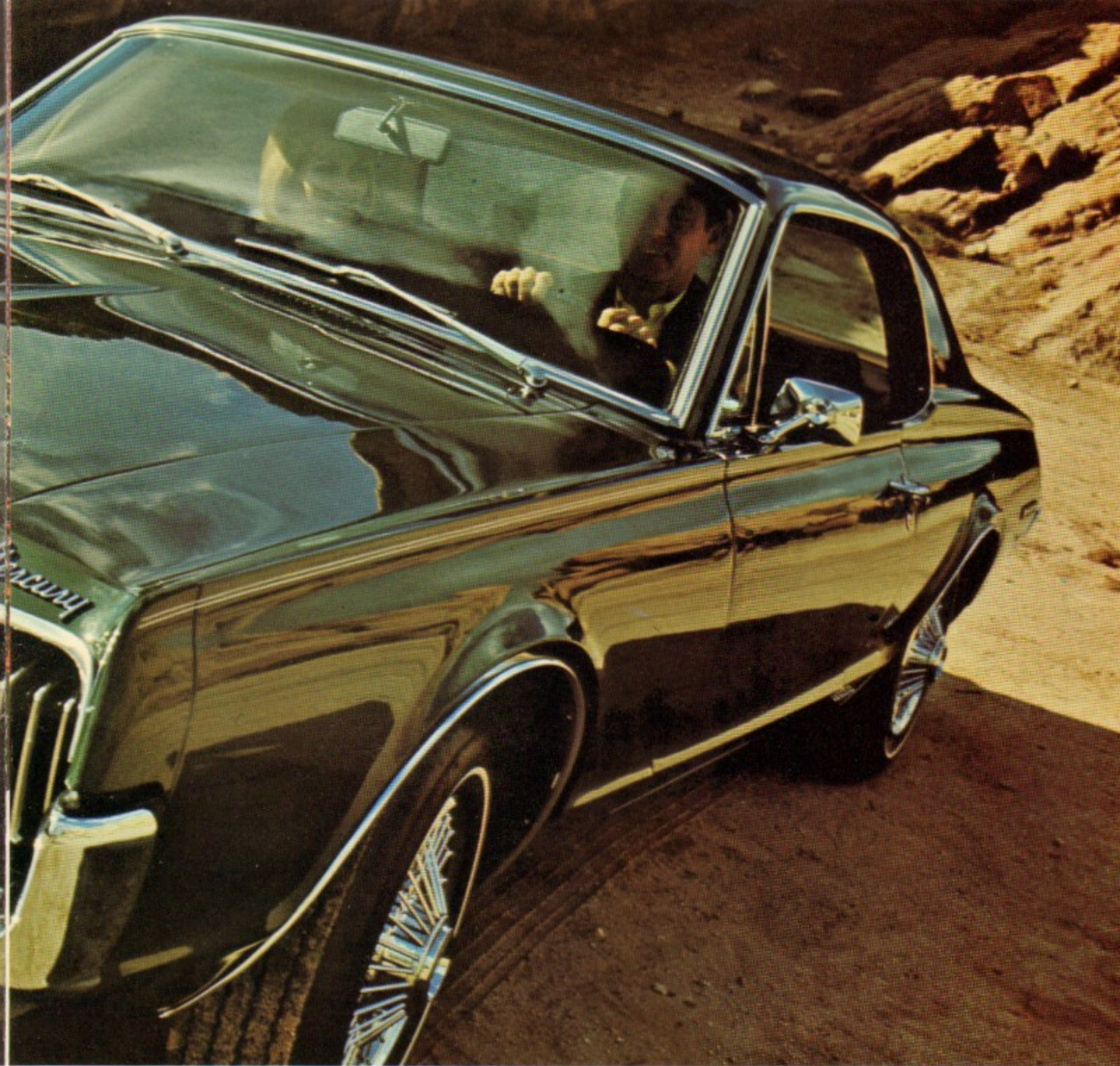
Concealed headlamps hide by day.