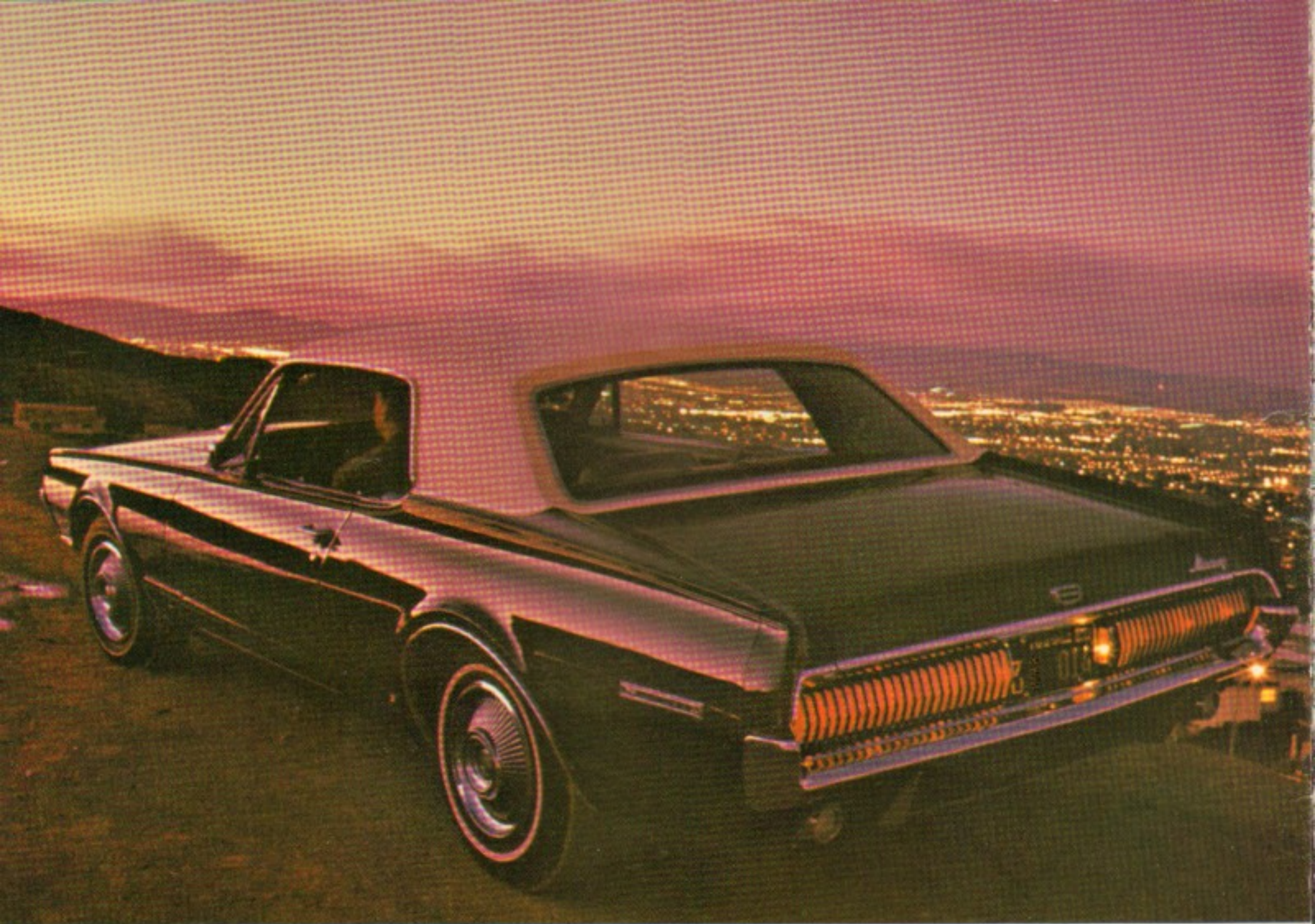
Cougar shown with optional vinyl-covered Oxford Roof.