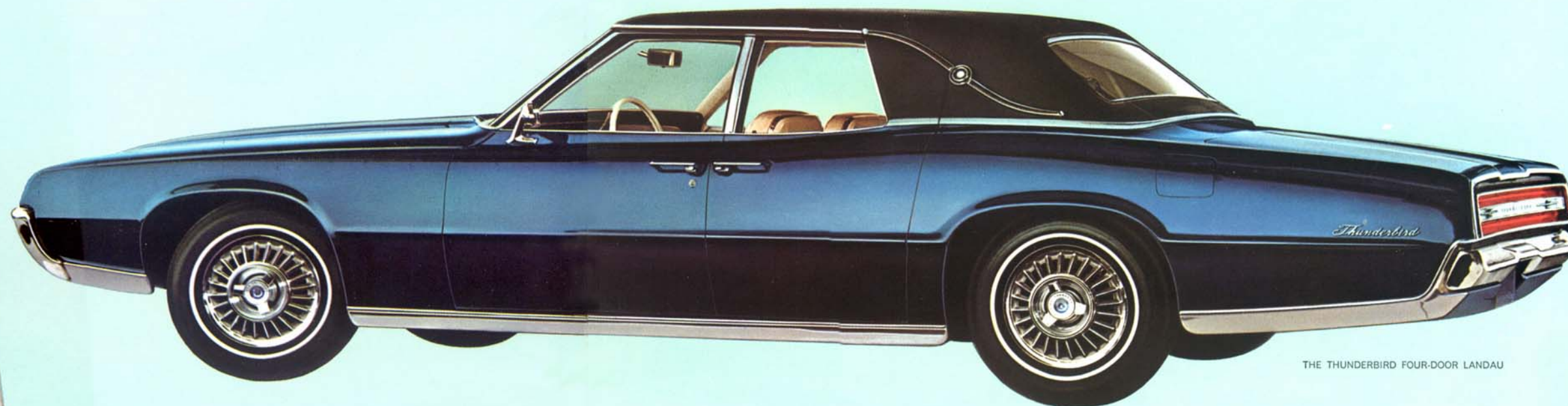
THE THUNDERBIRD FOUR-DOOR LANDAU

Now... A Long Smooth Rich Fast Four-Door Unmistakably, Uniquely Thunderbird