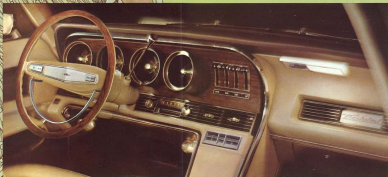
Ride refreshed! Thunderbird's Comfort-Stream Ventilation brings in a constant flow of fresh air through four controllable registers across the instrument panel (see above), and expels stale air through vents beneath the rear window. You relax in quiet, windows-closed comfort, surrounded by air continuously freshened from the outside.

The Thunderbird Touch... Luxurious Convenience at Your Fingertips