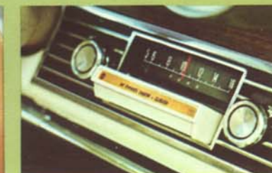
Stereo-Sonic Tape System...wrap-around sound from four speakers.