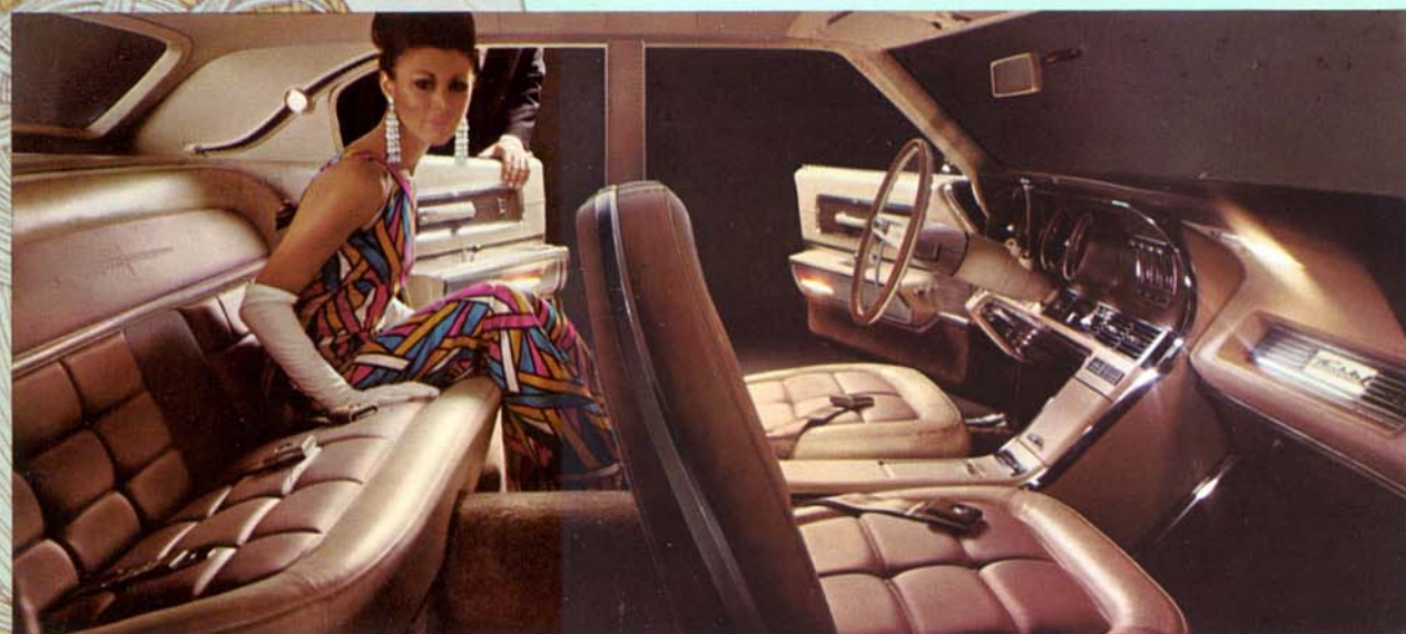
Thunderbird SL Interiors. Salon elegance! Front and rear compartments have distinctively tufted seats and embroidery on upper seat backs which enrich and highlight this tasteful interior. Optional on all models in cloth-and-vinyl, or in leather-and-vinyl, their handsome tailoring and invitingly soft seats say that this fineness is unmistakably, uniquely Thunderbird.