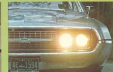
Latticework grille folds back, revealing Thunderbird's headlamps.