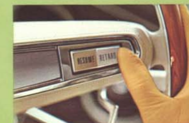
Highway Pilot Control. Cruising speed selector at your fingertips.