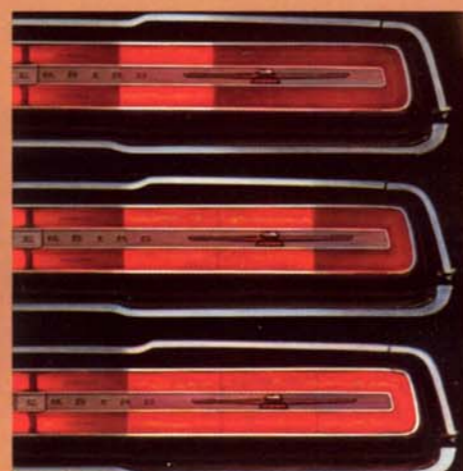
Sequential Turn Signals indicate turn direction in rippling flow of light.