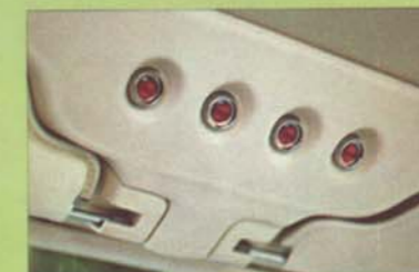
Convenience Control Panel—clears you for takeoff!

Many special luxuries, comforts and safety features make flight in the 1967 Thunderbird a royal adventure. The dual hydraulic brake system, one of Ford's many standard Lifeguard-Design Safety Features, has a dual master cylinder and separate lines to front and rear wheels. In the event one line is damaged, the other remains to provide partial braking, a red light warns driver that brakes need service. The optional overhead Convenience Control Panel has warning lights that remind you to fasten seat belts, when a door is ajar, when fuel is low, and when the emergency flasher system is operating. And the optional Stereo-Sonic Tape System with AM Radio surrounds you with the sound of your own favorite music from four speakers for concert hall realism. Set your highway cruising speed, if you wish (above 25 mph), with Thunderbird's optional Highway Pilot Control in the Tilt-Away Steering Wheel spokes. And the moment you flick the light switch in the classic Thunderbird cockpit, the headlights are revealed from behind the Bird's impressive new latticework grille. Thunderbird, the unique luxury car...that flies like the future.