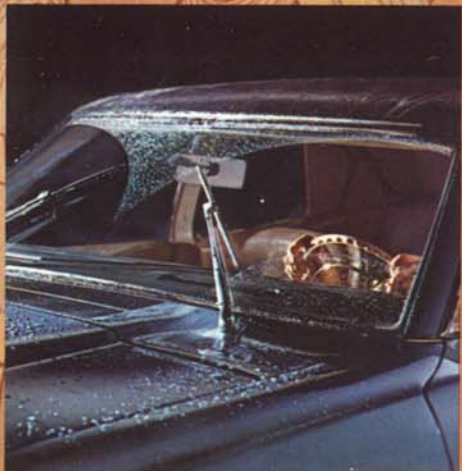
Full Sweep Windshield Wipers. Even in the rain you see more through Bird's windshield.

Thunderbird standard. There are unique conveniences: "rolling" door locks option which automatically locks all doors above 8 mph. Reversible keys are always right side up. A suspended accelerator adjusts itself to your foot. Sliding quarter windows and sequential turn signals. Make this Thunderbird yours . . . this car of now, and tomorrow!