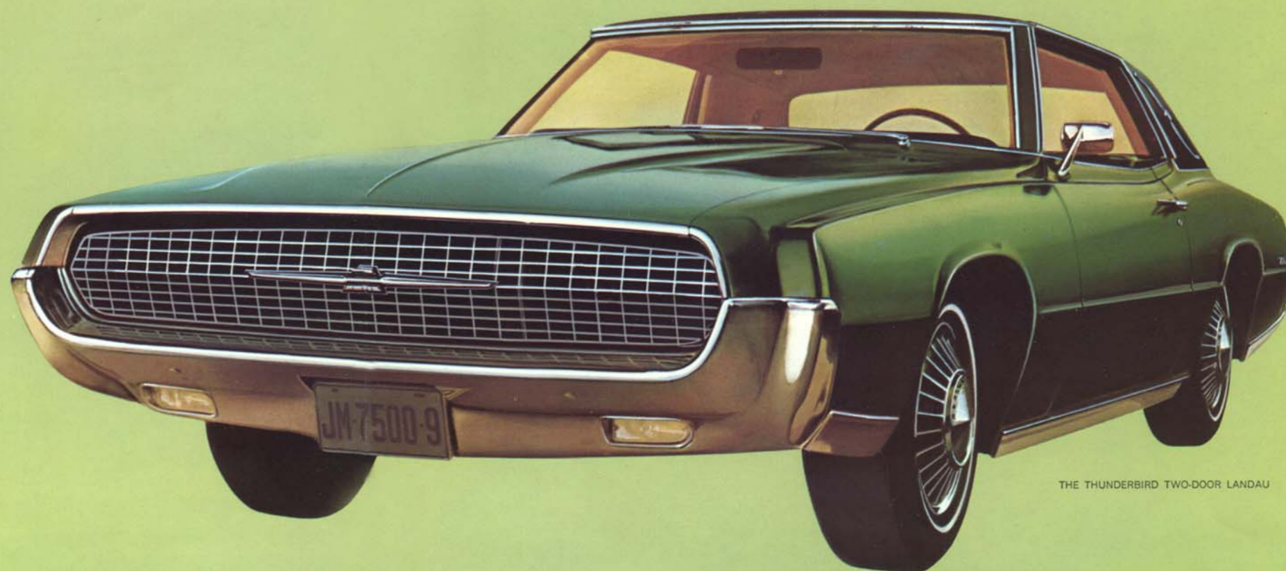
THE THUNDERBIRD TWO-DOOR LANDAU

The Thunderbird Touch... Luxurious Convenience at Your Fingertips