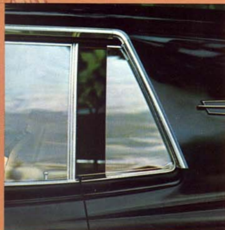
Sliding Quarter Windows on two-door models slide smoothly into roof pillar.